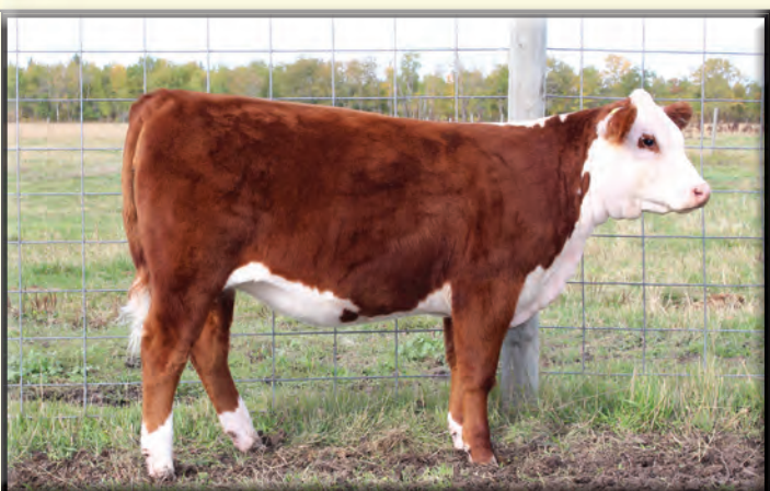
GRH R117 Caramel 15E

8E is a Factor son that really impresses you with his overall muscle shape. He may be the best Factor son produced to date. His Wonder mom is really big bodied and nice uddered. His low birth weight makes him an interesting herd bull prospect. 8E will be shown.