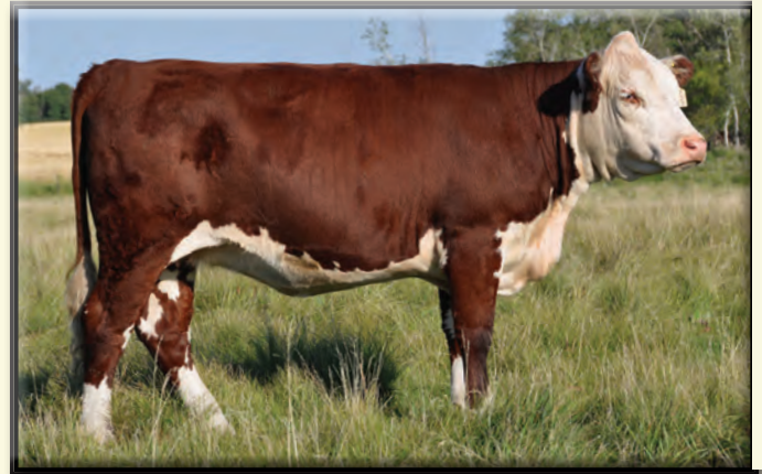
TWIN-VIEW 76Y Evie 21D

Exposed to Twin-View 39S Bentley 20C from May 1 to July 23, 2017. Preg checked safe.