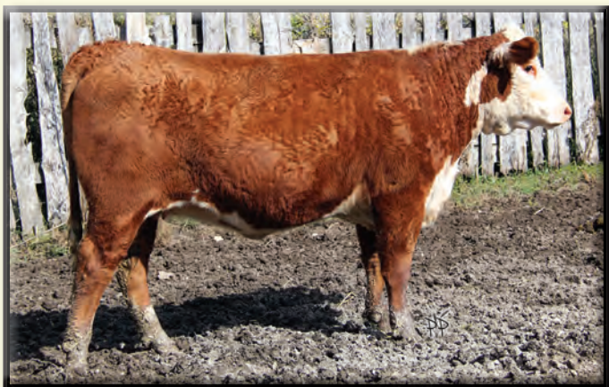
RAWCLIFFE 001A Amber 33D

Exposed to Rawcliffe 17Z Reward 75D from June 6 to August 30, 2017.