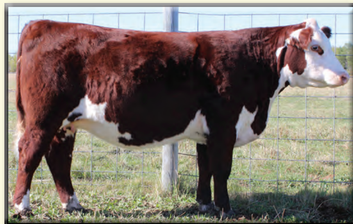
GRH 10X Dayel 19D

AI bred to Mohican THM Excede 2426 on April 21, 2017.