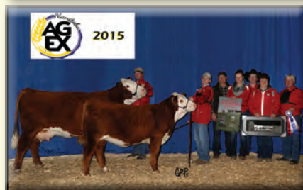
Dorbay Miss Azalea 408A

13E is a moderate framed big volume calf out of a super udder Zircon daughter. She was first in her class at the MHA Field Day.