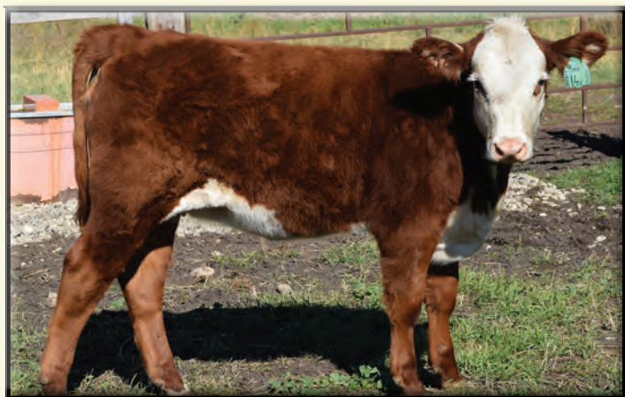
ALLENHURST Eclair 14E