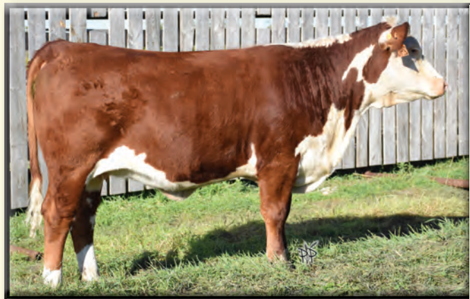
PBHR Becca 48B 24D

Exposed to DTHF Dalton 191D from June 2 to August 1, 2017.