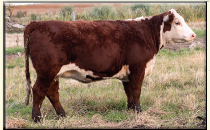
ROSELAWN Jaycee GC 8D

A nice, moderate framed Game Changer out of an Umpire daughter. With a pedigree like that she should be a good one. Exposed to NJW 137X 10Y Loaded 61D ET from May 20 to August 10. Observed bred May 20. Safe to observed date.