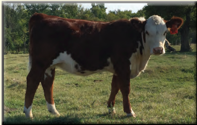
PBHR Shelby 9A 9E

Shelby is an interesting heifer. She is full of performance with great depth and length of body. She will make a great cow.