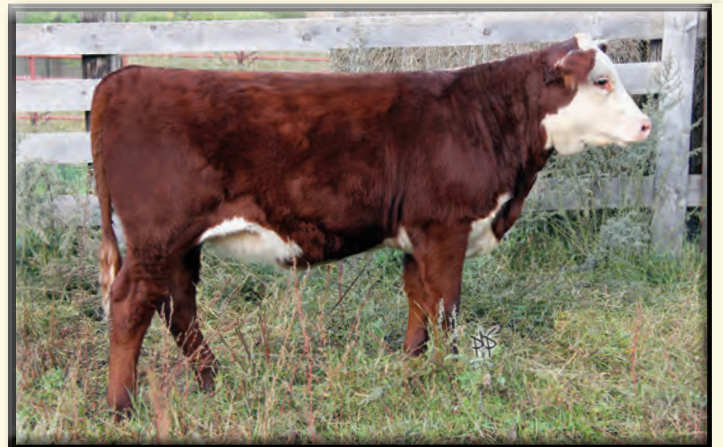
FLYER CATTLE Nina 9E

"A true sweetheart." 9E is a calf you don't mind looking at twice. She is a smooth, clean fronted, moderate birth weight calf that is fit to be a great cow down the line.