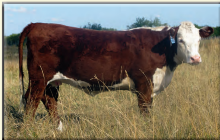
FBF 29B Danielle 58D

Exposed to GHC Capitalist 81D from April 29 to September 10, 2017. Safe to an early service.