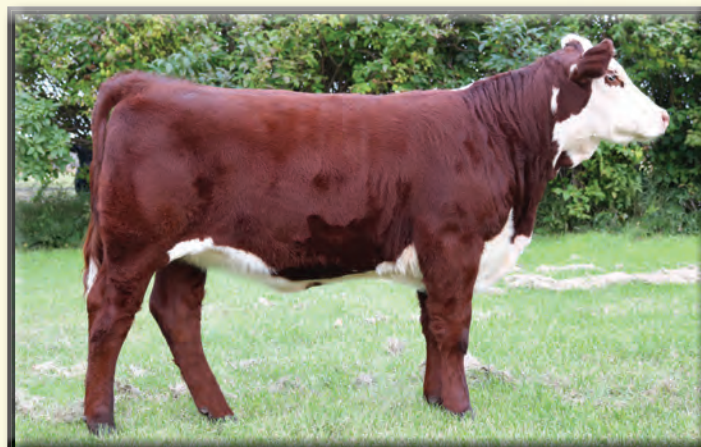
MAR 27C Candee 28E

28E is a fancy dark colored calf. This is the first calf crop from FBF 27C that we have had and all the calves are great. The dam is one of our great uddered females. 27C is jointly owned with Rawcliffe Grange Stock Farm.