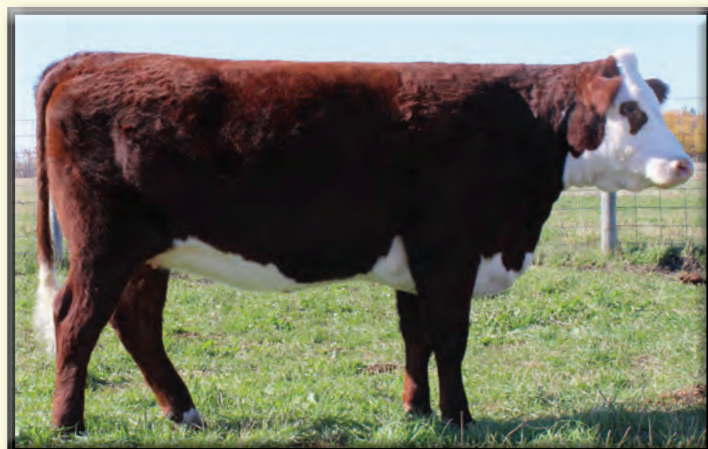
GRH 10X Ursula 15D

AI bred to Mohican THM Excede 2426 on April 21, 2017.