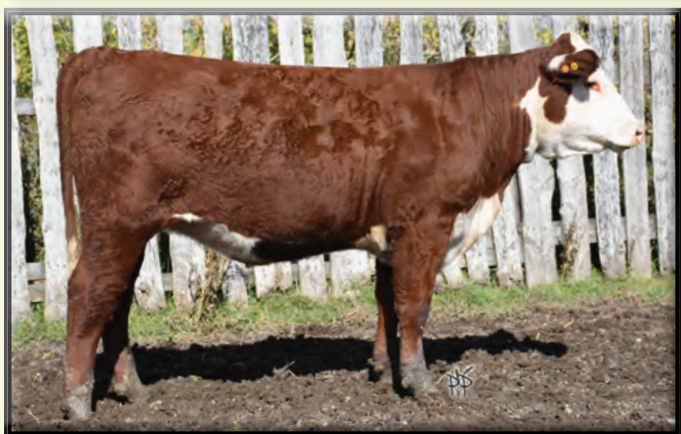
RAWCLIFFE 29B Dream Girl 160D

We had a hard time parting with this beauty. She should make a great cow and might make a good project for a junior. Her mom never misses.