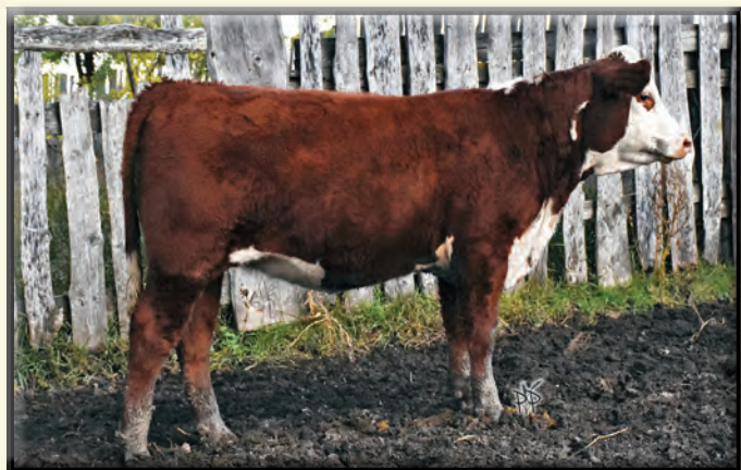
RAWCLIFFE 4C Ella 220E