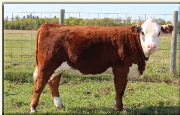
GRH DK 10X Accent 20E

This direct daughter of Rib Eye has that look! Big middled and soft made, she is red eyed with that show ring look. This cow family is one of our strongest. 15E will be shown this fall.