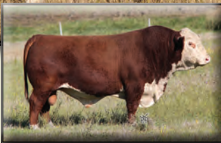
HAROLDSONS DENSITY T100 34A