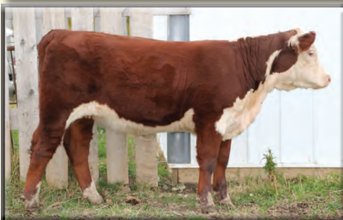
HILLTOP Emily 21B 4E

A neat little heifer calf off a first calf heifer who has abundant milk flow and is very broody looking. 4E should turn into a good cow; she is cherry red to boot!