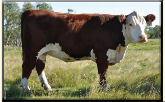
TWIN-VIEW 76Y Maribelle 143D

Exposed to GHC-Taboo Cadillac 48C from May 1 to July 23, 2017. Preg checked safe.