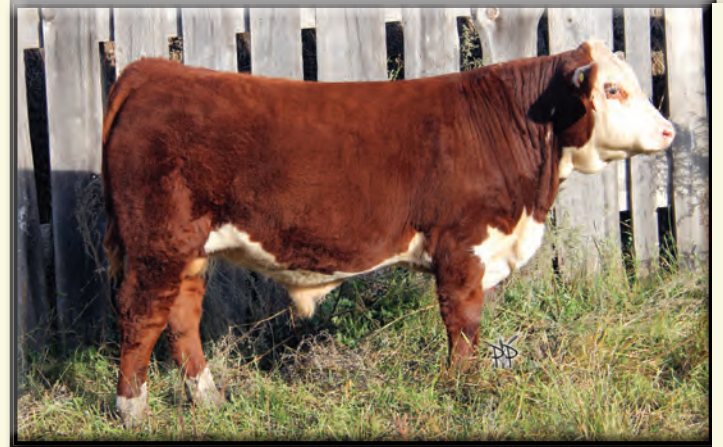
FLYER-CATTLE Lambeau 5E

"Herd Bull Prospect." 5E is a combination of everything we like to see; pigmented, low birth weight, deep ribbed and sound footed. Out of a first calf heifer we purchased from ANL, she's done her job here."