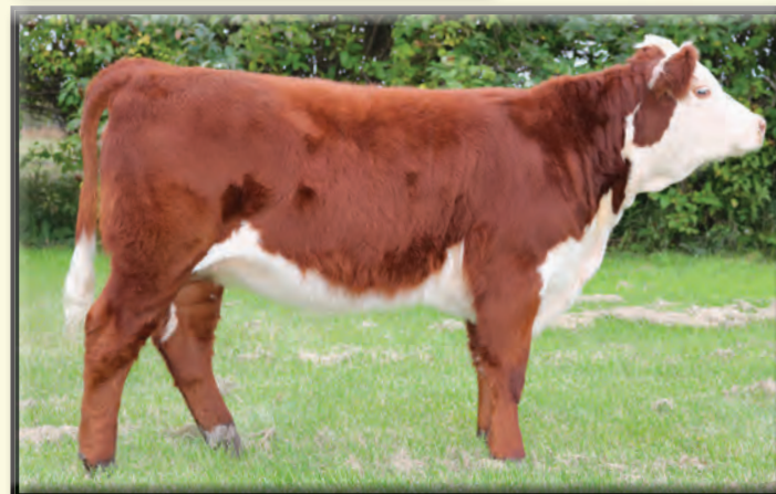
MAR 68U Starlet 13E