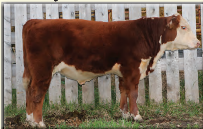
HILLTOP Excaliber 8A 6E

Just a middle of March bull calf off a first calf heifer that is a powerfully constructed cow. He has excelled all summer on pasture. this bull has a great disposition.