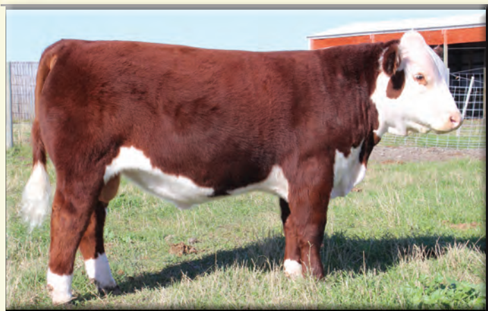
GRH 10X Westshore 8E