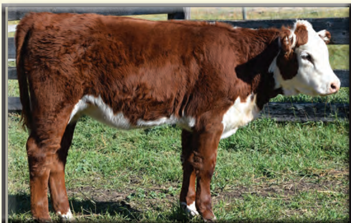
ALLENHURST Easter 15E

Eclair 14E is a deep ribbed, short marked gal wearing just the right amount of eye makeup. Her dam, a fault-free cow, has given us a heifer every year and they keep getting better!