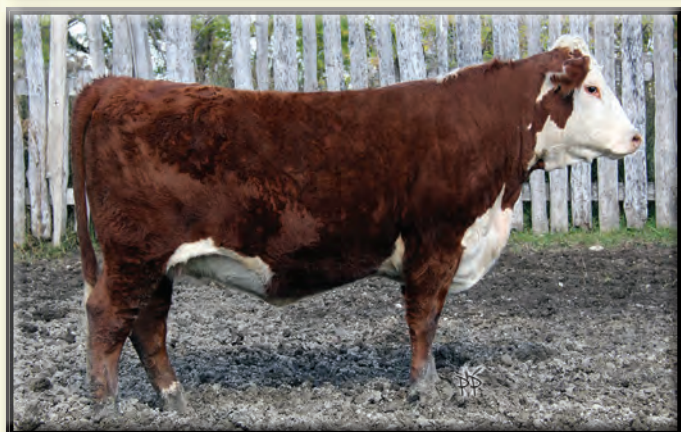
RAWCLIFFE 17Z Belle 60D

Exposed to Rawcliffe 17Z Reward 75D from June 6 to August 30, 2017.