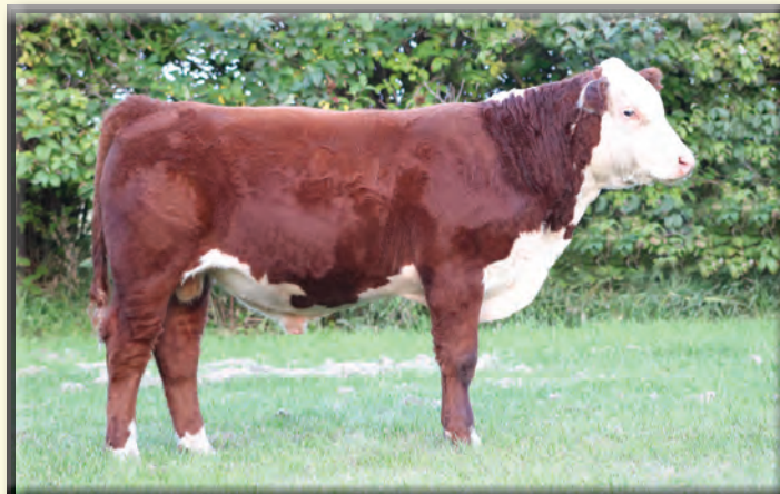
MAR W18 Embridge ET 1E

This is the first time that we have ever sold a bull calf at the Good as Gold Sale. We knew it would have to be a great one, and 1E is all that. Not only is his sire a great one but the dam 408A is right up there also. She is a super uddered female, that was Grand Champion at Ag Ex with her first calf 408C at side in 2015, then 408C was Grand Champion Female at Ag Ex last year. Look at this guy's numbers. Terms to be announced sale day.