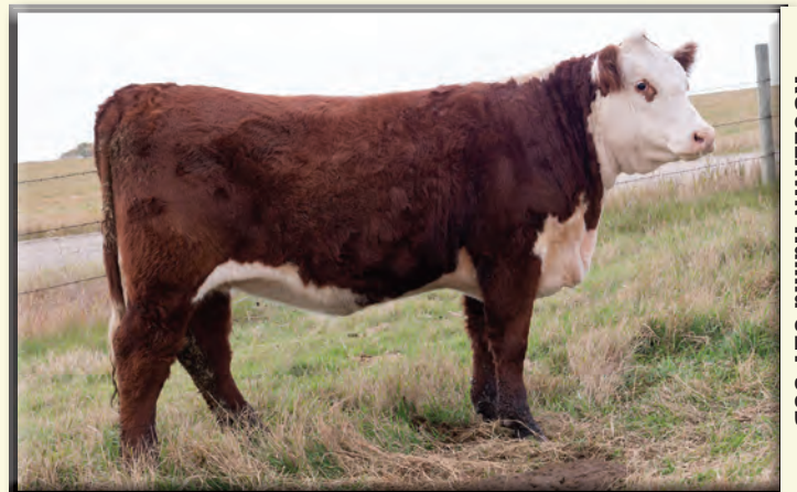
ROSELAWN Hanna 62Y 95D

A heifer that is red to the ground and goggled eyed. Lots of depth of body to this one. Her mating to our new junior herd sire Loaded 61D, our pick at the NJW bull sale this year, should be an interesting combination. Exposed to NJW 137X 10Y Loaded 61D ET from May 20 to August 10. Preg. Checked safe.