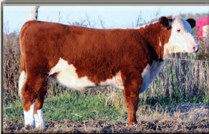
RUABHF 104Y Bobbi 760E

This heifer is long bodied and has good thickness as well as good neck extension. She is sired by our Grand-daughters bull, CRLY 45S Yahoo 104Y who was champion bred and owned at Bonanza in Brandon. She will have longevity here as we still have her Grand-Mother in our herd today. Another good 4-H prospect.