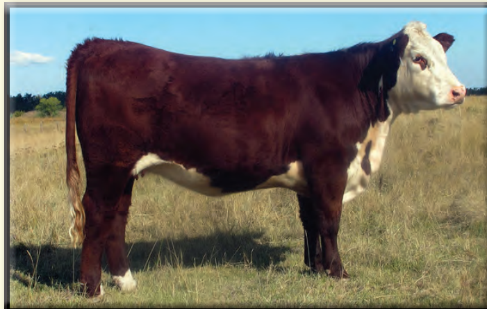
FBF 719T Zabrina 15D

Zabrina is a deep ribbed, clean fronted, power cow in the making. She is also dark red, red necked and fully pigmented. Her dam, 12B is raising a big stout bull calf. Exposed to GHC Capitalist 81D from April 29 to September 10, 2017. Observed bred May 19.