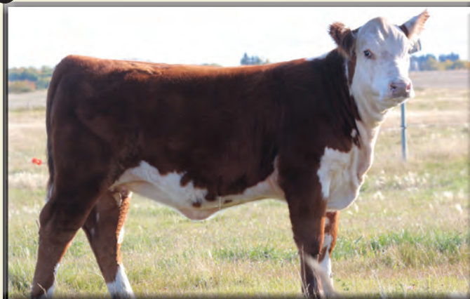
ABHF 124Y Jubilee 754E

The gal is a smooth fronted female with lots of spring of rib. She has a wide top and good legs and feet. This heifer would make a good 4-H prospect and would fit into anyone's herd.