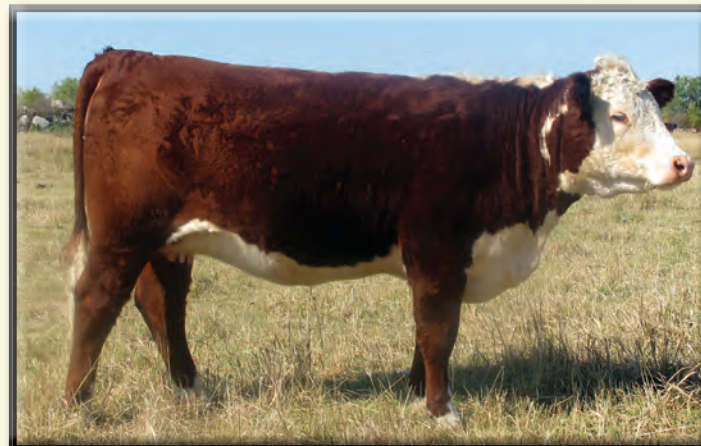
FBF 66X Patricia 86D

Exposed to ANL C 420A Mountaineer 45 134C from April 29 to September 10, 2017. Observed bred May 12.