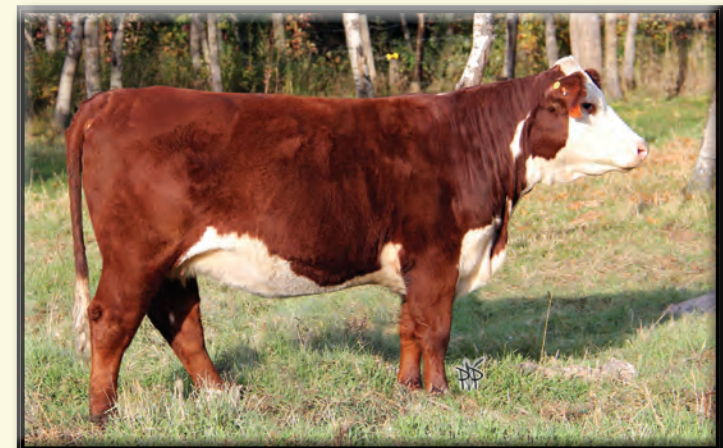
FLYER CATTLE Brandi 10D

10D is a dark pigmented, Top Notch 401Y daughter. She goes back to one of our top cows on the farm. Her mother raises one of our top calves each year. AI bred to TH 22R 16S Lambeau 17Y on May 12, 2017. Pasture exposed to FB Crunch 80C from May 19 to June 30, 2017.