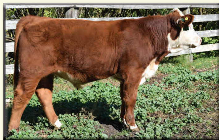
ALLENHURST Enzo 6E

Enzo 6E has a pedigree backed by Lego and Victor 719T. His dam, a first calver has a flawless udder. This bull calf exhibits impressive growth from a moderate framed cow.