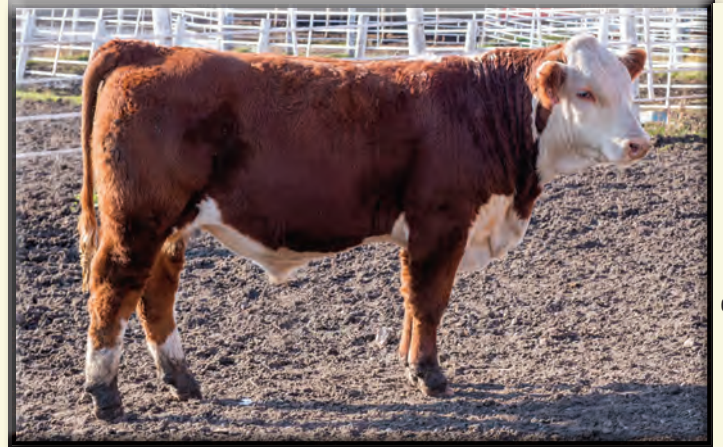
ROSELAWN Game Changer ET 19E

Here we have a powerful Game Changer bull calf with the length, depth, and natural thickness to add a lot of performance to your calf crop. His mother is a deep bodied eye catching cow with a great udder and awesome milk flow. This is a calf that could take you to the next level