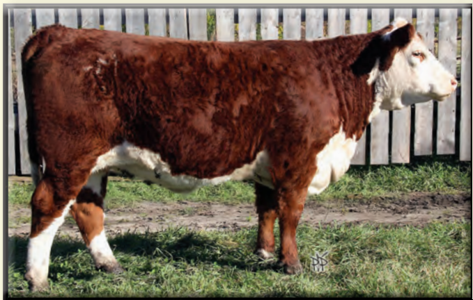
PBHR Primrose 19B 17D