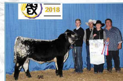
INC Six Gun 428F - Champion Supreme Bull Ag Ex 2018