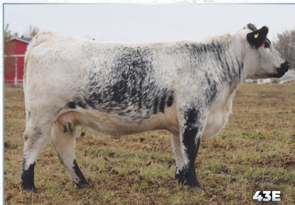
Codiak Geaza GNK 105D