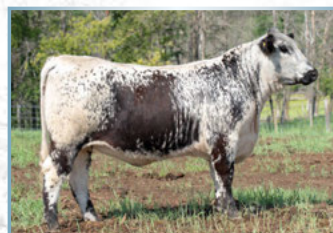
INC Northern Legend 67F