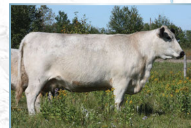
JSF Kali 10Z - Dam