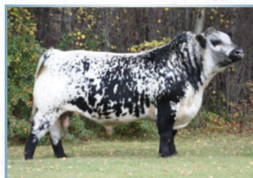
JSF Wall Street 36E - Sire