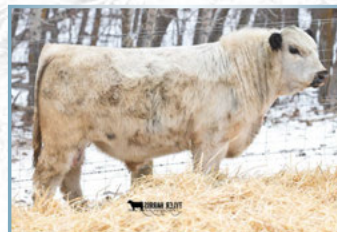
INC Breaking News 63F