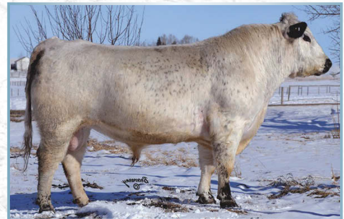
A & W 15R