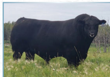
JSF Unmarked 2D - Sire