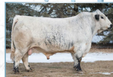
Colgan's Baxter 1B

Matters Fancy NRG 17A lives up to her name. She is one of prettiest cows in the INC herd, has a perfect udder with tremendous milk production and it would be almost impossible to find a better mother. Her calves consistently wean in the top five per cent. Paired with powerhouse, Colgan's Baxter 1B, these embryos offer the buyer another new opportunity at outcross genetics. Guaranteed one (1) pregnancy if implanted by a certified technician. Consigned by INC Cattle Company