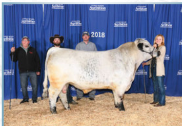
MX El Guapo 103E