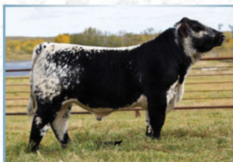
INC Six Gun 428F