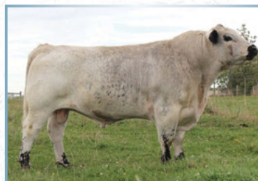
Moovin Zpotz Dart 37D - Sire