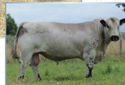
SPKNZ Extreme E27 - Grand Sire