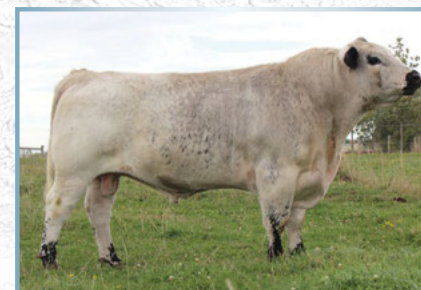
Moovin Zpotz Dart 37D

5X is the cow who gets her job done and looks great while doing it. Beautiful balanced udder, tremendous length of spine, great feet and legs and style to spare. Myostatin non carrier, homo polled, homo black