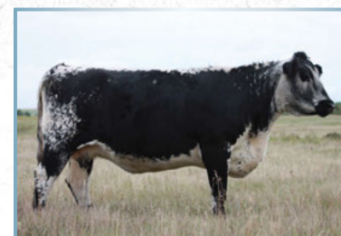
Dam of 61F