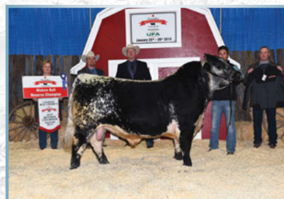
Codiak Geaza GNK 105D