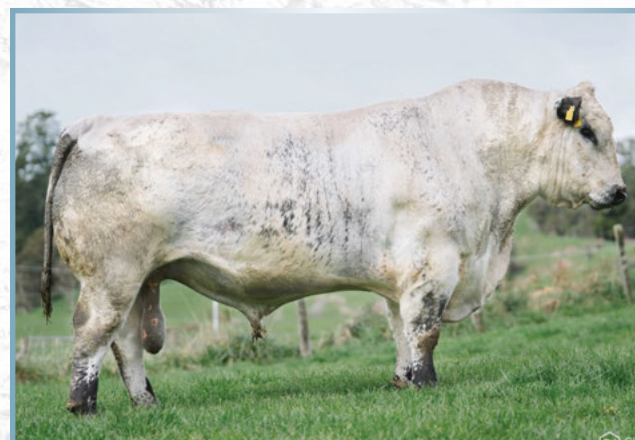
Premier 101Y Logic L11