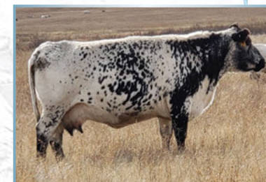
Grandmother to 13G