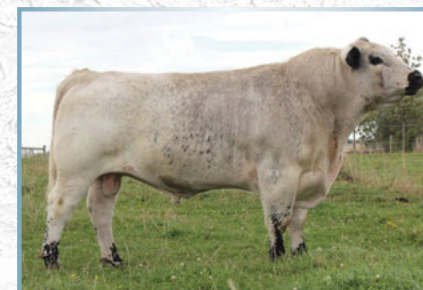
Moovin Zpotz Dart 37D