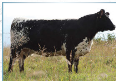
Ponderosa Spots A Roarin 19Y - Grand Dam

Ultrasound Data at 14 months old: Rump Fat: 0.28 Rib Fat: 0.27 Ribeye: 10.3 IMF: 4.21 Midnight Lady packs everything you'd want in a female; style, femininity, thickness, structure and just that overall "wow" factor. She comes from a long, long lineup of maternal greatness. There would be no more than 10 females here at JSF that go back to her grandmother. Her sire, Trade Secret, is in there as one of the most consistent breeding bulls out there worldwide. This is a female that doesn't come along everyday. She will be halter broke and show ready to conquer the show ring in her future. Pasture exposed to Wolf Lake Bob 24E from May 3 to May 28, then pasture exposed