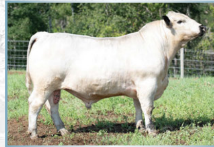
Andchris Boomerang 7F