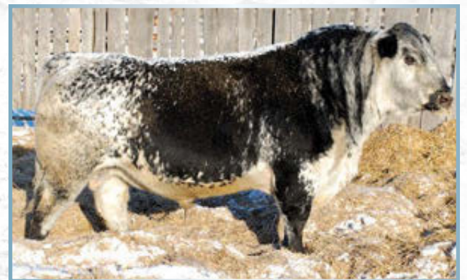
P.A.R. Moo Fassa 03M