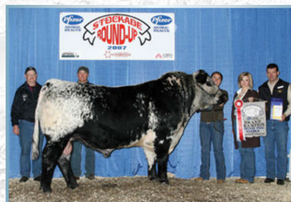
Notta Romeo 64R