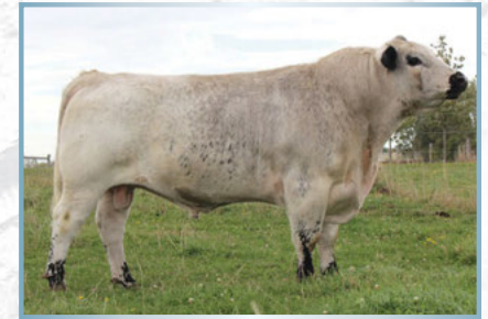
Moovin Zpotz Dart 37D

As we build our program here at KFC Farms, you will see us pull our top producing cows to enter our flush program. We will sell half of what is produced and implant the other half to build our herd. Using this philosophy, you can be assured we believe in what these cows can produce! Snowy River 7W is the dam of our top heifer calf that sold in the National Speckle Sale at Agribition this fall. 7W is big barreled, long spined and has great feet and legs to carry her mass with ease.