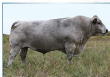
JSF Trade Secret 11A - Sire of 46F, 61F, 62F

Sasha is another outstanding Trade Secret daughter. Her mother is just another great producing, Untapped female. They are "no miss" females and Sasha will be no different. Trade Secret on the top and Untapped on the bottom side. She is an easy fleshing, free moving beauty that will be sure to please. She will be halter broke. Pasture exposed to Wolf Lake Bob 24E from May 3 to May 28, then pasture exposed to JSF Net Worth 63F from June 7 to August 1, 2019. Preg checked on October 21 - 160 days to Wolf Lake Bob 24E. Due to calve end of February 2020. Consigned by Johner Stock Farm