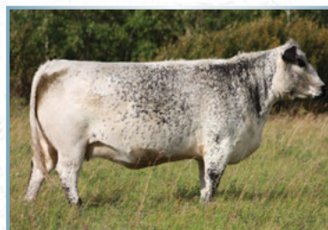
Dam of 62F

Polled: PP Coat Colour: E D / E P Myostatin: Non-Carrier Leptin: TT PMCH: AT IGF2: CT CRH: CG