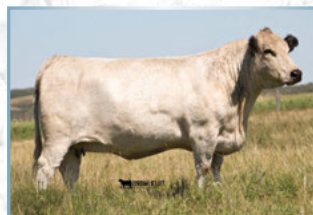
Upto Specs Willa 17W