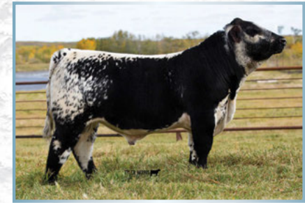
INC Six Gun 428F