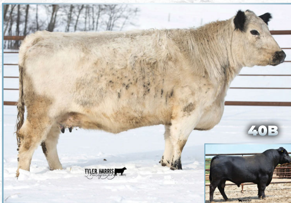
Spots 'N Sprouts Dusty 124D