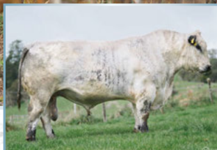
Premier 101Y Logic L11