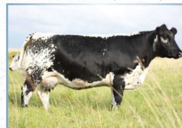
JSF Midnight Lady 2C - Dam

to JSF Net Worth 63F from June 7 to August 1, 2019. Preg checked on October 21 - 160 days to Wolf Lake Bob 24E. Due to calve end of February 2020. Consigned by Johner Stock Farm