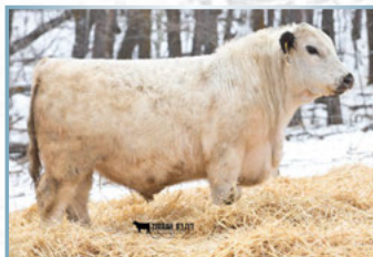
INC Revolver 3F

In recent years, there is no pairing that has made a greater impact on the Speckle Park breed. The combination of CAJA Zeppelin 1B and Upto Specs Willa 17W, which has produced the likes of Grand Champion Bull, INC Six Gun 428F, INC 63F Breaking News who had a scrotal measurement of 37 cm. at 11 months of age and who only a short time ago was sold to a breeder in Australia and INC Revolver 3F featured in the inaugural Leading Edge Sale. Guaranteed two (2) pregnancies if implanted by a certified technician. Consigned by INC Cattle Company