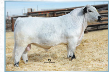
Spots 'N Sprouts Stands Alone - Sire of Parkvale Mark