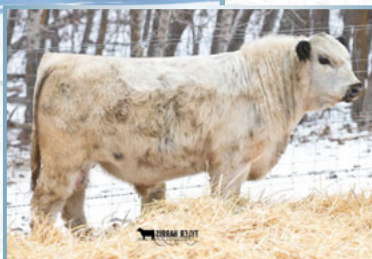
INC Breaking News 63F