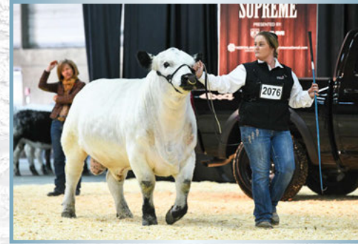
Andchris Boomerang 7F