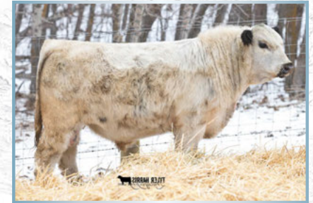
INC Breaking News 63F