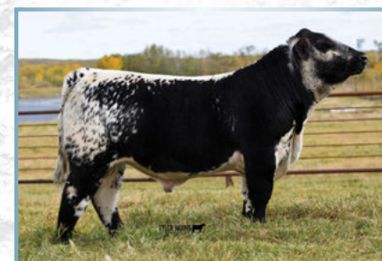
INC Six Gun 428F