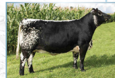
Maternal Sister to 62F