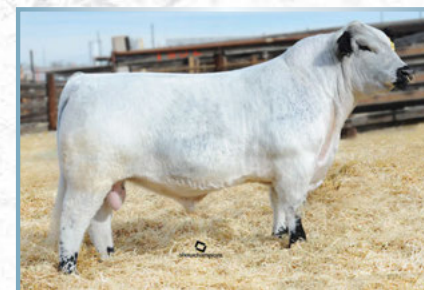
Spots 'N Sprouts Stands Alone - Sire of Parkvale Mark