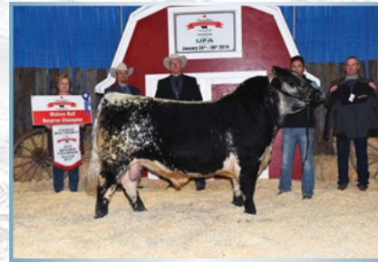
Codiak Geaza GNK 105D