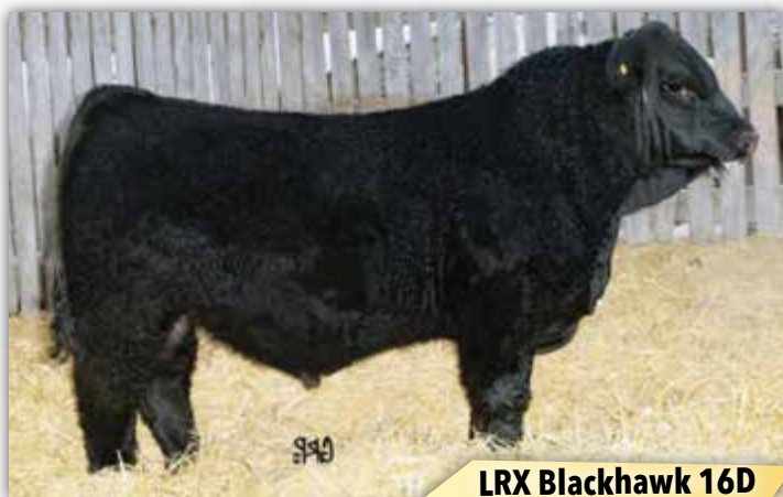
LRX Blackhawk 16D

Pasture exposed to SCC Innovation 5F from April 30 to June 2 and then exposed to 20/20 1 Iron 30F from June 2 to July 9, 2020. Observed bred May 7, 2020. Preg checked October 2, 2020. 4.5 months, expected due date February.