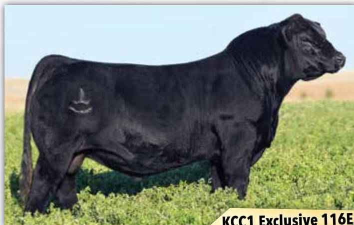
KCC1 Exclusive 116E

The embryos are stored at DRI, Crossfield, Alberta and are exportable worldwide. All transfer and shipping costs shall be borne by the purchaser.