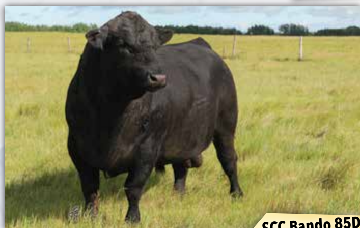
SCC Bando 85D