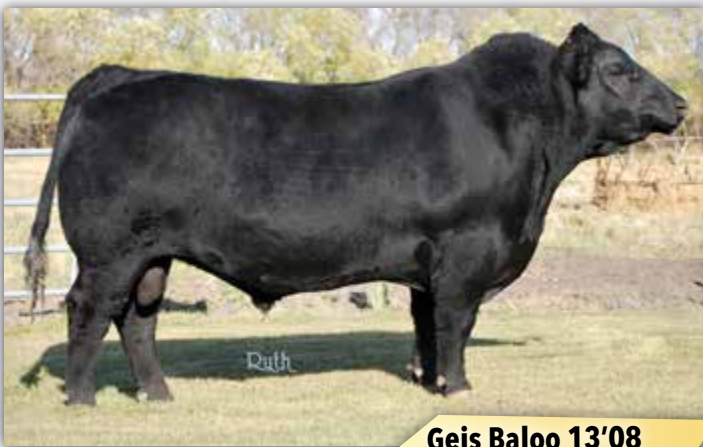
Geis Baloo 13'08