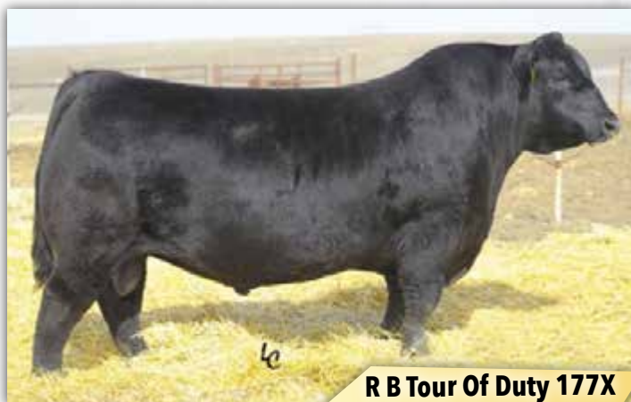
R B Tour Of Duty 177X