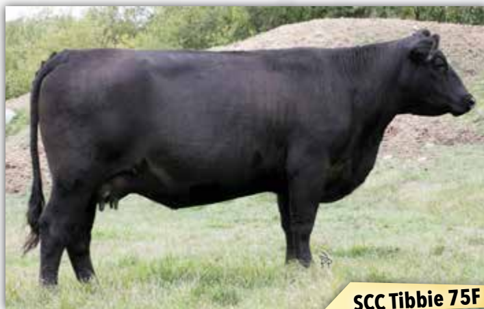
SCC Tibbie 75F