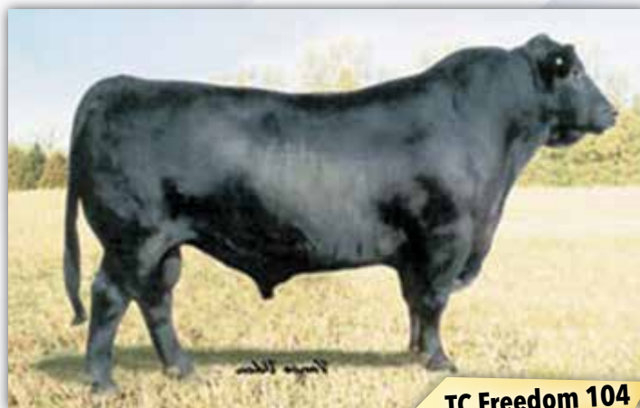
TC Freedom 104

The embryos are stored at DRI, Crossfield, Alberta and are exportable worldwide. All transfer and shipping costs shall be borne by the purchaser.