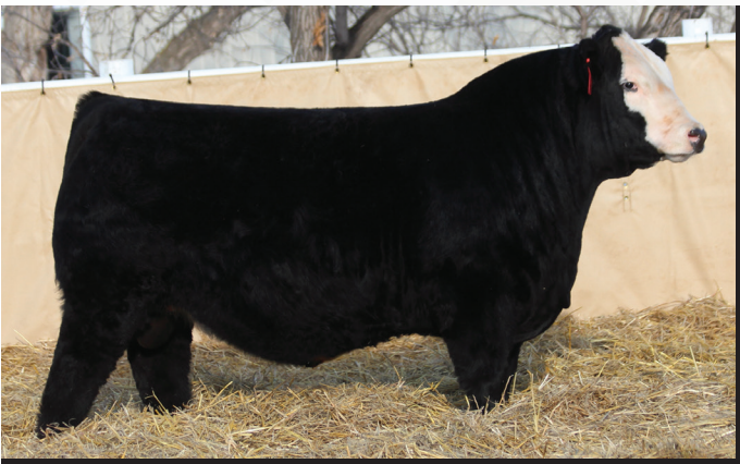
Wheatland Man O' War 907G