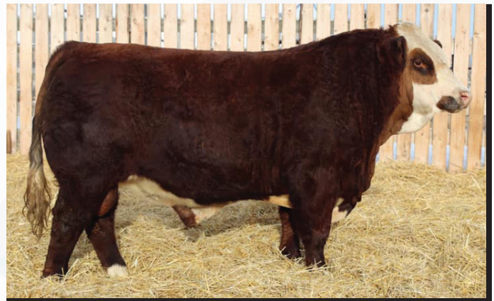
NAC Battle Cry 4F