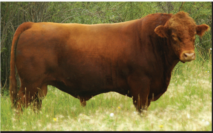
KWA Red Rock 5T