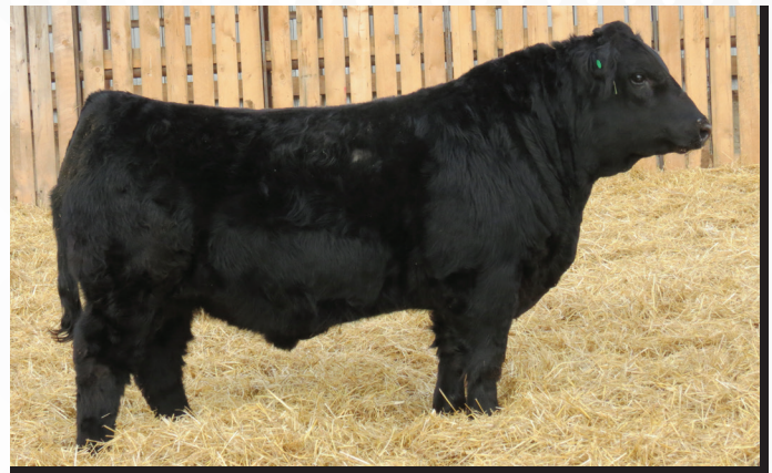
R Plus 5015C