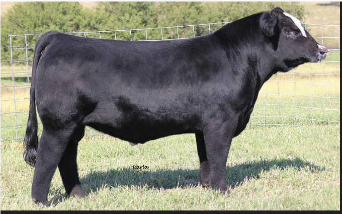
MR CCF Vision