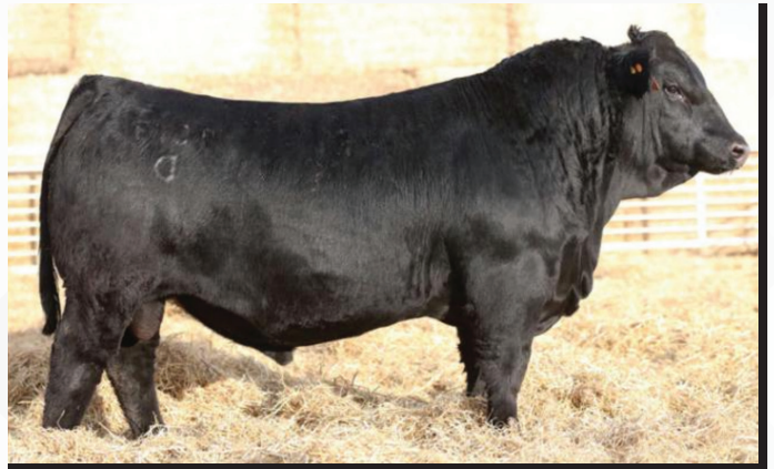
LFE Night Hawk 3013D