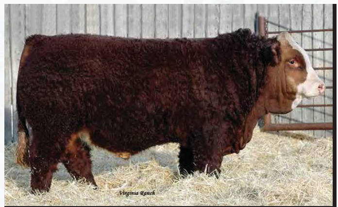
Virginia Spartan 530E