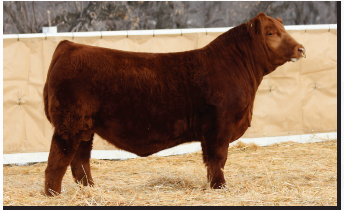
Wheatland Affinity 8196F