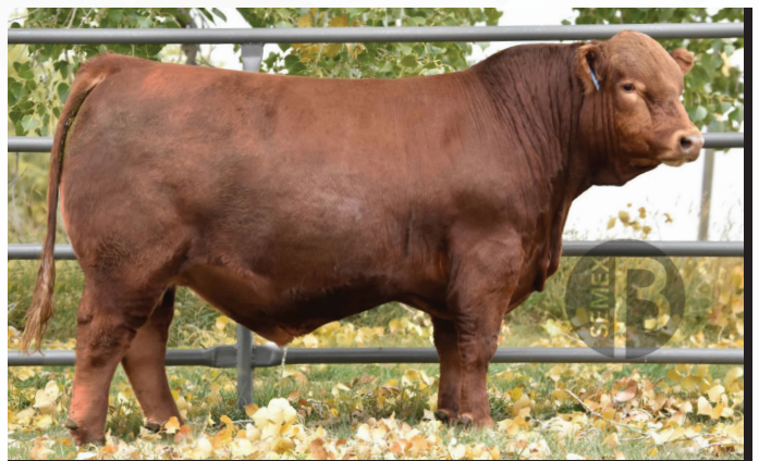
WS Epic E152