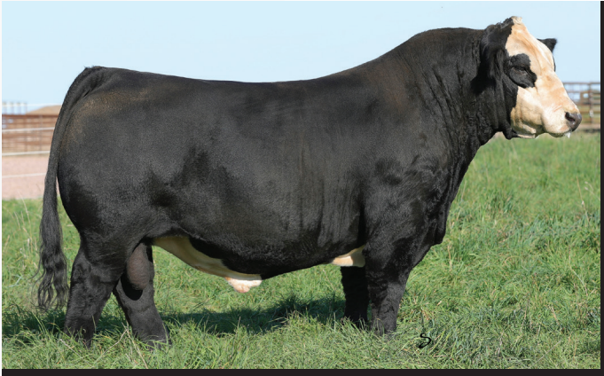
W/C Bankroll 811D