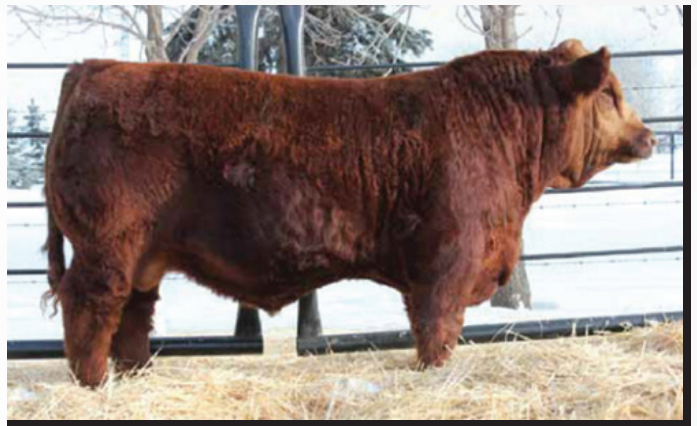
KWA FLYF Red Mountain 16Z