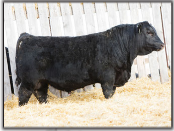
JL Rainmaker 0112, a son of SANE UPG Barbie 112A was selected by CMT Farms, Meota, Saskatchewan