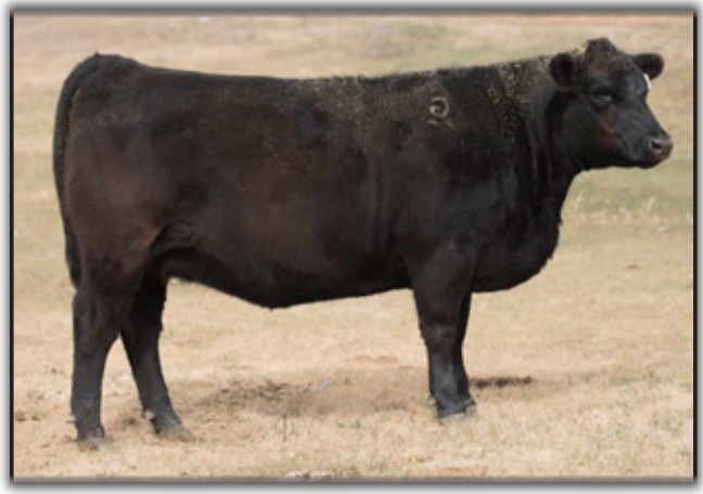
GGA Blackbird 15D by JL Upward 4058 was selected by Blairs.Ag Cattle Co., Lanigan, Saskatchewan

A.I. bred to S A V Renown 3439 on April 17, 2021, then exposed to DMM International 54D from April 27 to August 17, 2021 – Favorable to the A.I. date