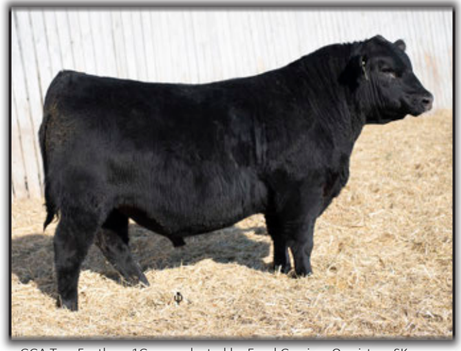
GGA Two Feathers 1G was selected by Excel Grazing, Ormiston, SK

She ranks in the top 15% of the breed for weaning and yearling weight and the top 25% for milk