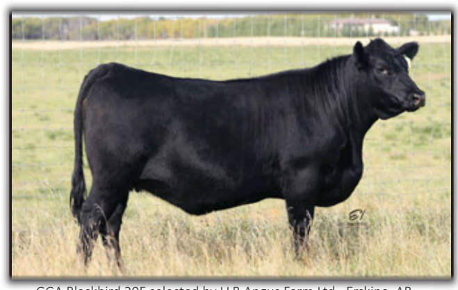
GGA Blackbird 20F selected by LLB Angus Farm Ltd., Erskine, AB

He ranks in the top 6% of the breed for rib-eye, the top 7% for maternal calving ease, the top 10% for calving ease and birth weight