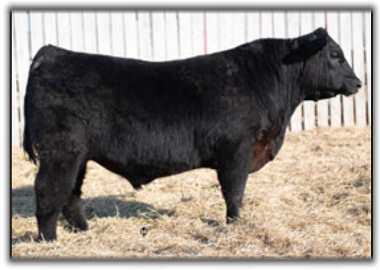
GGA Two Guns 4G selected by Bar Heart Ranch, Irma, AB

He ranks in the top 15% of the breed for weaning weight, the top 20% for yearling weight and the top 25% for milk