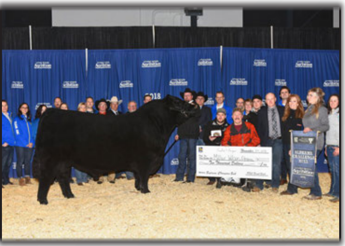
DMM International 54D - 2016 & 2018 Supreme Champion