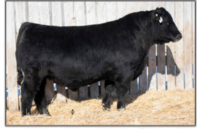
GGA Raven 8H by S A V Resource 1441, was selected by Schropp Farm, Bengough, Saskatchewan

He ranks in the top 15% of the breed for calving ease, the top 20% for weaning weight and the top 25% for yearling weight