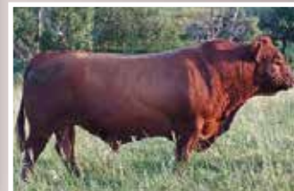
Sir King 81S :: Maternal Sire