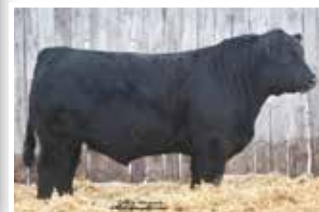
GJP 372B :: Maternal Sib