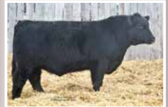
GJP 308C :: Maternal Sib