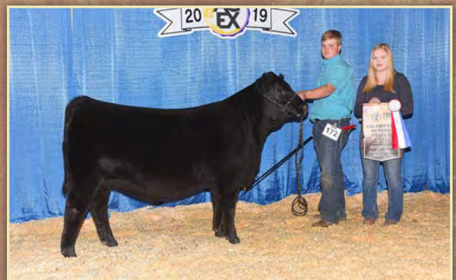
Champion Senior Heifer Calf at Manitoba Ag Ex