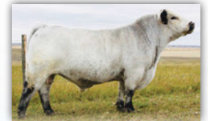
D.A.M. Dots 94A Electric 31E - Sire