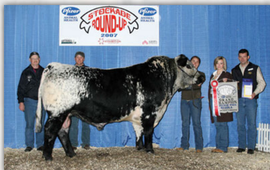
Notta Romeo 64R