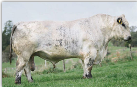
Premier 101Y Logic L11