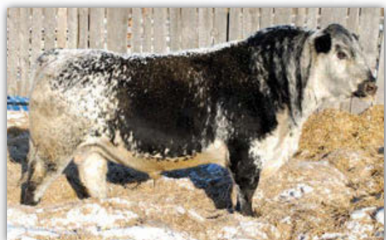
P.A.R. Moo Fassa 03M