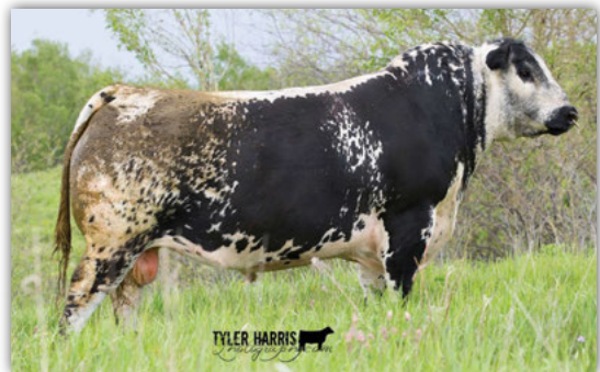
CAJA Zeppelin 1B