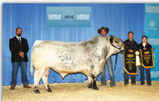
River Hill 60W Line Drive 54Z