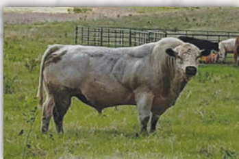
JSF Blindside 25C - Sire