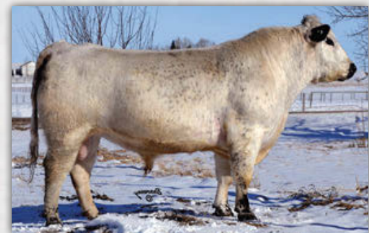
A & W 15R