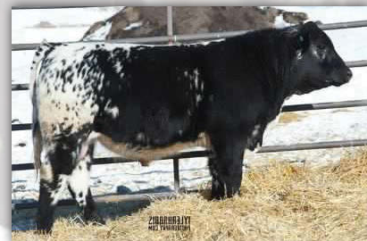
Moovin Zpotz Avenger 28A - Sire of Embryos