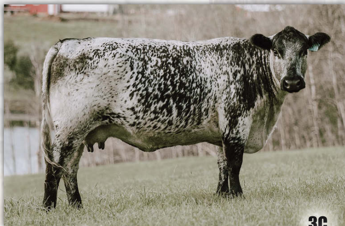
Pine Valley Elsa 3C Dam to INC 66G & INC 23G

Polled: PP Coat Colour: E P /E P Myostatin: Non-Carrier