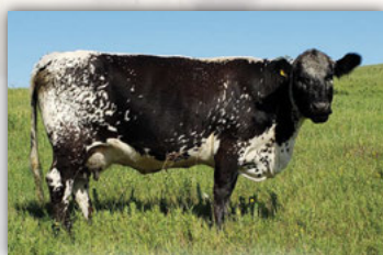
Single Tree Britney 33B - Dam