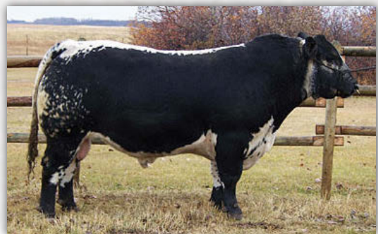
River Hill Traffic Jam 26T