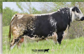
CAJA Zeppelin 1B - Sire of Embryos