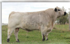
Moovin Zpotz Dart 37D - Sire