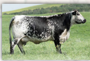
Pine Valley Anna 4C - Dam of INC 69G, INC 67G & INC 64G

Need more Wow in your herd? INC Coral Reef 69G fits the bill. Magnificent hip, deep as an ocean and clean fronted, Coral Reef is another prime example of an up and coming Zeppelin female.