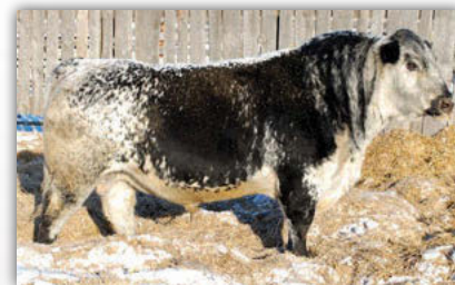
P.A.R. Moo Fassa 03M - Sire of Embryos

P.A.R. Moo Fassa 03M: Polled: PP Coat Colour: E o /E o Myostatin: Carrier