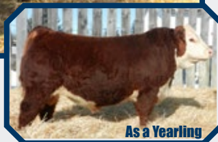
As a Yearling

Here's our two-year-old consignment that will go out and breed a lot of cows for you and look good doing it. He was used last summer on some of our purebred and commercial cows and the calves thus far look great. He's a maternal brother to our yearling bull, 22G.