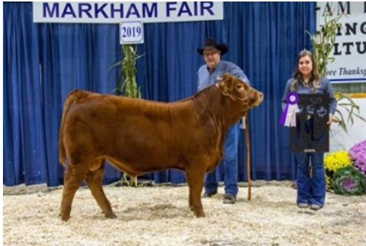
GYS 3G Smart Polled Gotham, a Wulfs X-Factor 7523X son out of a RPY Paynes Marathon 47U daughter. Champion Bull Calf & Reserve Champion Bull, 2019 Central Ontario Limousin Showcase Reserve Senior Bull Calf- 2019 Provincial Show, Markham Reserve Limousin Show Bull of Year- 2019