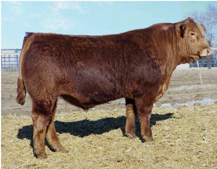
FI 1509 R, Wulfs Ramjet 1509R, a red homozygous polled son of Wulfs Nero 514N and a Vord Halfback daughter.