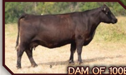
DAM OF 100E