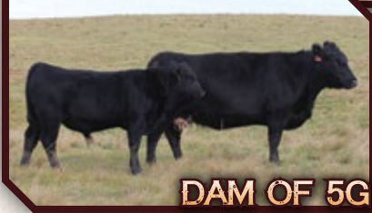
DAM OF 5G