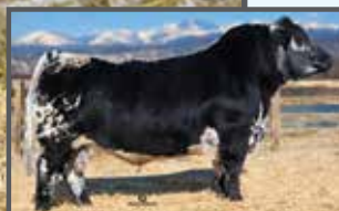
SIRE: NOTTA 1B HAWKEYE 444E

CONSIGNED BY: NOTTA RANCH CO-OWNED WITH: PEMBERTON SPECKLE PARK