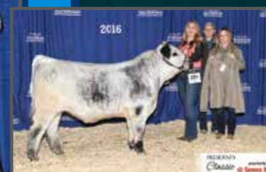
SIRE OF EMBRYOS: RAVENWORTH LEGENDARY 101D