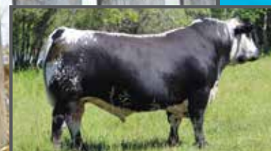
SIRE: RAVENWORTH INVICTUS 103C