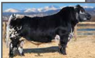
SIRE: NOTTA 1B HAWKEYE 444E