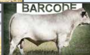
FULL SIBLING: NOTTA 101Y BARCODE 113B