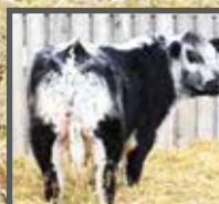
NOTTA 101Y LISTEN IN 369G