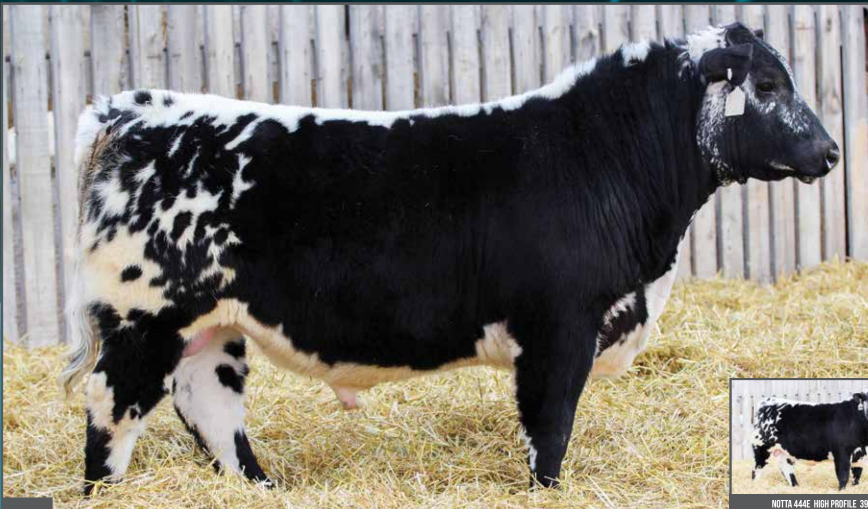
NOTTA 444E HIGH PROFILE 395G