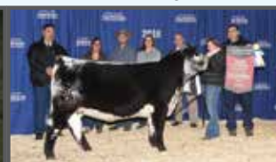
3R PROGENY: NOTTA 101V CADENCE 213C