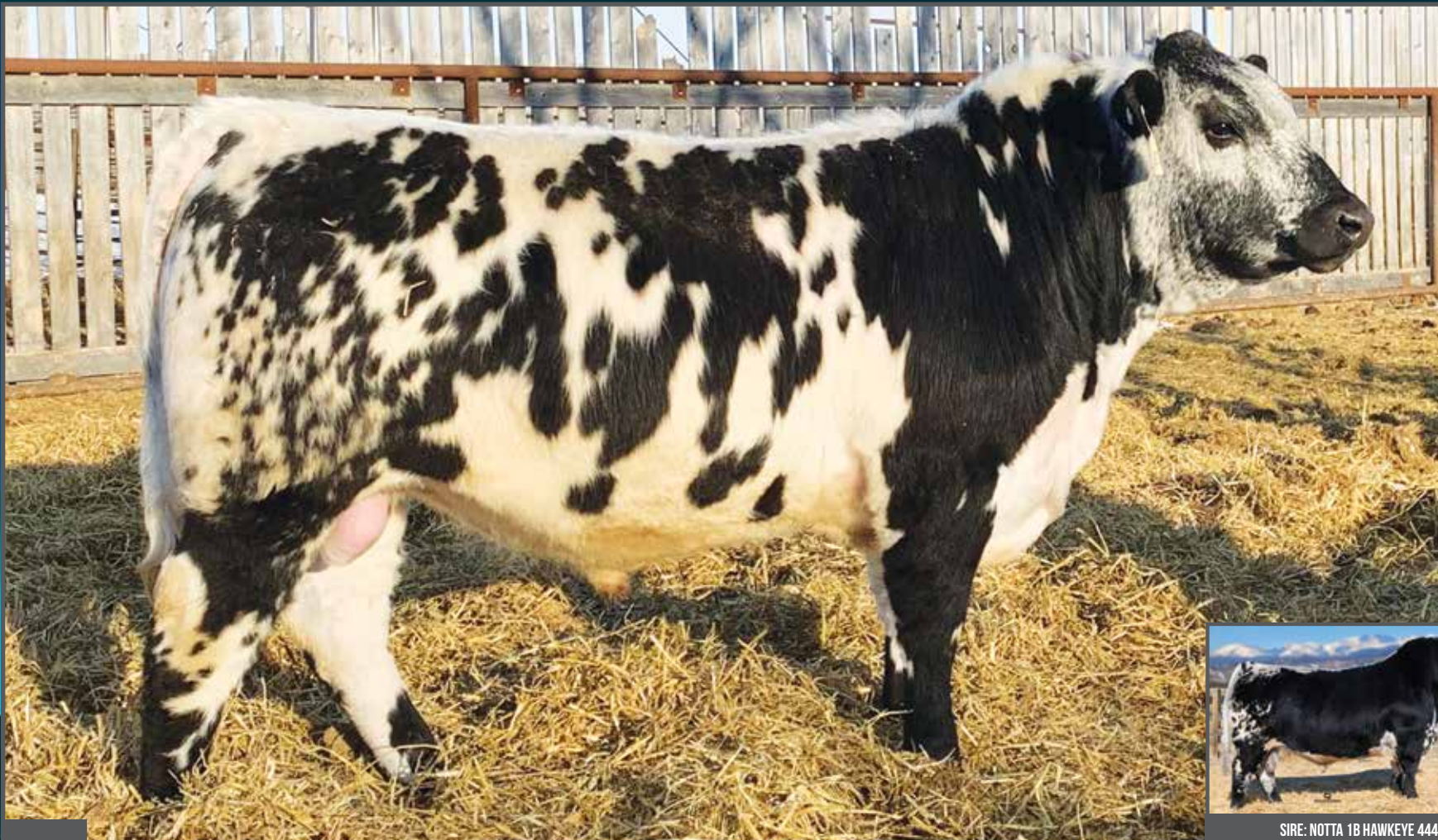
SIRE: NOTTA 1B HAWKEYE 444E