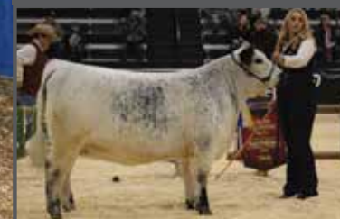
EMBRYOS FULL SIBLING: RAVENWORTH NORTHERN STAR 127F