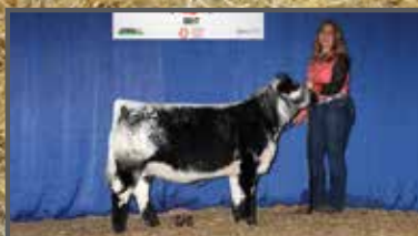
FULL SIBLING: RAVENWORTH WILLOW 134D