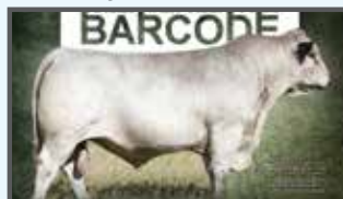
3R PROGENY: NOTTA 101V BARCODE 113B