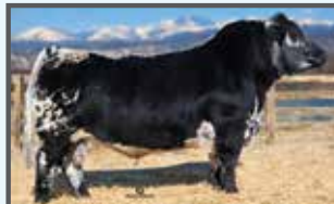
SIRE: NOTTA 1B HAWKEYE 444E