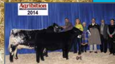
DAM: NOTTA 26T JANETTE 3W