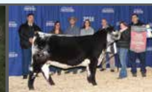
FULL SIBLING: NOTTA 101Y CADENCE 213C