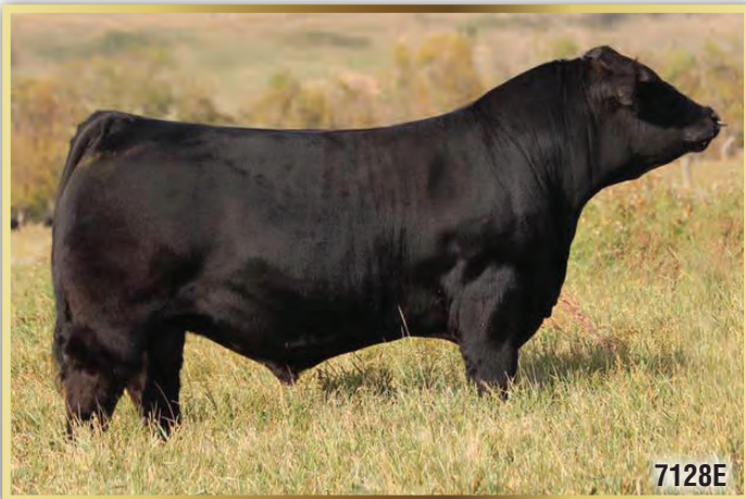
WHEATLAND Affiliate 7128E