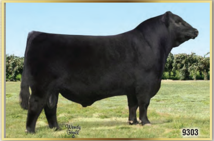
SILVERAS Style 9303