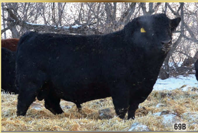
JPCC Super Smooth 69B