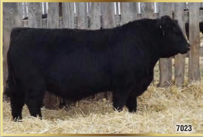
SBF 3247 Rite 7023