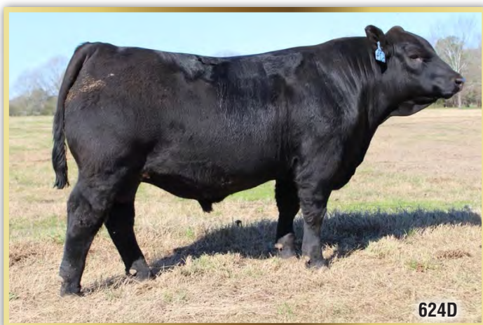
MICH WHEATLAND Hicabiber 7197E