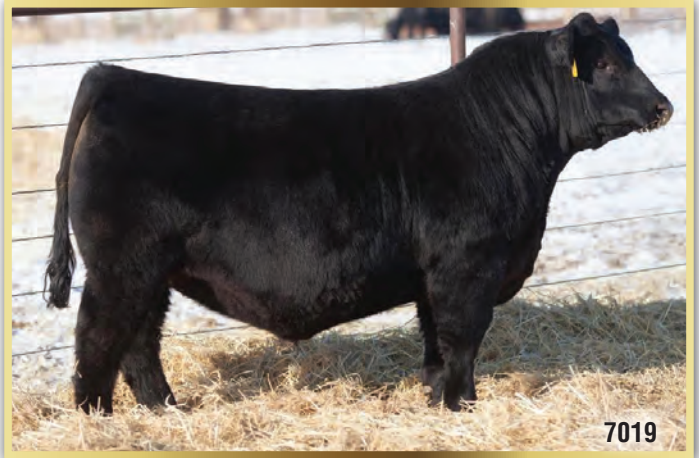
WHEATLAND Royal Flush 435