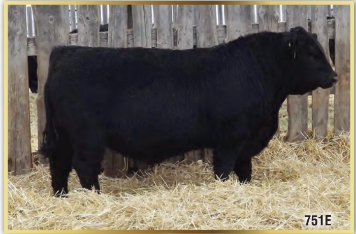
MSFL Milk Money 751E