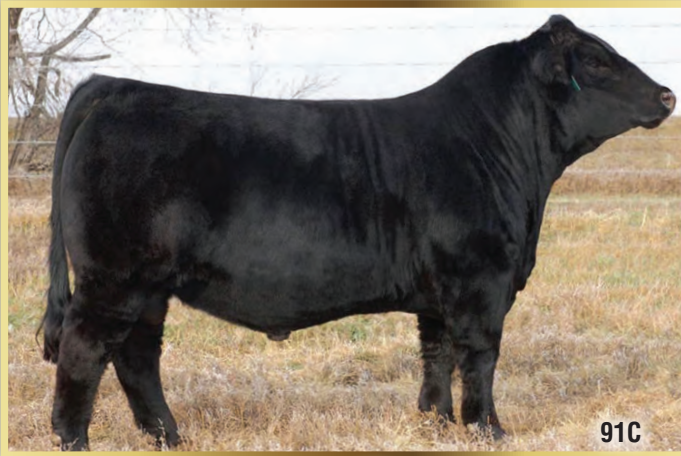
CCLT Alliance 91C