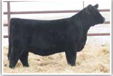
SIES 18H Full Sister to Lots 3 to 6