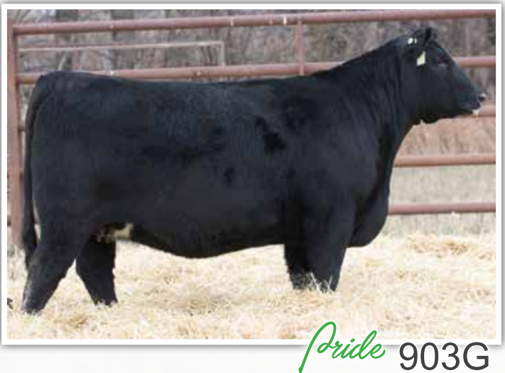
Sold to Brian Elaschuk