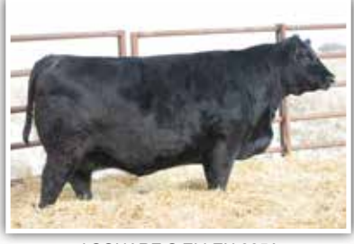
J SQUARE S ELLEN 335A Dam of Lots 3 to 6

We featured a choice lot this fall in our Female Focus Sale that was choice of four full sisters to these bulls. We are more than excited to have Merit Cattle Co. purchase their pick of an Alcatraz out of Ellen.