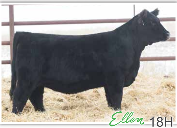
Sold to Merit Cattle Co.