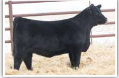
SIES 26H Full Sister to Lots 3 to 6