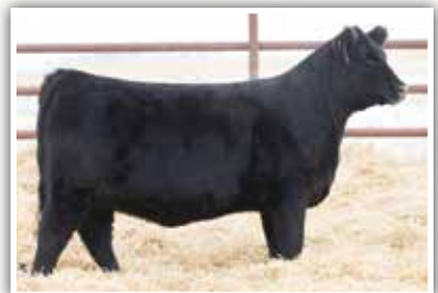
SIES 15H Full Sister to Lots 3 to 6