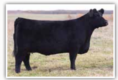
SIES 715E Maternal Sister to Lots 3 to 6