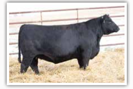
SIES 805F - Maternal Sister