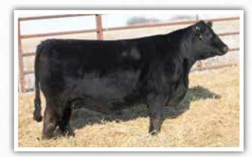
SIES 823F - Maternal Sister