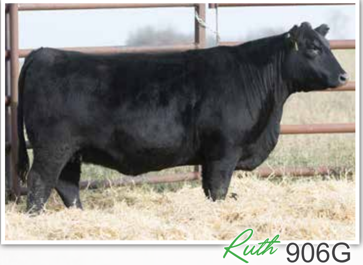
Sold to Northern View Angus