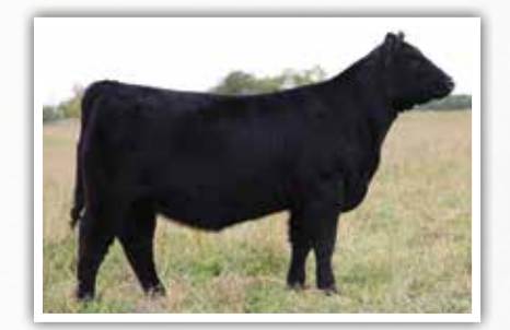
SIES 419B - Maternal Sister