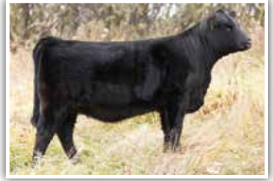
SIES 819F Full Sister to Dam