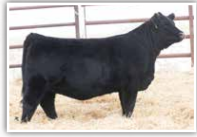
SIES 21H Full Sister to Lots 3 to 6