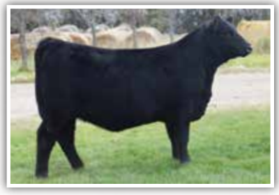
SIES 506C Maternal Sister to Lots 3 to 6