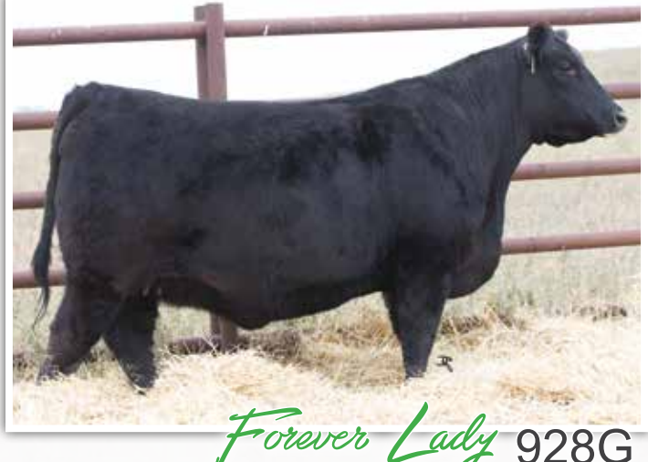
Sold to Swan Hills Ranch