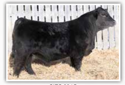
SIES 934G Maternal Brother