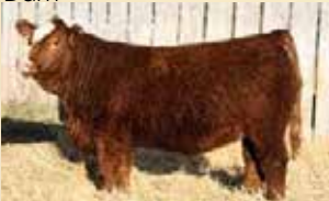
Calf photo of Dam