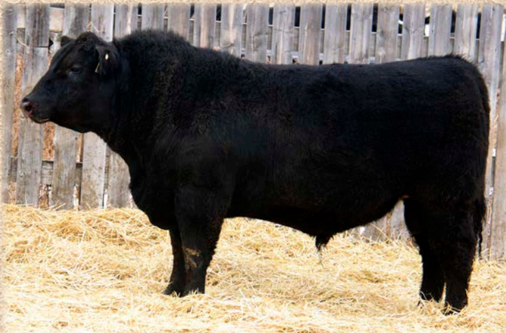
Lot 29 - JC CRAIG'S TOUCHDOWN 35E