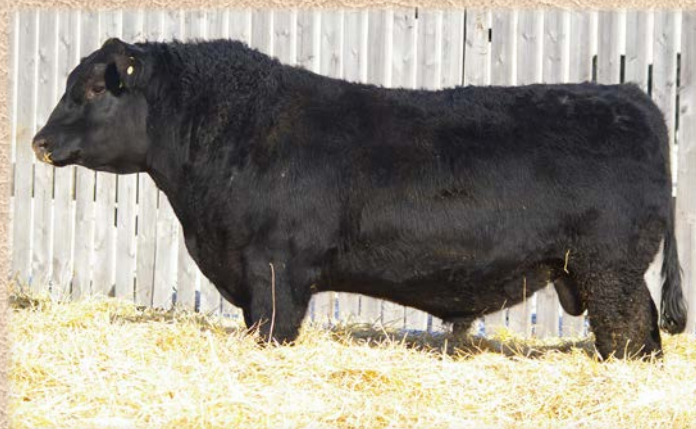
LOT 56 - BEAR CREEK STONEY 94E

Another standout, 94 oozes angus character and carries himself like it to. It is really hard to fault this bull; he comes from a tremendous mother who really gets the job done. Definite herdsire prospect.