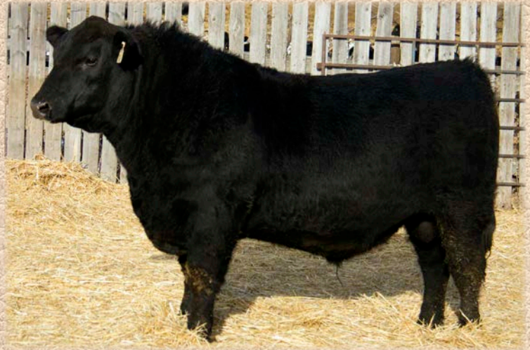
Lot 2 - JC CRAIG'S TENN X 12E