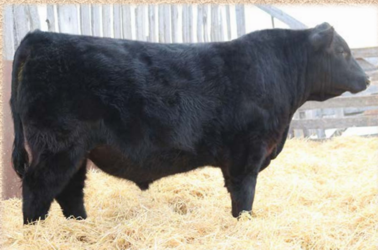
LOT 87 - HE 3439 RENOWN 124F

Out of our 1T donor cow that has done an outstanding job for us. She has 34 calves registered out of her. If you are looking for hair this cow probably throws as much hair as any Angus female can. We have two outstanding flush sisters to this bull at home. The dam of 2F is a sister as well.