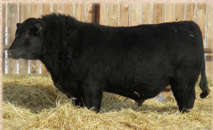
LOT 59 - BEAR CREEK STONEY 79E

I've always really liked this bull. A little more moderate in his frame than his brothers, but does he resonate with style. His mother is a good-footed, beautiful consensus daughter that's been designated as an Elite Dam. She's from our 56R cow that has raised us 12 calves and is still in herd. Her grand dam, 56N raised us 11 calves. There's longevity, functionality, and in the end profit behind the Lavender Lady cow family. It's really hard to go wrong with a bull like this at the end of the day.