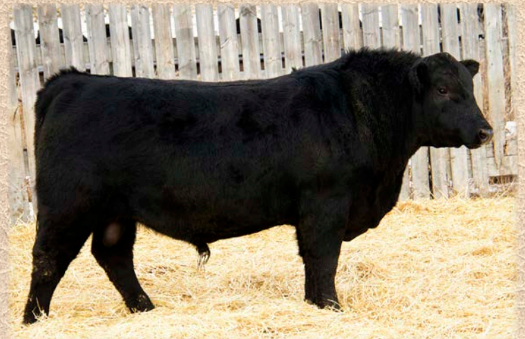
Lot 15 - JC CRAIG'S TANK 33E