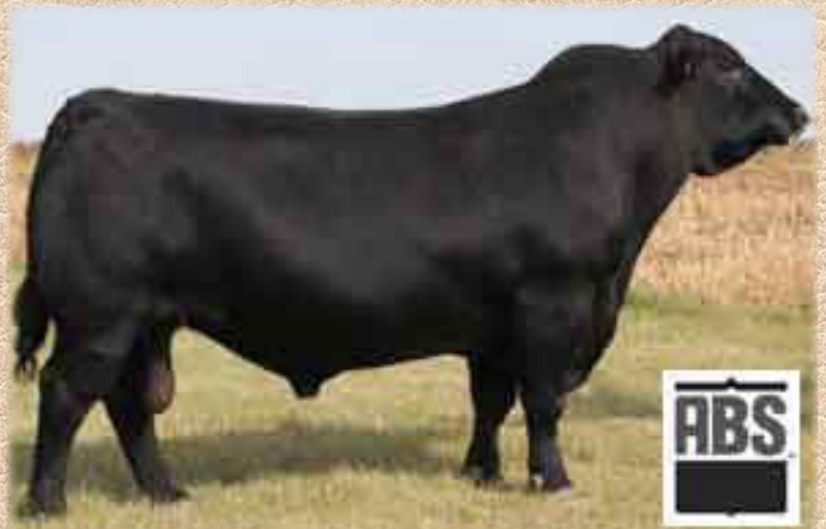
REF - SHIPWHEEL CHINOOK

S A F FOCUS OF E R MYTTY COUNTESS 906 VERMILION DATELINE 7078 ERISKAY OF APEX 9004