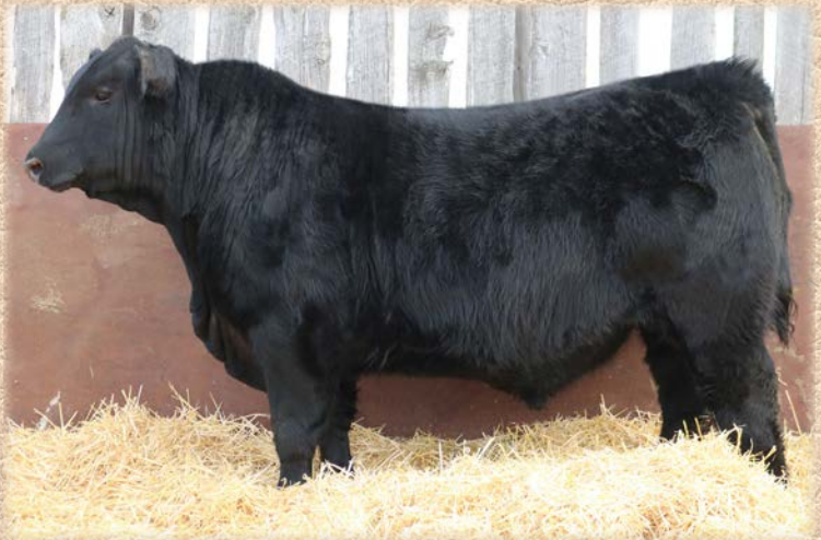
LOT 96 - HE 2020 INTERNATIONAL 8F

HF KODIAK 5R TLA BEAUTY 5R TC GRID TOPPER 355 PSF ROSEBUD 38M