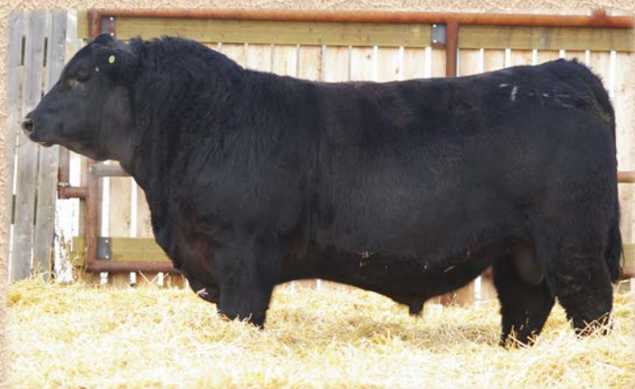
LOT 63 - BEAR CREEK JACKSON 74E

Jackson is impressive. Starting with large, good feet, legs as correct as they come and natural thickness with an attractive angus head. His bulls are sure to please, they check all the boxes, but even more so do his heifers; they are incredibly consistent with a stamp to them. Aside from that, he's an outcross pedigree that does not sacrifice quality in any shape or form. Right now, Jackson and Stoney are our flagship herdsires and I'm very excited to get the Jackson daughter's milking.