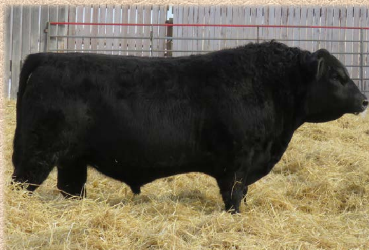
LOT 70 - BEAR CREEK WINDY 116E

RECOMMENDED FOR HEIFERS I really like this bull. His mother is a Pacesetter daughter, he's stacked heifer bull pedigree and should provide trouble free calving while being attractively built.