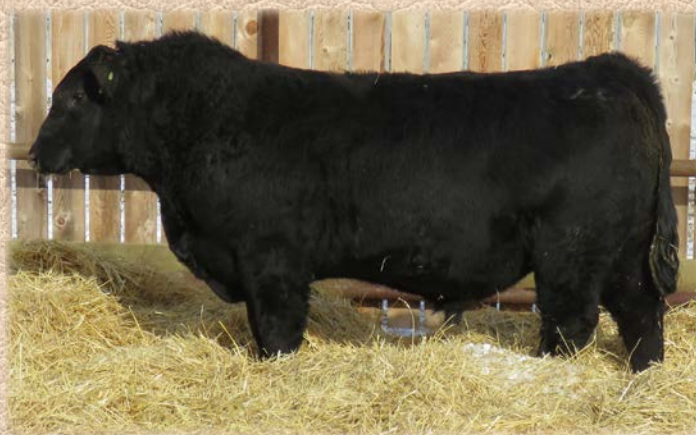
LOT 58 - BEAR CREEK STONEY 44E

I've always really liked this bull. A little more moderate in his frame than his brothers, but does he resonate with style. His mother is a good-footed, beautiful consensus daughter that's been designated as an Elite Dam. She's from our 56R cow that has raised us 12 calves and is still in herd. Her grand dam, 56N raised us 11 calves. There's longevity, functionality, and in the end profit behind the Lavender Lady cow family. It's really hard to go wrong with a bull like this at the end of the day.