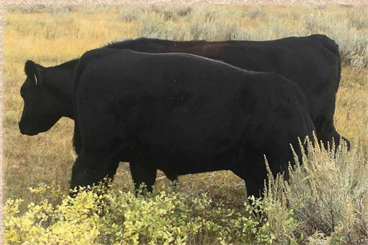
HE 7700 ROSE 33D - DAM OF LOT 97

This guys 2 year old dam did a heck of a job on this guy. Just check out the picture below. His dam has an excellent udder and will have a bright future ahead of her. Goes back to 116F'S dam.