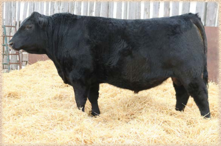
LOT 83 - HE 3439 RENOWN 37F

SOO LINE MOTIVE 9016 WIWA CREEK PRIDE 63'10 REMITALL PLAYBOY 4P LLB BARBARA 422P