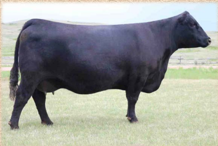
HALL'S ROSEBUD 212Z - DAM OF LOTS 93 TO 96