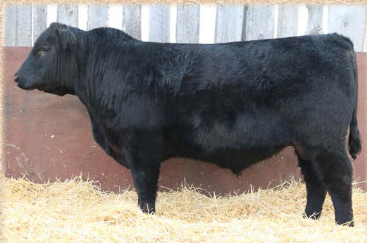
LOT 97 - HE 418 KOZI 10F