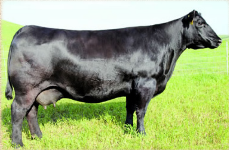
S A V BLACKCAP 4136 - THE DAM OF $9.5 MILLION OF PROGENY SALES. SONS INCLUDE SENSATION, RENOWN, RESOURCE ; JUST TO NAME A FEW.

The 650,000 high selling bull of the entire angus breed in 2016. He delivers calving ease with outstanding phenotype and his daughters have the look to be outstanding females. This should come as no surprise as he is out of the legendary 4136 cow who has produced $9.5 million worth of progeny sales. His sire's dam is also the second top producing dam in the SAV program with $3.7 million of direct progeny sales. Needless to say his pedigree is absolutely stacked!!!