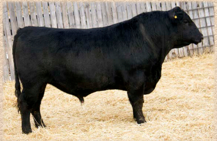
Lot 9 - JC CRAIG'S CORONA 16E