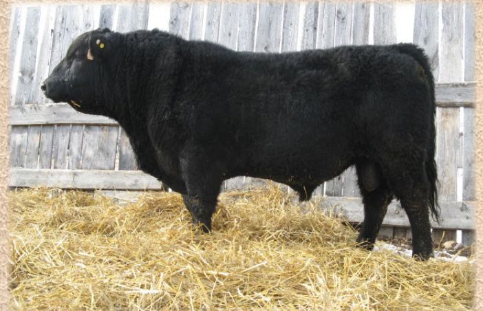
Lot 47 - FR CONSENSUS 22E