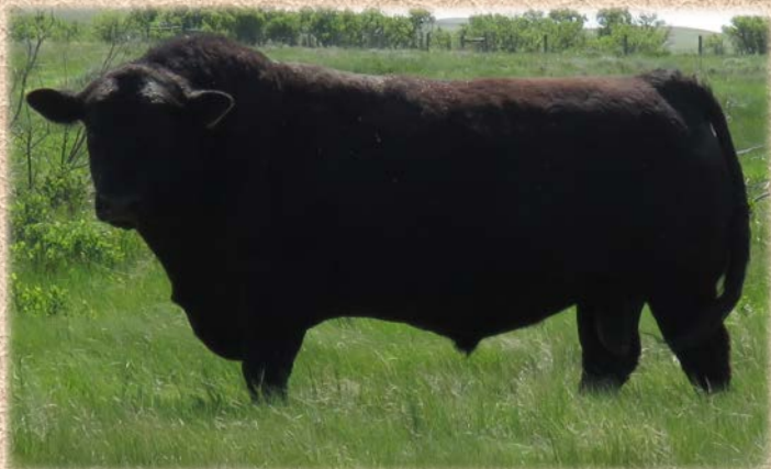
SIRE - EASTONDALE JACKSON 63'15

This Stoney comes from an excellent 26T daughter that we unfortunately lost. He fits the mold of his brothers and should perform well.