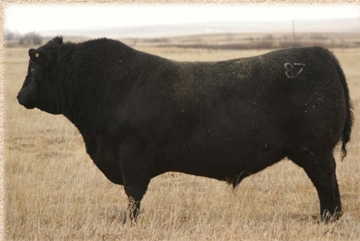
REF-CRESCENT CREEK PACESETTER 78Z

This bull has one of the strongest Angus cows I've ever seen as his mother. She is wide-hipped and big-topped with a gorgeous udder. Despite being her first calf off a heifer bull, with her inherent power I would recommend 82 being used on cows.