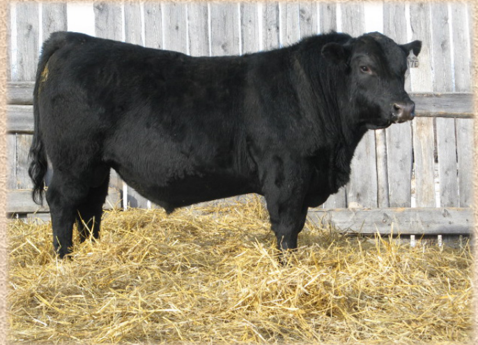
Lot 31 - FR COMPLETE 17E