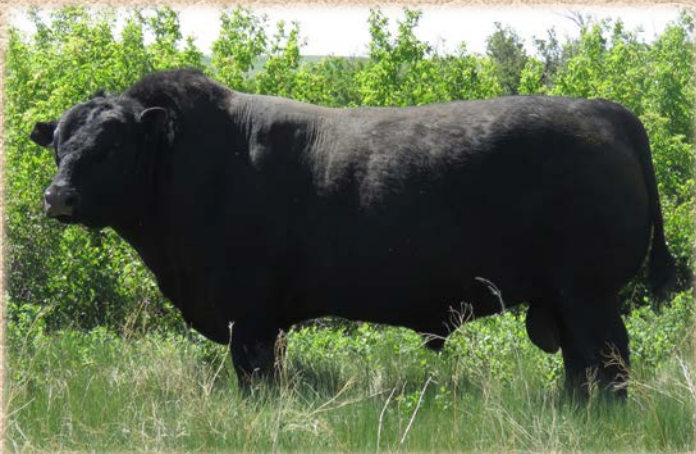
REF - MERIT STONEY CREEK 4023

We had high hopes when we purchased 'Stoney', and he's exceeded all of them. His heifers are flat out amazing, the bull calves are the most consistent that we've raised. If you're looking for thick, hairy cattle to add spring of rib, and stick some meat on while doing it with moderate birth weights then Stoney sons are the bulls you need. It is amazing how these bulls weigh up with their thickness and length. They are angus cattle through and through.