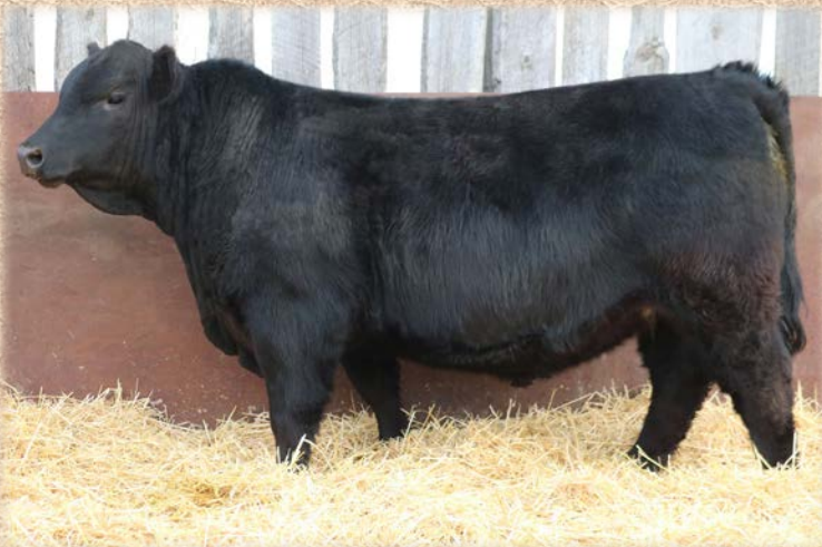
LOT 89 - HE 5615 SENSATION 114F

Probably the heaviest one of the group. Their dam has had numerous high sellers for us. As of right now she has over 35 calves registered out of her with many more on the way. Sons are working at Dot bar Dot, Watsons, 9 Bar, Wedricks, Masers, Lehrs, Sloans, as well as our own herd.