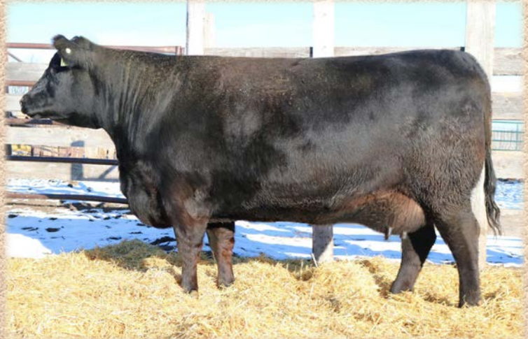
DBRL IM HEDY 56U - DAM OF LOTS 88 TO 92