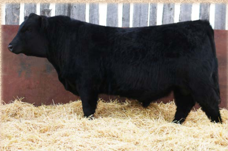
LOT 101 - HE 587R THUNDER 78F

A proven calving ease sire that is best known for his easy fleshing, sound footed, long lasting females.