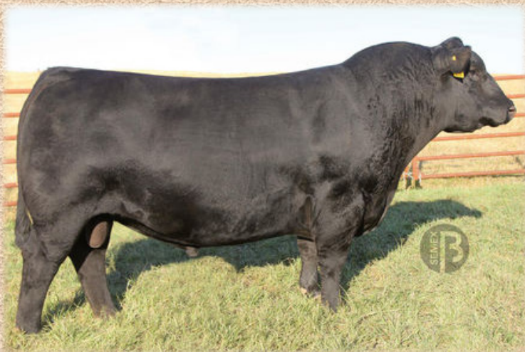
REF - S A V INTERNATIONAL 2020

The $400,000 lot 1 bull from the 2013 SAV sale. He has become one of the most consistent and popular bulls of the breed. He crosses well on anything you breed him to and his progeny always rises to the top. An ideal beef bull thick, heavy muscled, stout rumped with power, performance and superior structure.