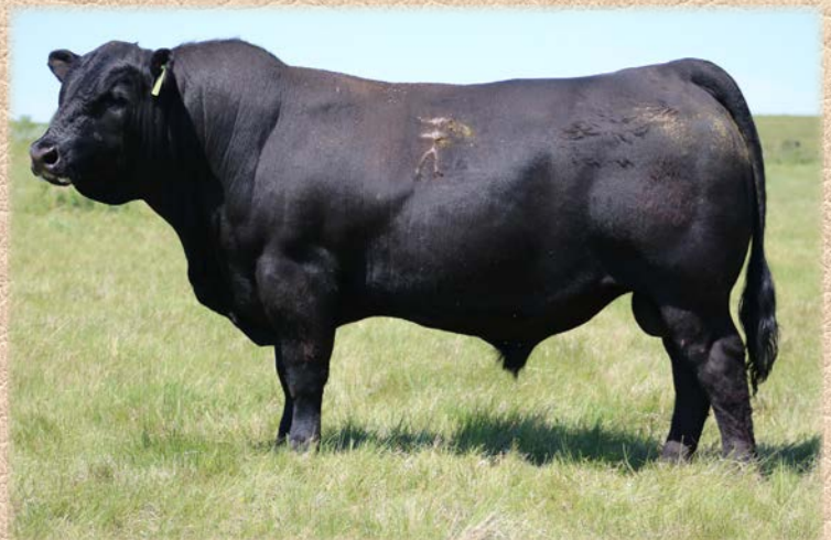
QUANTIFIED - MATERNAL BROTHER TO LOTS 88 TO 92