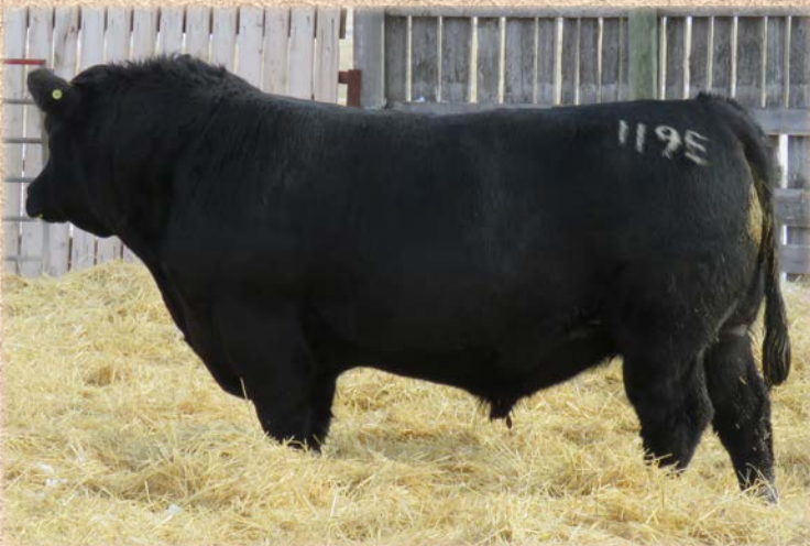
LOT 74 - BEAR CREEK 007 119E

Herdsire prospect here. One of the strongest Lucky Seven sons I've raised. If it wasn't for the density mom I would probably have kept him to replace Lucky Sevens, but the pedigree is just too close for many of our cows.