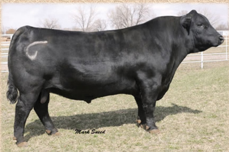
REF - CONNEALY THUNDER

Big hairy growth bull out of a first calver. Even though he was born unassisted out of a first calver and out of Chinook we recommend him to be used on cows as his grand dam wasn't low enough birth weight to totally trust him on heifers. Goes back to the 1T donor cow.