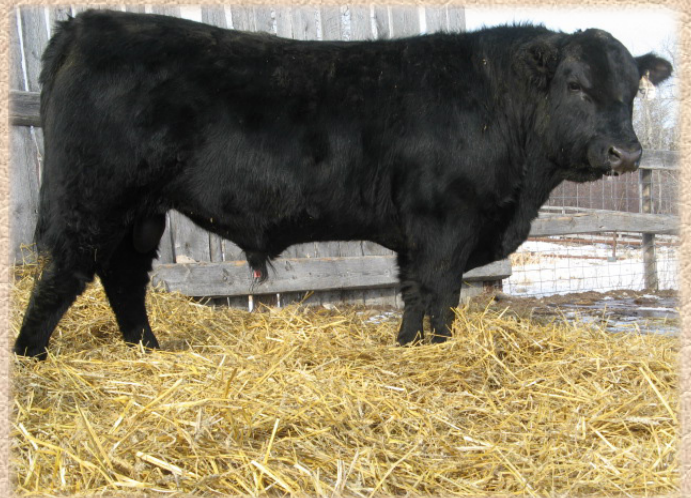
Lot 33 - FR LEAD CHANGE 19E