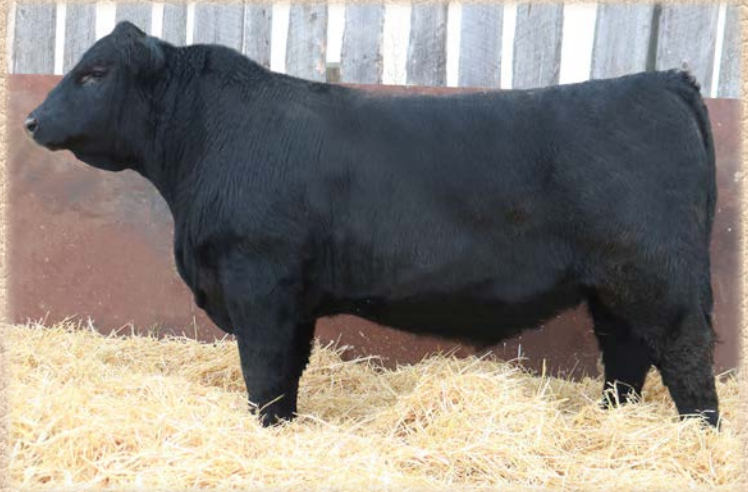
LOT 91 - HE 5615 SENSATION 296F

Not sure how many more top end cows I could stack into a pedigree. Another good easy moving brother here. We are starting to flush their maternal sister as well, she is an outstanding full sister to our Quantified bull