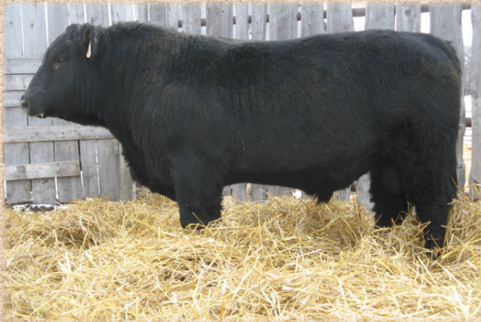
Lot 43 - FR LEAD CHANGE 91E