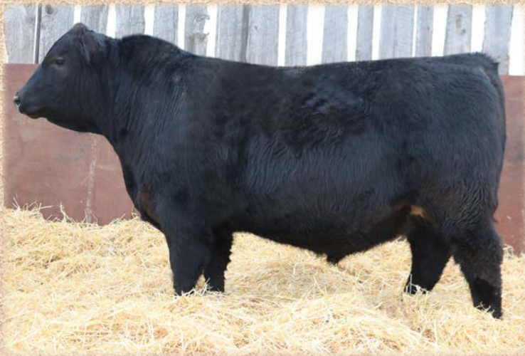
LOT 88 - HE 5615 SENSATION 113F

Featuring five flush brothers out of our 56U donor cow. This is a well-balanced deep bull. Expect moderate birth with good growth with his calves. His daughters should be outstanding as well.