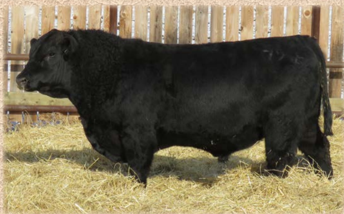
LOT 55 - BEAR CREEK STONEY 796E

This bull really comes together exemplifying length and thickness while maintaining eye appeal and remaining fault free. He strides out, he's quiet, there's really nothing to not appreciate about him. His mother has been a steady producer, recently earning Elite Damn status in 2018. If you're searching for a herdsire, you need to check this guy out.