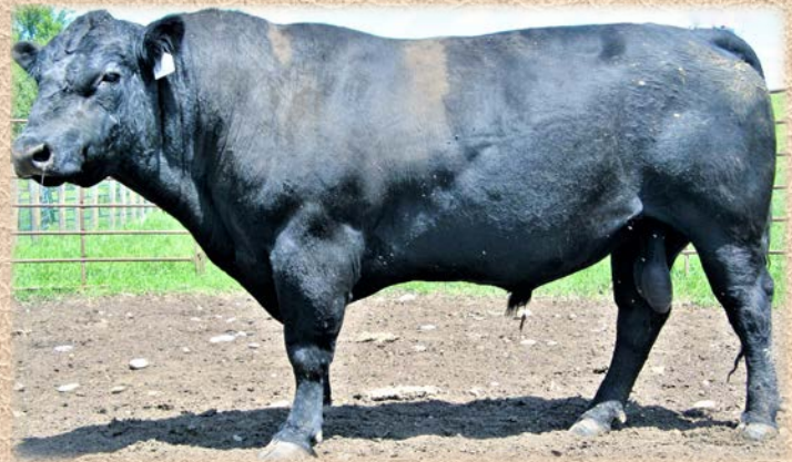
SIRE - WIWA CREEK LEAD CHANGE 85'14

Lead Change continue's to be a well balanced bull. His stretch, muscle development, and performance make his offspring standout on grass or in the feed pen. Style, working temperament, and feed conversion to pay weight make his progeny the "Rancher kind".