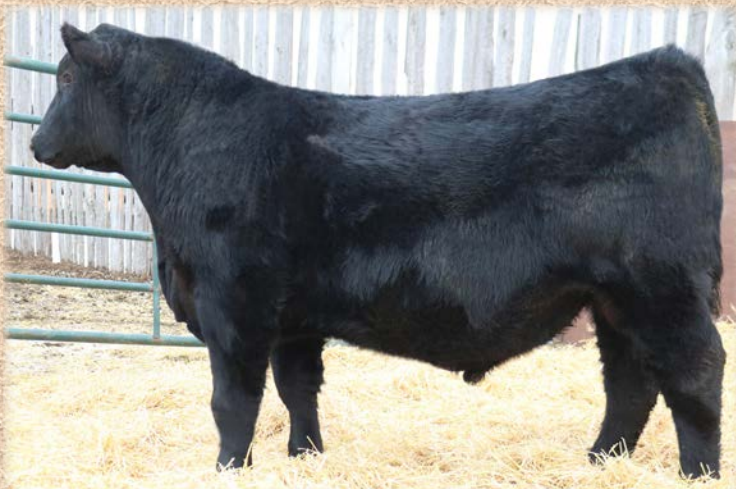
LOT 85 - HE 3439 RENOWN 26F

We have been really happy with the calves that Renown has given us. This guy is another good one out of a Tiger daughter that goes back to the famed Lady Blossom cow family.