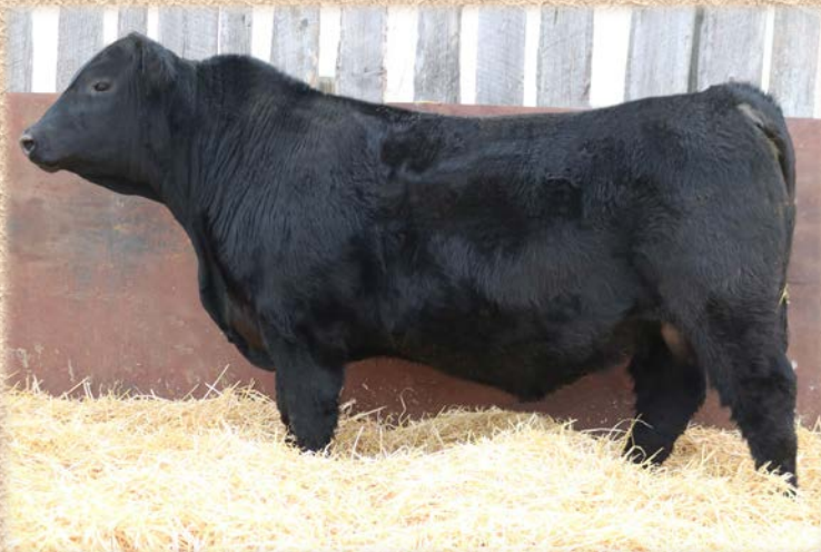
LOT 90 - HE 5615 SENSATION 152F