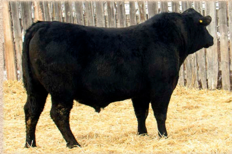
Lot 21 - JC CRAIG'S TANK 59E