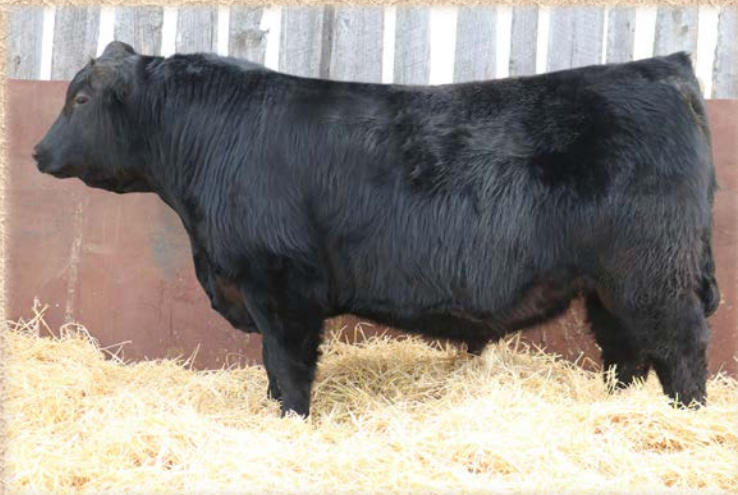
LOT 81 - HE 3439 RENOWN 116F

RITO 707 OF IDEAL 3407 7075 S A V RENOWN 3439 S A V BLACKCAP MAY 4136