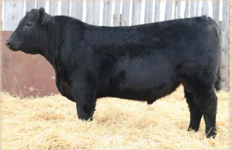
LOT 92 - HE 5615 SENSATION 25F

The youngest of the brothers. Should mature into a top rancher bull. We recently sold embryos to the UK out of their dam this fall. She already has an outstanding son working over there and is bound to have a few more.