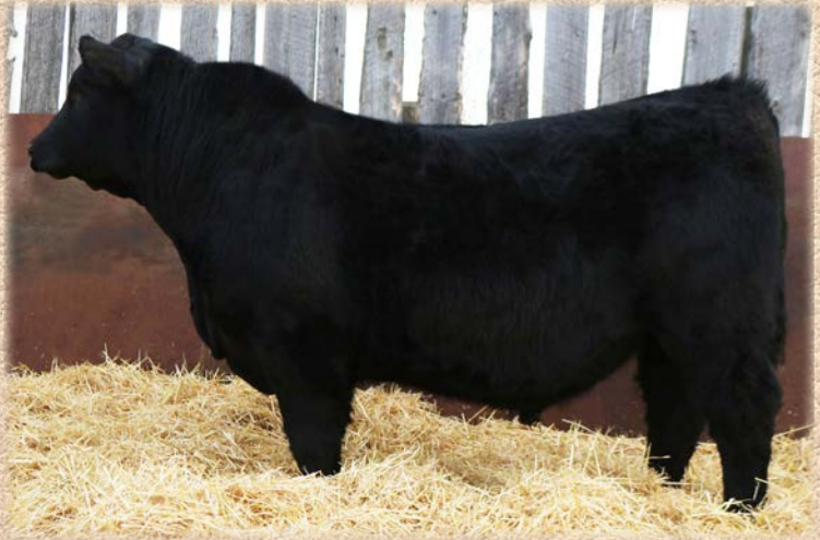
LOT 95 - HE 2020 INTERNATIONAL 11F

HF KODIAK 5R TLA BEAUTY 5R TC GRID TOPPER 355 PSF ROSEBUD 38M