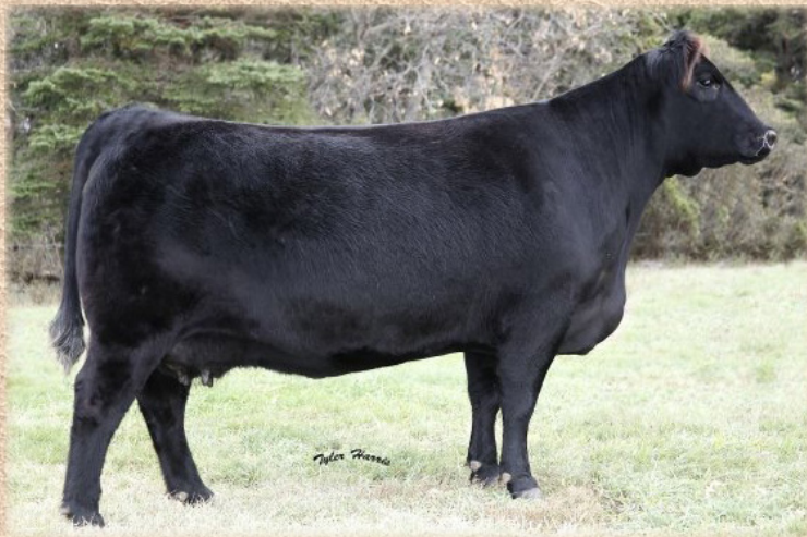
PSF ROSEBUD 12T - GRAND DAM OF LOTS 93 TO 96