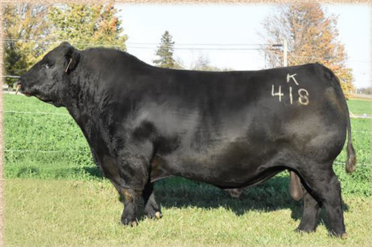
REF - KOU PAL KOZI 418

We liked this bull a lot when we saw him a couple of years ago. Bold ribbed, massive and stout are a few words that describe him. Moderate birth with good performance is what you will get with him. An added bonus is his outcross pedigree.