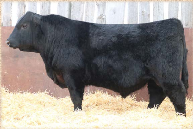
LOT 93 - HE 2020 INTERNATIONAL 129F