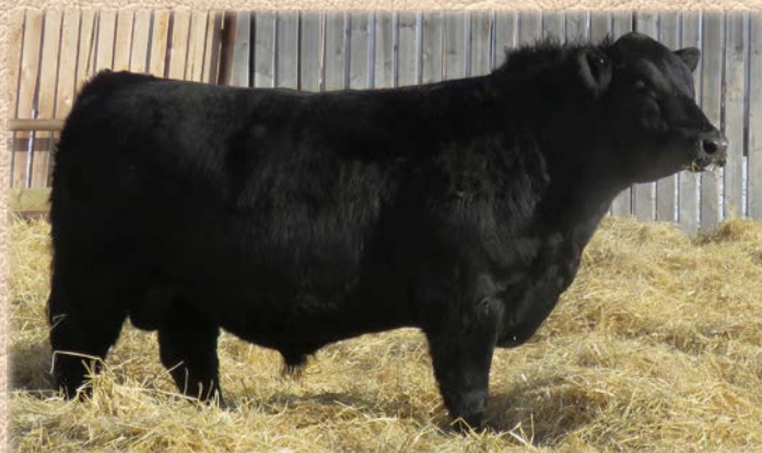
LOT 65 - BEAR CREEK JACKSON 188E

Another Jackson son, does he ever stamp them. I can't say enough about how these bulls exemplify angus character with solid correct foundation in their foot and leg structure. A maternal brother went to the 76 Grazing Coop. His mother has proven to be consistent with a third yearling son in the pen for next year, that's one of the best of the pen.