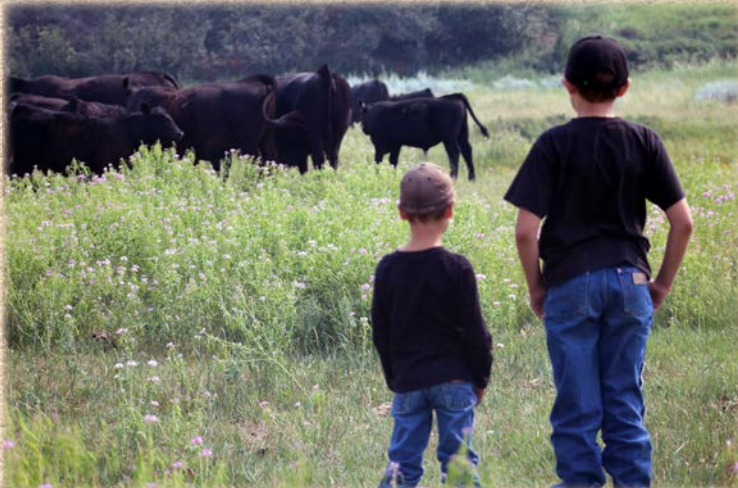
RANCH FOREMEN - MANNI & KOLT

The youngest of the brothers. Should mature into a top rancher bull. We recently sold embryos to the UK out of their dam this fall. She already has an outstanding son working over there and is bound to have a few more.