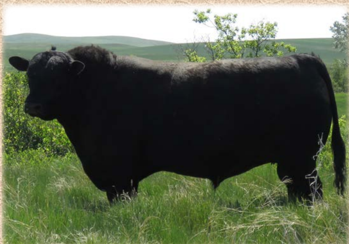
REF - EASTONDALE 6A WINDY 03'15

I liked this bull so much I had to retain him as a two-year old. He's got an extra rib, comes from a proven cow family. He doesn't have papers, but he does not sacrifice quality in any way.