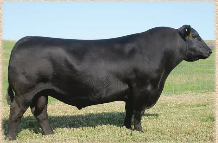
REF - S A V SENSATION 5615

The 650,000 high selling bull of the entire angus breed in 2016. He delivers calving ease with outstanding phenotype and his daughters have the look to be outstanding females. This should come as no surprise as he is out of the legendary 4136 cow who has produced $9.5 million worth of progeny sales. His sire's dam is also the second top producing dam in the SAV program with $3.7 million of direct progeny sales. Needless to say his pedigree is absolutely stacked!!!