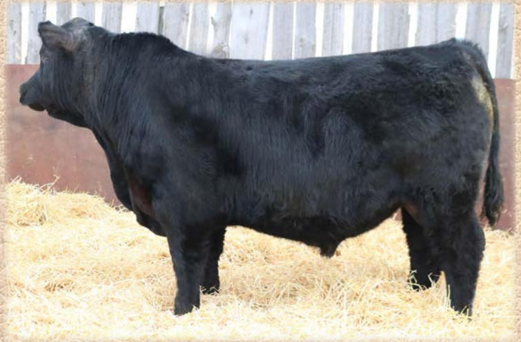
LOT 98 - HE 418 KOZI 35F

SOO LINE MOTIVE 9016 WIWA CREEK PRIDE 63'10 SCA IMAGE MAKER 08N WILLABAR HEDY 202J