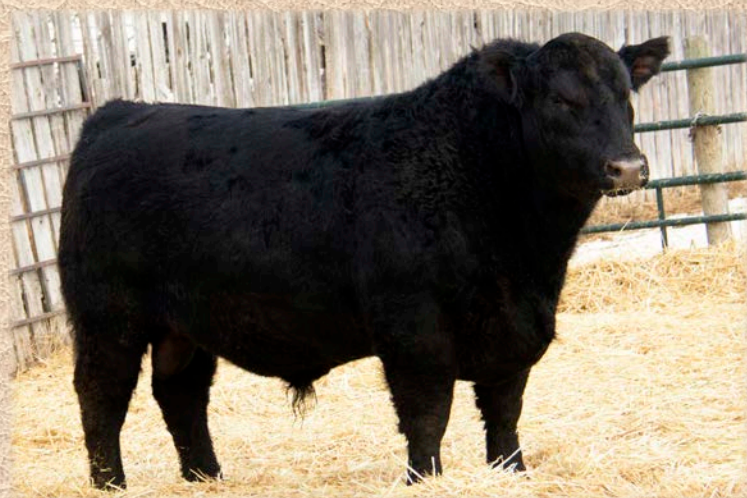
LOT 7 - SARAH'S CORONA 1E