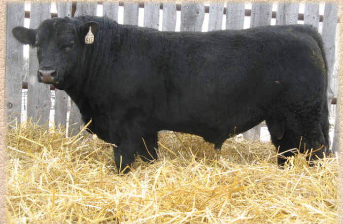
Lot 52 - FR CONSENSUS 51E