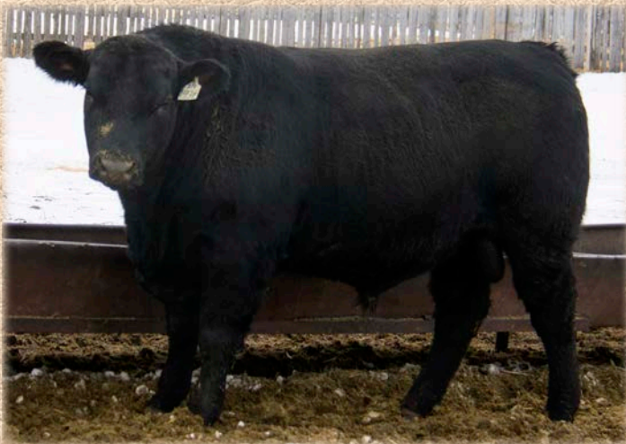
Lot 23 - JC CRAIG'S TANK 93E