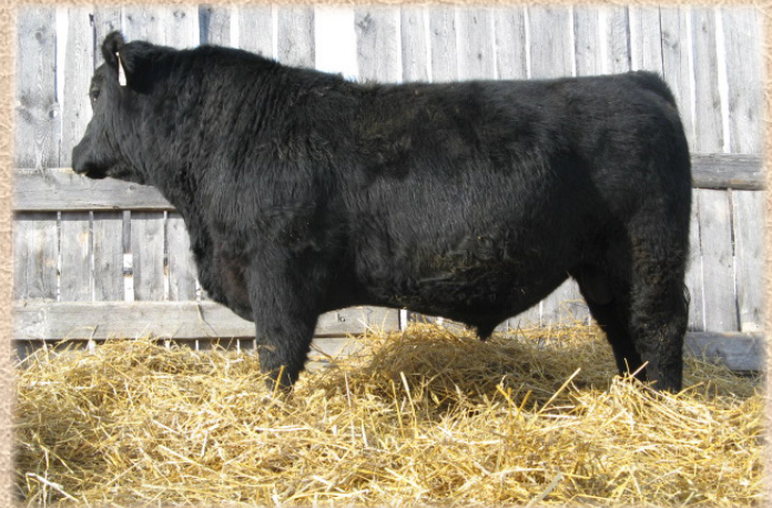
Lot 38 - FR LEAD CHANGE 55E