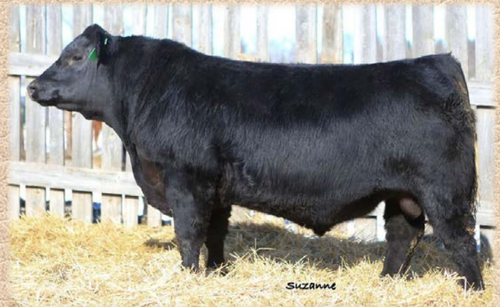
SIRE - BURNETT COMPLETE 21C

21C was the lead off bull in Burnett's 2016 sale. Outstanding eye appeal and temperament, always attracts attention in the field. A moderate bull with tremendously good structure. I am very excited to see the impact of this well muscled, easy calving, and easy keeping herd sire for years to come. He is "Complete"; the front pasture kind.