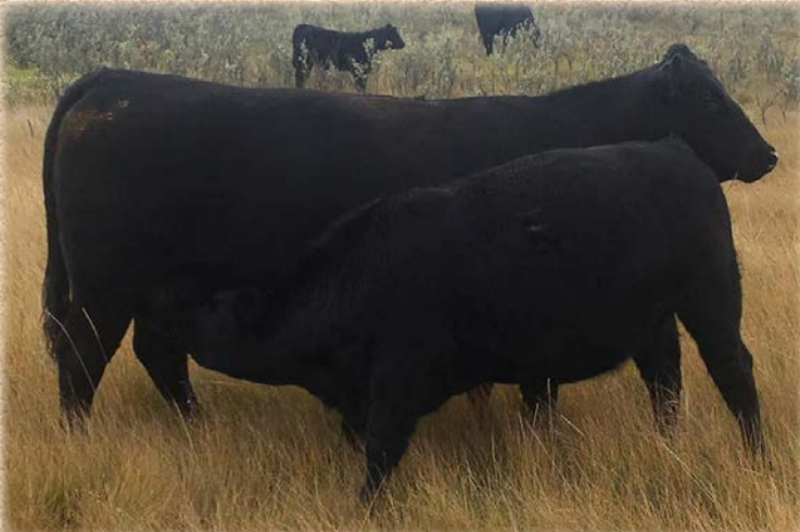
HE 125C MATERNAL SISTER TO LOT 88 TO 92