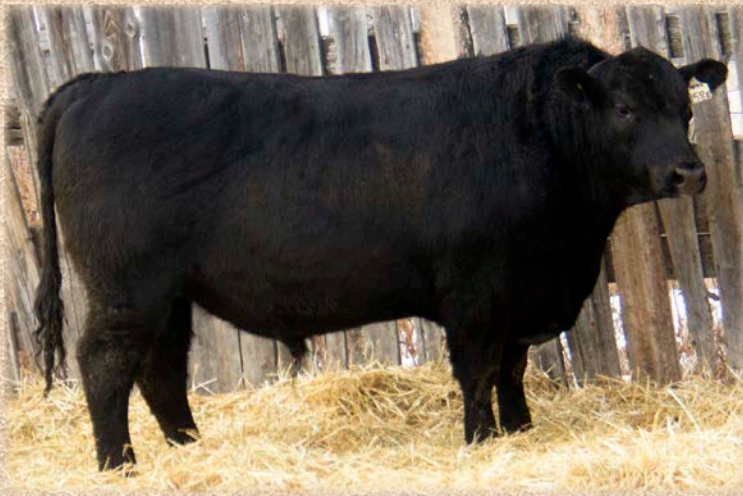
Lot 20 - JC CRAIG'S TANK 58E