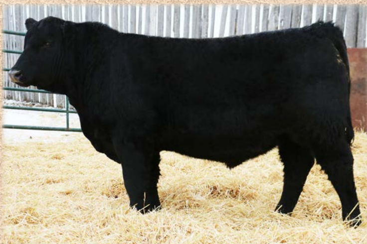
LOT 86 - HE 3439 RENOWN 110F

Might be the sleeper of the sale. He was well on his way until we lost his mother in June. He spent the rest of the summer stealing milk off the other cows but still came home with a respectable weight. His dam was a really solid Tiger daughter with tremendous feet and udder. This bulls mom and 37F's mom are sisters. We flushed his grand dam because we like her daughters so much.