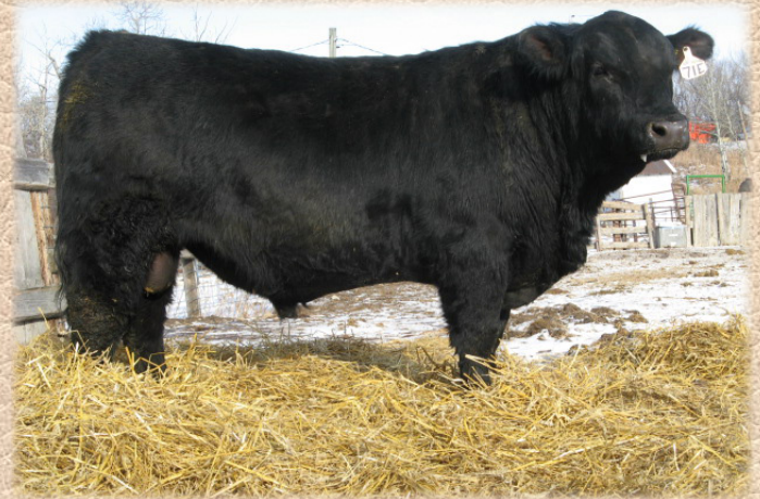
Lot 42 - FR LEAD CHANGE 71E