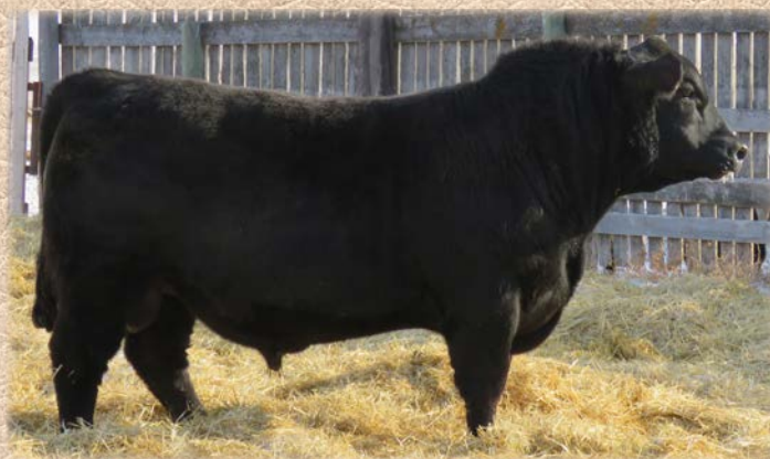
LOT 64 - BEAR CREEK JACKSON 138E

Definite Herdsire here. Coming from a very strong producing cow we purchased as a heifer calf from Crescent Creek Angus. A maternal brother went to Cypress Hutterite Brethren.