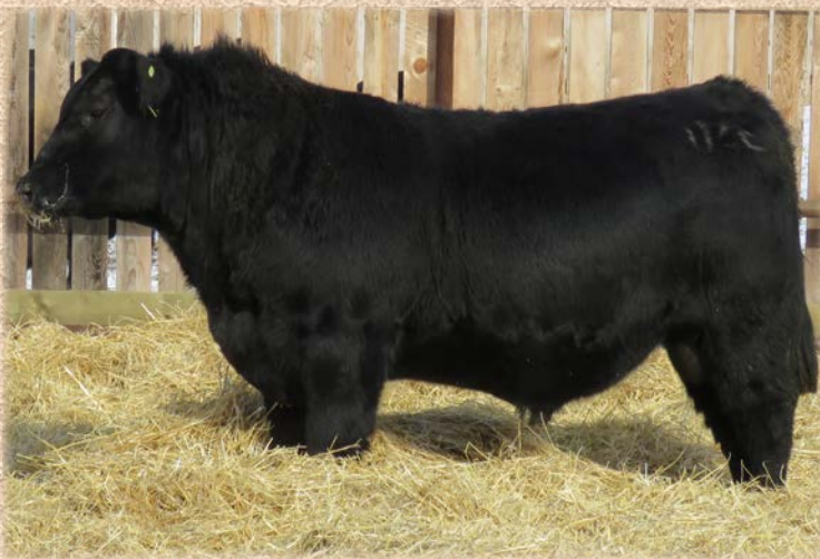
LOT 73 - BEAR CREEK 007 02E