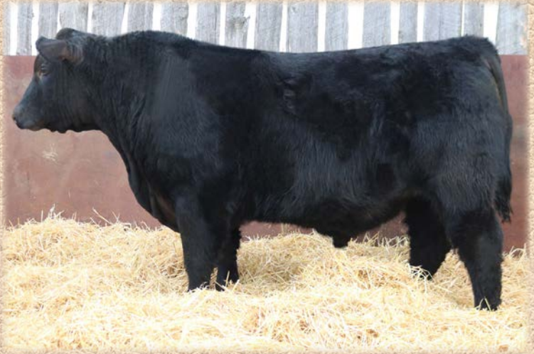
LOT 94 - HE 2020 INTERNATIONAL 118F

HF KODIAK 5R TLA BEAUTY 5R TC GRID TOPPER 355 PSF ROSEBUD 38M