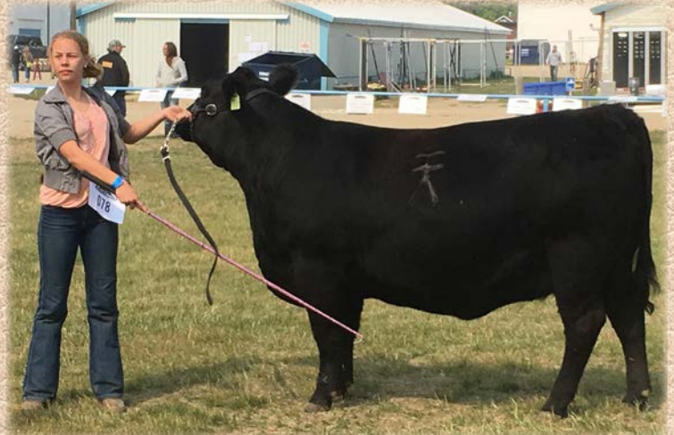
EMMA & RENOWN SHOW HEIFER MATERNAL SISTER TO LOTS 88 TO 92