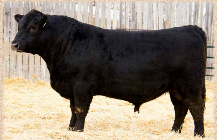
Lot 10 - JC CRAIG'S CORONA 52E