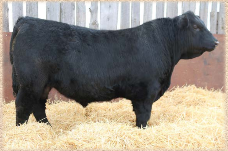
LOT 82 - HE 3439 RENOWN 109F

HF KODIAK 5R HF ECHO 84R LCI MOTOWN 2M GH ERICA MISS 11M