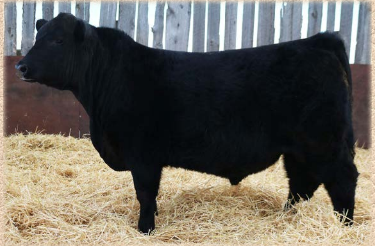
LOT 99 - HE 418 KOZI 69F

S A V HARVESTOR 0338 S A V EMBLYNETTE 5483 GH FRONTIER EARL ET 500N GH KRUGAR MATILDA 91R