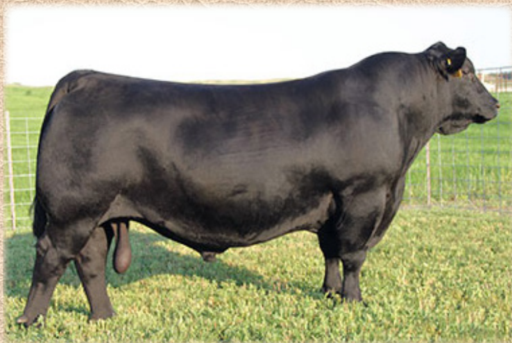
REF - S A V RENOWN 3439