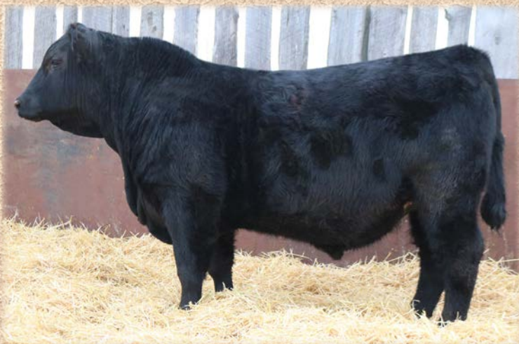
LOT 100 - HE 7700 CHINOOK 54F