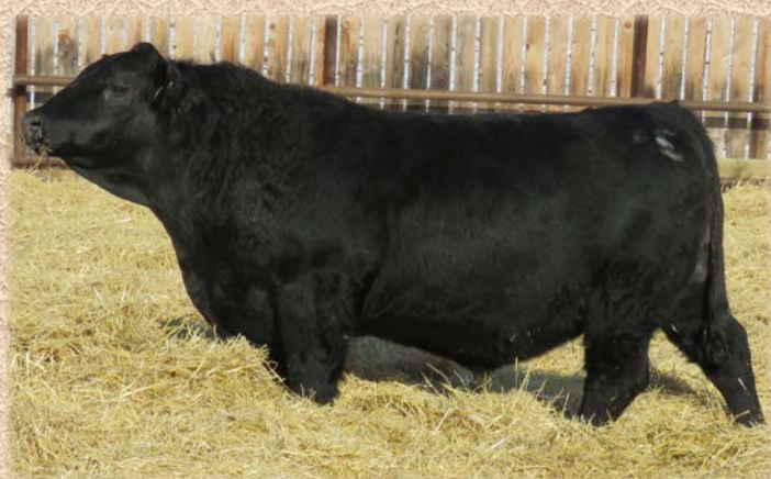
LOT 57 - BEAR CREEK STONEY 96E