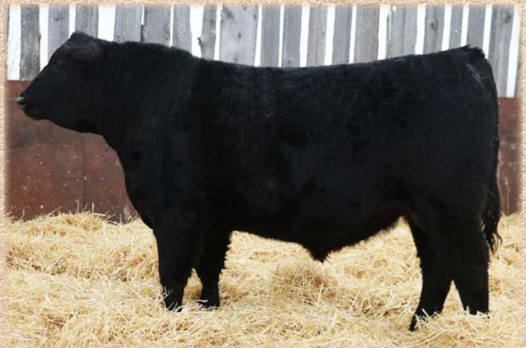
LOT 84 - HE 3439 RENOWN 2F

SITZ UPWARD 307R MAR BLACKCAP 5073 TC FREEDOM 104 SOUTHLAND ERICA 94P