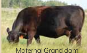
Maternal Grand dam