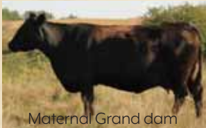
Maternal Grand dam