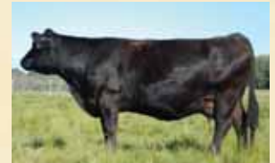
Maternal Grand dam