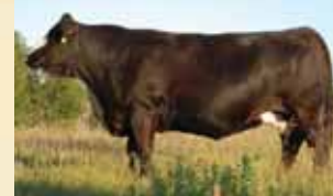
Maternal Grand dam