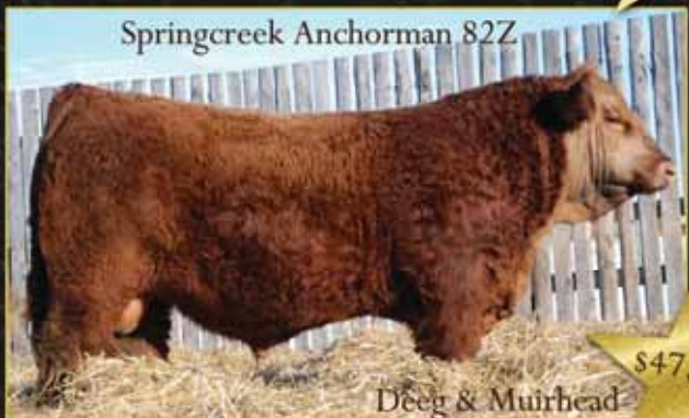
Springcreek Anchorman 82Z