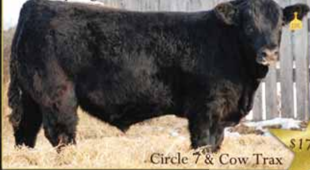
Circle 7 & Cow Trax