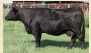
Paternal Grand dam