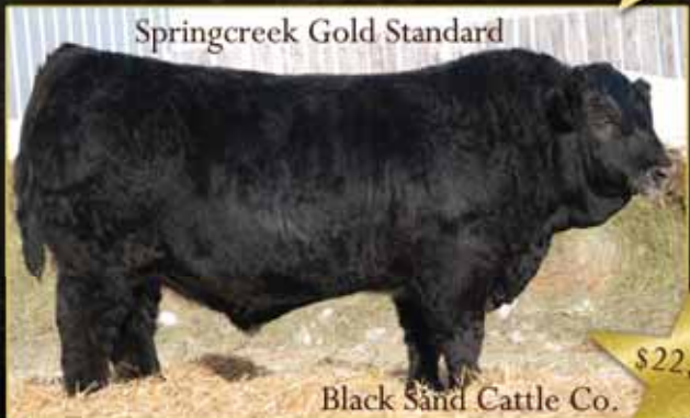
Springcreek Gold Standard