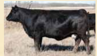
Maternal Grand dam