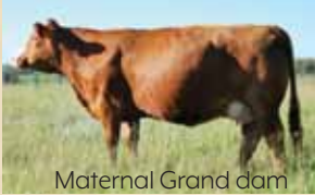
Maternal Grand dam