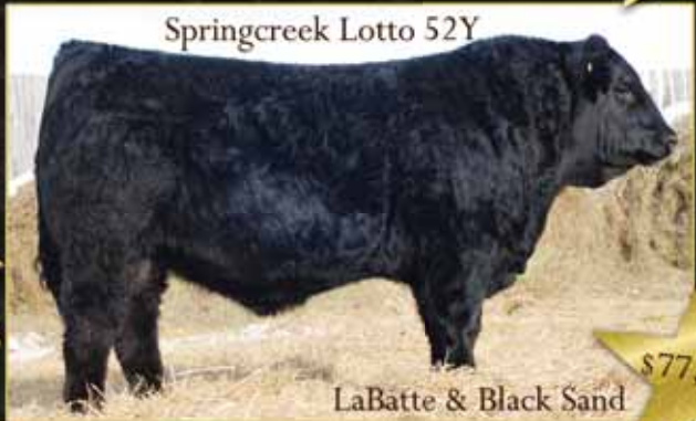
Springcreek Lotto 52Y