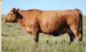
Maternal Grand dam