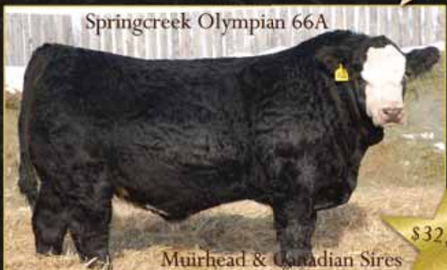
Springcreek Olympian 66A