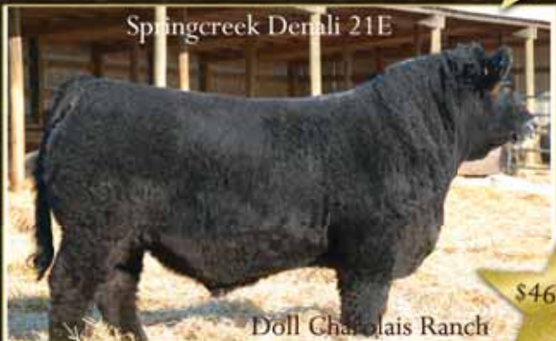
Springcreek Denali 21E