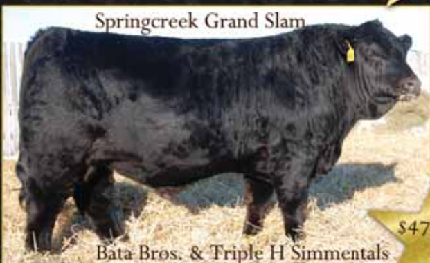
Springcreek Grand Slam