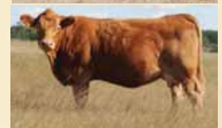
Maternal Grand dam