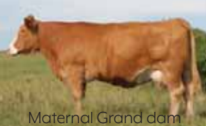
Maternal Grand dam