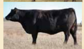
Maternal Grand dam