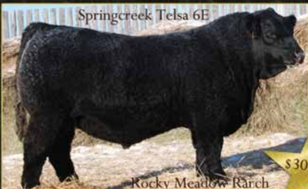
Springcreek Telsa 6E