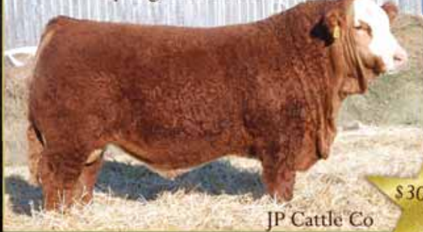
JP Cattle Co