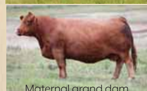
Maternal grand dam