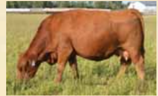
Maternal grand dam