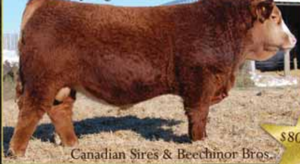
Canadian Sires & Beechinor Bros.