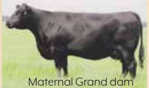
Maternal Grand dam