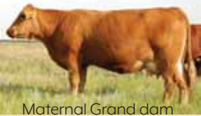
Maternal Grand dam