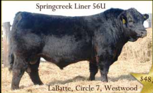
Springcreek Liner 56U