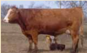
Maternal Grand dam