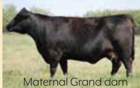
Maternal Grand dam

CONNEALY EARNAN 076E BROOKING BANK NOTE 4040 EA ROSE 918 RRAR UPWARD 35Z RRAR FAVORITE 5C GLENDROR FAVOURITE 57Z