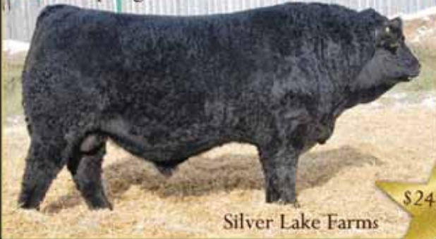
Silver Lake Farms