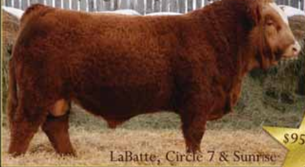
LaBatte, Circle 7 & Sunrise