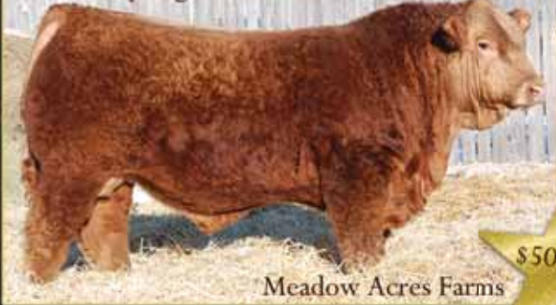
Meadow Acres Farms