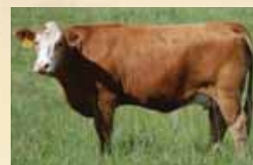
Maternal Grand dam