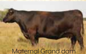
Maternal Grand dam