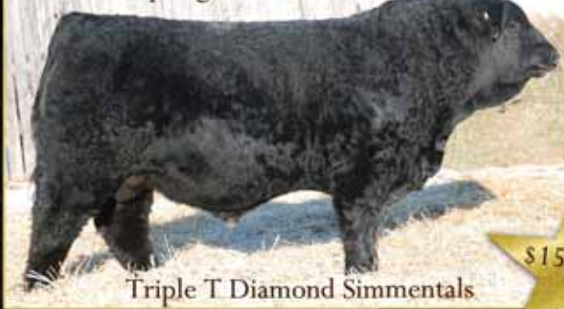
Triple T Diamond Simmentals