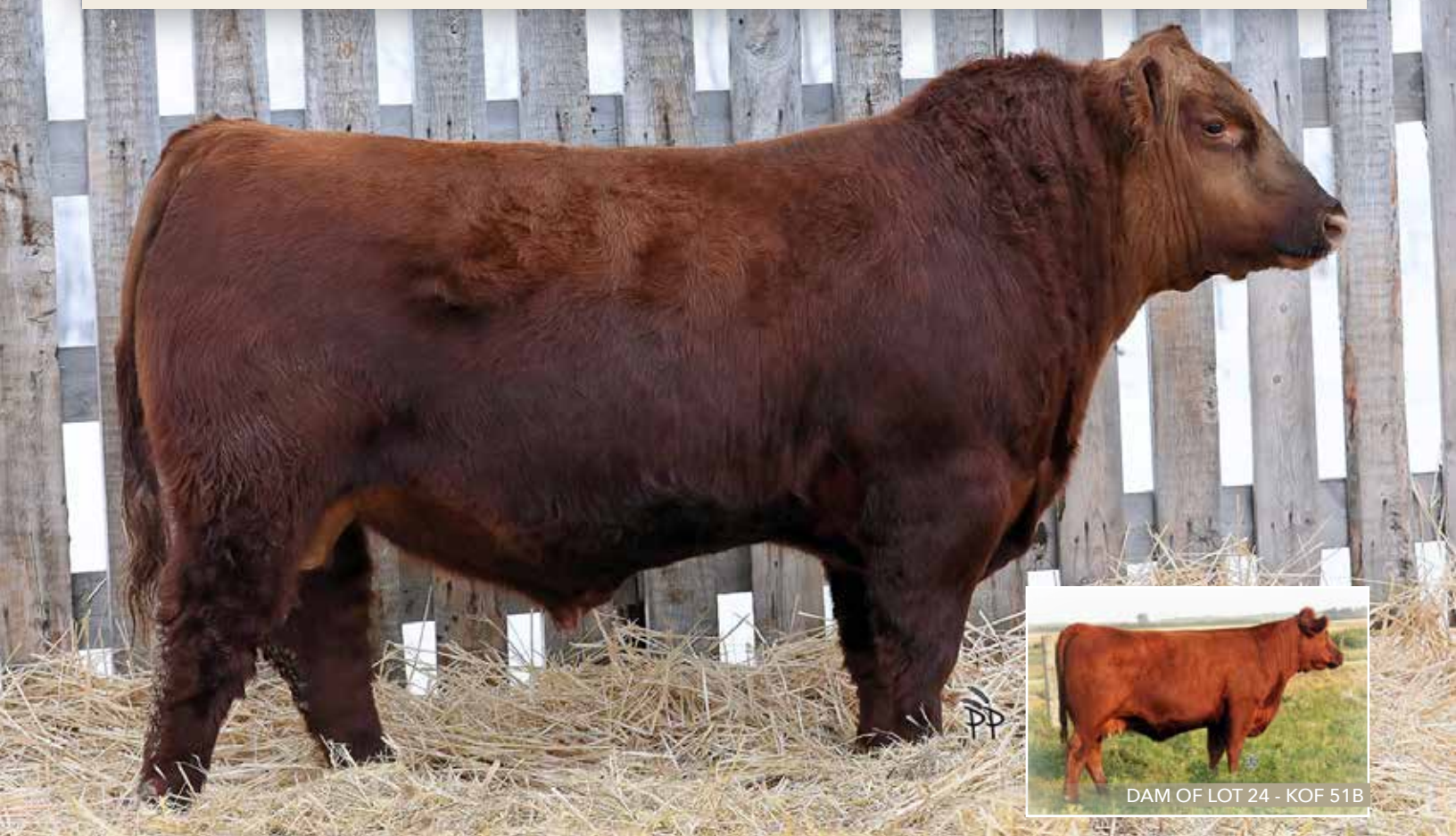
DAM OF LOT 24 - KOF 51B

These bulls are not leftovers, these bulls were planned to be in the sale with a little extra age. As you will notice sale day these bulls have a great disposition for being born out on grass. Here are bulls you can buy with confidence as there are some top genetics in them