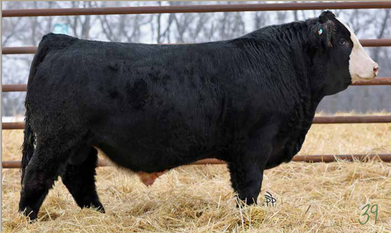
MAR MAC CASH 15F

TWIN BPG1241304 KOB 11F JAN/25/18 CE: ••