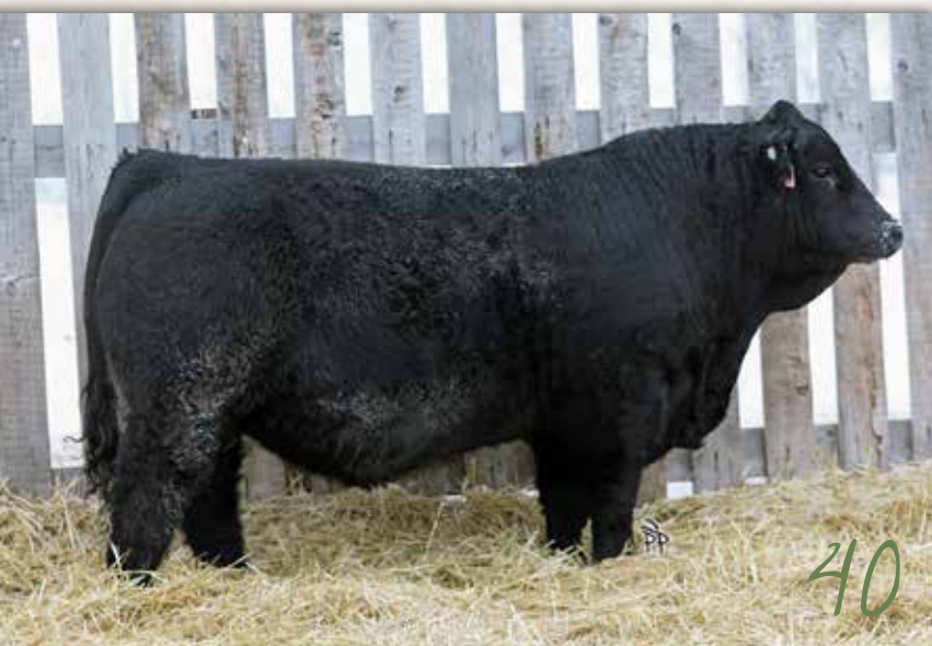
MAR MAC STRAIT WHISKEY 79F