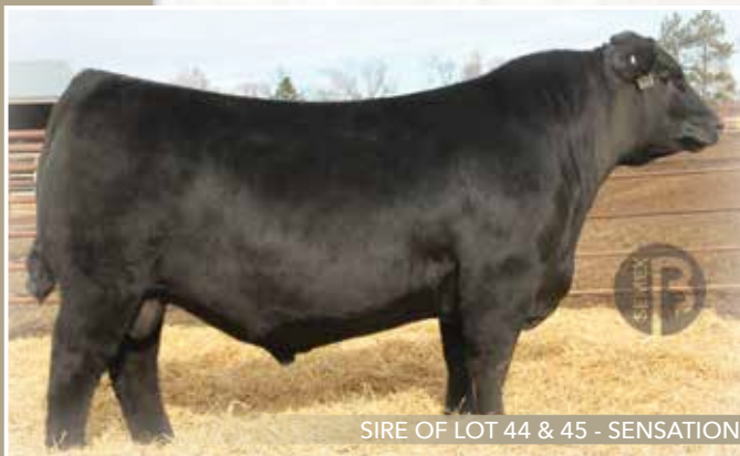
SIRE OF LOT 44 &amp; 45 - SENSATION

We wanted to add some outcross genetics to our herd with a sire that will add eye appeal, and performance. The reports are that the calves come small and grow fast making Sensation liked by purebred and commercial producers. This extremely fertile son grandson of Rito 707 of Ideal bred to our Brandi donor female 9T is a Final Answer female who has been a very productive female. Rito, Traveller 004, Final Answer and Fortune 425C wow now those are interesting genetics to build a program on. Brandi 9T is an elite cow in the Canadian Angus, see article on the page to the left.