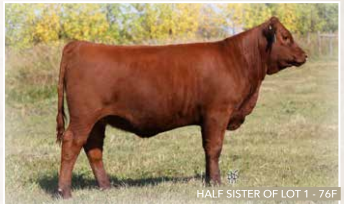
HALF SISTER OF LOT 1 - 76F