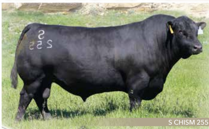
S CHISM 255