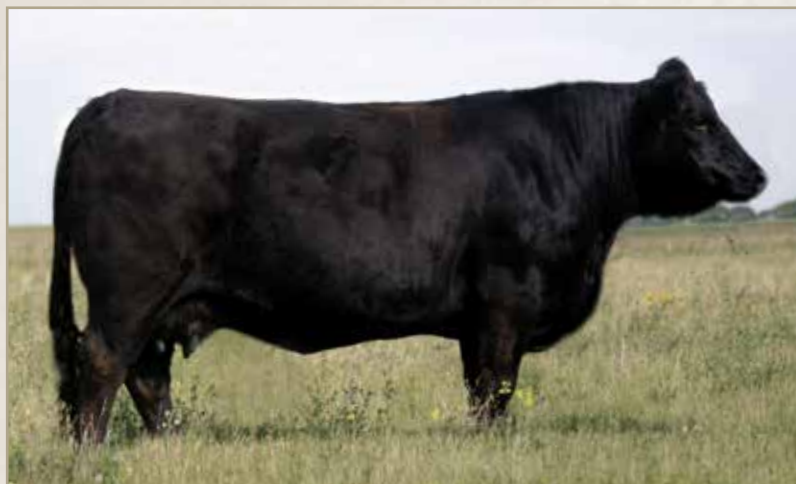
MAR MAC CARLI 14N

If you are looking for a thick, moderate framed bull from a cow with a picture perfect udder this bull is for you. 92F is a very smooth made blaze face bull from the Deb cow family,