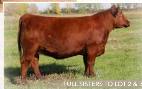
FULL SISTERS TO LOT 2 & 3