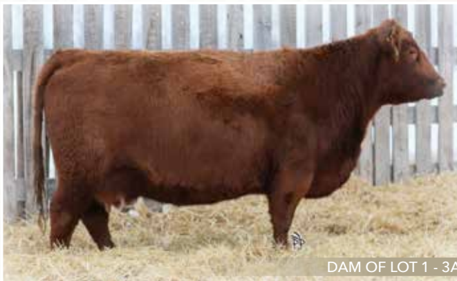
DAM OF LOT 1 - 3A

Mar Mac reserves the right to draw semen for in herd use only.