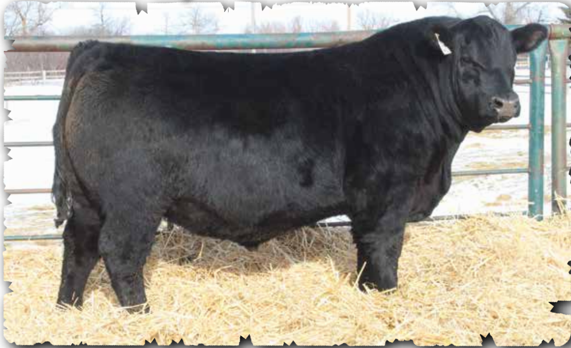
PEAK DOT BIG RIVER 224M - LOT 64