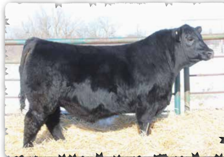
PEAK DOT GABLE 116M - LOT 37

>Recommended for heifers or cows >Husky made performance bull with extra muscle expression and body mass. >Top 1% for weaning and yearling weight EPDs. Top 2% for Heifer pregnancy. >Grandam is listed as an Elite Dam with CAA.