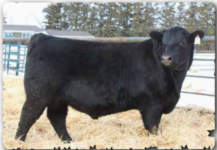
PEAK DOT BIG RIVER 150M - LOT 68

>Recommended for heifers >Weaning ratio 102. >A maternal brother was the top selling Belfast son to Skogen Livestock in last year sale. >Dam is an Ellingson Roughrider daughter with an excellent well attached udder and perfect teat size.