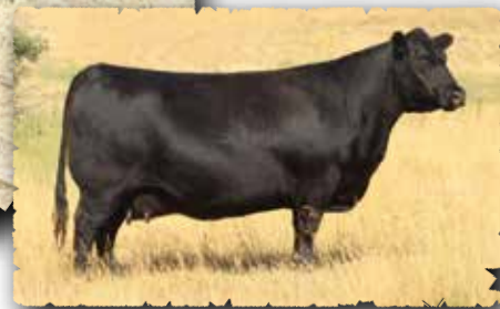
PEAK DOT PANSY 104D The dam of lot 102