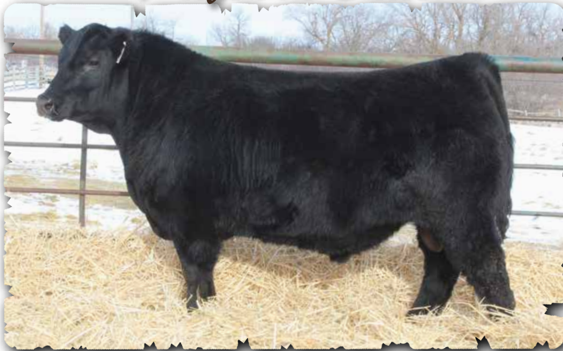
PEAK DOT PROFOUND 258M - LOT 85