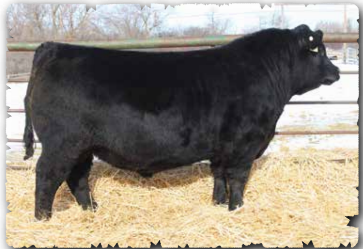
PEAK DOT BIG RIVER 142M - LOT 66

>Recommended for heifers or cows >Stylish, stout bull with balance and very good numbers across the board. >Weaning ratio 113. >Picture perfect dam has a quality udder and stunning phenotype.