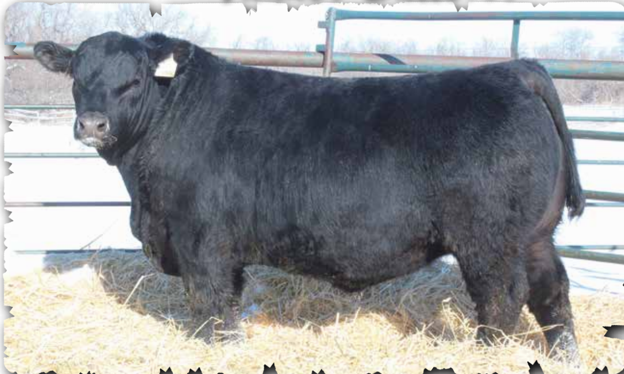
PEAK DOT TANKER 143M - LOT 148