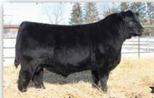
PEAK DOT BIG RIVER 139K