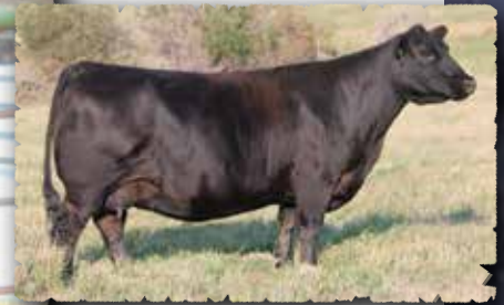
PEAK DOT ROSE 622C The grandam of lot 67