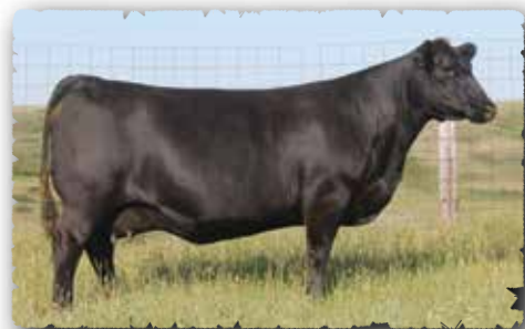
QUEEN OF PEAK DOT 936Y The grandam of lot 99

>Recommended for cows >A thick made, heavy set, stout bull with balance and good numbers across the board. Weaning ratio 108. >Dam has ideal body type and impeccable udder quality. Grandam is a donor with 49 progeny.