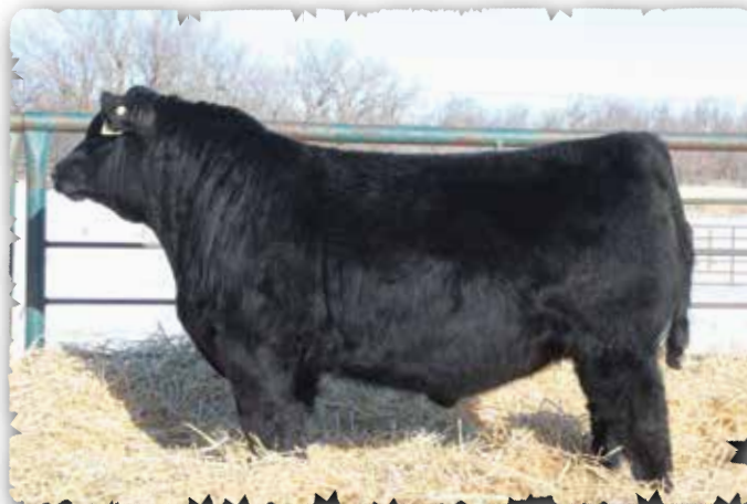
PEAK DOT TRUST 282M - LOT 22