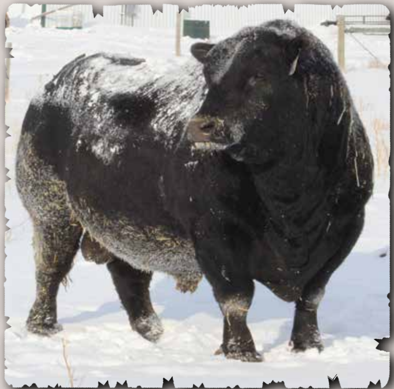
Peak Dot Trust 86G