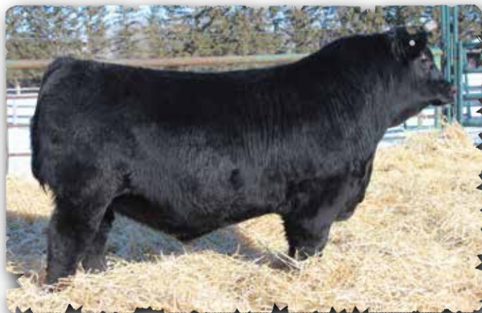
PEAK DOT TRUST 65M - LOT 6