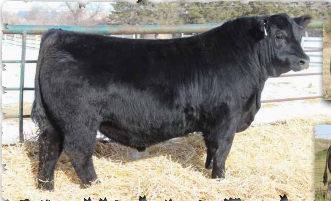
PEAK DOT BIG RIVER 439M - LOT 67