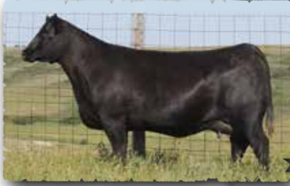
PEAK DOT QUEEN 303D The dam of lot 8