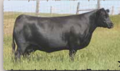
PEAK DOT DIVISION 86A