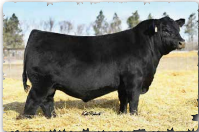
SAV MAGNUM 1335