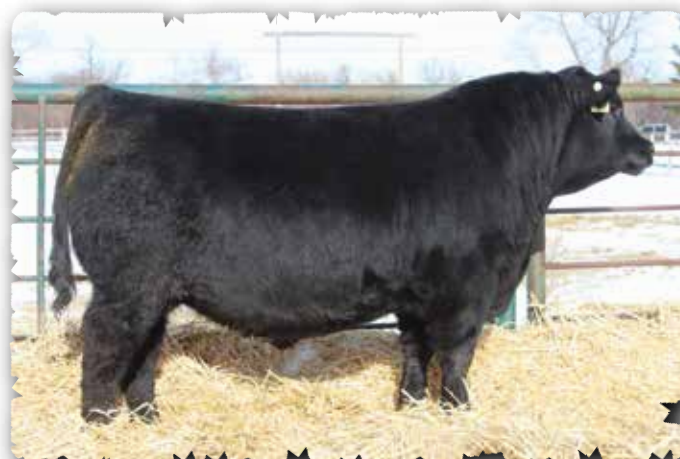
PEAK DOT PONDEROSA 118M - LOT 91

>Recommended for heifers. >A big upstanding Ponderosa bull with extra length and growth. Top 9% for REA. Top 6% for hoof EPD. >Maternal brother sold to R Plus and a maternal sister sold to Chris Buchanan.