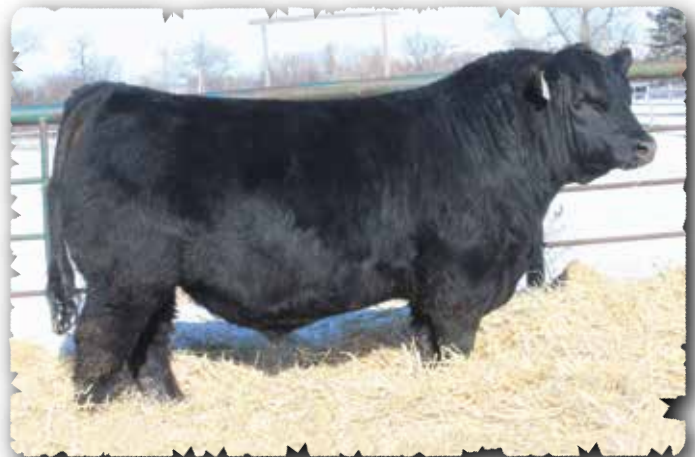
PEAK DOT TANKER 272M - LOT 147

>Recommended for heifers or cows >A heavy weight with lots of capacity, volume and thickness. Weaning ratio 124. >Ranks in the top 1% for weaning and yearling and carcass weight and REA EPDs.. >Dam is a moderate sized wide based . Her dam is a donor with 68 progeny.