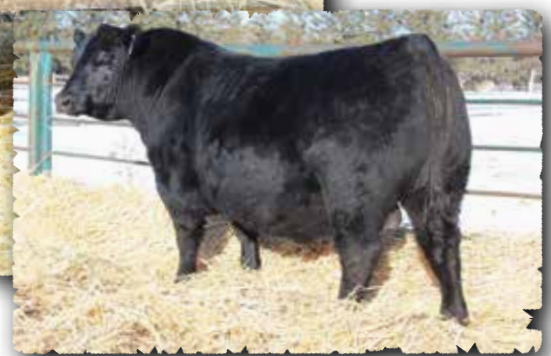
PEAK DOT GABLE 76M - LOT 31