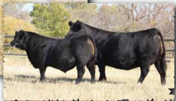
PEAK DOT TRUST 4M

Pictured here along side his dam this past fall