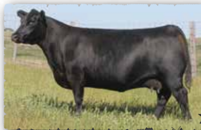
PEAK DOT LADY 417B

>Dam is a donor with 18 progeny. This is her natural calf.