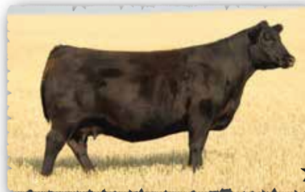
QUEEN OF PEAK DOT 75H The maternal grandam of lot 133

>Recommended for cows >Stout made, pounds heavy calf with a big appetite that really weighed up. 977lbs weaning weight. >Top 1% for weaning and yearling weight EPD. Top 1% for hoof EPDs. Weaning ratio 128. >Dam has breed leading EPDs. Grandam had the lead off Gable son in last years sale.