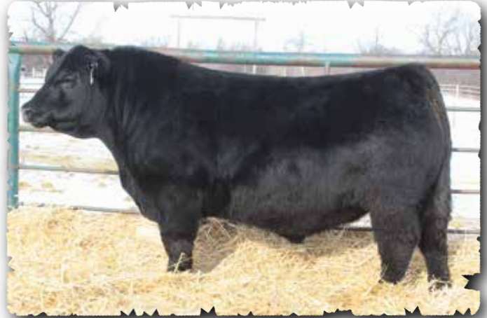
PEAK DOT PONDEROSA 81M - LOT 93

>Recommended for heifers >A sure-fire calving-ease bull with a thickness, muscle and style. Top 9% for REA. >Dam comes from a good cow family. Grandam is past embryo donor with 30 progeny. Several daughter retained in the herd.