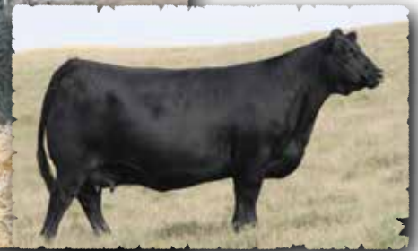
PEAK DOT PRIDE 13F The dam of lot 138