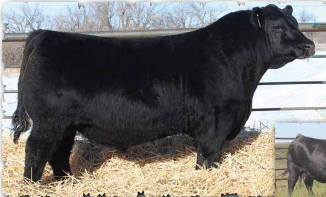
PEAK DOT TRUST 16M - LOT 5