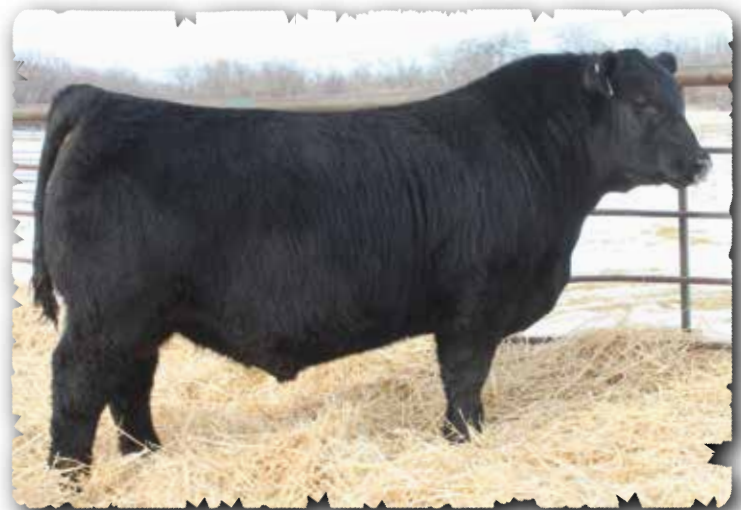
PEAK DOT BIG RIVER 387M - LOT 65

>Recommended for heifers or cows >A long, smooth patterned performance bull with thickness and fleshing ability. >Weaning ratio 112. >Fertile dam is listed as an Elite Dam with the CAA. Average weaning ratio on her last 6 calves is 105.