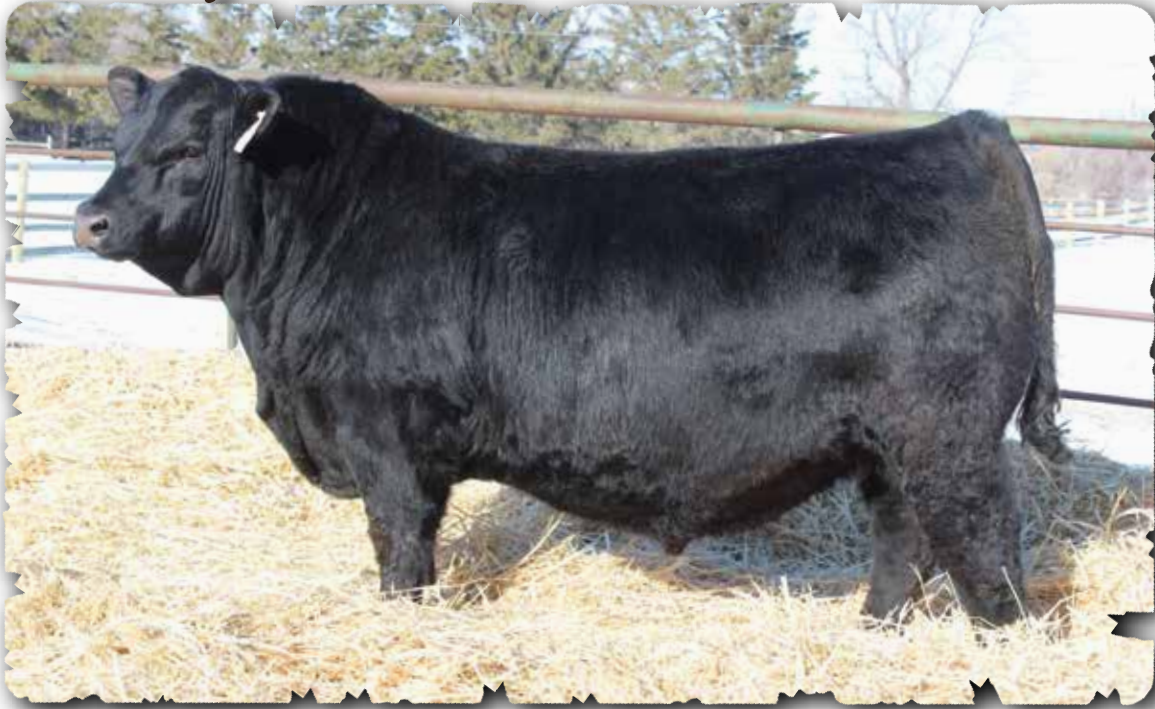
PEAK DOT GABLE 329M - LOT 32