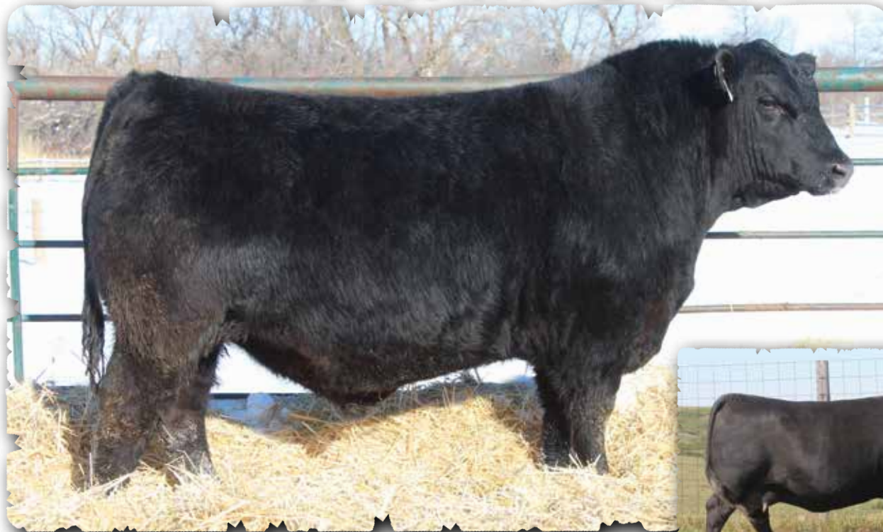
PEAK DOT TENDERLOIN 343M - LOT 170