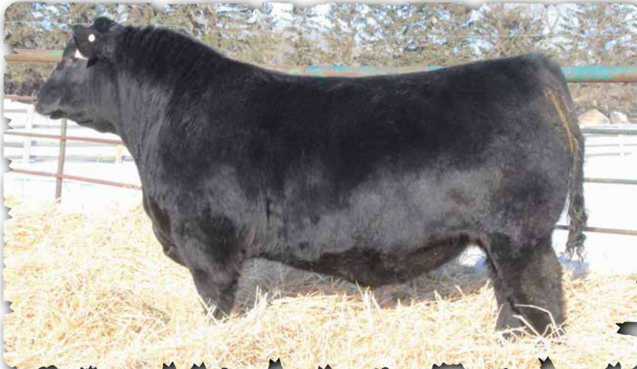
PEAK DOT TRUST 19M - LOT 3