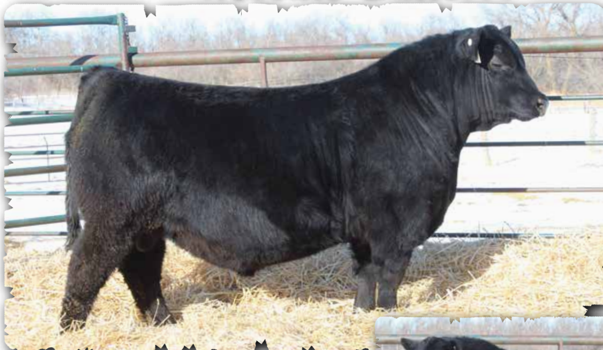
PEAK DOT MOSAIC 278M - LOT 100