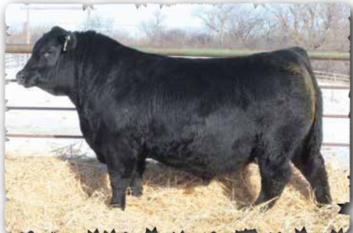
PEAK DOT GABLE 47M - LOT 34

>Recommended for heifers >Proud fronted, attractive bull with thickness, muscle volume and style. Weaning ratio 105. >Top 4% for heifer pregnancy EPD. Ranks in the top 20% for marbling. >Full sister active at Peak Dot.