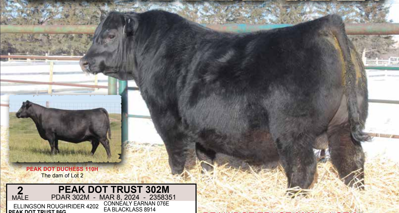
PEAK DOT DUCHESS 110H The dam of Lot 2