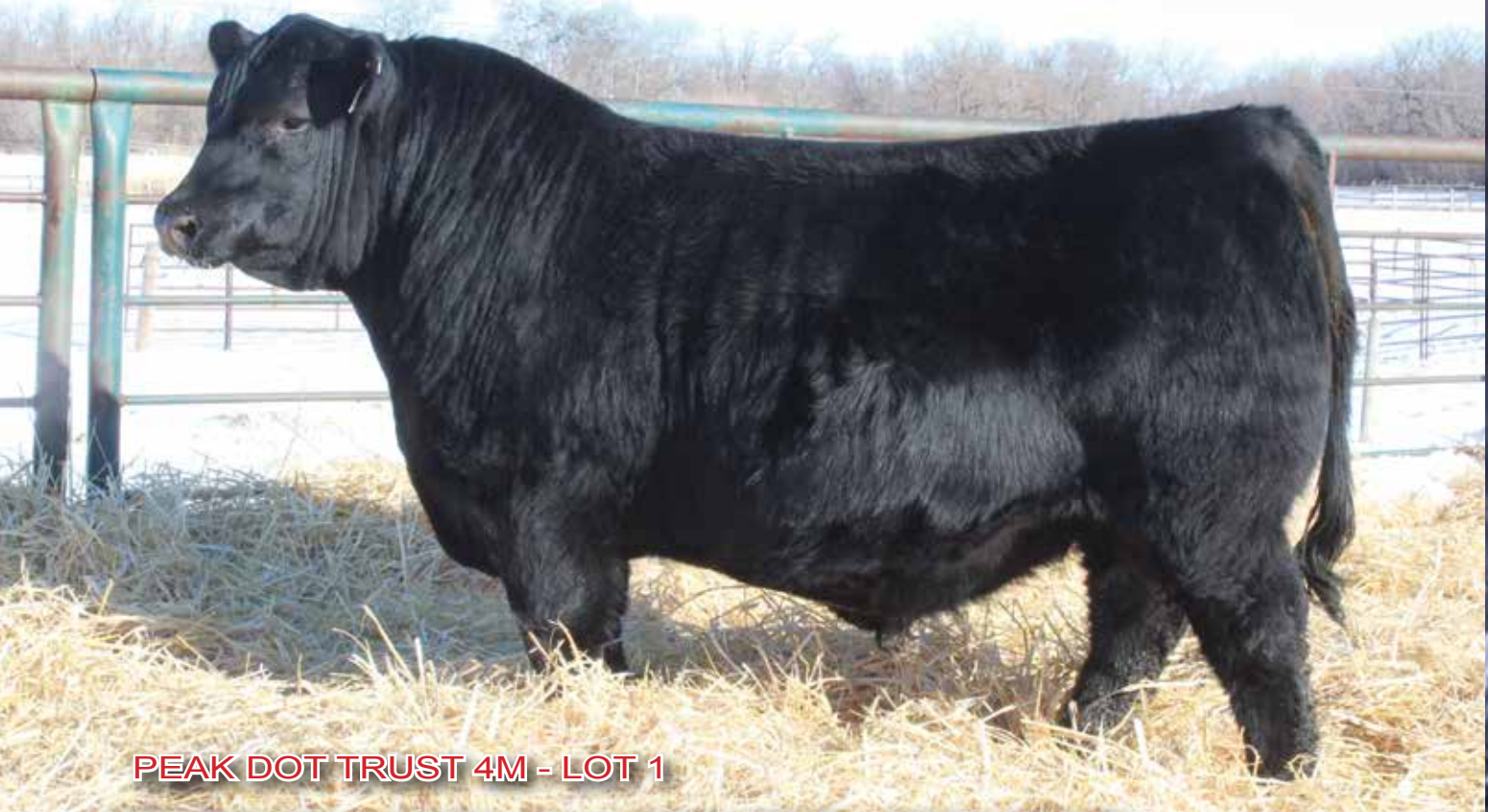
PEAK DOT TRUST 4M - LOT 1