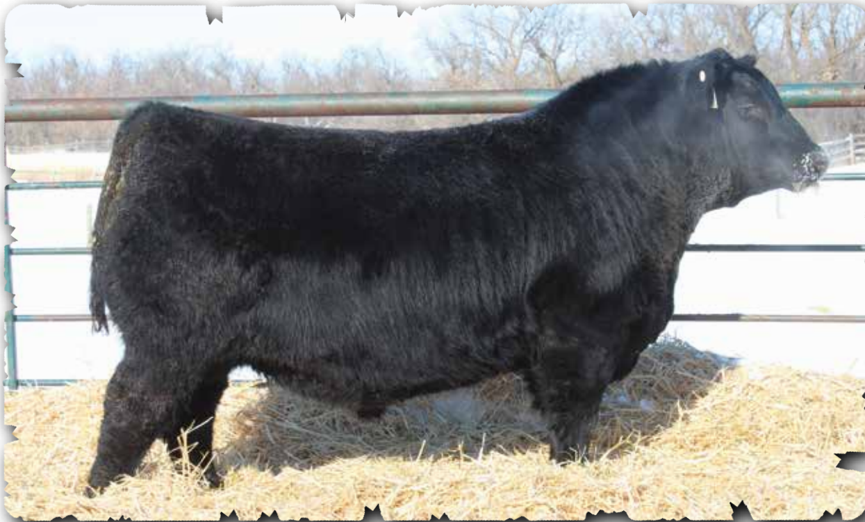
PEAK DOT COLOSSAL 411M - LOT 139