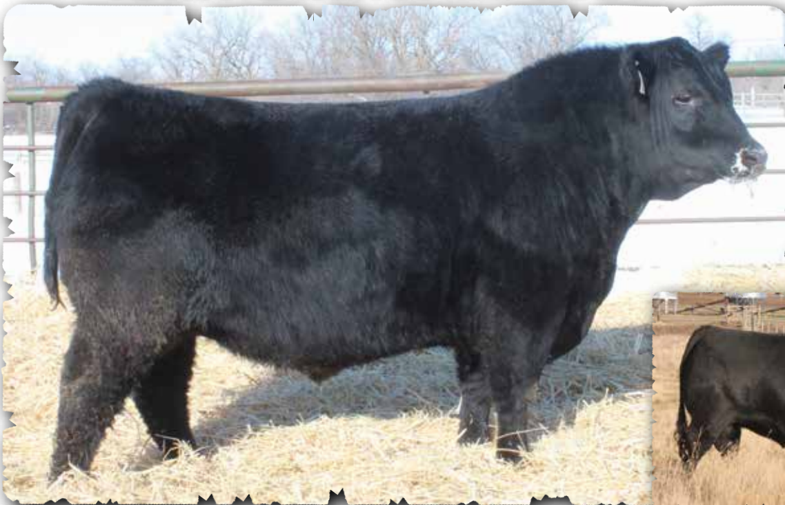
PEAK DOT EARNHARDT 119M - LOT 175