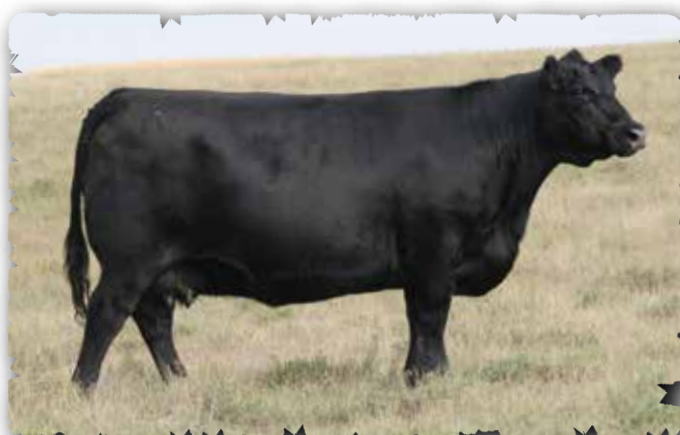
PEAK DOT MAYFLOWER 10D The dam of lots 100 and 101