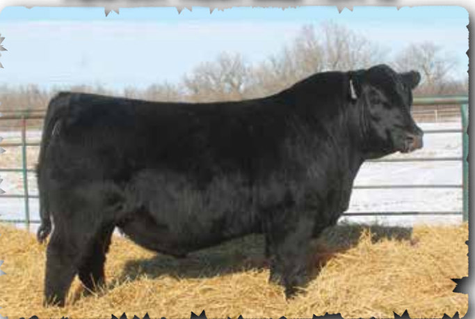
PEAK DOT TRUST 264M - LOT 20

>Recommended for cows >A thick made, heavy set, stout bull with balance and good numbers across the board. >Weaning ratio 110. Grandam is listed as an Elite Dam with CAA.