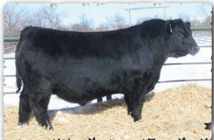
PEAK DOT GUARANTEE 291M - LOT 157

>Recommended for heifers >A fault free bull that is very solid in his structure. Top 3% of the breed for REA. >Well built Trust dam has a quality udder and abundant milk.