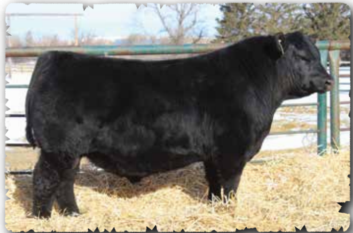
PEAK DOT ROUGHRIDER 464M - LOT 125