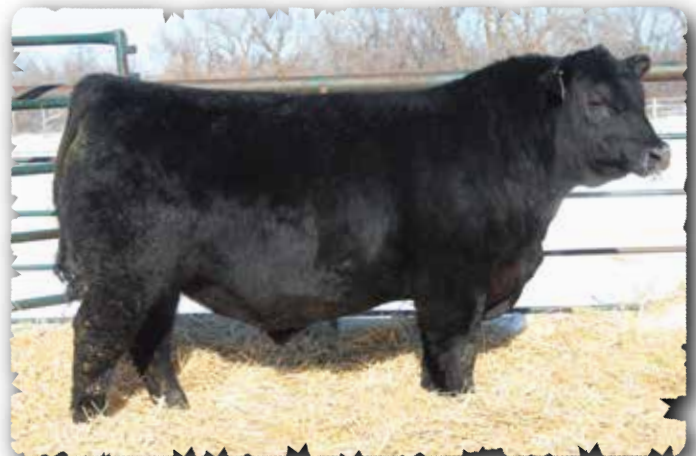
PEAK DOT TANKER 407M - LOT 152

>Recommended for heifers >A smooth patterned low birth weight bull with thickness and fleshing ability. >Weaning ratio 116 . Ranks in the top 5% for marbling. >Nice uddered Colossal dam. Brother sold to Wright Livestock.