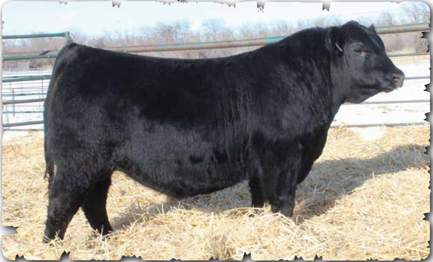
PEAK DOT MAGNUM 711M - LOT 30