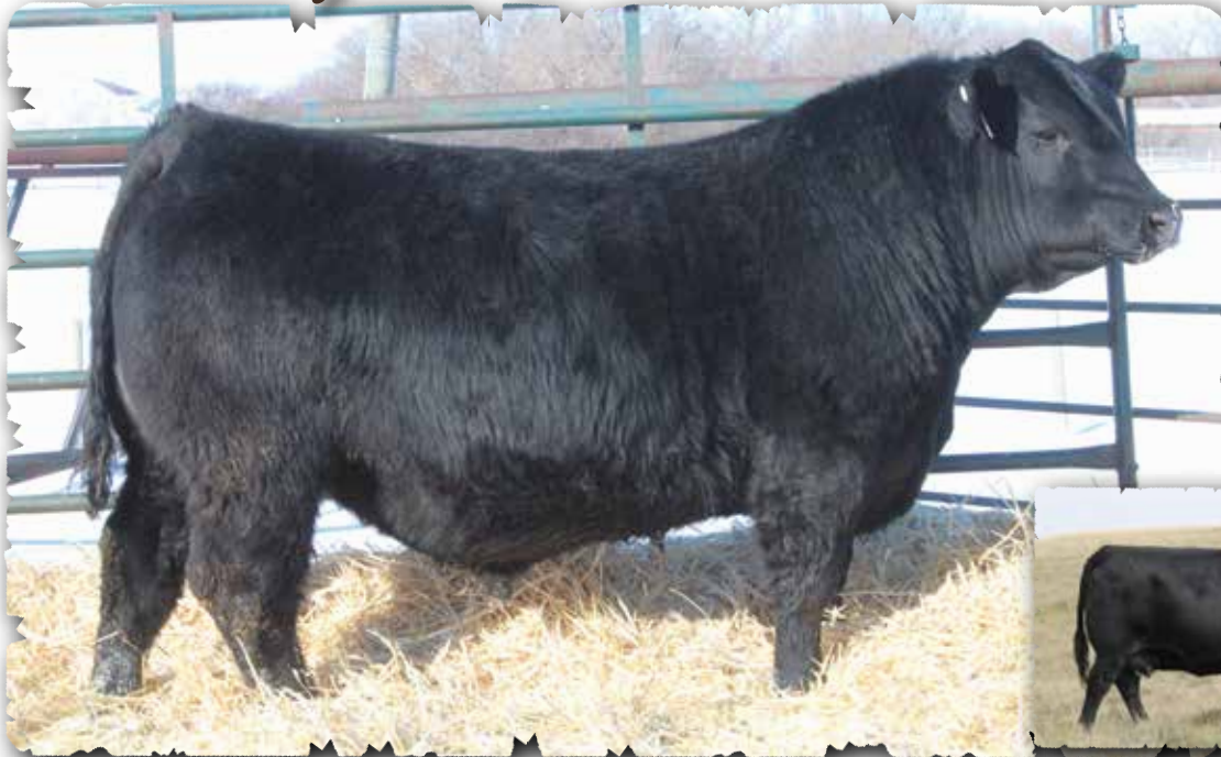
PEAK DOT GUARANTEE 245M - LOT 163