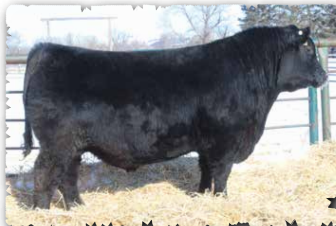
PEAK DOT TENDERLOIN 164M - LOT 168

>Recommended for heifers >Abundant body depth and thickness. Excellent number across the board. >Ranks in the top 5% for marbling and top 15% for heifer pregnancy rate EPD.