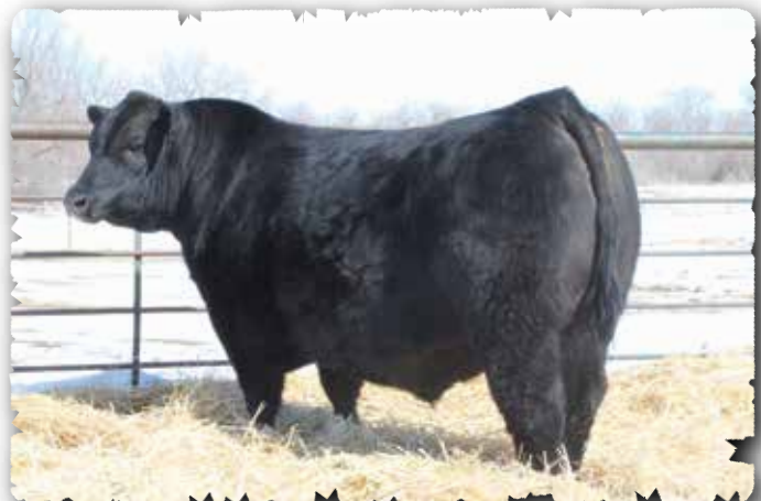
RAVEN RECTIFY J156 The sire of lots 58,59,60,61

>Recommended for heifers >Easy fleshing, attractive bull with thickness, muscle volume and style. >Top 6% for marbling EPD.