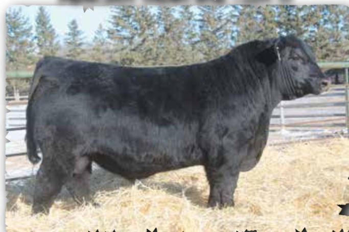
PEAK DOT TRUST 89M - LOT 18

>Recommended for heifers and cows >A thick made, heavy set, stout bull with balance and good growth numbers. >Grandam is listed as an Elite Dam with CAA.