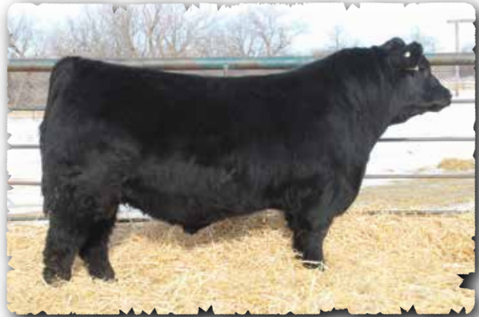
PEAK DOT ROUGHRIDER 274M - LOT 124