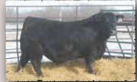
Peak Dot Profound 110J This maternal brother sold to Yarrow Creek..

Lancaster is a rugged built stock bull with true muscle definition, extra rib-shape and real performance. He was the featured lot 2 bull in the Spring 2020 Bull Sale selling to Glasman Farms for $56,000. His progeny display a nice pattern with body depth, fleshing ability and real muscle shape. His dam is a very well made SAV Eliminator 9105 daughter that ranks near the top for milk and marbling. She is also the dam of the $25,000 Peak Dot and Hillcrest Enterprises herdsire Peak Dot Seedstock 38F. Her son Peak Dot Profound 110J sold in the 2022 spring sale for $20,000 to Yarrow Creek.