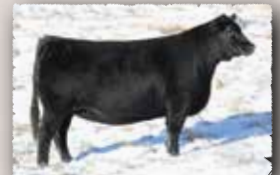
Peak Dot Lady 270G Purchased by Shawn Stadnyk for $10,000

Ellingson Roughrider is a bull we have been very impressed with from the first time we seen him. He sold for $70,000. He carries much body depth and offers as much base width and thickness as any sire we have ever used. He stands on four big, solid, stout legs and has excellent feet with lots of heal. His daughters are regarded as some of the best females Ellingsons and Peak Dot have ever raised. Roughriders dam and grandam are both embryo donors and two of the greatest contributors to the Ellingson cowherd today.