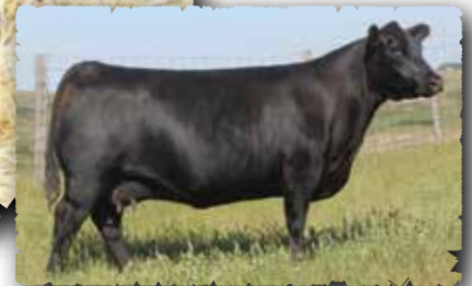
PEAK DOT LADY 417B The grandam of lot 84