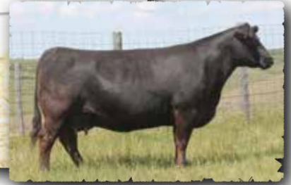
Peak Dot Rose 653Y