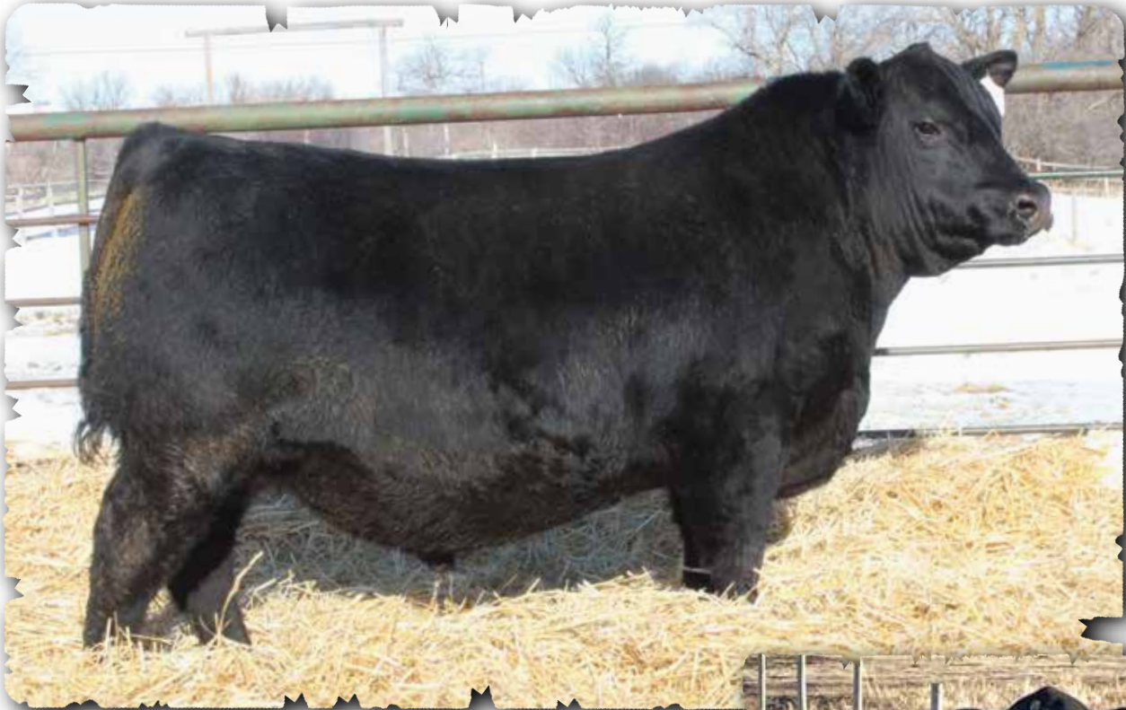
PEAK DOT RECTIFY 166M - LOT 58

Rectify is an exciting new herd sire at Peak Dot Ranch, he offers calving-ease and performance with outstanding maternal pedigree and bred in longevity. Rectify is a thick topped, deep sided, soft made, good headed and comes with great feet and excellent scrotal that the Sitz Stellar sons are know for. He weaned off at 845lbs and holds a $ Weaning index in the top 3% of the breed. His dam is phenotypically outstanding and was the pick of the 2021 Raven Angus herd selling to Simon Cattle Co. His productive grandam is 11 years old and looks like she will live and produce for another 11 years. His great grandam is a 13 year old Pathfinder at Raven Angus. We think the world of this young herd sire and he will be used heavily at Peak Dot again this year and in the years to come.