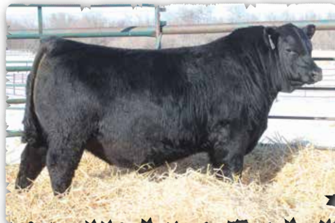
PEAK DOT GABLE 158M - LOT 42

>Recommended for heifers >Stout-rumped, big stifle bull with outstanding muscle expression. Weaning ratio 108. >Very Productive dam is also the mother of Herd Sire Peak Dot Rider Nation.