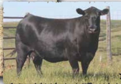
PEAK DOT MIA 247C The grandam of lot 7