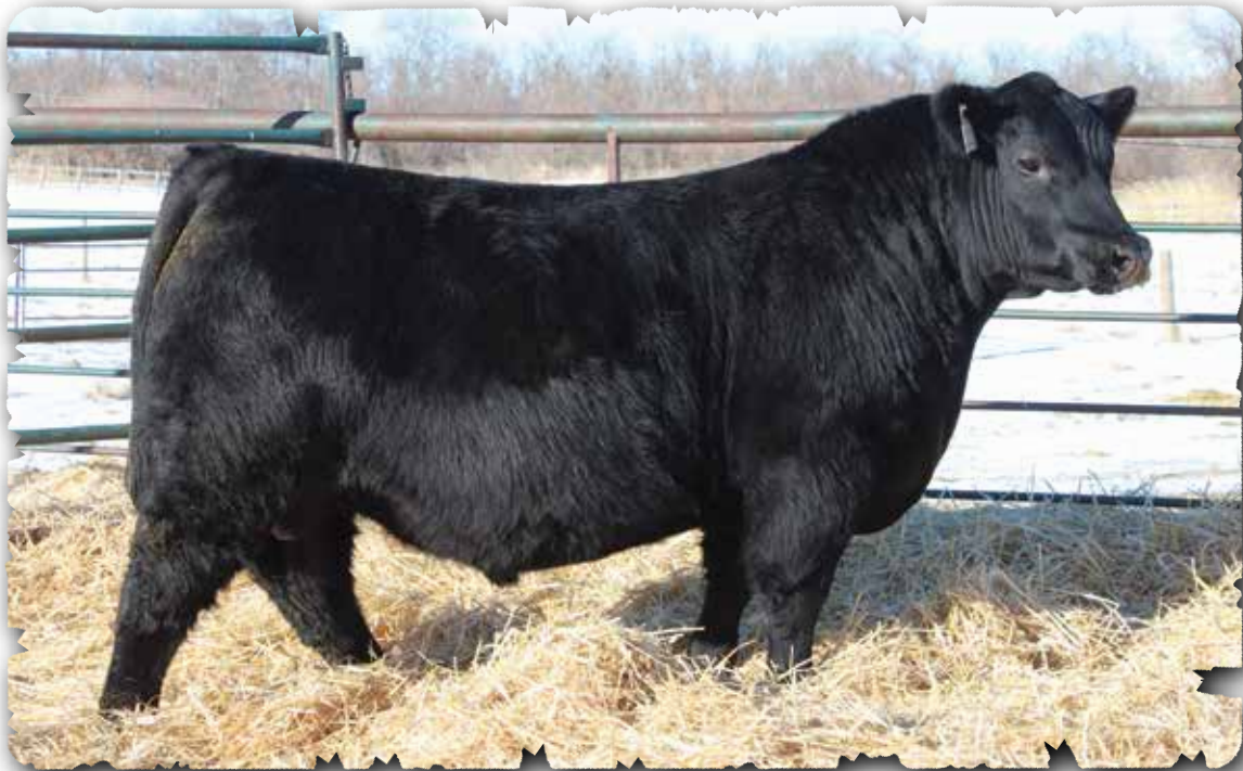
PEAK DOT MOSAIC 449M - LOT 95

Peak Dot Mosaic was the $60,000 sale feature from the 2020 Peak Dot Ranch Spring bull sale selling to SSS Cattle Co. He offers extra natural width and depth of body in a structurally sound package. He is backed by some of the best cows on the ranch with two consecutive generations of donors. Mosaic sons posted impressive weaning weights with tremendous depth of body, width and ideal growth curves for real-world cattle producers.