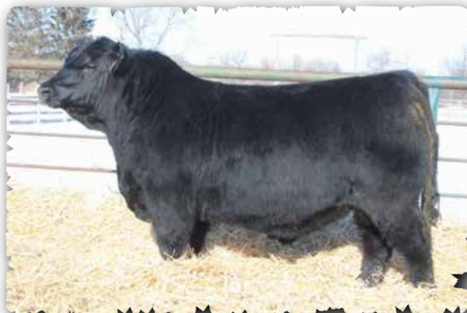
PEAK DOT TRUST 50M - LOT 12