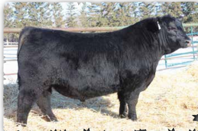
PEAK DOT GABLE 99M - LOT 43

>Recommended for heifers or cows >Exceptional power and performance. Very good maternal genetics. Weaning ratio of 111. >Top 1% for weaning and yearling weight EPD. >Grandam is an Elite dam with CAA. She is also the mother of Alta Genetics sire Peak Dot Liberty.