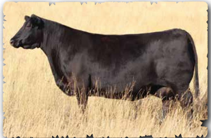
PEAK DOT BARDOLIA 297H The dam of lot 118

>A Lancaster son with ideal phenotype and superb structure. >Ranks in the top 20% for marbling. Top 3% for Hoof angle EPD.