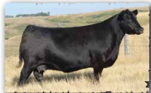
PEAK DOT LADY 51E The grandam of lot 95