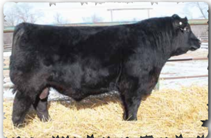
PEAK DOT TANKER 155M - LOT 146

>Recommended for heifers >A smooth patterned low birth weight bull with a big spread from birth weight to weaning weight. >Weaning ratio 118. Ranks in the top 15% for REA and marbling. >Nice uddered Colossal dam ranks in the top 15% for milk EPD.