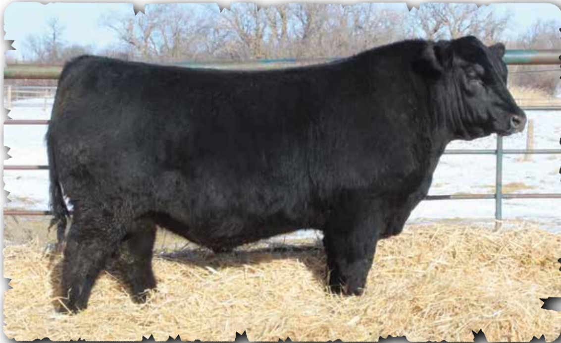
PEAK DOT ROUGHRIDER 320M - LOT 121

Ellingson Roughrider is a bull we have been very impressed with from the first time we seen him. He sold for $70,000. He carries much body depth and offers as much base width and thickness as any sire we have ever used. He stands on four big, solid, stout legs and has excellent feet with lots of heal. His daughters are regarded as some of the best females Ellingsons and Peak Dot have ever raised. Roughriders dam and grandam are both embryo donors and two of the greatest contributors to the Ellingson cowherd today.