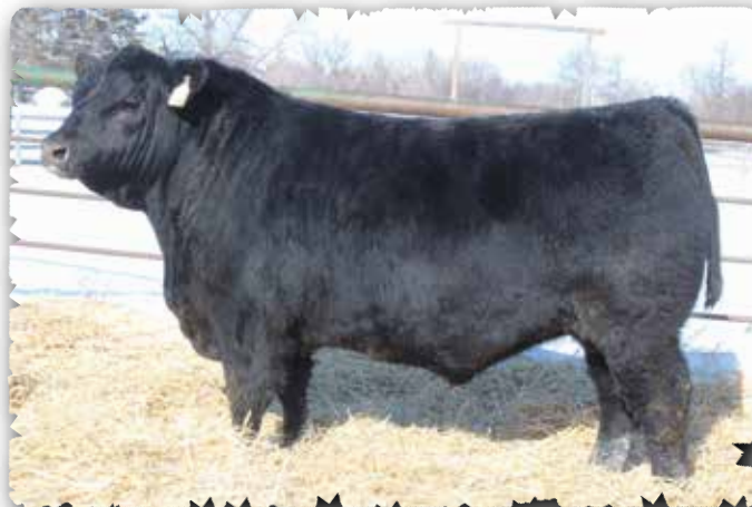
PEAK DOT TANKER 311M - LOT 149

>Recommended for Heifers >You will want to look this one up sale day. Muscle, power and pounds with structural integrity. >Top 1% for weaning, yearling and carcass weight EPDs. Top 2% for REA. Weaning ratio 115.