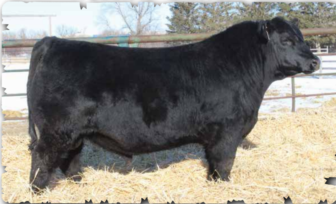
PEAK DOT MOSAIC 299M - LOT 108