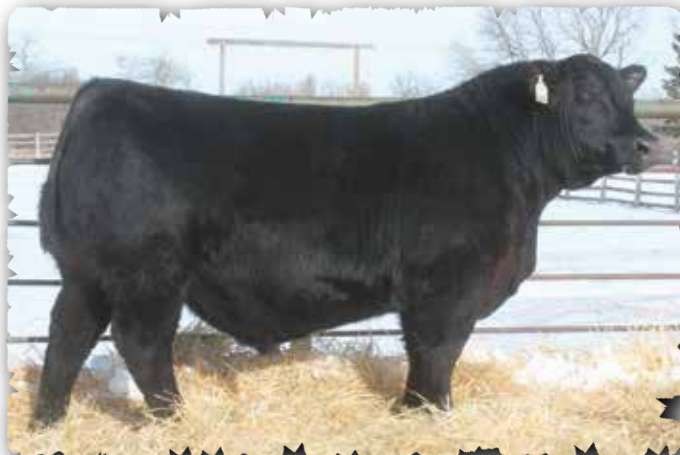
PEAK DOT MOSAIC 68M - LOT 109

>Recommended for Cows >Muscle, power and pounds with structural integrity. Weaning ratio 102. >Perfectly made dam with a quality udder.