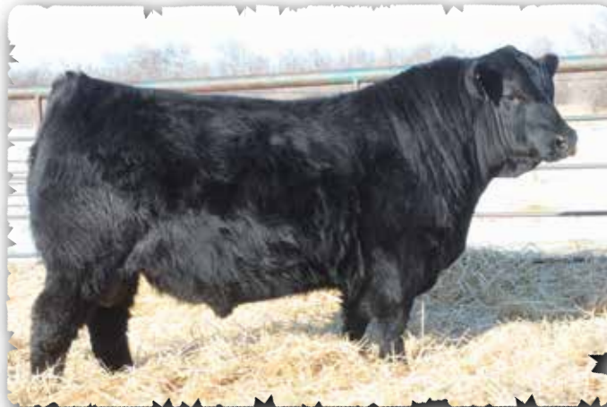
PEAK DOT MOSAIC 185M - LOT 104

>Recommended for heifers >A big performance bull with size, thickness, muscle, volume and natural fleshing-ability. Weaning ratio 107. >Fertile grandam is listed as an Elite Dam with the CAA