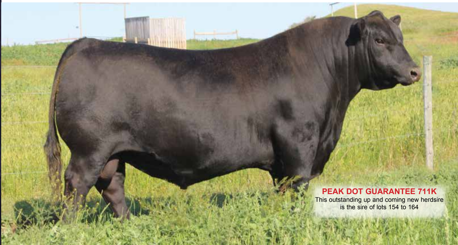
PEAK DOT GUARANTEE 711K This outstanding up and coming new herdsire is the sire of lots 154 to 164

>Recommended for heifers >A stylish, well muscled low birth weight bull that will leave nice looking daughters. Weaning ratio 107. >Moderate framed Roughrider 122G daughter did a good job on this her first calf.