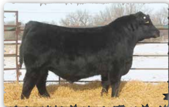
PEAK DOT PROFOUND 14H

Maternal brother to lot 30 purchased by Dale Zukowski