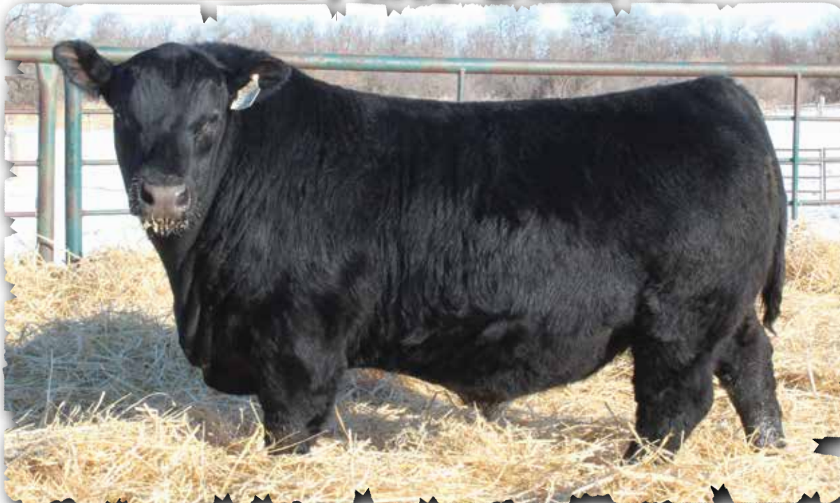
PEAK DOT TRUST 57M - LOT 11