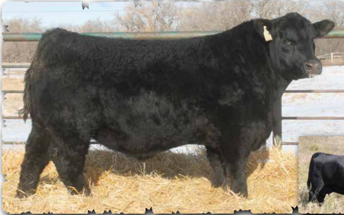
PEAK DOT MOSAIC 337M - LOT 105