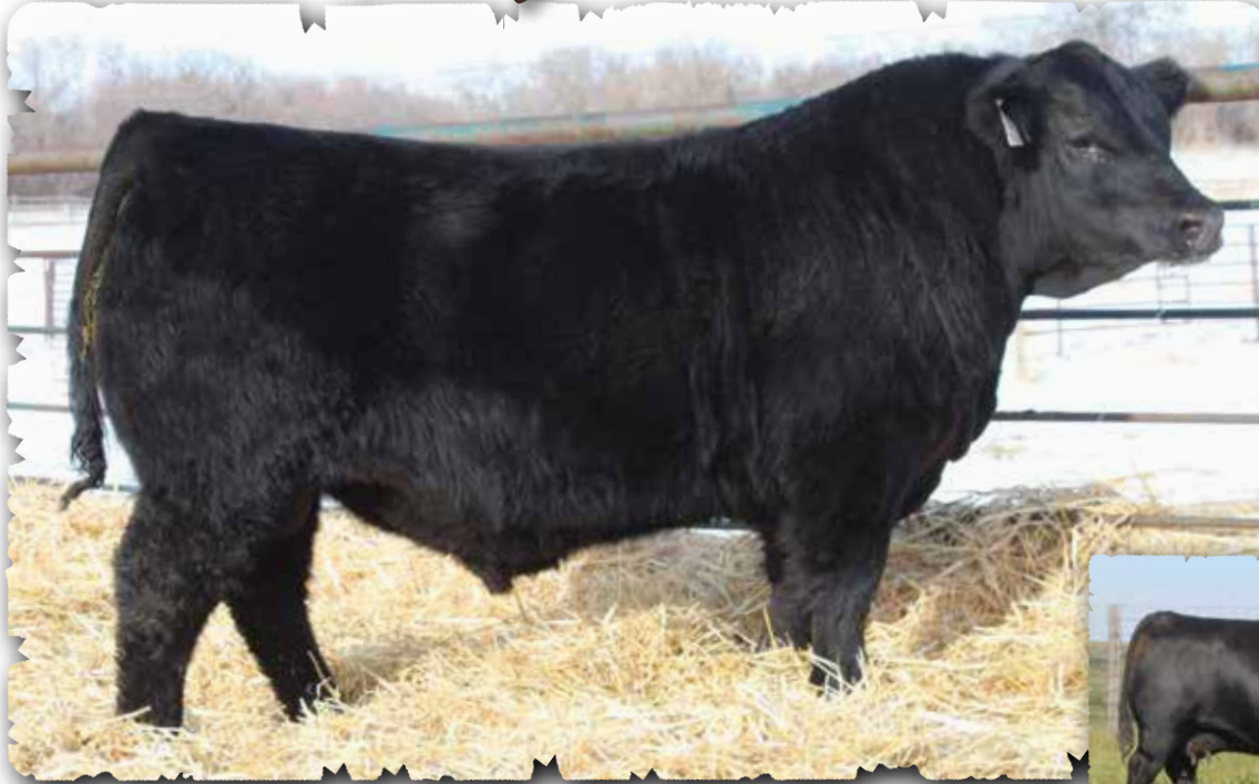
PEAK DOT PROFOUND 242M - LOT 82