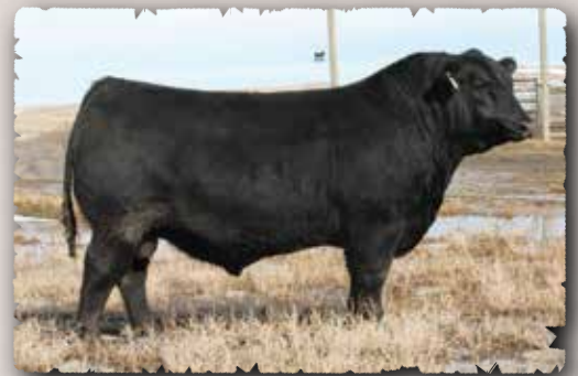
Peak Dot Bunker 407L $50,000 son owned by Parkview and D&N Livestock

This power bull has peaked several peoples interest that seen him and his calves. His name is Peak Dot Belfast 2099H. He is a Colossal son that offers calving-ease with more frame and performance. His easy fleshing, fertile Element dam has an excellent udder and very good feet. She has excellent milk and her last 5 calves had an average weaning ratio of 108. Belfast sons were a real feature sire group in last years sale and certainly will be a feature sire group again in 2025. His daughters are among some of our favorites in the replacement pen.