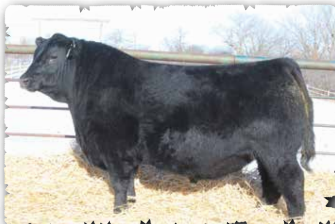
PEAK DOT TRUST 64M - LOT 13