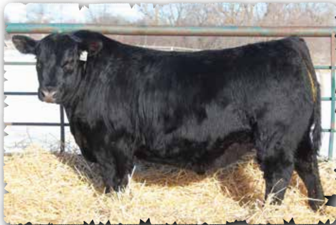
PEAK DOT GABLE 484M - LOT 50

>Recommended for heifers >A well bred calving-ease bull with the combination of Gable with Connealy Glory. >Maternal brother sold to Gilbert Cattle Co.