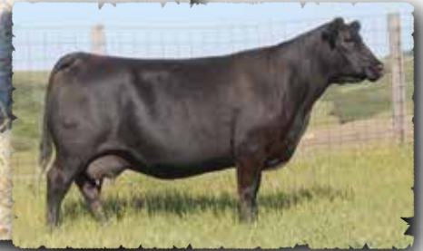
PEAK DOT LADY LAWN 551B The dam of lot 137