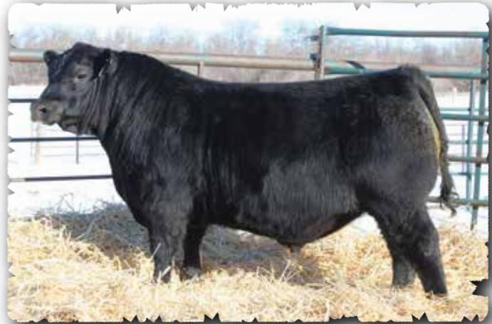
PEAK DOT TRUST 294M - LOT 15

>Recommended for heifers >A nice headed bull with volume and thickness. Weaning ratio 107. >Dam is a stout bodied, deep made, productive looking Colossal daughter.