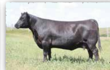
PEAK DOT LADY BARBARA 453C The dam of lot 20