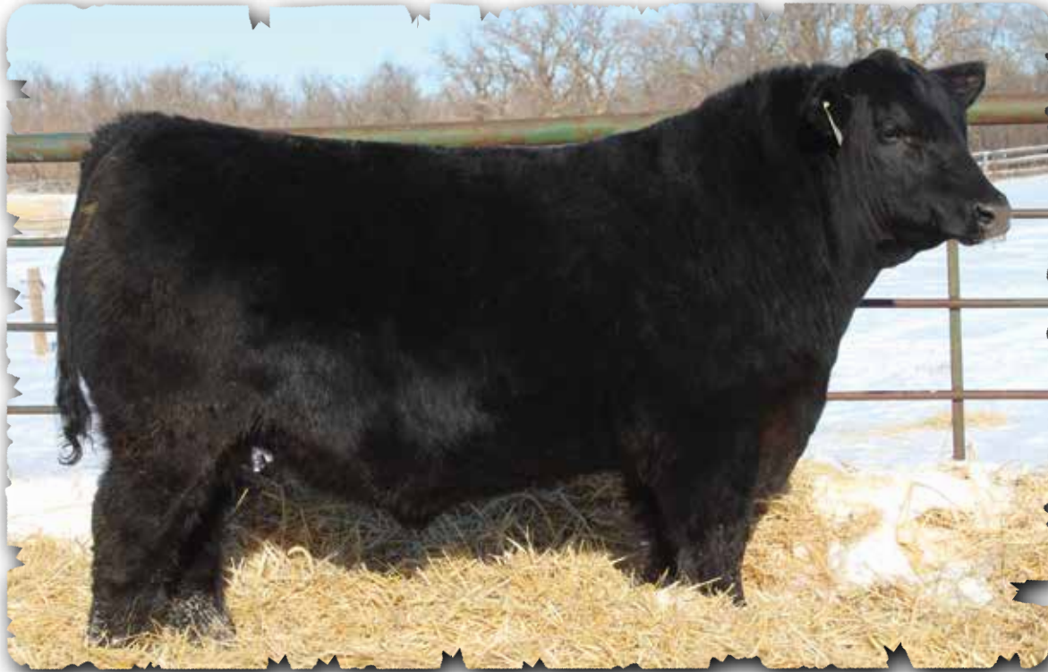
PEAK DOT PIONEER 376M - LOT 176

Pioneer 2220E is a powerhouse bull with extra length, muscle and frame along with large scrotal size. He consistently sires high quality progeny that have made the Pioneer line of cattle so popular and well received over the years.