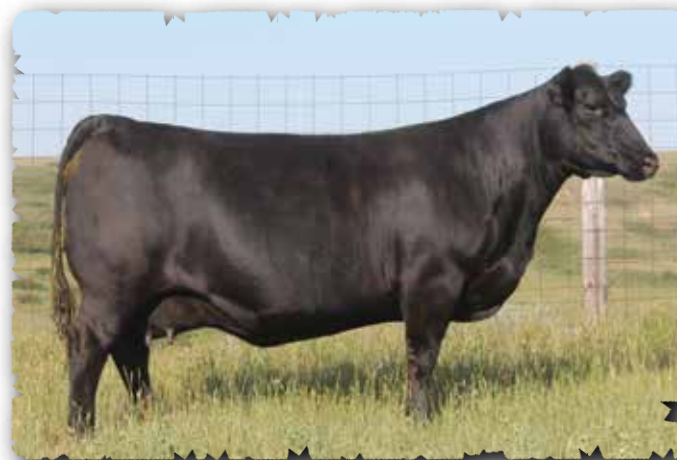
QUEEN OF PEAK DOT 936Y The maternal grandam of lot 172

>Recommended for heifers or cows >A long, smooth patterned performance bull with thickness and fleshing ability. Weaning ratio 108 >Grandam is a donor with 37 progeny.