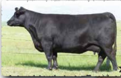
LADY OF PEAK DOT 402U The grandam of lot 9