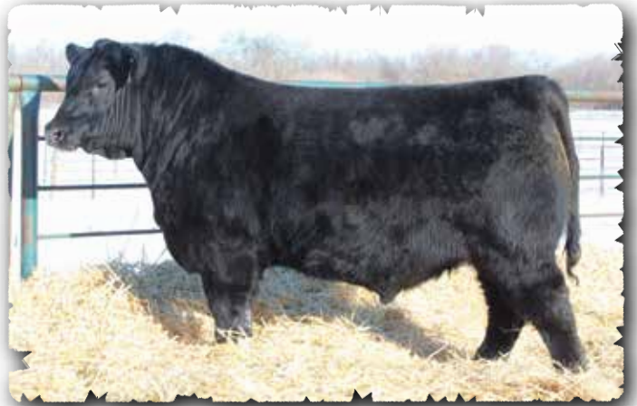
PEAK DOT TRUST 20M - LOT 10

>Recommended for heifers or cows >Plenty of body capacity and thickness in this good long bodied bull. Weaning ratio of 112. >Dam has top ranking hoof EPDs. Grandam is a popular donor with 72 progeny.