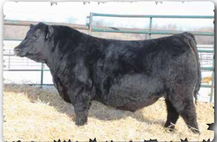
PEAK DOT GABLE 98M - LOT 45

>Recommended for heifers >A superior calving ease bull with bred in maternal value. >Dam has top ranking hoof EPDs and a quality udder.