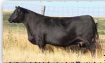
PEAK DOT PANSY 876G The dam of lot 73