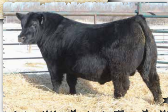
PEAK DOT MOSAIC 278M - LOT 100