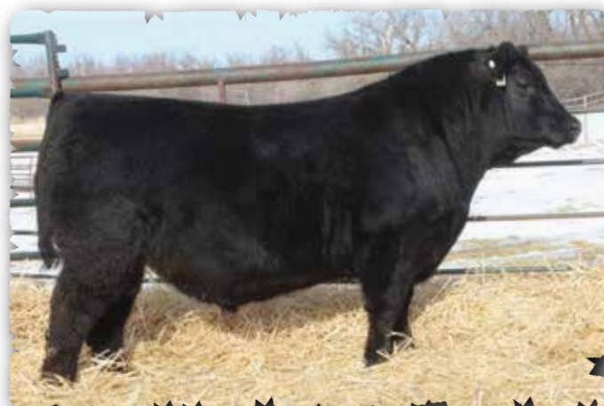
PEAK DOT MOSAIC 253M - LOT 112

>Recommended for heifers. >An eye-catching individual with performance and stoutness that comes recommended for heifers. >Top 4% for REA.