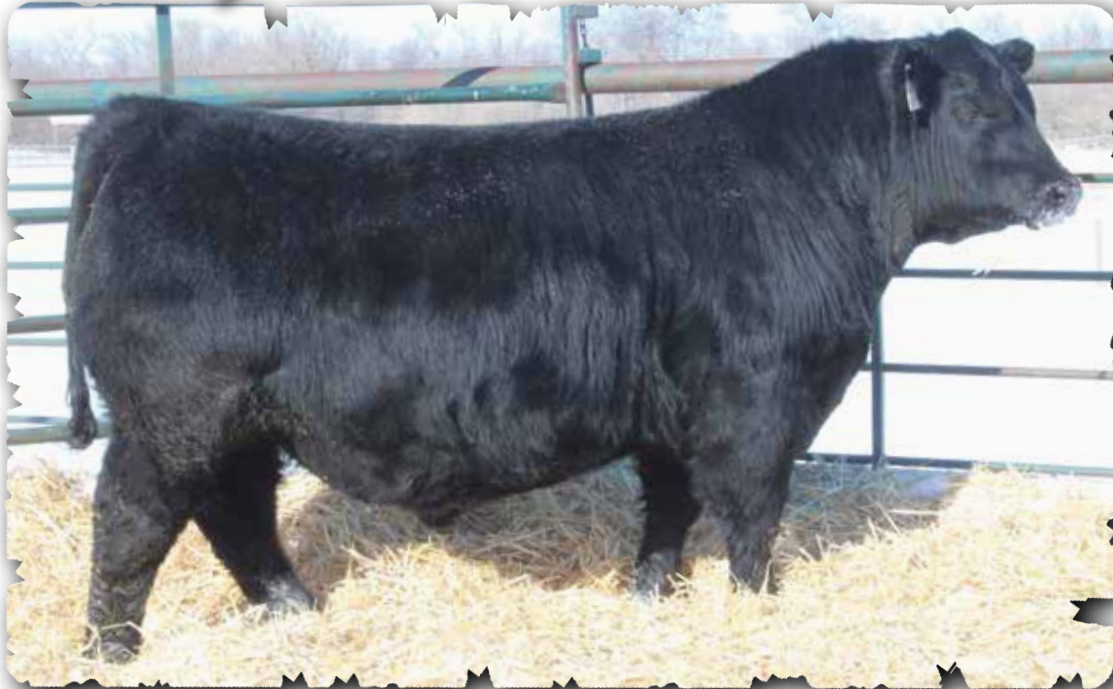
PEAK DOT GUARANTEE 317M - LOT 155