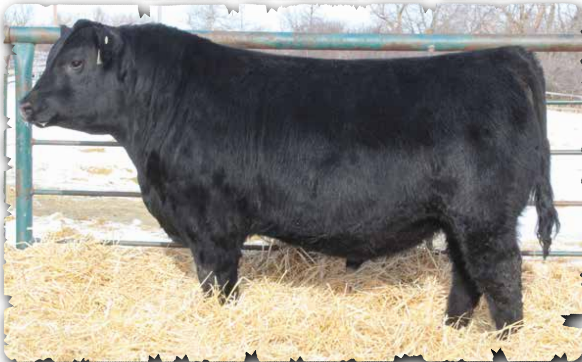
PEAK DOT PONDEROSA 139M - LOT 89