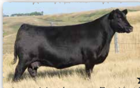
PEAK DOT LADY 51E The dam of lot 79