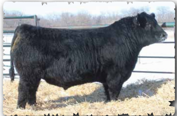
PEAK DOT BELFAST 170M - LOT 131

>Recommended for heifers. >Loaded with shape, substance and style. Weaning ratio of 100. >Ranks in the top 4% for scrotal and top 5% for hoof claw EPDS. >Well built Roughrider dam has a quality udder and abundant milk.