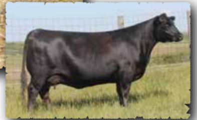
PEAK DOT LADY 10C The dam of lot 47