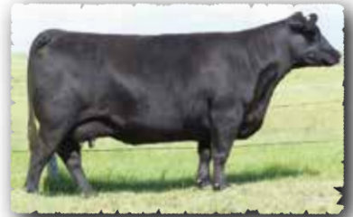
LADY OF PEAK DOT 402U The great grandam of lot 47

>Recommended for heifers or cows >A bull that reads well on paper and also is a good one when you see him in person.. >Weaning ratio 102. >Deep bodied dam has been a consistent producer.