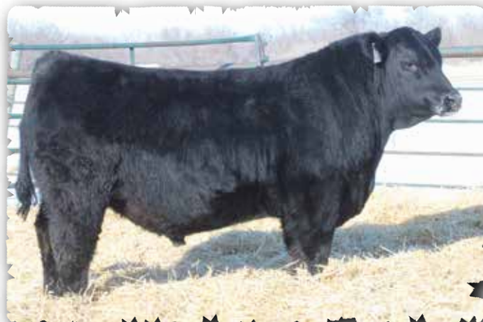
PEAK DOT PIONEER 247M - LOT 180

>Recommended for cows >Exceptional power and performance. Very good maternal genetics. Weaning ratio of 111. >Top 20% for REA. Dam is a bigger broody Rave daughter.