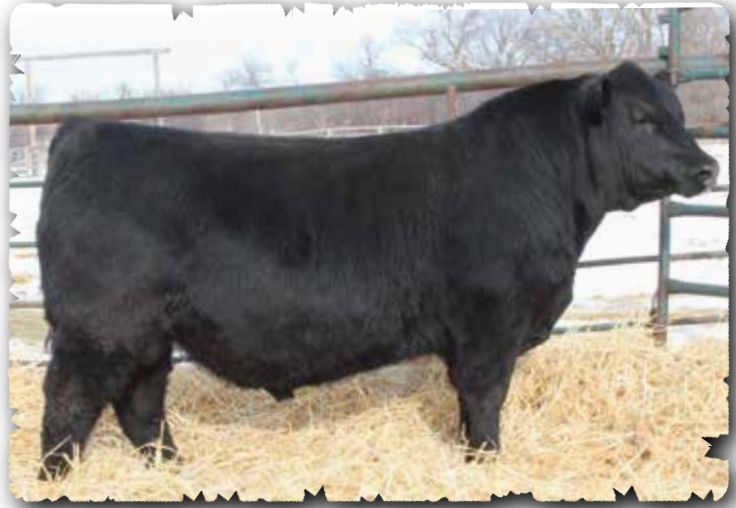
PEAK DOT BIG RIVER 416M - LOT 69

>Recommended for heifers >Well built calving ease bull with solid performance and functional pedigree. >Two of my favorite cows in this bulls pedigree with the Lady 16D and Lady 287B. >Fertile dam is listed as an Elite Dam with the CAA.