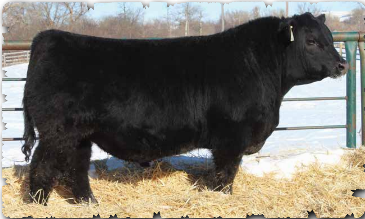
PEAK DOT TANKER 148M - LOT 144

Tanker is the $43,000 top selling from Lau Angus Valley to Peak Dot and Semex. This massive bodied bull had a yearling scan weight of 1602lbs and a 42.5 scrotal He combines top ranking EPDs, phenotype, muscle, capacity and muscle with fertility and performance. Very impressed with the feet on this bull. His dam is backed by two generations of pathfinders.