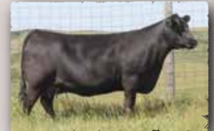
PEAK DOT LADY 626A The maternal grandam of Mosaic

Peak Dot Mosaic was the $60,000 sale feature from the 2020 Peak Dot Ranch Spring bull sale selling to SSS Cattle Co. He offers extra natural width and depth of body in a structurally sound package. He is backed by some of the best cows on the ranch with two consecutive generations of donors. Mosaic sons posted impressive weaning weights with tremendous depth of body, width and ideal growth curves for real-world cattle producers.