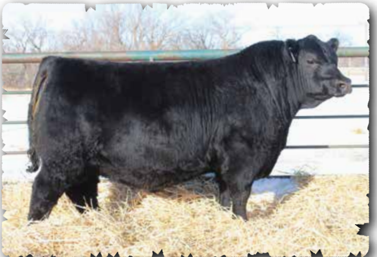
PEAK DOT GABLE 54M - LOT 40

>Recommended for heifers >Stylish, stout bull with balance and very good numbers across the board. >Young Big River daughter did and excellent job with this being her first calf.