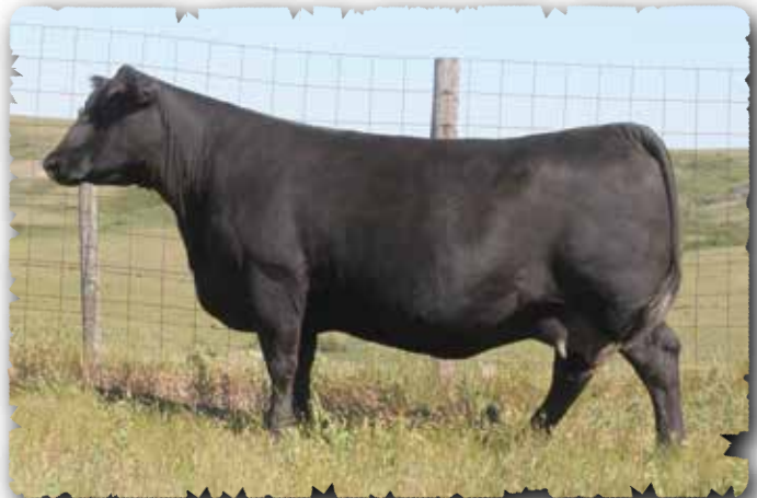
PEAK DOT BARBARA 483A The grandam of lot 86

>Recommended for heifers or cows. >A good one from a great cow. Stout-rumped and thick-quartered with plenty of style. >Grandam is a donor with 37 progeny and multiple past sale toppers.