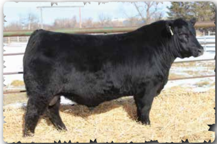
PEAK DOT ROUGHRIDER 338M - LOT 122