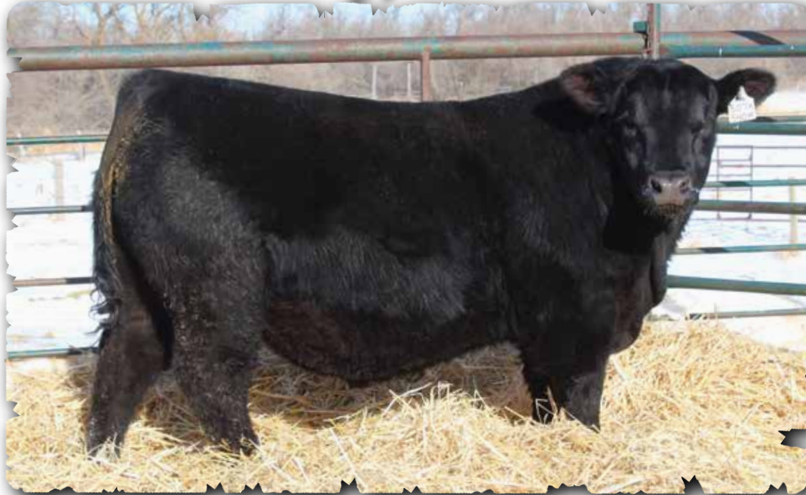
PEAK DOT RECTIFY 540M - LOT 59