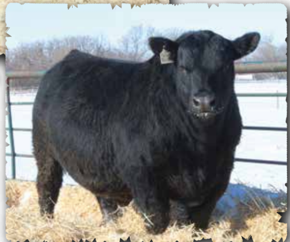
PEAK DOT GUARANTEE 154M - LOT 154