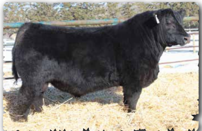
PEAK DOT LANCASTER 167M - LOT 117

>Recommended for heifers or cows >A fault free bull that is very solid in his structure. Wearing ratio 104. >Well built dam has a quality udder and abundant milk.