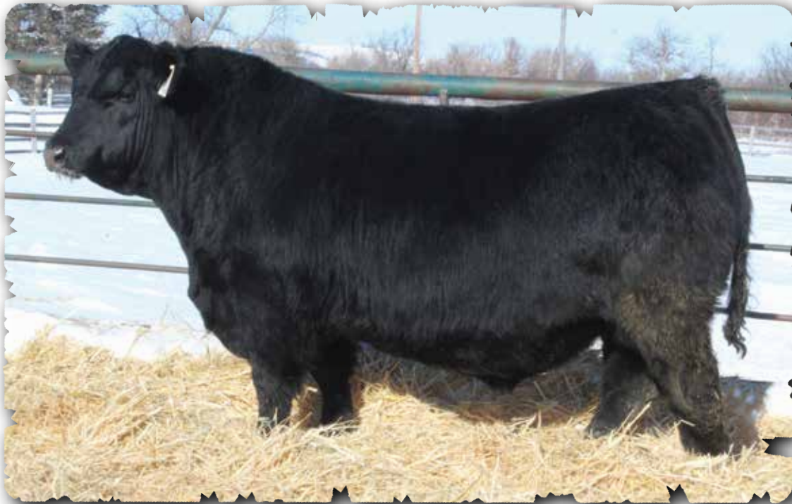
PEAK DOT BELFAST 144M - LOT 128