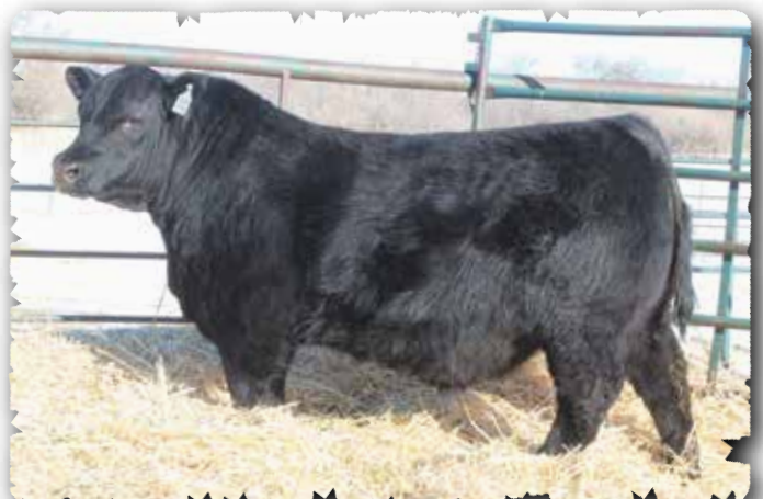
PEAK DOT LANCASTER 177M - LOT 119