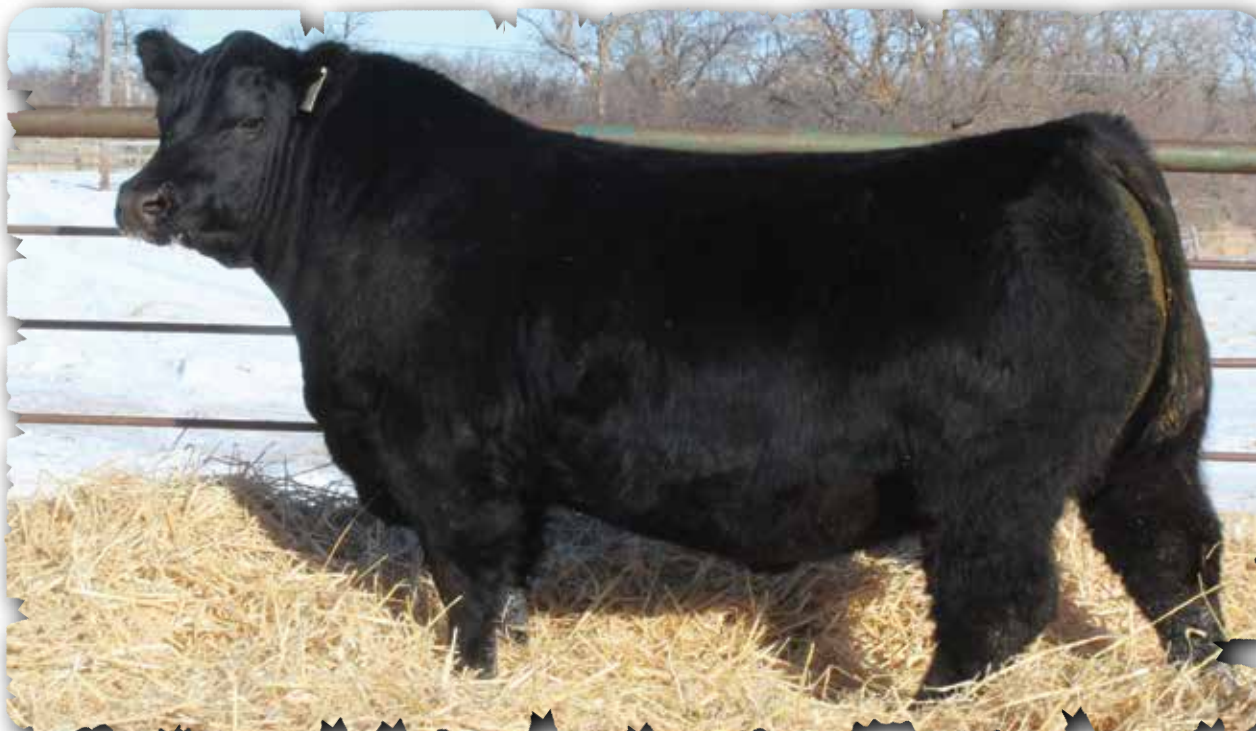
PEAK DOT TRUST 13M - LOT 4