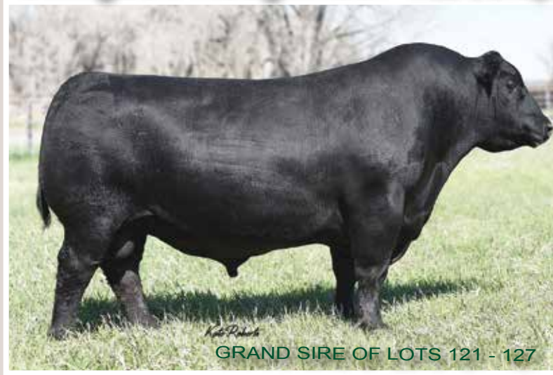
GRAND SIRE OF LOTS 121 - 127

CONNEALY CONSENSUS CONNEALY EARNAN 076E BRAZILA OF CONANGA 3991 LT CURVE BENDER 4810 OF EA EA BLACKCLASS 8914 SAV BLACKCLASS 374