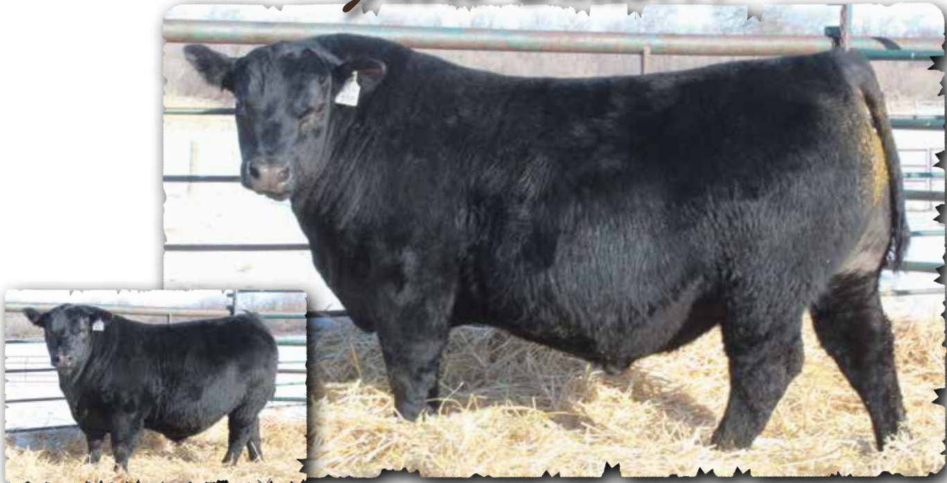
PEAK DOT GABLE 39M - LOT 38