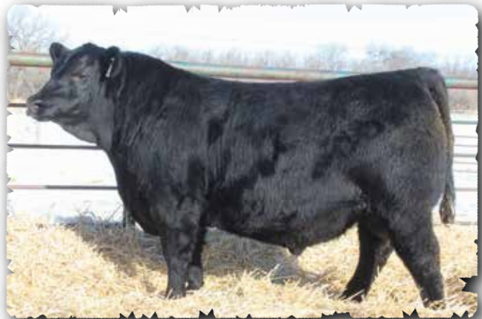
PEAK DOT GABLE 114M - LOT 33

>Recommended for heifers or cows >A stud with natural thickness great performance. Weaning ratio 117. >Top 1% for weaning weight and yearling weight. Top 7% for heifer pregnancy EPD.