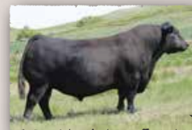
Musgrave 316 Colossal 137

LD CAPITALIST 316 MUSGRAVE 316 COLOSSAL 137 MUSGRAVE LADY BARBARA 545 HOOVER NO DOUBT PEAK DOT DUCHESS 370F PEAK DOT DUCHESS 126C