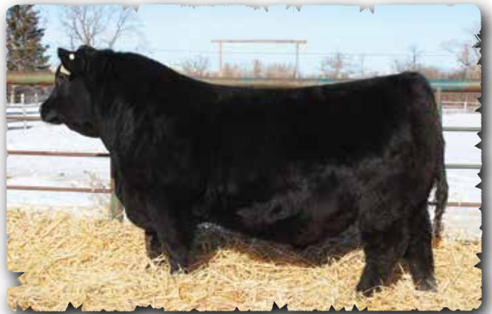
PEAK DOT TRUST 358M - LOT 9

>Recommended for heifers. >A thick made upstanding line bred Trust bull with extra volume and growth. Weaning ratio 100. >Mother is listed as an elite dam with CAA.