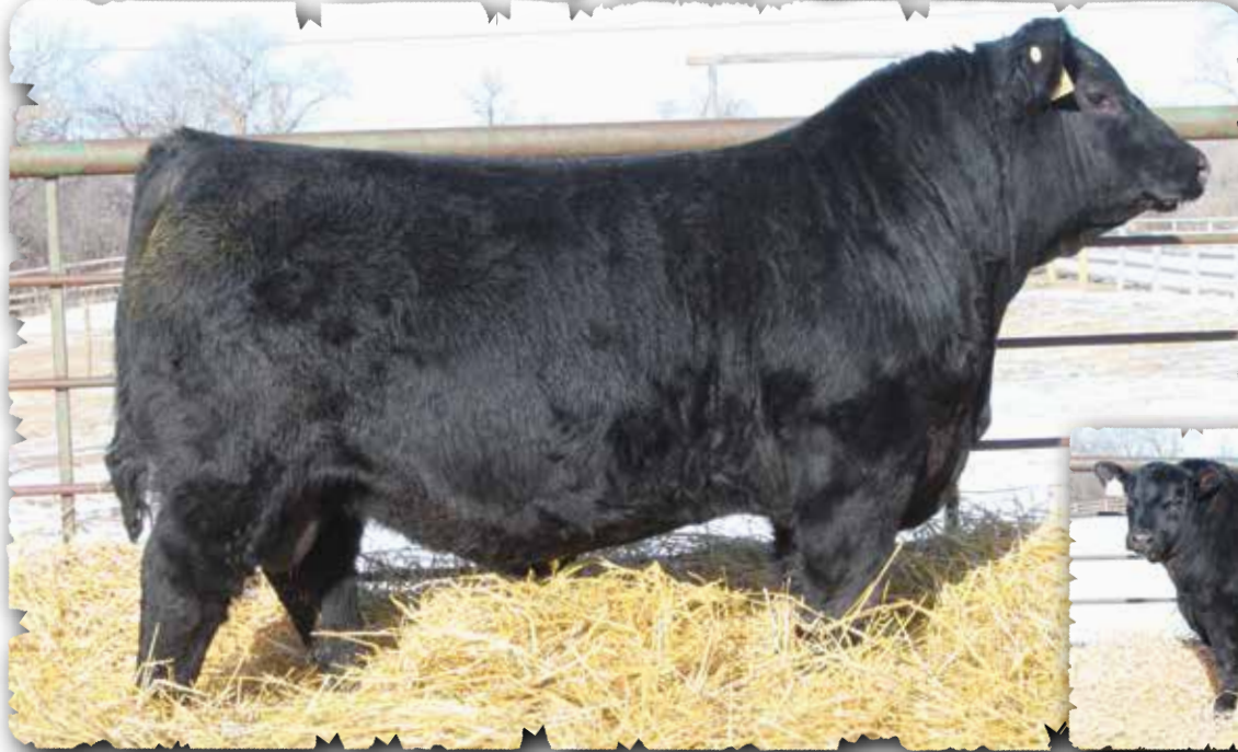
PEAK DOT TRUST 110M - LOT 24