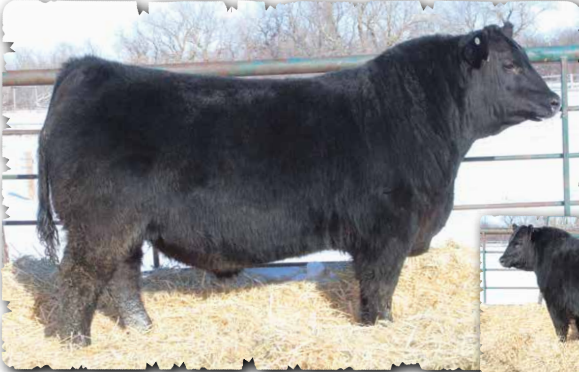
PEAK DOT EARNHARDT 151M - LOT 174