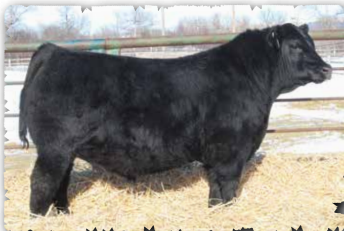
PEAK DOT MOSAIC 277M - LOT 101