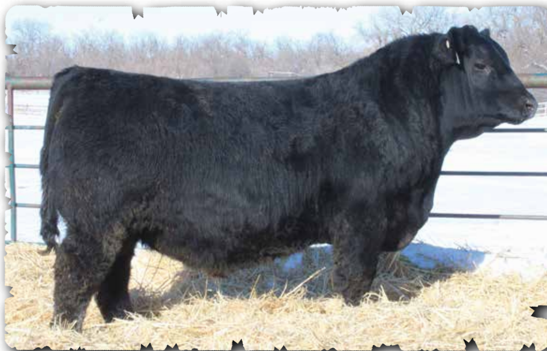
PEAK DOT BOOST 102M - LOT 133

Peak Dot Boost 162K was the $80,000 top selling bull from our 2023 Spring Sale to Eaglehawk Angus Australia. Boost 162K is a low birth weight bull that will also add some real pounds to your calf crop and dollars to your bottom line. You will love the look of this bull. He displays real muscle, capacity, softness and substance with powerful phenotype. He weaned off at 911lbs to earn a weaning ratio of 114. He is off a great looking No Doubt daughter with a nice udder and his grandam earned Elite Dam status with the Canadian Angus Association. Peak Dot Boost 162K comes with a ton of performance packed into a moderate frame.