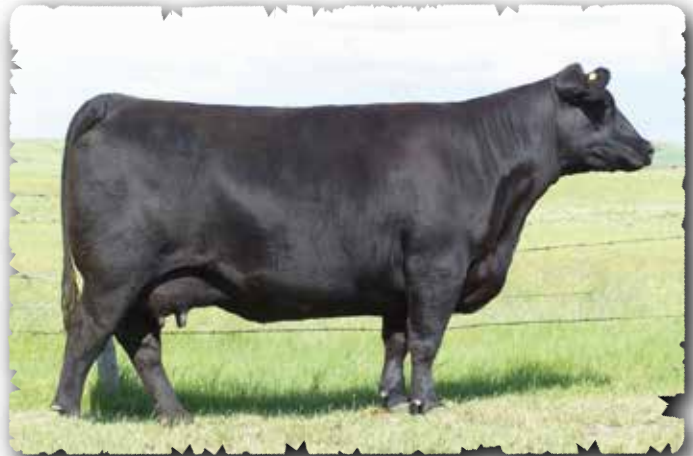
LADY OF PEAK DOT 402U The maternal grandam of lot 134