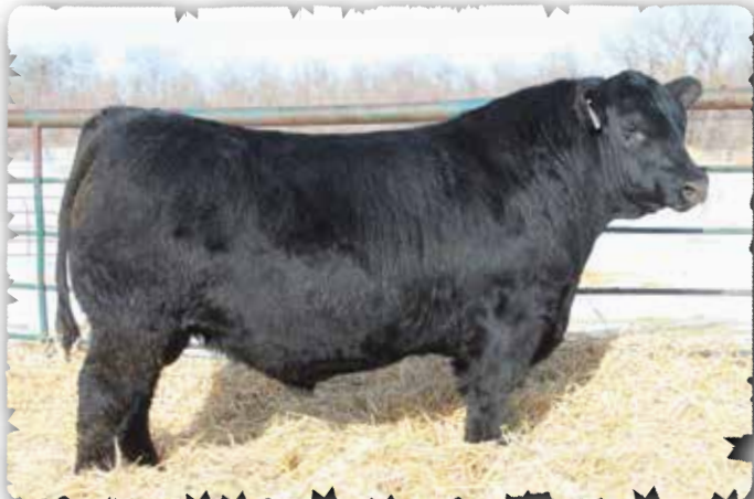
PEAK DOT MOSAIC 374M - LOT 97

>Recommended for cows >A thick husky bull. Big top, square hipped calf loaded with pounds and performance. Weaning ratio 116. >SAV Renown daughter has a excellent production record.