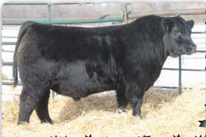
PEAK DOT BIG RIVER 168M - LOT 72