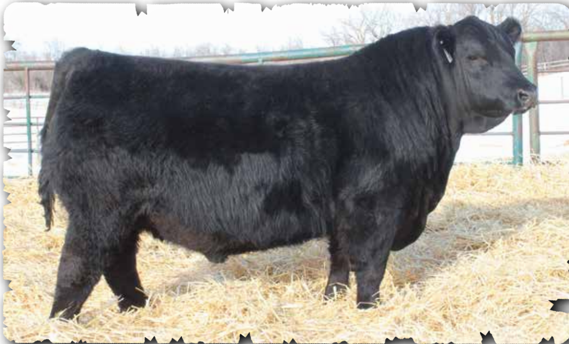
PEAK DOT PONDEROSA 129M - LOT 87

Ponderosa the bull that is on the radar of the Angus World and already has begun to write his own chapter in Angus History. He started as the popular high selling bull out of the 2023 Schiefelbein Farms Bull Sale where he was regarded as the thickest Angus Bull in existence. He went on to set new records every time his semen sells and the demand and momentum continued on with Ponderosa embryos selling for $3750 per embryo in past sales. Never before has there been a time or a push in History to get back to good functional, deep-bodied, correct cattle. Ponderosa is leading the charge with his mass, performance and fleshing ability while adding style and balance.