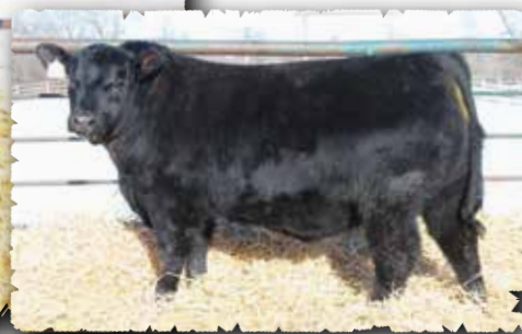
PEAK DOT TRUST 110M - LOT 24