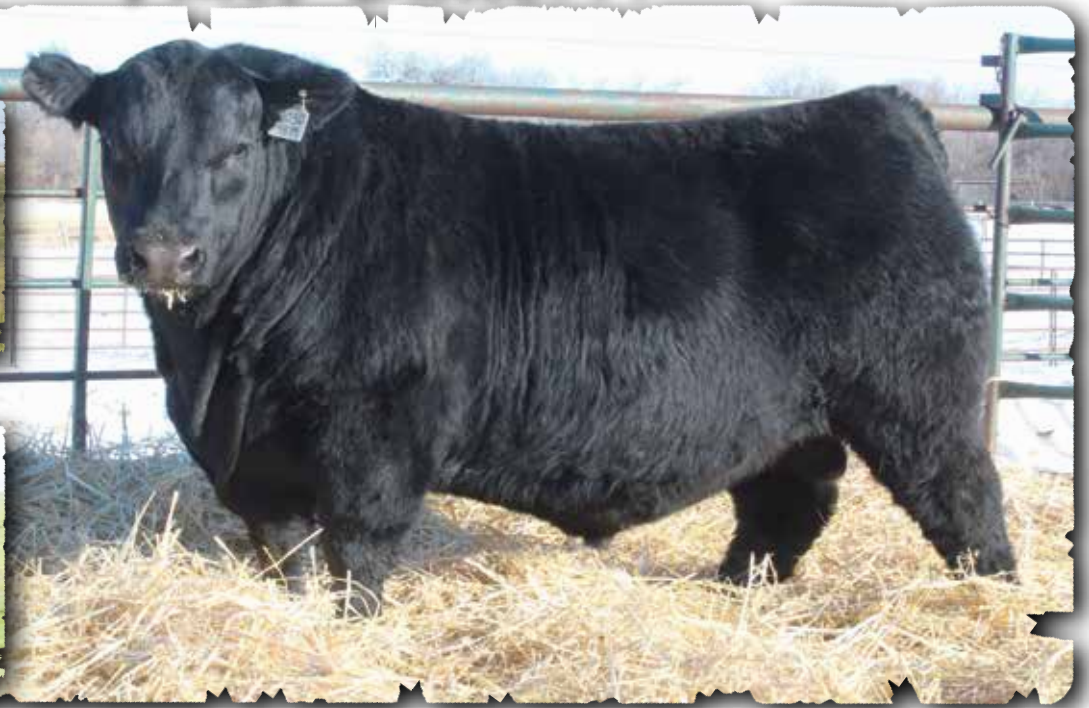
PEAK DOT TRUST 46M - LOT 8