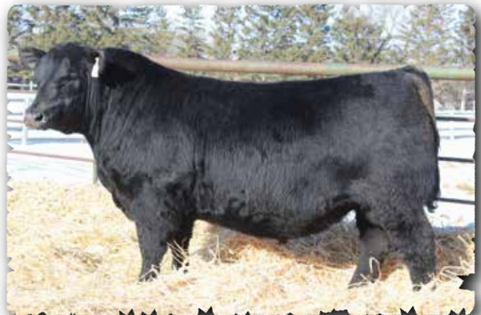
PEAK DOT GABLE 230M - LOT 46

>Recommended for heifers >Proud fronted, attractive bull with thickness, muscle volume and style. Weaning ratio 114. >Top 1% for weaning weight and yearling weight EPDs. Top 1% for Docility EPD. >Dam is backed by two consecutive generations of donors.