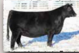
Peak Dot Queen 15G Purchased by KT Ranch for $24,000