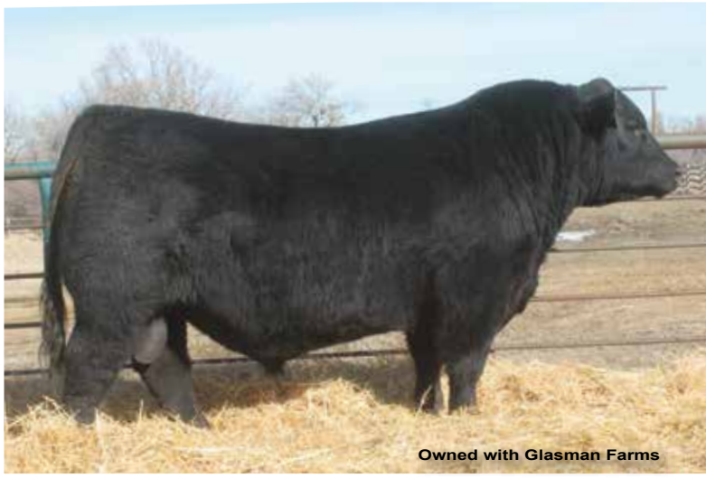
Owned with Glasman Farms

CONNEALY EARNAN 076E ELLINGSON ROUGHRIDER 4202 EA BLACKLASS 8914 SAV ELIMINATOR 9105 PEAK DOT PRIDE 88B PRIDE OF PEAK DOT 11Y