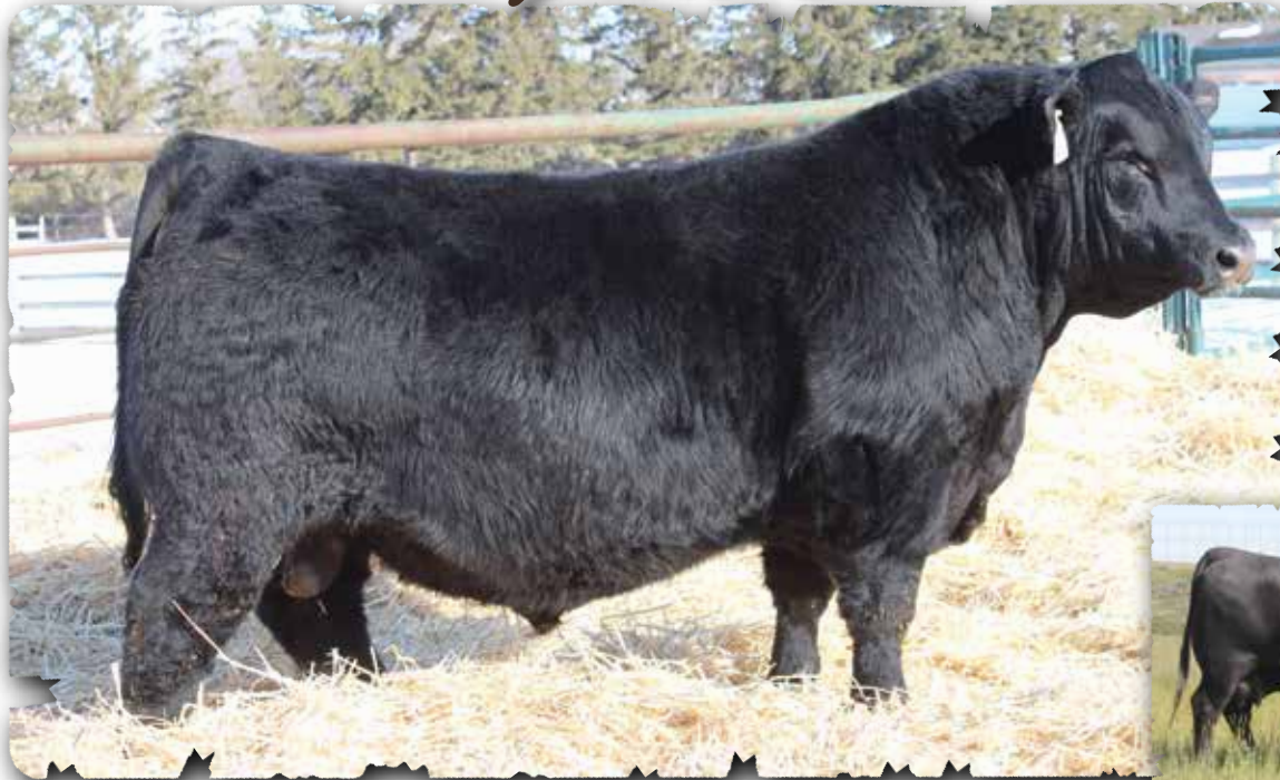
PEAK DOT GABLE 223M - LOT 41