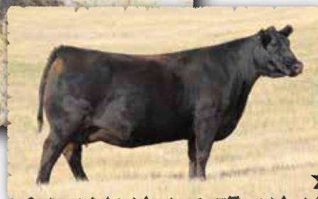
PEAK DOT ANNIE K 246E The maternal grandam of lot 140