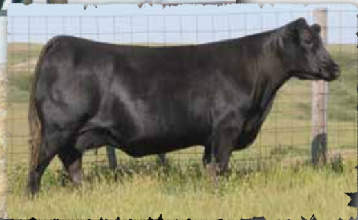
PEAK DOT LADY 1189A The dam of lot 178