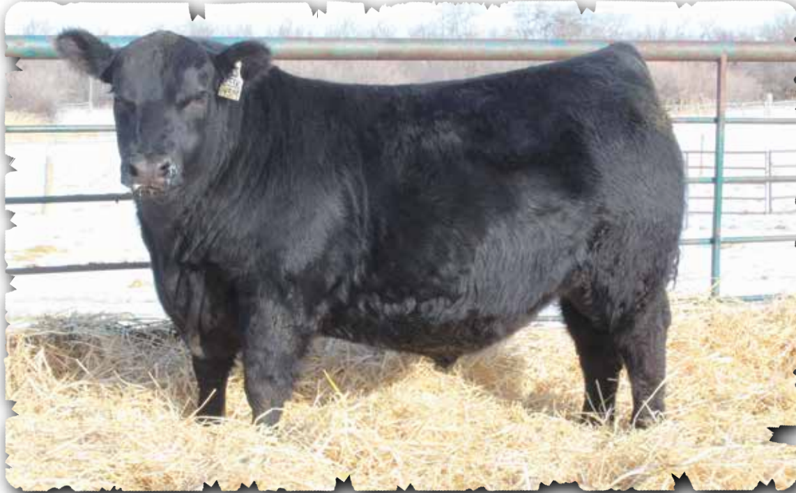
PEAK DOT PONDEROSA 145M - LOT 88