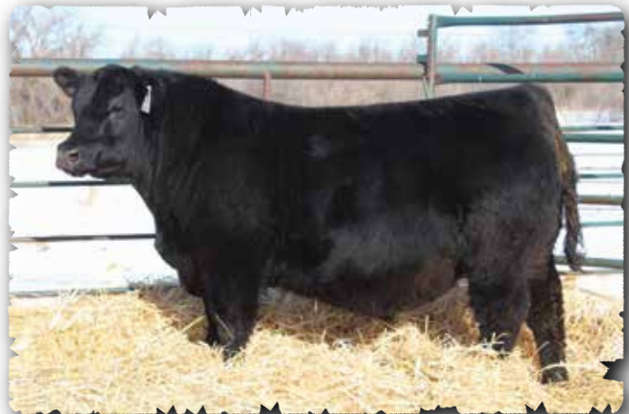
PEAK DOT RECTIFY 414M - LOT 60

>Recommended for heifers. >A Sleeper! Stud with natural thickness great performance. Note just a young April 10 born bull. >Weaning ratio 113. Posted a 861lbs weaning weight off a first calf heifer.