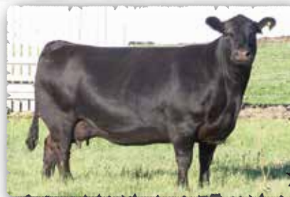
PEAK DOT ROSE 643T

The maternal matriarch that lot 136 traces back to.