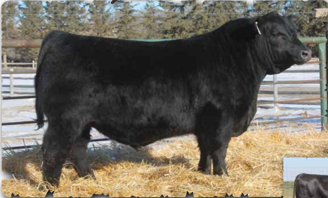
PEAK DOT GABLE 249M - LOT 47