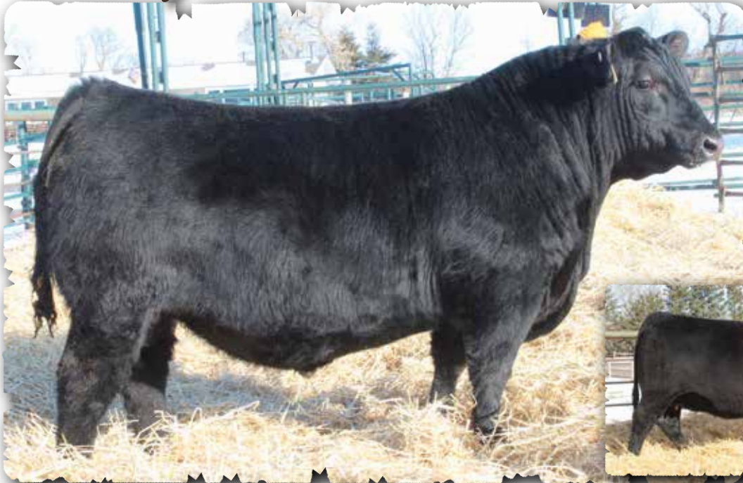
PEAK DOT GUARANTEE 161M - LOT 158