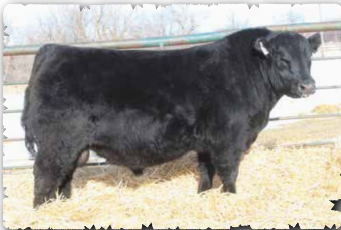
PEAK DOT MOSAIC 2M - LOT 106