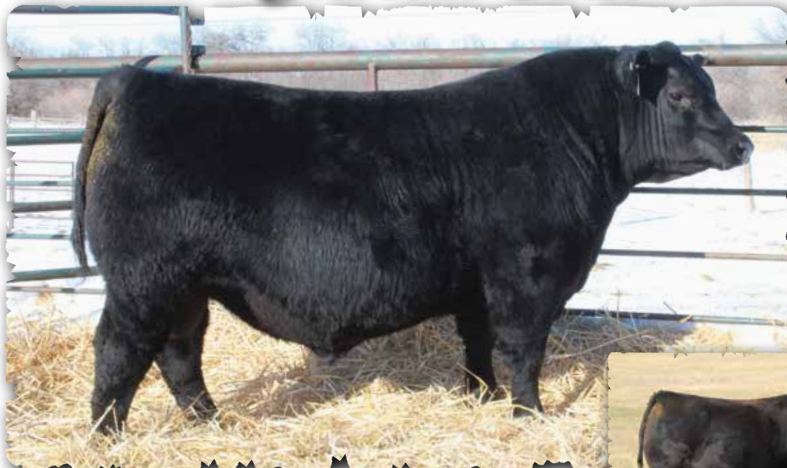
PEAK DOT COLOSSAL 434M - LOT 140