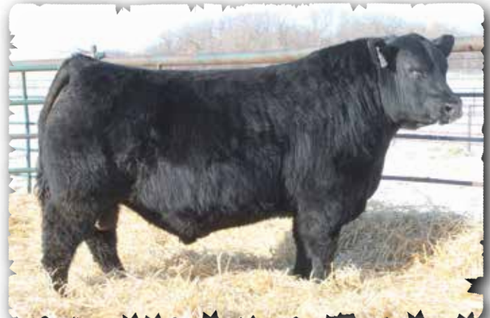
PEAK DOT LANCASTER 379M - LOT 116

>Recommended for heifers or cows. Wearing ratio 109. >A nice headed bull with volume and thickness. Very free moving bull that will cover a lot of ground. >Dam is a stout bodied deep made female backed by donors and Elite Dams.