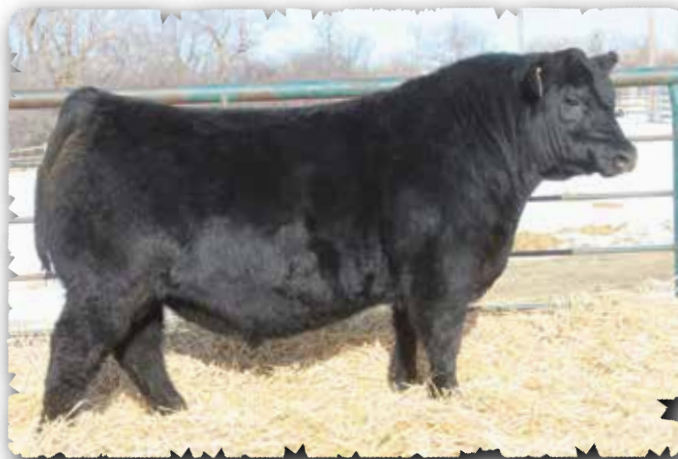
PEAK DOT MOSAIC 260M - LOT 103

>Recommended for cows >Abundant body depth and thickness and raw muscle. Weaning ratio 102. >Dam is a donor. Maternal sister is one of the top picks from the bred heifer pen.