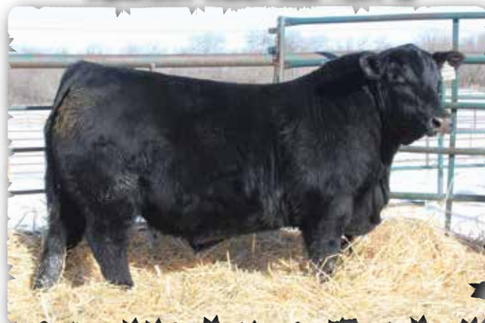
PEAK DOT TRUST 396M - LOT 19

>Recommended for Cows. >A big upstanding Trust bull with extra length and growth. >Dam averaged a 101 weaning ratio on her last 6 calves.