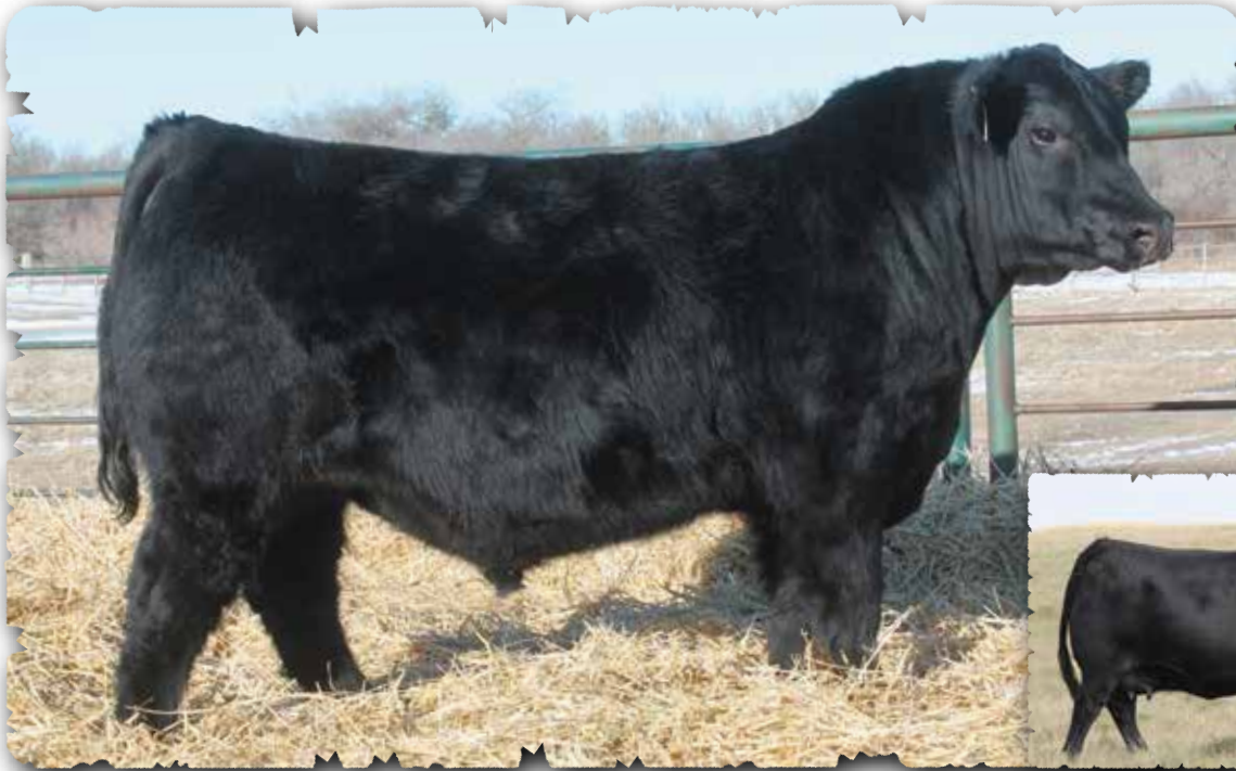
PEAK DOT COLOSSAL 173M - LOT 138