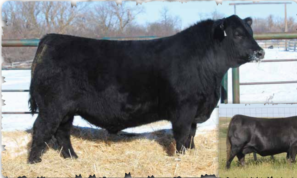
PEAK DOT PIONEER 378M - LOT 178