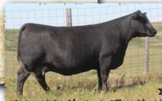
PEAK DOT BARBARA 483A The maternal grandam of lot 170