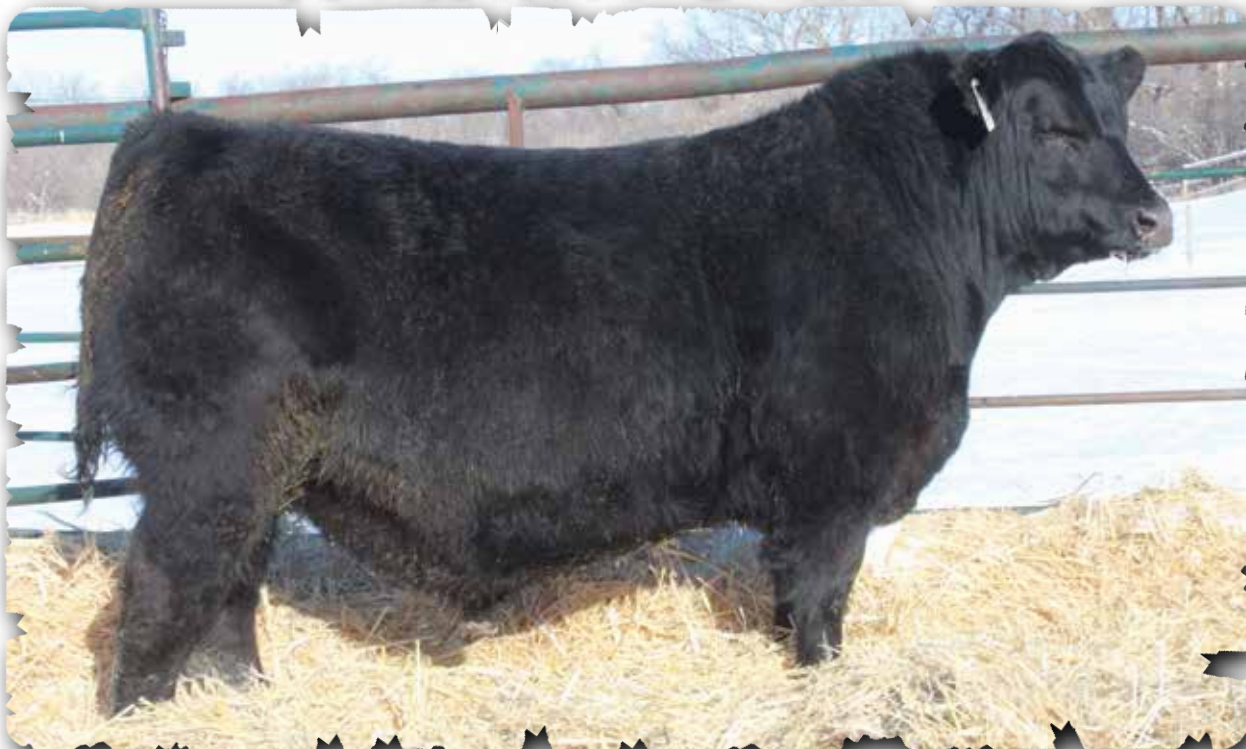
PEAK DOT TENDERLOIN 429M - LOT 167