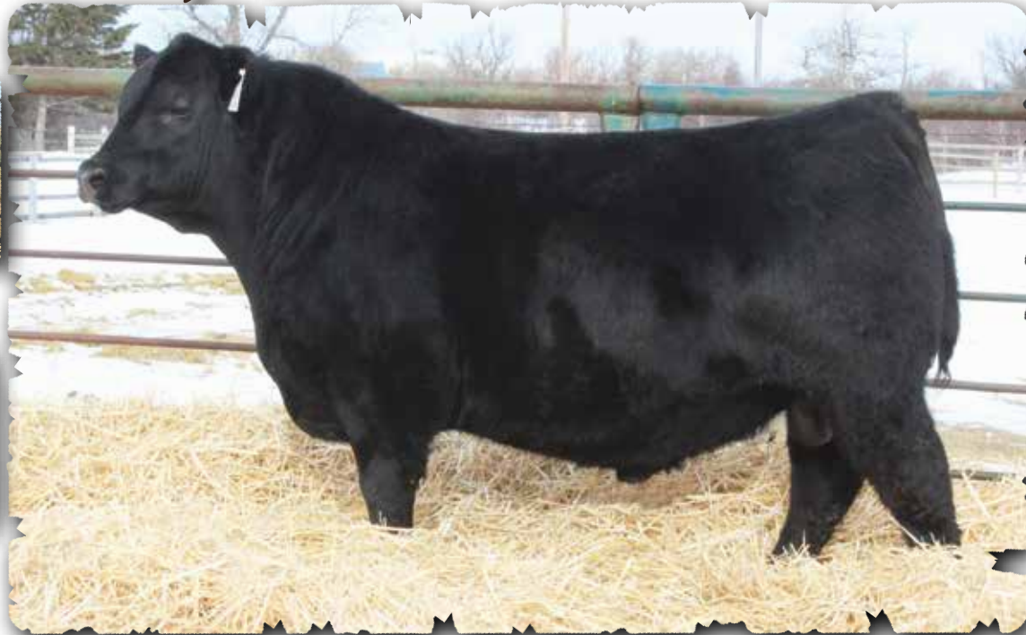
PEAK DOT BIG RIVER 437M - LOT 73