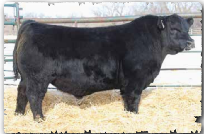
PEAK DOT PROFOUND 202M - LOT 83

>Recommended for heifers >Thick topped, loaded with muscle and as solid as you can build one. Weaning ratio 103. >Eliminator dam has an excellent udder and ranks in the top 1% for milk EPD. We have retained most of her daughters. One daughter sold down to Laverne Leibrandt in Nebraska.