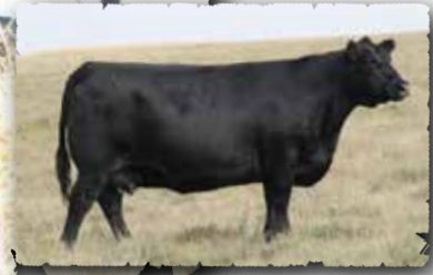
PEAK DOT MAYFLOWER 10D The maternal grandam of lot 163