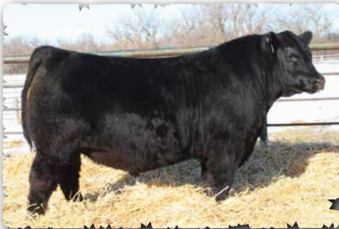
PEAK DOT MOSAIC 212M - LOT 107