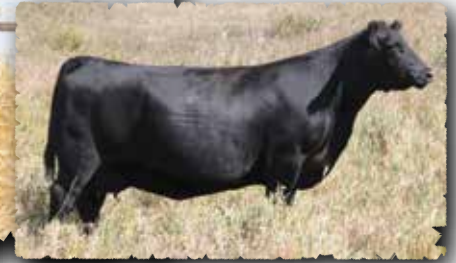
PEAK DOT PRIDE 88B The grandam of lot 106