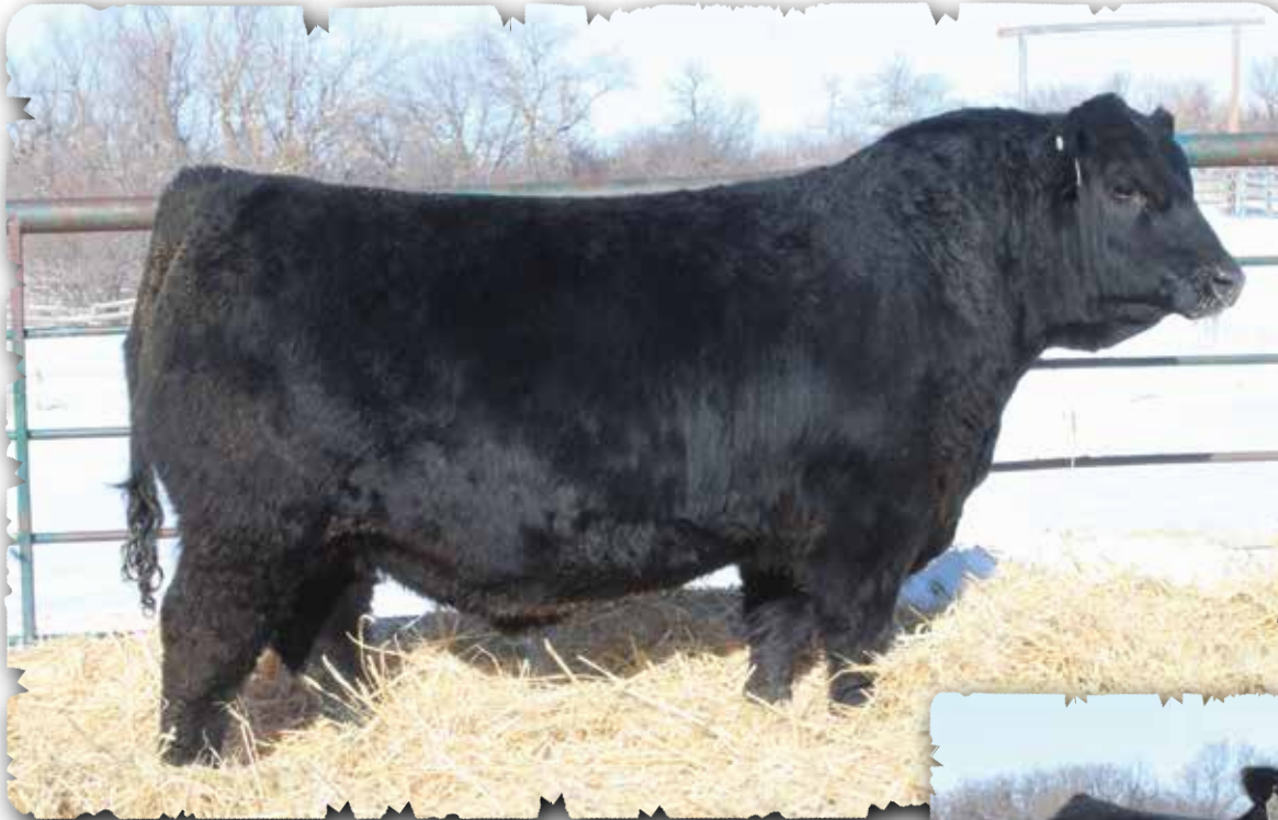
PEAK DOT GUARANTEE 154M - LOT 154

Peak Dot Guarantee is a highly fertile, phenotypic stunner with power, presence and structural balance. He stamps his progeny with style, length and performance. Guarantee 711K dam is a top notch donor with 48 progeny and she has produced several featured top selling bulls in past sales. His sons can be used on heifers with confidence and will add pounds at weaning.