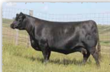
PEAK DOT LADY 780A The grandam of lot 17

>Recommended for cows >He is long, deep and powerfully-built through his rump. >Dam is a donor with 11 progeny. This is her natural calf.