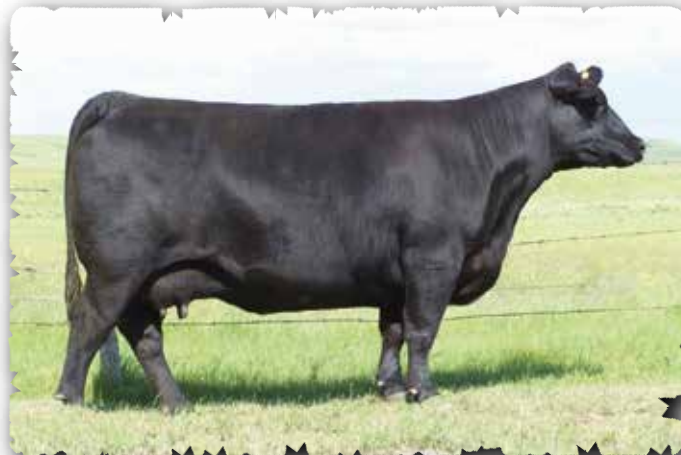
PEAK DOT LADY 402U The grandam of lot 178

>Recommended for heifers >A complete, well balanced bull with tremendous females in his make up. Weaning ratio 107. >Dam and grandam are two of the most powerful cows you will find in terms of body type and presence. >Dam is a embryo donor with 72 progeny.