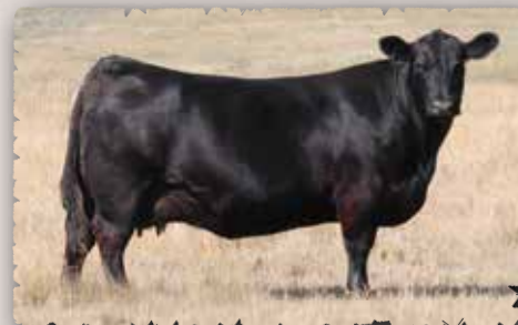
PEAK DOT BARBARA 19C The dam of Peak Dot Profound 1018G