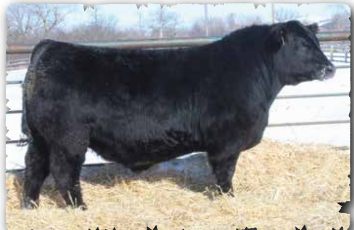
PEAK DOT GUARANTEE 215M - LOT 156

>Recommended for heifers. >A thick made upstanding bull with extra volume and growth. Top 7% for heifer pregnancy rate. >Great grandam is listed as an Elite Dam with CAA.