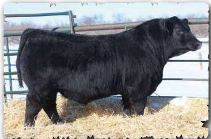
PEAK DOT BELFAST 421M - LOT 132

>Recommended for heifers. >A well bred bull with the combination of calving ease and performance. Top 2% heifer pregnancy EPD. >Dam has ideal body type and nice udder and solid production record.