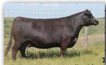
LADY OF PEAK DOT 62Y The grandam of lot 31

>Recommended for heifers or cows. A personal favorite. >A potential sale topper with superior length, muscle and structural soundness. >Posted a 205 day weight of 906lbs. Weaning index 119. >Top 1% WW, 1%YW. Top 7% for Heifer Pregnancy EPD. Top 20% for Marbling. >His mother is a high efficiency dam has a quality udder and perfect feet. Grandam is a donor.