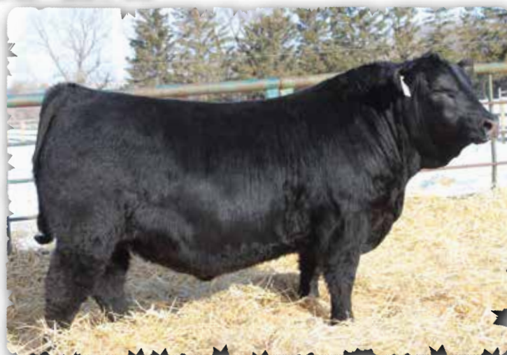
PEAK DOT GABLE 127M - LOT 36

>Recommended for heifers >A well made bull blending thickness, substance and style. >Top ranking EPDS. >Excellent mother. We have retained two maternal sisters.