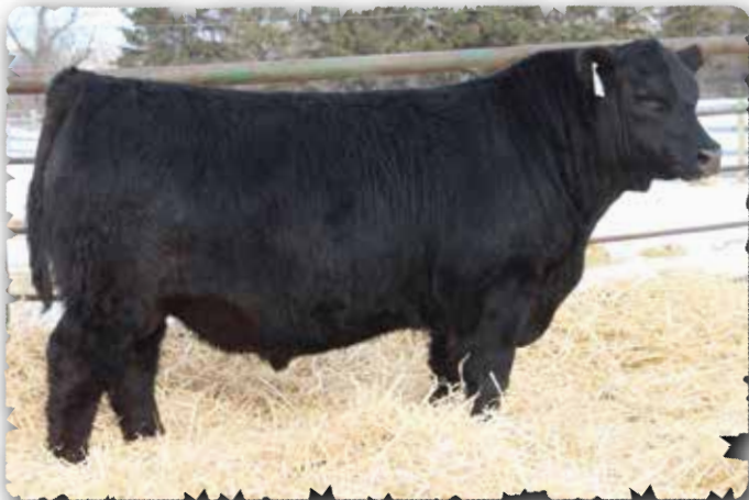
PEAK DOT BIG RIVER 496M - LOT 71