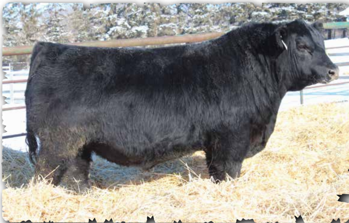
PEAK DOT COLOSSAL 228M - LOT 136

Peak Dot Colossal 164J was a top ranking calving ease son of Colossal purchased by Hillcrest Enterprises we use back in our herd. He is a great looking, early gestation, low birth weight sire that can be used on virgin heifers without sacrificing thickness, muscle and capacity much like his sire. There are several outstanding females in his pedigree. His progeny present calving-ease without compromise, displaying muscle, capacity, softness, substance and performance.