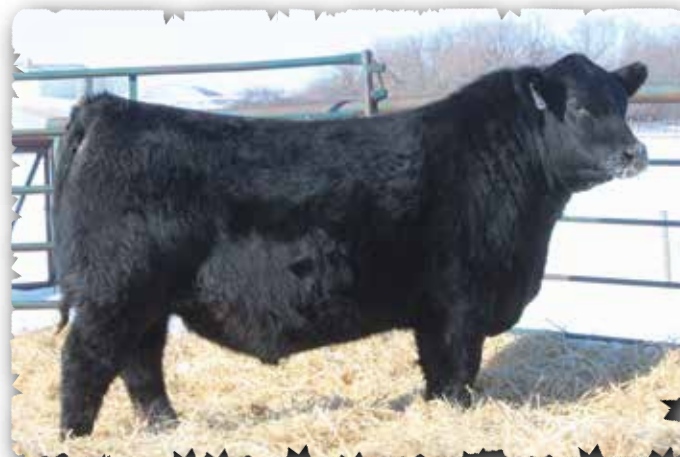
PEAK DOT TENDERLOIN 444M - LOT 169

>Recommended for heifers >A proud looking wide topped bull with robust thickness. Weaning ratio 108. >Top 6% for marbling and top 15% for heifer pregnancy rate.