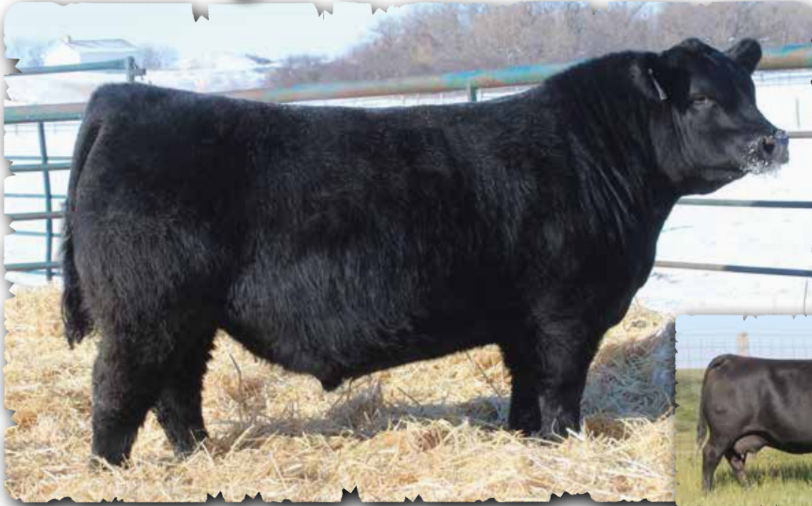
PEAK DOT COLOSSAL 458M - LOT 137