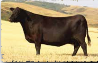
PEAK DOT QUEEN 271F The grandam of lot 45