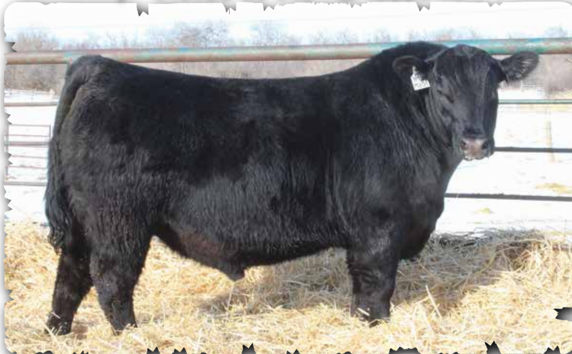
PEAK DOT PONDEROSA 106M - LOT 90