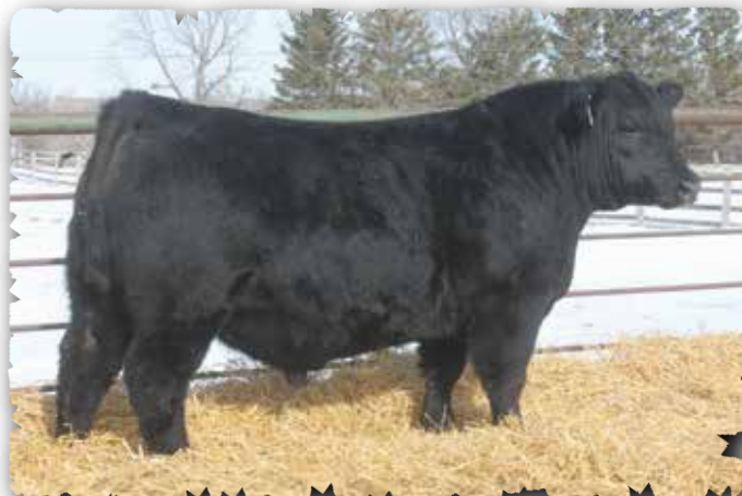
PEAK DOT MOSAIC 267M - LOT 110