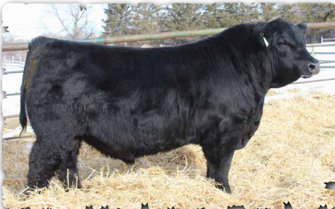
PEAK DOT PROFOUND 313M - LOT 79