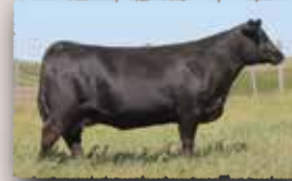
PEAK DOT HEATHER 541B

The maternal dam of Peak Dot Guarantee 711K