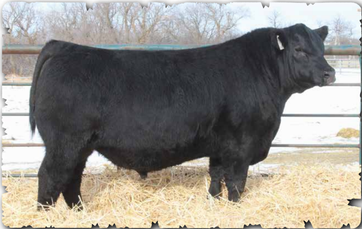
PEAK DOT BIG RIVER 284M - LOT 63

Ellingson Big River the $40,000 sale feature from the 2021 Ellingson Angus Bull Sale purchased by Peak Dot Ranch. Big River progeny are well made with lots of size, body shape, hair and bone and as much sheer thickness as any sire we have ever used. His daughters are among the very best in the replacement pen. Ellingson Big River is a very important piece in our breeding program here at Peak Dot as we continue to improve overall maternal, foot and udder quality, fertility and milking ability. His muscle density, base width and bone circumference and performance is unmatched. He continues to generate all kinds of interest from breeders across the country after seeing his progeny top sales the past few years not only here at Peak Dot but at several other places.