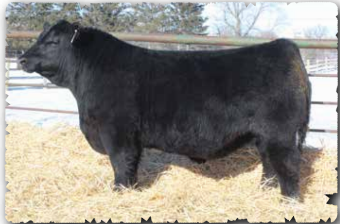
PEAK DOT TRUST 77M - LOT 16

>Recommended for heifers >A bull with ample thickness and muscle shape. Weaning ratio of 113. >Maternal brothers have sold to Robert Math and ES Cattle.