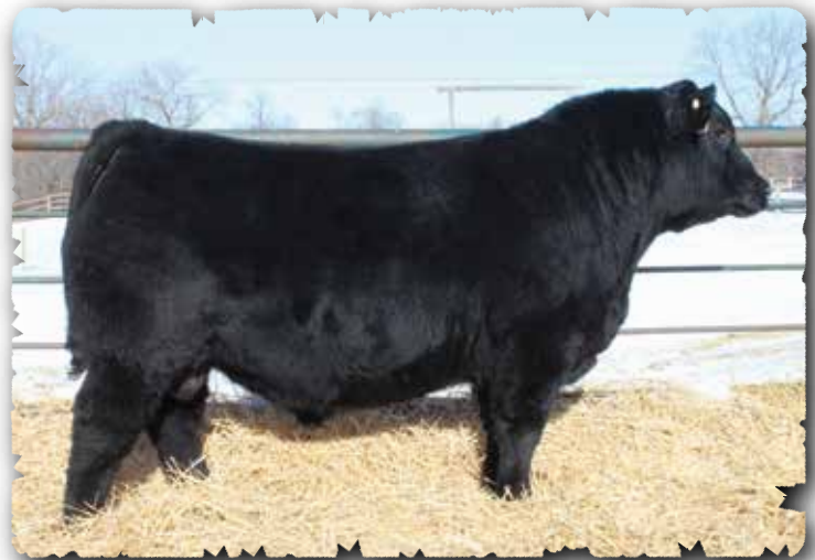
PEAK DOT GABLE 30M - LOT 39

>Recommended for heifers >A proud looking wide topped bull with robust thickness. >Top 4% for heifer pregnancy rate.