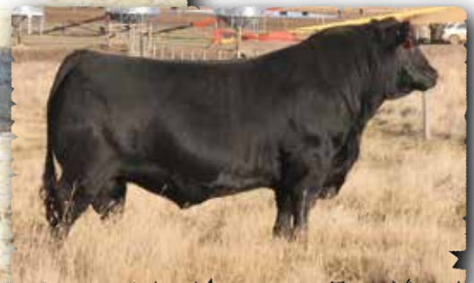
JANSSEN EARNHARDT 5003 Sire of lots 174 and 175