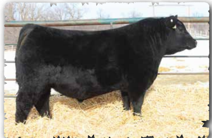
PEAK DOT PROFOUND 412M - LOT 84

>Recommended for cows >Proud fronted, attractive bull with thickness, muscle volume and style. >Top 2% for hoof angle EPD. Two maternal brothers sold to Les Shick and Athabasca Colony.