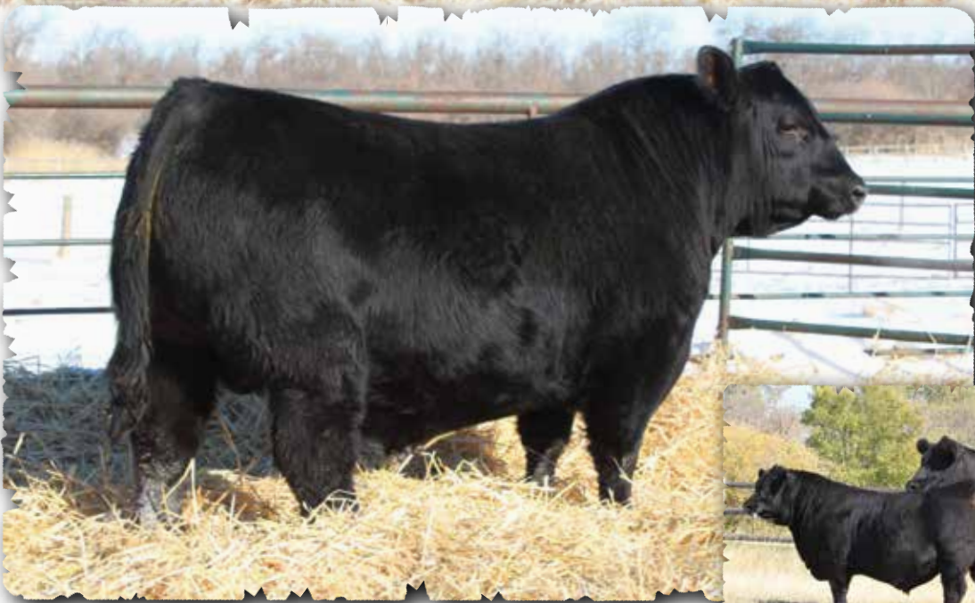
PEAK DOT TRUST 4M - LOT 1