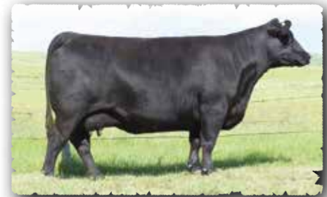
PEAK DOT LADY 402U

>Recommended for heifers >A stout functional good bull with maternal value. >Ranks in the very top 1% for Milk EPD. >Dam stems back to Peak Dot Lady 402U popular donor with 72 progeny.