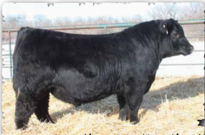
PEAK DOT MOSAIC 474M - LOT 98

>Recommended for cows. >Loaded with shape, substance and style. Weaning ratio of 102. >Ranks in the top 1% for hoof claw and angle EPDs.