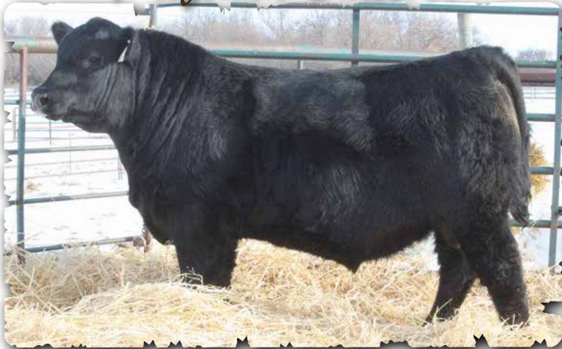
PEAK DOT PROFOUND 261M - LOT 80