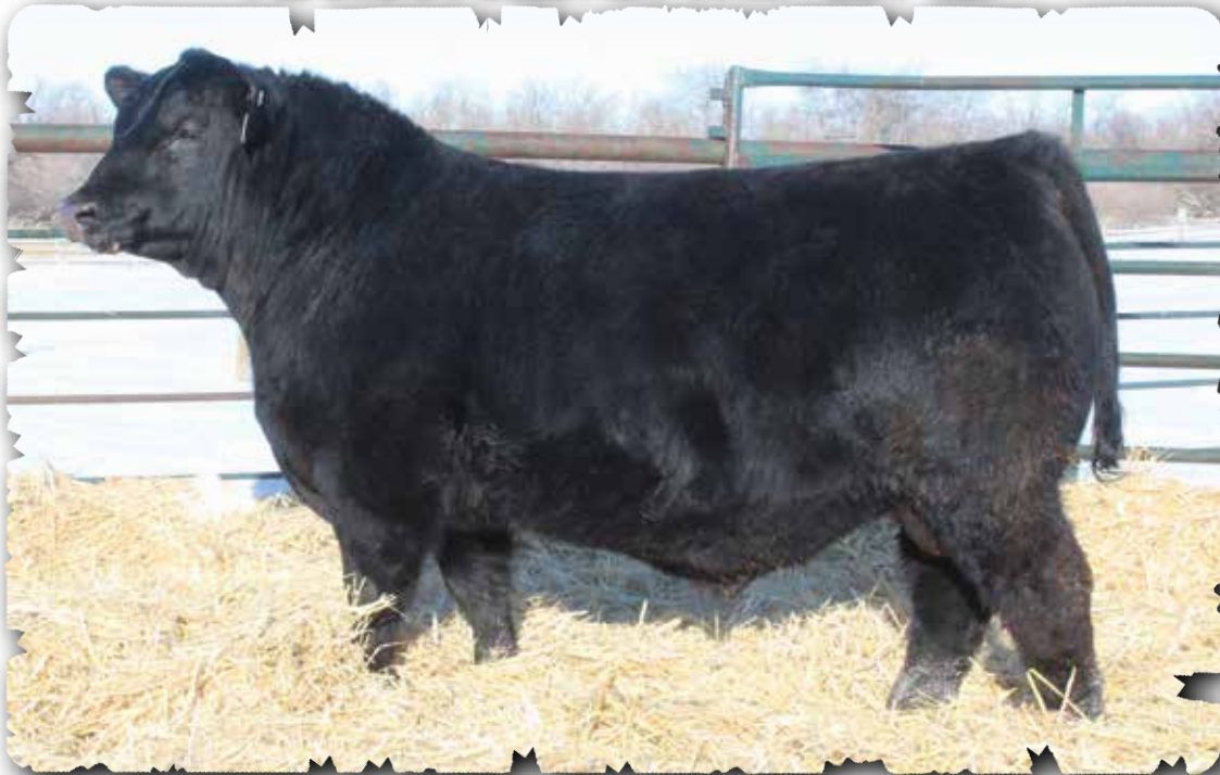
PEAK DOT BELFAST 395M - LOT 129