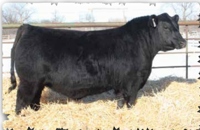
PEAK DOT TRUST 18M - LOT 7