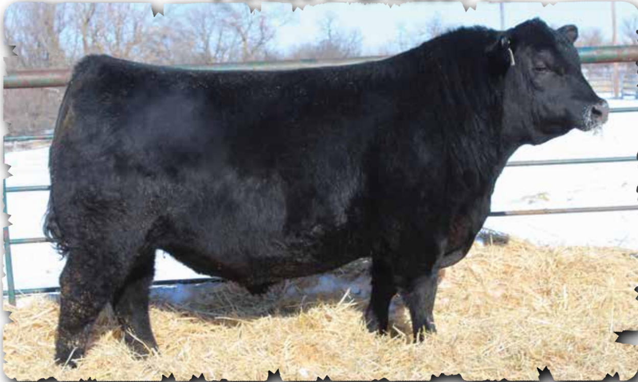
PEAK DOT TANKER 211M - LOT 145