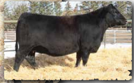
PEAK DOT LADY 831H