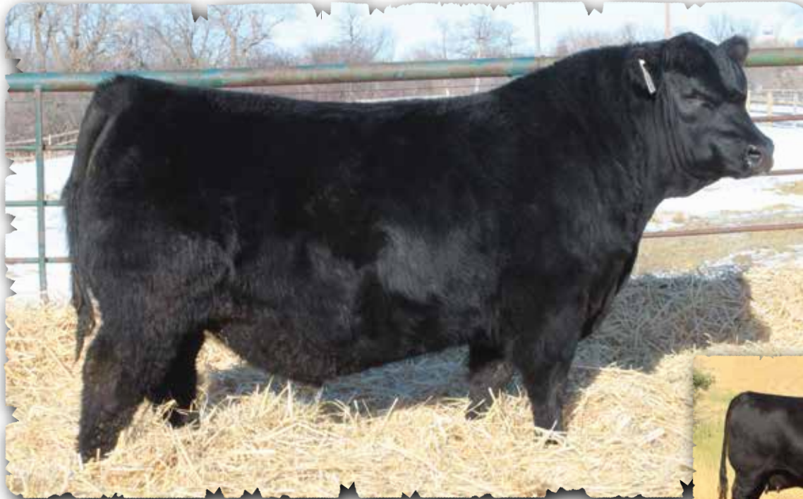
PEAK DOT MOSAIC 191M - LOT 102