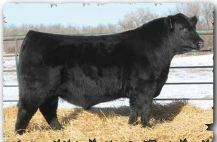
PEAK DOT BOOST 108M - LOT 135