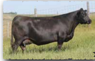
LADY OF PEAK DOT 9Y The grandam of lot 47

>Recommended for heifers >A superior calving ease bull with bred in maternal value. >Posted a 205 day weight of 845lbs. Weaning ratio 111. Full brother sold to Grassroots Ranch. >Dam is backed by 3 generations of donors that are major Contributors to the Peak Dot cow herd.