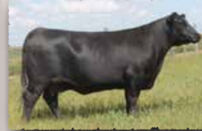
LADY OF PEAK DOT 38C The dam of Mosaic