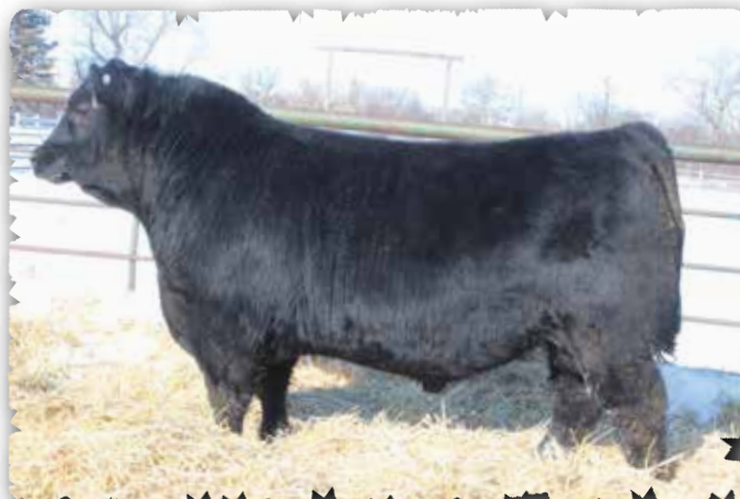
PEAK DOT TANKER 209M - LOT 150

>Recommended for heifers >A low birth weight bull with a tremendous top and thickness. Weaning ratio 106. >Balanced carcass numbers top 20% marbling top 9% rearing and top 1% for carcass weight. >Nice uddered broody Ellingson Proposition dam.