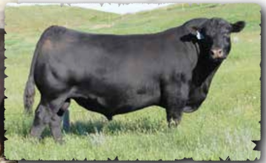
Musgrave Colossal 316 Sire of heifers