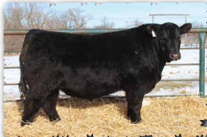
PEAK DOT GABLE 93M - LOT 49

>Recommended for heifers or cows >A long, smooth patterned performance bull with thickness and fleshing ability. >Weaning ratio 101. Top 4% for weaning weight EPD.