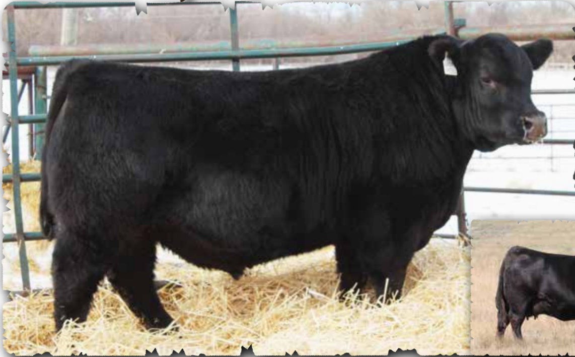
PEAK DOT BIG RIVER 280M - LOT 70