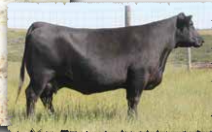
PEAK DOT DUCHESS 155Y The grandam of lot 43