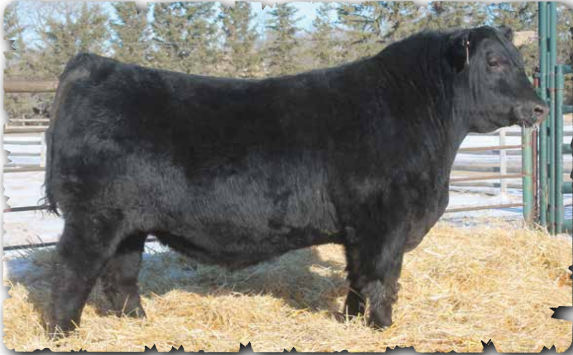
PEAK DOT LANCASTER 157M - LOT 115