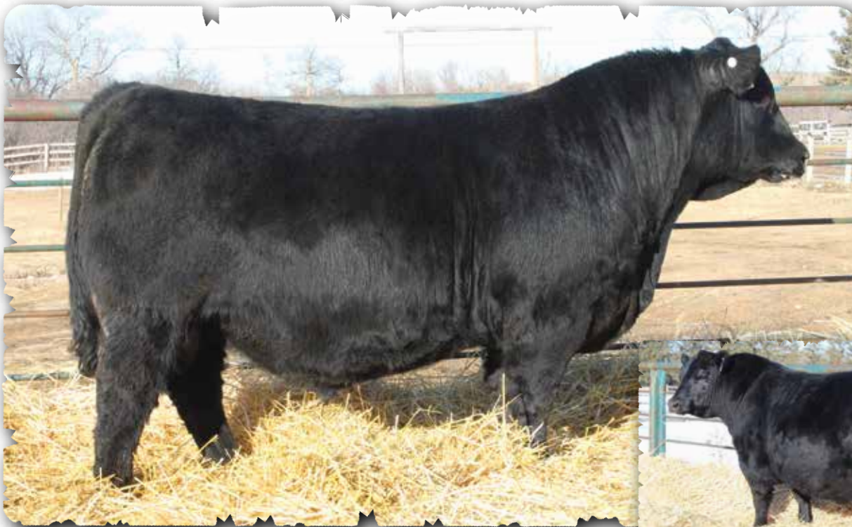
PEAK DOT GABLE 76M - LOT 31

Schiefelbein Gable 311 the $90,000 Sale feature from the 2022 Schiefelbein Farms Sale selling to Peak Dot Ranch. Gable 311 is a true breeders bull with a flawless EPD package, stunning looks and an outcross pedigree. As we enter the stage of the cattle cycle where retaining females is a must Gable 311 is the best option for doing such a thing. His +100 $M combined with +20 EPD for Heifer Pregnancy rank him in the very top 1% of the breed. Two very important traits. He ranks in the top 30% for 12 of the 13 major traits including top 1% for WW,YW,HP,DOC & $M. Combine that with double digit calving ease and a light birth weight along with a $C in the top 2% of the breed. Gable 311 is a big scrotal bull with a nice look and loads of rib, great hip and a big thick butt. His young dam Frosty Elba Lizzy 5569 boost outstanding EPDs and is quickly climbing the ranks in the Schiefelbein herd. His grandam Frost Elba Lizzy 3565 is a pathfinder cow with a proven track record.