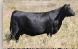
Peak Dot Pride 88B The dam of Lancaster