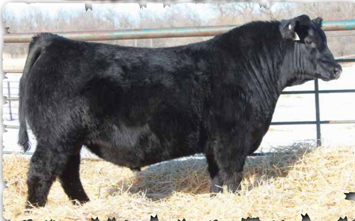
PEAK DOT MOSAIC 339M - LOT 111