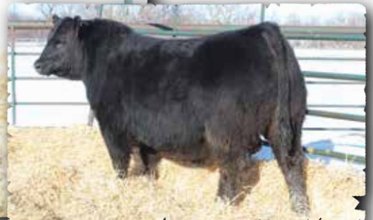
PEAK DOT EARNHARDT 151M - LOT 174