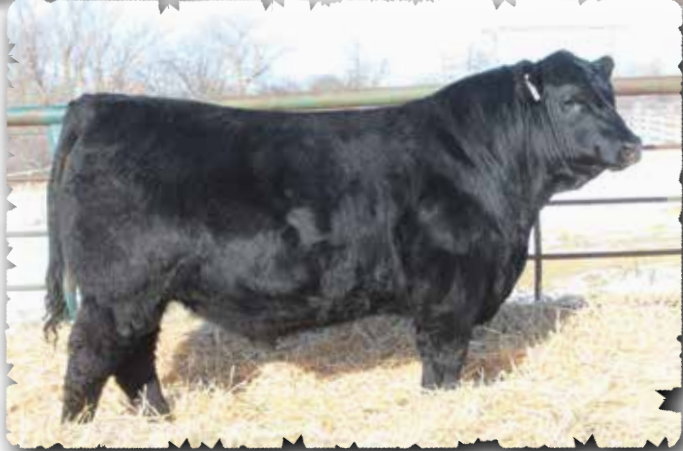
PEAK DOT MOSAIC 95M - LOT 96

>Recommended for heifers or cows >A smooth patterned bull with thickness and fleshing ability. Weaning ratio of 104. >Dam is the moderate framed easy fleshing high efficiency type.