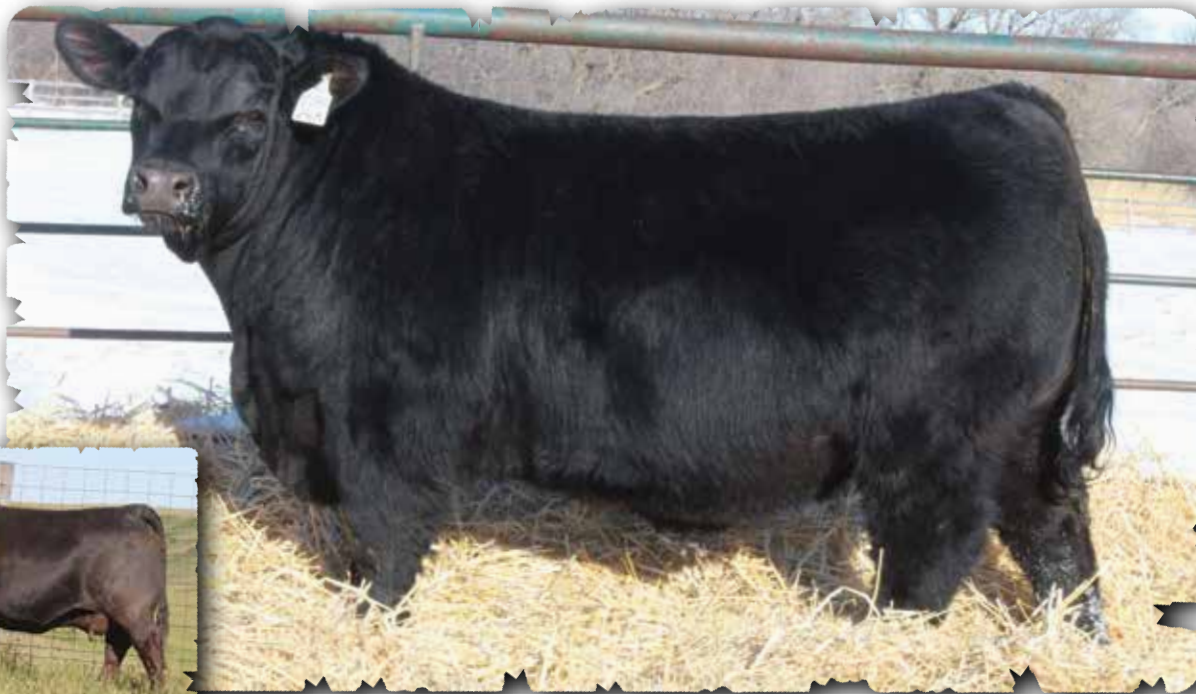
PEAK DOT BARBARA 451B