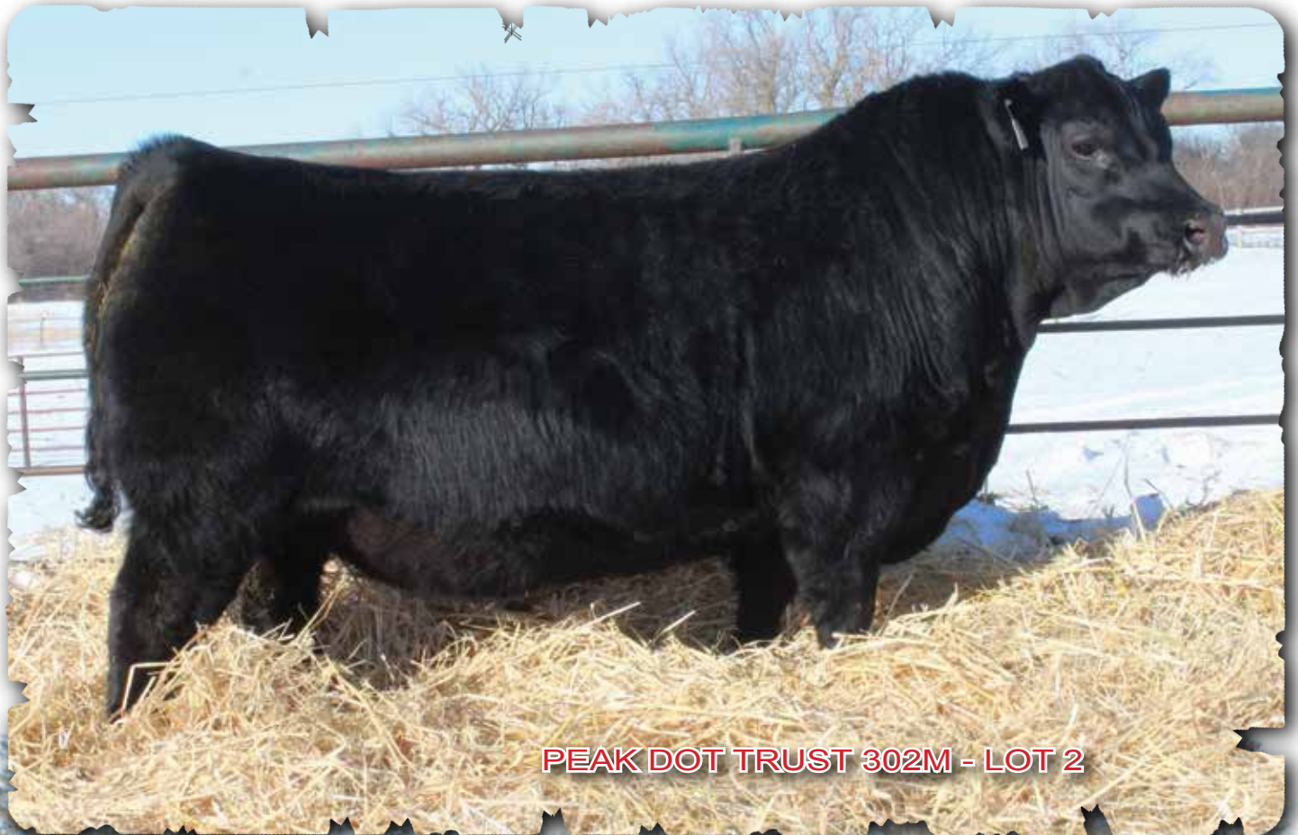
PEAK DOT TRUST 302M - LOT 2