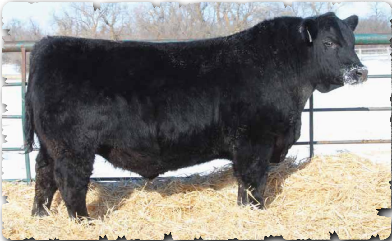
PEAK DOT BOOST 85M - LOT 134