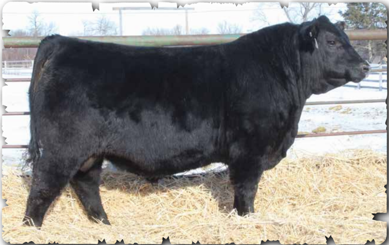
PEAK DOT REVIVAL 709M - LOT 62

Revival is a sound, athletic herd bull that was a feature in the 2021 Woodhill bull sale where he topped it for $55,000 USD. He is as impressive in the flesh as he is on paper being extra long spined, wide pinned, stout quartered with a real herd bull look to him. His backing of the extra maternal cowherd at Revival is truly exciting for this calving ease bull backed by generations of great cows. His exciting EPD profile, with 10 traits in the top 10%, calving ease, birth weight, weaning weight, yearling weight and carcass quality.