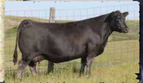
PEAK DOT LADY 287B The grandam of lot 68