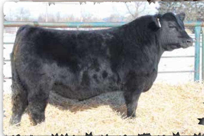
PEAK DOT TRUST 87M - LOT 17