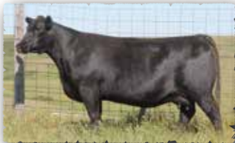
PEAK DOT PANSY 68B The grandam of lot 73