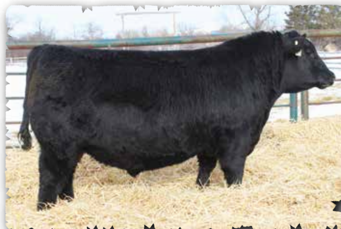
PEAK DOT PONDEROSA 120M - LOT 92

>Recommended for heifers >A chunk, Very correct well made bull. Lots of spring in his ribs. Weaning ratio 102. >Dam is a favorite among the calving crew due to her perfect udder structure and outstanding phenotype.