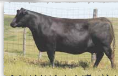
HEROINE OF PEAK DOT 225Z