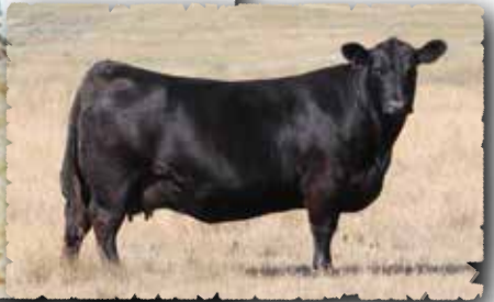
PEAK DOT BARDOLIA 19C The grandam of lot 70