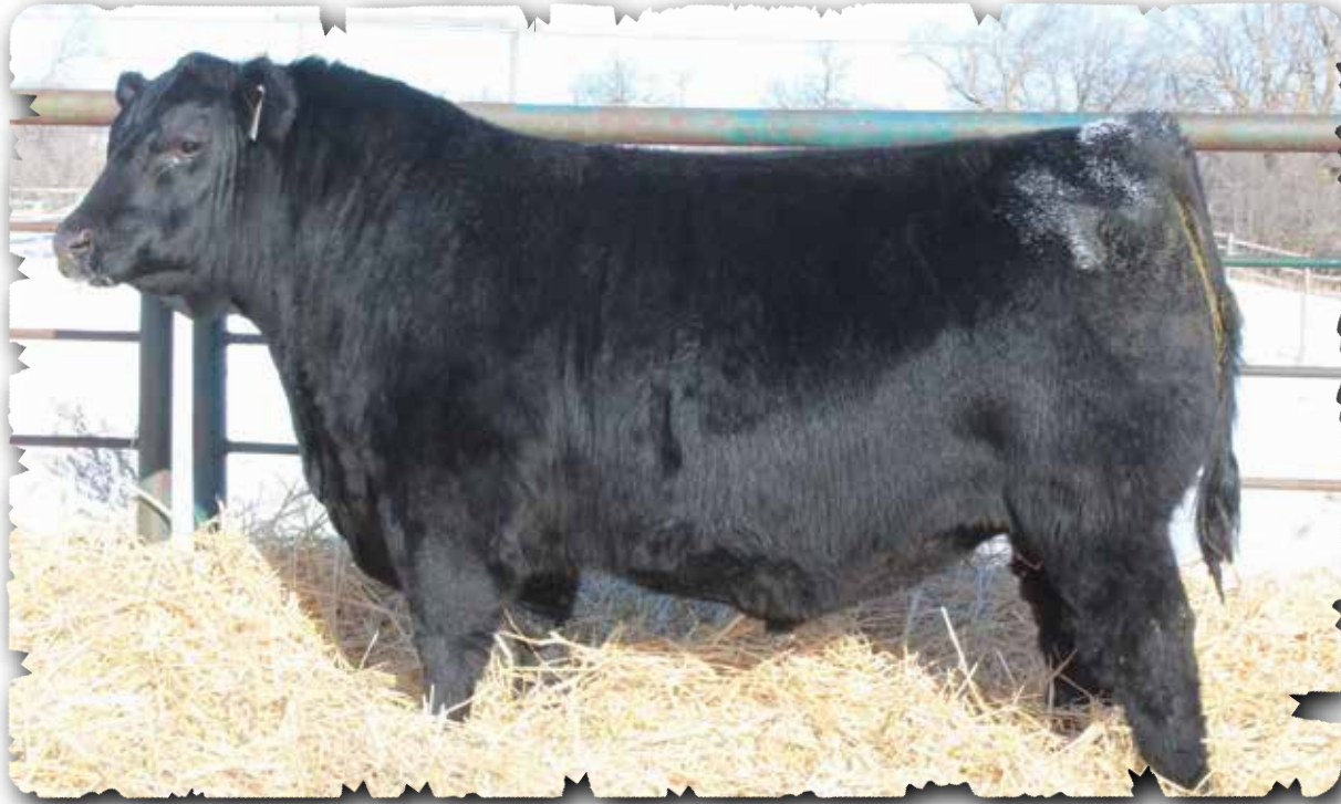
PEAK DOT TRUST 71M - LOT 14