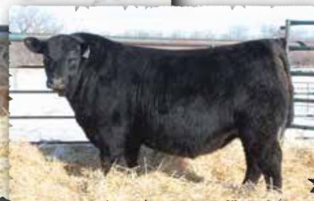
PEAK DOT GABLE 27M - LOT 35