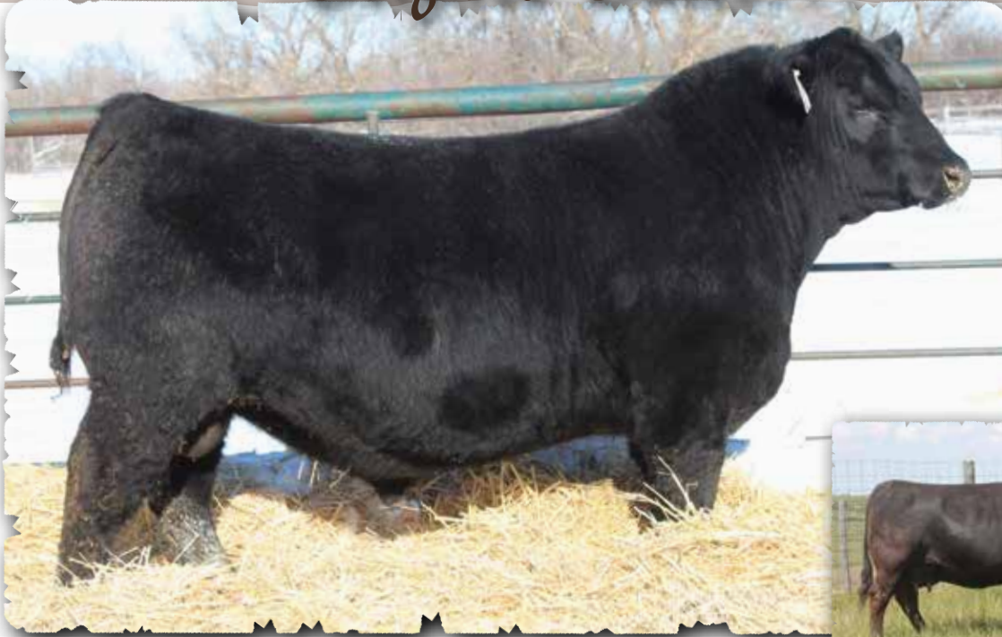
PEAK DOT BELFAST 138M - LOT 130