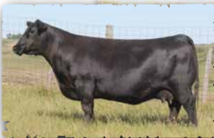
PEAK DOT PRISCILLA 239A The maternal grandam of lot 81