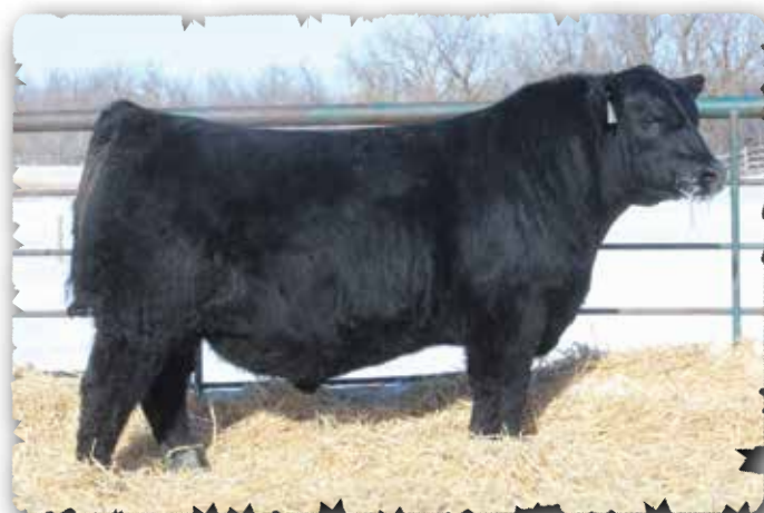
PEAK DOT COLOSSAL 460M - LOT 141

>Recommended for heifers or cows >A complete, well balanced bull with tremendous females in his make up. Weaning ratio 102 >Ranks in the top 20% for marbling. >Grandam is a donor and is also the mother of lot 30.