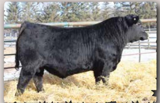
Peak Dot Four Leaf 157L $30,000 son owned by Six Mile Ranch