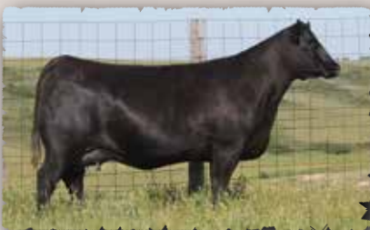
PEAK DOT QUEEN 303D The dam of Trust

Trust is gaining attention and is being used by several reputable commercial and purebred cattle ranches that just flat out like good, balanced, correct cattle with performance, eye-appealing phenotype and natural thickness. His dam has a flawless udder good feet, true breed character and is one of the very best No Doubt daughters in the herd. You will want to keep all of his daughters. Contact Semex Beef for semen.