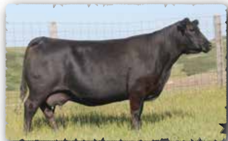
PEAK DOT LADY LAWN 551B The maternal dam of lot 62

>Recommended for heifers or cows >Extra power in this bull's pedigree. Will add some growth and sheer thickness to his calves and you will want to keep all his daughters. >Dam is a donor with 35 progeny. She is noted for her exceptional udder quality. She is a proven producer that still looks great today.