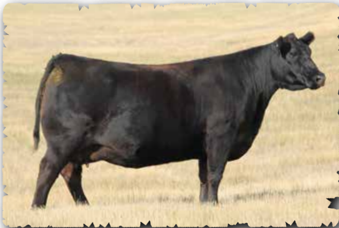
PEAK DOT ANNIE K 246E