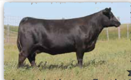
PEAK DOT HEATHER 541B