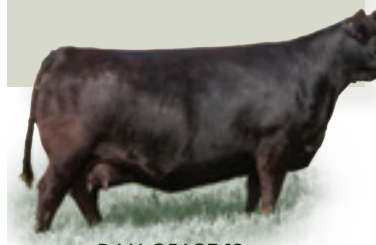
DAM OF LOT 12

Calving Ease: ** Here is the only two-year-old in the sale. We used him last year on our commercial cows. 32L is a smooth made, well balanced moderate framed beef bull. He is an embryo calf out of SAV Bloodline and the million-dollar producing cow Brooking Beauty 333.