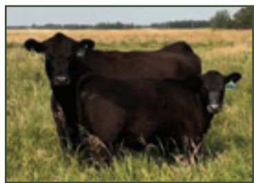
LOT 15 WITH DAM

Princess is the perfect name for her. She is very long, deep and elegant with a very pretty front end.