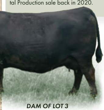
DAM OF LOT 3

Calving Ease: ** This is a moderate framed bull with big time muscle expression. He has a big top, lots of thickness, with a nice, rounded rump and a tremendous hair coat. He just has that herd bull look. He is an embryo calf and a full brother to 4G Mechanic 44M. There dam is one of the original cows that started our herd. She was the high selling angus lot in the HBH Angus and Northern Light Simmental Production sale back in 2020.