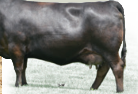
DAM OF LOT 1 AND 2

Calving Ease: *** 4G Mobile 40M is a calving ease embryo calf out of an exceptional dam JL Forever Lady 9078. She was the high selling bred heifer in the Johnson Dispersal. She most recently sold in the Autumn Angus Classic Sale this fall for $22500. This moderate framed bull is smooth fronted, very attractive with lots of middle, hair and great disposition. He is a full brother to 4G Mystery 41M.