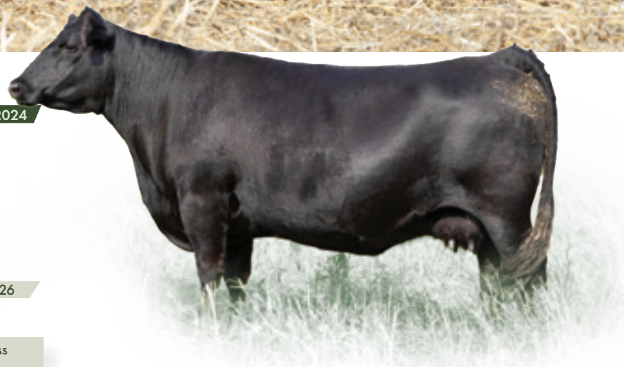
DAM OF LOT 17

As the old saying goes save the best for last might be the case for 4G Miss Sally 490m. She is a very elegant heifer with a lot of eye appeal. She has a real nice front end with tremendous depth of body. She will probably have a beautiful udder like her mother and maternal sister in the herd.