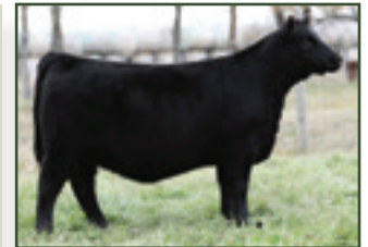
DAM OF LOT 9

Here is the real calving ease expert in the sale. He is smooth fronted with a nice tiny head, great hair coat and a nice low birth weight. He is out of a beautiful Brooking Bank Note first calf heifer that we purchased from Jaymarandy Livestock.