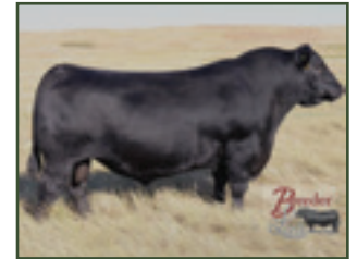
SIRE OF LOT 3, 5, 13 AND 14

REMITALL F RAGE 9A HBH MARY 150D BROOKMORE MARY 79A