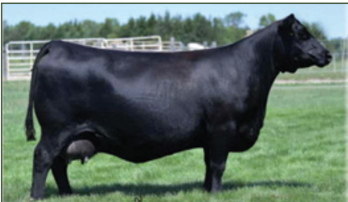
DAM OF LOT 7

CE 7.5 BW 1.3 WW 75 YW 121 MCE 11.5 MM 27 BW 86 lbs..... WW 980 lbs..... JAN 6 1300 lbs