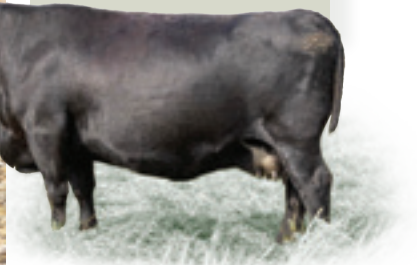
DAM OF LOT 11

Calving Ease: * For a middle of March bull, he is a real meat machine from front to back. He is stout made, big topped with lots of eye appeal. He is out of a moderate framed easy fleshing Rainfall daughter we purchased from the Johnson Dispersal.