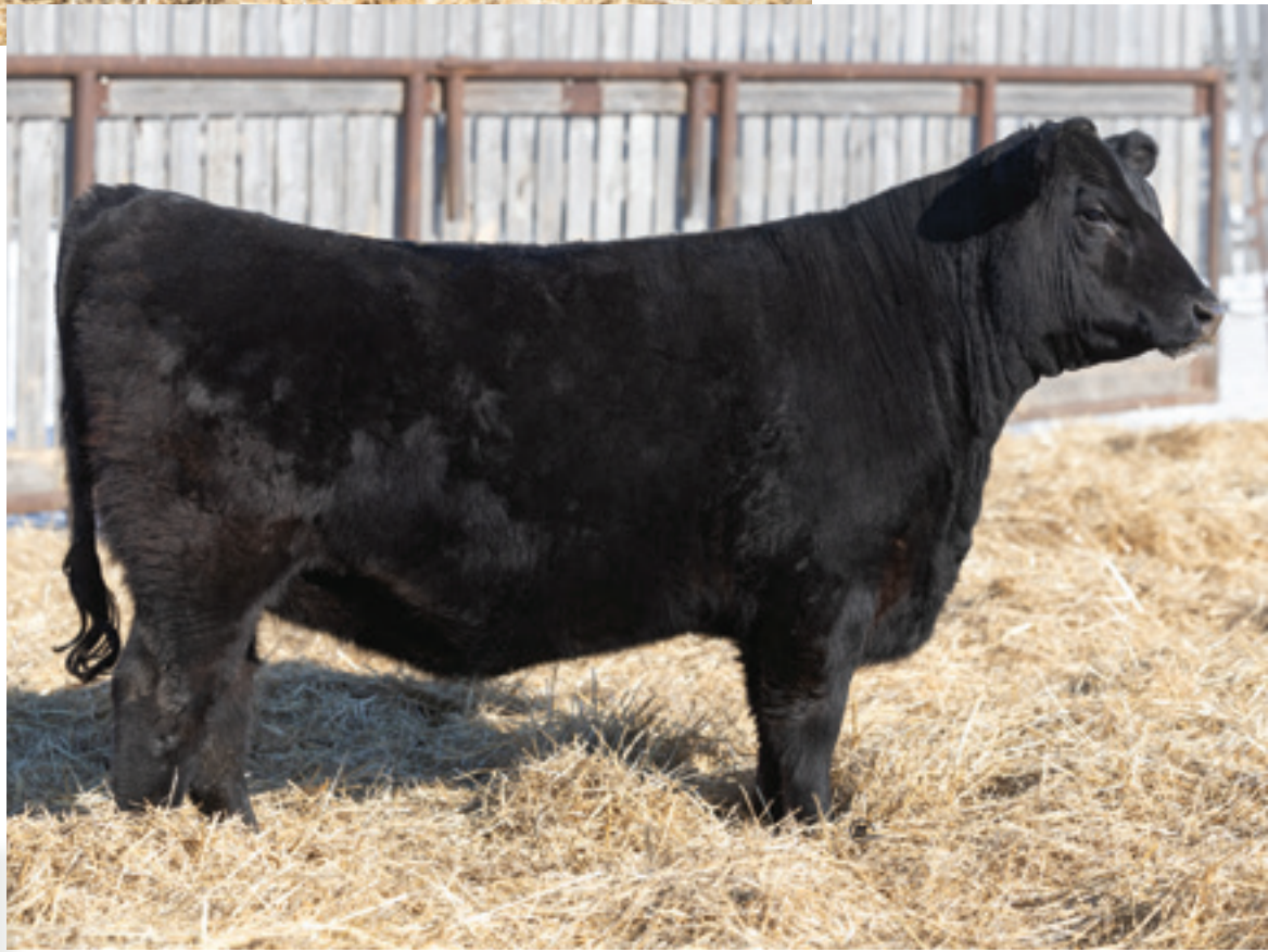
DAM OF LOT 14

4G Miss Mary 445M is a full sister to the Lot 3 and 5 bulls in the sale. You can see the consistency in all three of them. Easy doing, long, thick, moderate framed and all 3 have great hair coats. She should have a beautiful udder just like her mother.