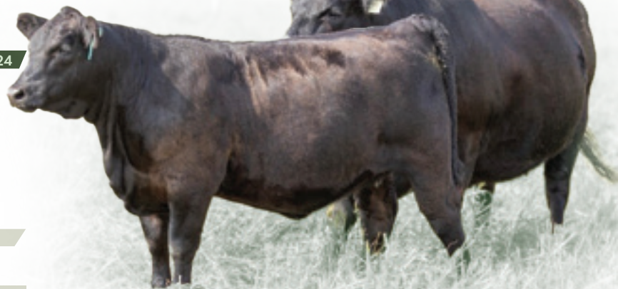
LOT 13 PICTURED WITH DAM

4G Miss Ultra 444M is a real sale feature. This SAV Certified daughter is about as complete as you can make one. She is the easy doing type with a nice attractive head, big bodied, lovely hair coat and a nice quiet disposition. Her mother is the real easy doing kind. A real pleasure to be around.