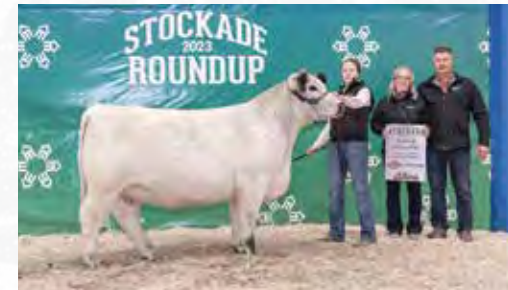
Grand daughter of GNK 10B

If you're looking for consistent POWER and PERFORMANCE look no further. Year after year 10B brings in one of the best calves every fall. Big and so beautifully marked, MS Shawnda was one of our very first females at INC and is still one of our best. Proven longevity here, folks. Take your pick of these pairings or take 'em all!