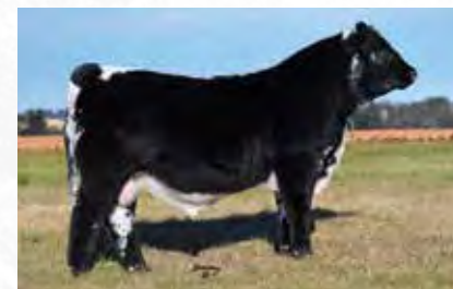
INC Talladega 11J