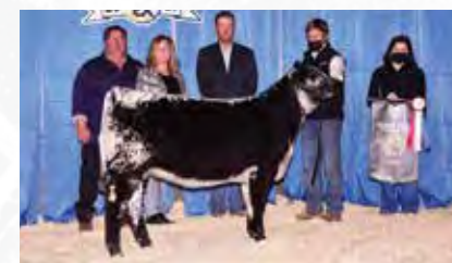
INC Mustang Sally 39J - Maternal Sibling