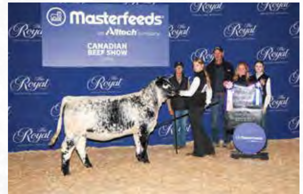
RESERVE INTERMEDIATE HEIFER CALF RED MAPLE LOVELY LADY 2L ROYAL AGRICULTURE WINTER FAIR