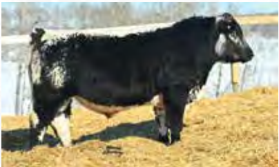
Outback Nevada 27K - Service Sire

Proven old school genetics in a tremendous package. Big. Bold. Beautiful. That's Emmylou. Bred to Outback Nevada 27K. Due to calve late Jan-Feb. Consigned by INC Cattle Company