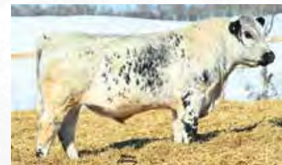
Outback The Stetson 26K - Service Sire

Bred to Outback The Stetson 26K. Due to calve late Jan-Feb. Consigned by INC Cattle Company