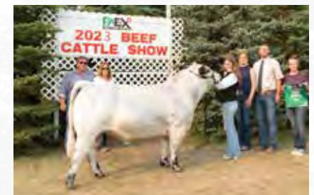
RESERVE GRAND CHAMPION BULL INC VALLEY OF THE KINGS 6K