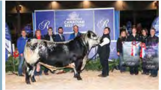
Crushin' It 20J - Sire