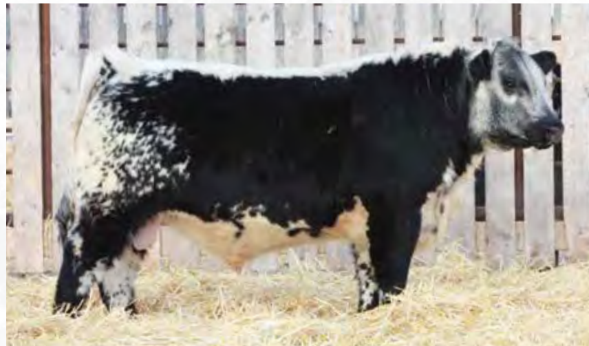
JSF 43H - Full Sibling to Embryos