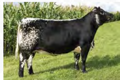
Maternal sister to 62F