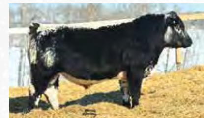
Outback Nevada 27K - Service Sire