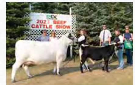
GRAND CHAMPION FEMALE INC CARNIVAL RIDE 67J