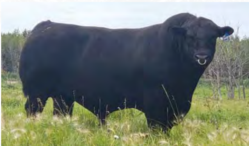
JSF Unmarked 2D - Sire