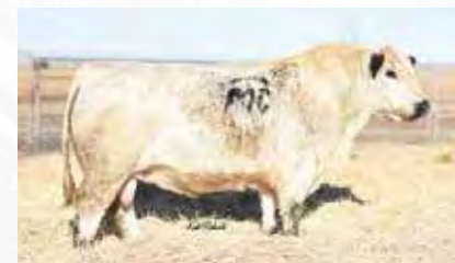
McMurry Speckle Park 300X 64L 524C- Sire