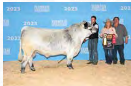
CHAMPION SENIOR YEARLING BULL INC VALLEY OF THE KINGS 6K FARMFAIR INTERNATIONAL 2023