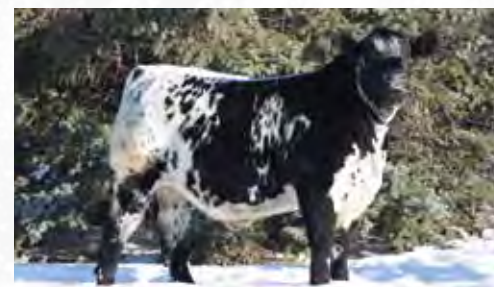
Yellowstone - Grand son