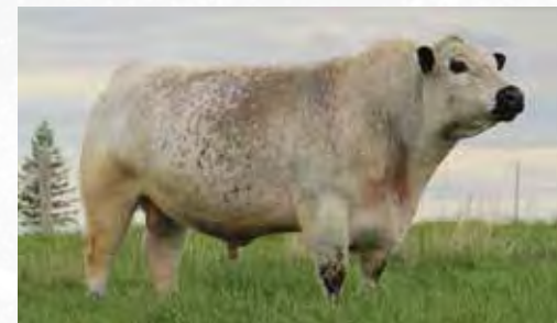
Moovin Zpotz Dart 37D

Polled PP Coat Colour: E D / E D Myostatin: Non-Carrier