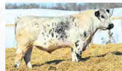
Outback The Stetson 26K - Service Sire