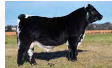
INC Talladega 11J - Sire