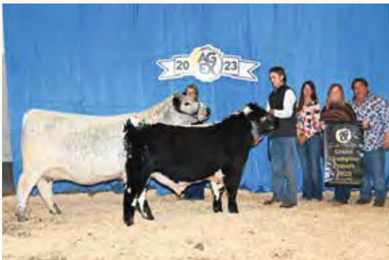
GRAND CHAMPION FEMALE INC CARNIVAL RIDE 67J & INC NAPOLEAN 111L MANITOBA AG EX 2023