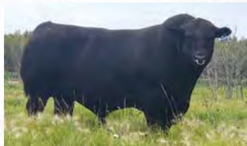
JSF Unmarked 2D

Polled PP Coat Colour: E D / E D Myostatin: Carrier