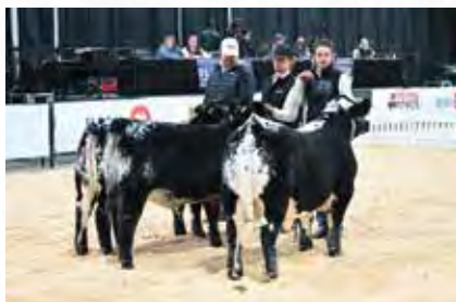
GET OF SIRE FARMFAIR INTERNATIONAL 2023