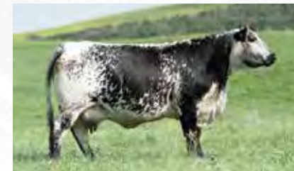
Pine Valley Anna 4C - Dam