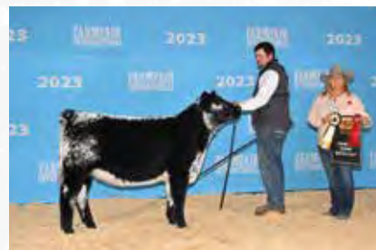
SENIOR HEIFER CALF CHAMPION INC COSETTE 44L FARMFAIR INTERNATIONAL 2023