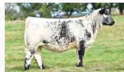
Red Maple Lovely Lady 2I - Paternal Sibling