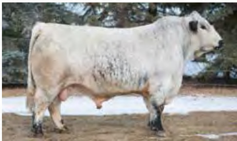
Colgan's Baxter 1B - Sire

Polled: PP Coat Colour: E D / E D Myostatin: Non-Carrier