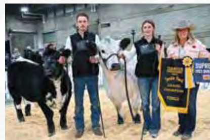
GRAND CHAMPION FEMALE FARMFAIR INTERNATIONAL 2023