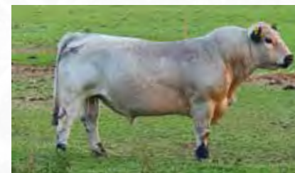
Parkvale Mark- Sire