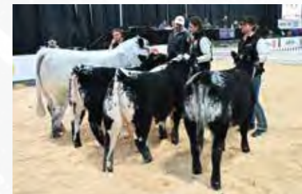
BREEDERS HERD FARMFAIR INTERNATIONAL INC TALLADEGA 11J CALVES