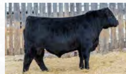
RH 916G Kodak Black 226K - Service Sire

Bred to RH 916G Kodak Black 226K. Due to calve late Jan-Feb. Consigned by INC Cattle Company