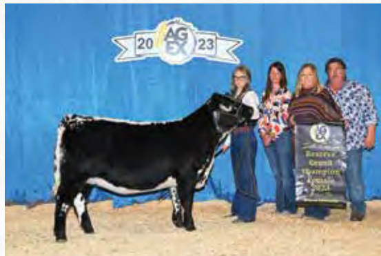
RESERVE GRAND CHAMPION FEMALE INC CENTERFOLD 80L MANITOBA AG EX 2023