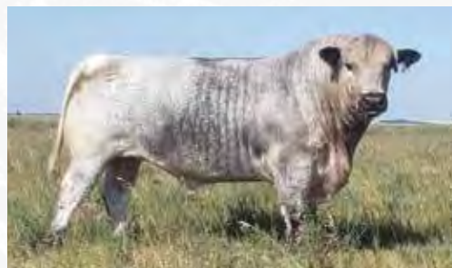
Moovin Zpotz Frank 19F

Polled PP Coat Colour: E D / E D Myostatin: Non-Carrier