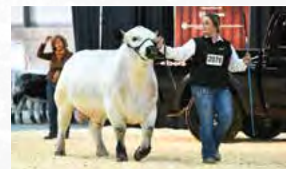
Andchris Boomerang 7F - Sire