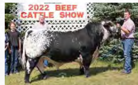
Notta 305E Prime Time 312H - Sire