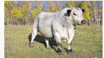
INC Assassin 777G- Sire