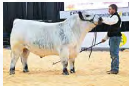
INC VALLEY OF THE KINGS 6K FARMFAIR INTERNATIONAL 2023