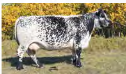
Progeny of Codiak Ms Shawnda GNK 10B and CAJA Zeppelin 1B - Son

CAJA Zeppelin 1B x Codiak Ms Shawnda GNK 10B