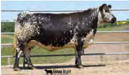
Star Bank Witches Brew 16W - Dam