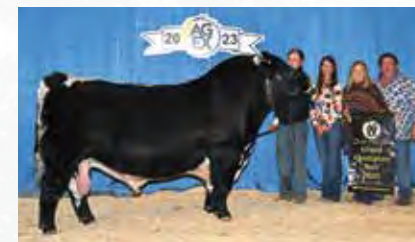
INC Talladega 11J - Sire