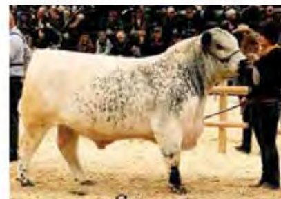
Outback Joey 25D - Sire