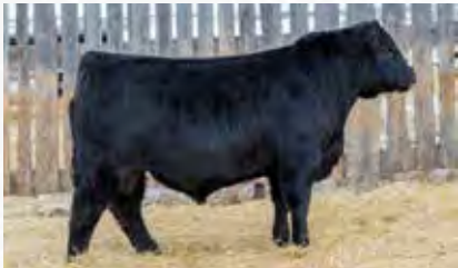
RH 916G Kodak Black 226K - Service Sire