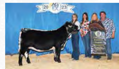
INC Centerfold 80L - Full Sibling Reserve Grand Champion Female Manitoba AgEx 2023