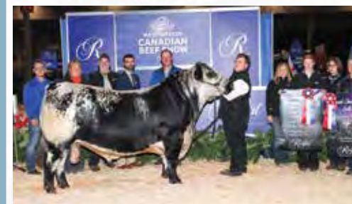
Crushin' It 20J - Sire