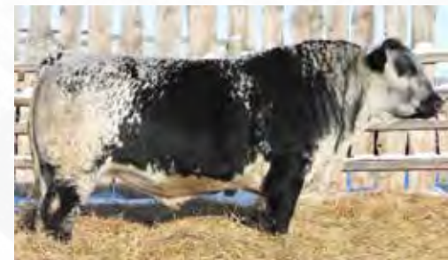
JSF Impact 5H

Polled PP Coat Colour: E D / E D Myostatin: Non-Carrier