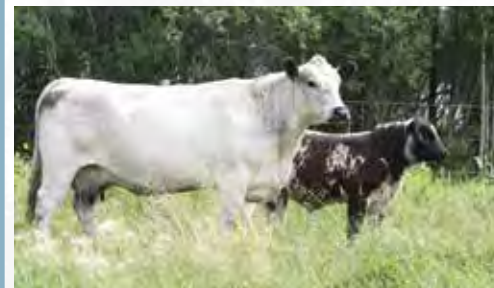
JFS 62F - Full Sibling to Embryos