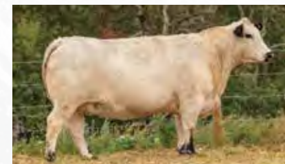
Codiak Beckah GNK 92B - Grand Dam