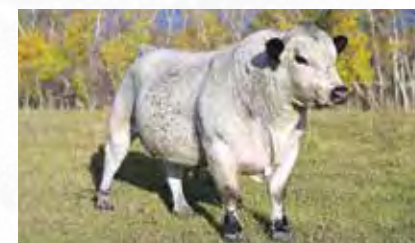
INC Assassin 777G - Service Sire