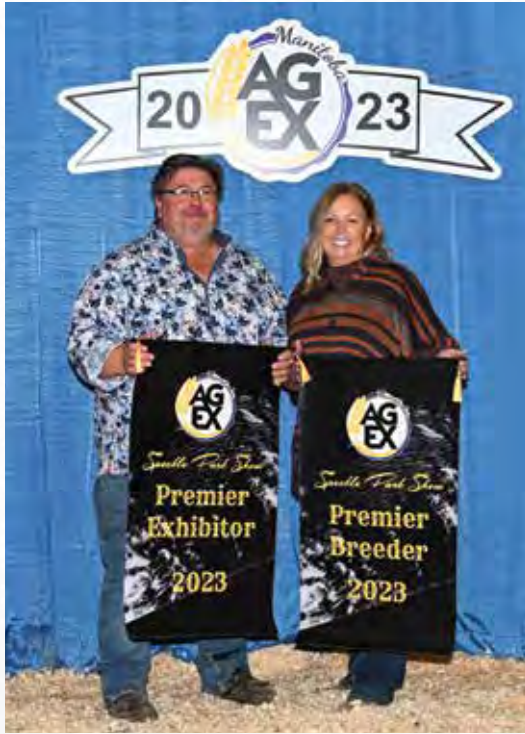
PREMIER BREEDER & EXHIBITOR MANITOBA AG EX 2023