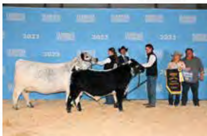
GRAND CHAMPION FEMALE FARMFAIR INTERNATIONAL 2023