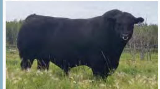
JSF Unmarked 2D- Sire