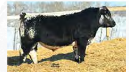
Outback Nevada 27K - Service Sire