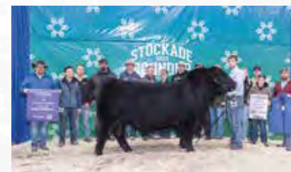
Greenwood Coal Train 84J- Sire