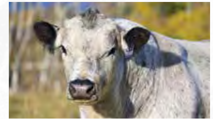
INC Assassin 777G