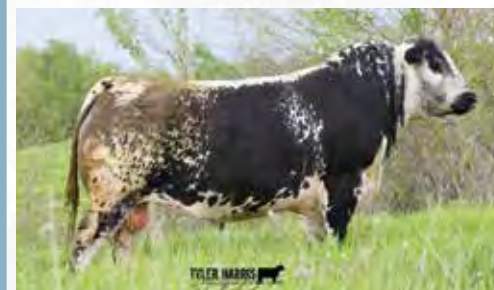
CAJA Zeppelin 1B - Sire