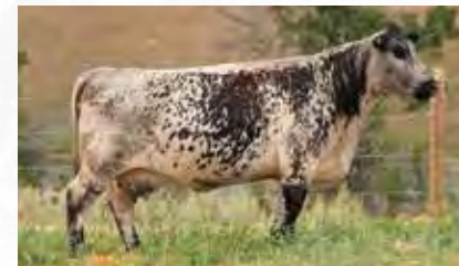
Diamond K Tazzy 02Z - Dam