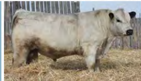
JSF Trade Secret 11A - Sire