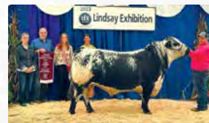
2023 Lindsay Exhibition

Stored at Bow Valley Genetics. Qualified for USA/CAN/AUS Consigned by INC Cattle Company