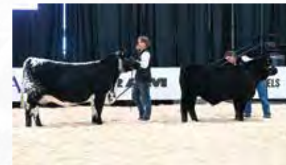
Dam - Reserve Champion 2 Year Old Cow/ Calf Pair FarmFair International 2022