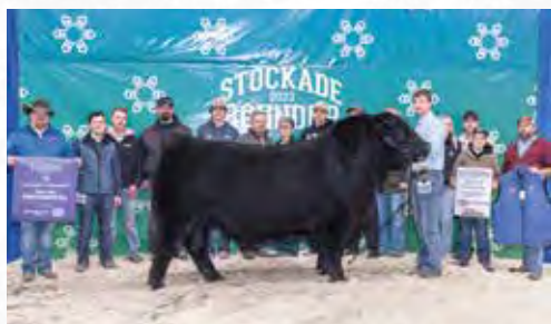
Greenwood Coal Train 84J - Sire

Polled: PP Coat Colour: E D / E D Myostatin: Carrier