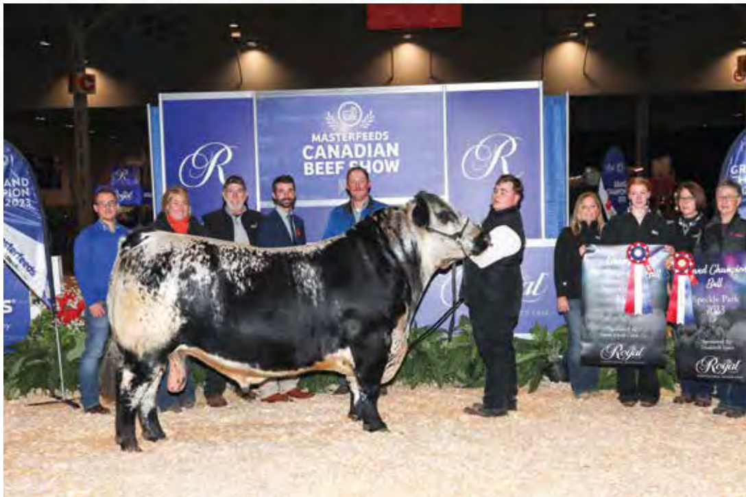
GRAND CHAMPION BULL ANDCHRIS JUST CRUSHIN' IT 20J ROYAL AGRICULTURE WINTER FAIR