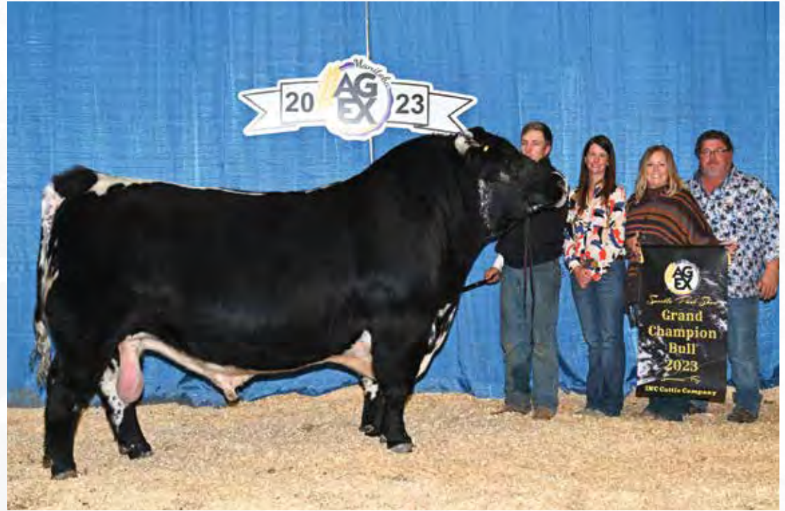
GRAND CHAMPION BULL INC TALLADEGA 11J MANITOBA AG EX 2023