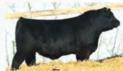
Outback King Pin 1K - Maternal Sibling High Selling Yearling Leading Edge 2023