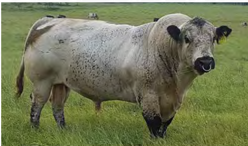
Codiak Spencer GNK 52B - Sire of JSF 9E