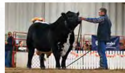
INC Talladega 11J

On offer are ten packages of North American qualified semen, each containing 5 straws. Stored at Bow Valley Genetics. Qualified for USA/CAN Consigned by INC Cattle Company