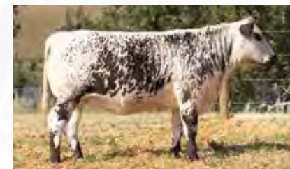
INC Heartbreaker 74H - Dam