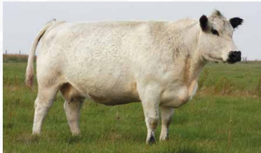
JSF Flora 8C - Dam of JSF 9E

Proven cows, hard working cows, just straight up good old cows. Paired with one of the most consistent sires of the breed. Cow families that work and produce year after year and through their progeny. When you find it, multiply it.