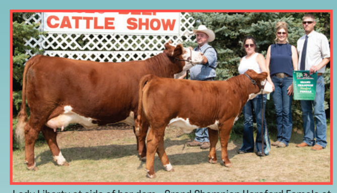
Lady Liberty at side of her dam - Grand Champion Hereford Female at PA Ag Ex

We reserve the right to 1 flush at the owner's expense and buyer's convenience.