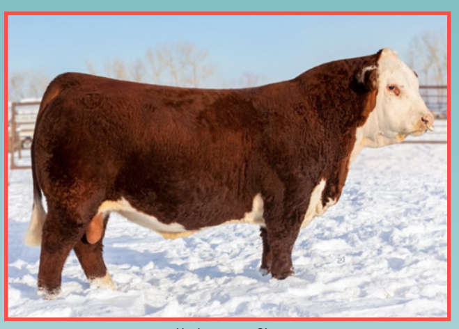
Hodgeman - Sire