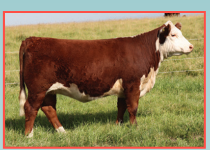
Remitall-W Destiny 52J - Mat Sister