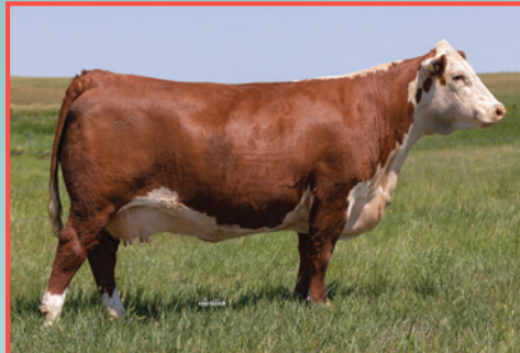
PCL A191 Real Lady 14F - Maternal sister to Lot 13 and high selling female in the Phantom Creek dispersal

Guarantee one pregnancy per package if implanted by a certified technician. Stored at Bow Valley Genetics. Canada, US and AU qualified.