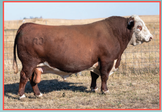
GHC C5 Attention 155E - Sire