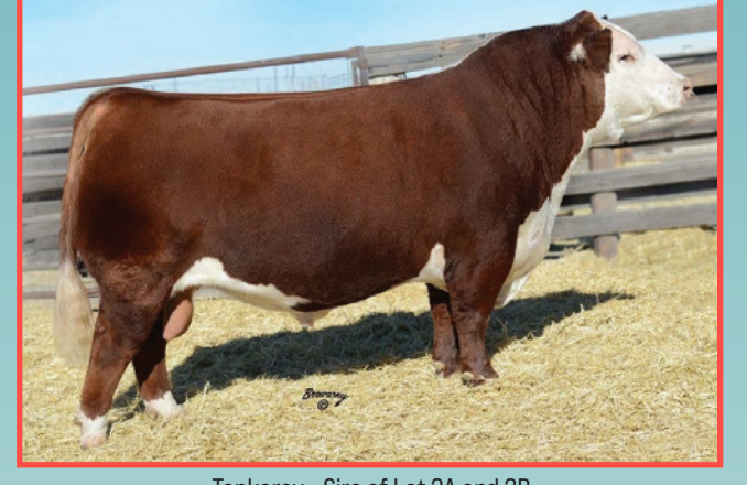
Tankeray - Sire of Lot 2A and 2B

Take your pick of these two full sisters MAN 206K and MAN 318L. Both females are explosive made, correct in their lines and packed full of cow power.