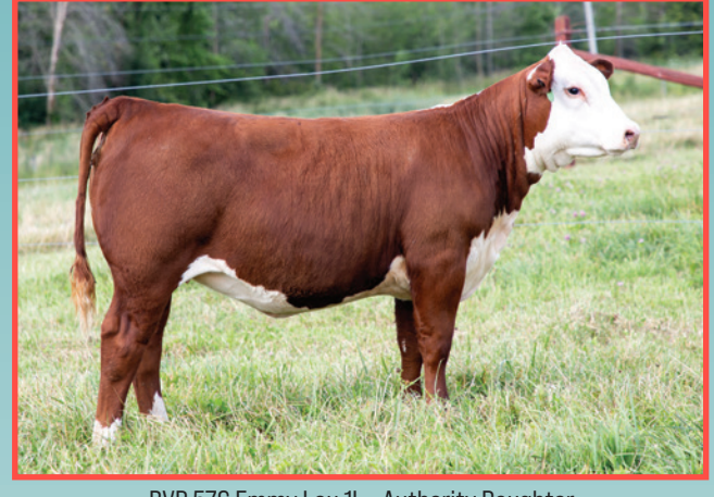
RVP 57G Emmy Lou 1L - Authority Daughter

CONSIGNED BY RIVER VALLEY POLLED HEREFORDS