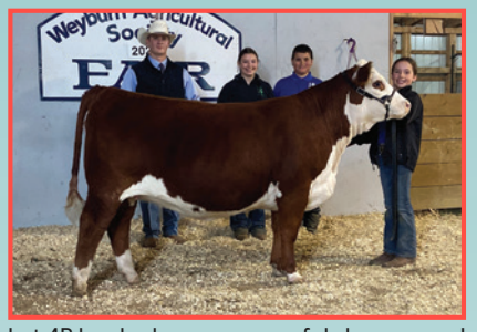
Lot 4B has had a very succesful show career!