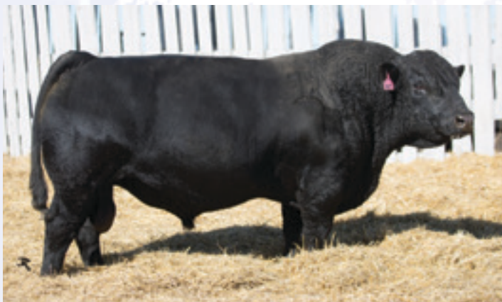
DOUBLE KL 158F | SON OF 158X