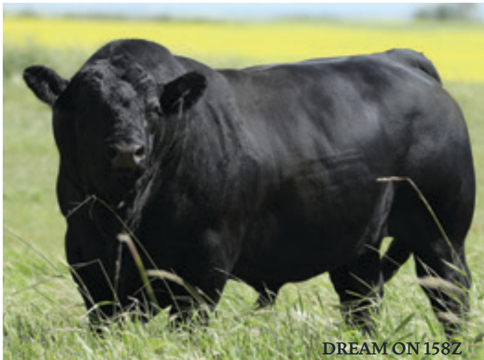
DREAM ON 158Z