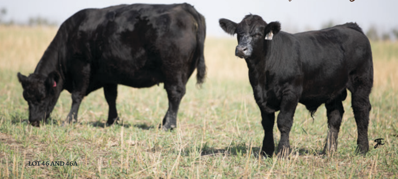
LOT 46 AND 46A