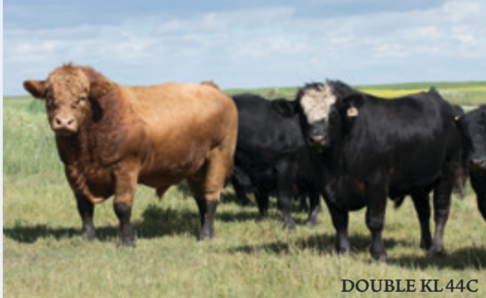
DOUBLE KL 44C