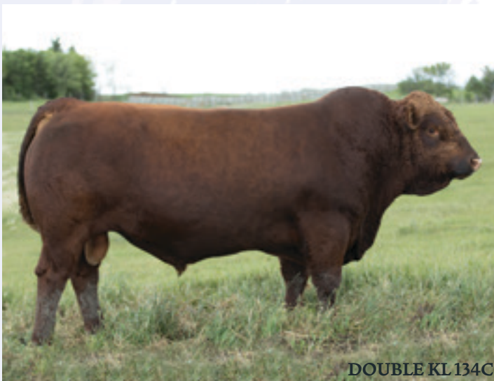
DOUBLE KL 134C

Observed bred on May 25 to Double KL 158F. Preg tested 3 ½ -4 months on October 13. Pasture exposed to LFE BS Lewis 3064H from April 25 to May 13, Double KL 158F on May 13 to July 3, LFE RS Lewis 3102G from July 3 to August 30.