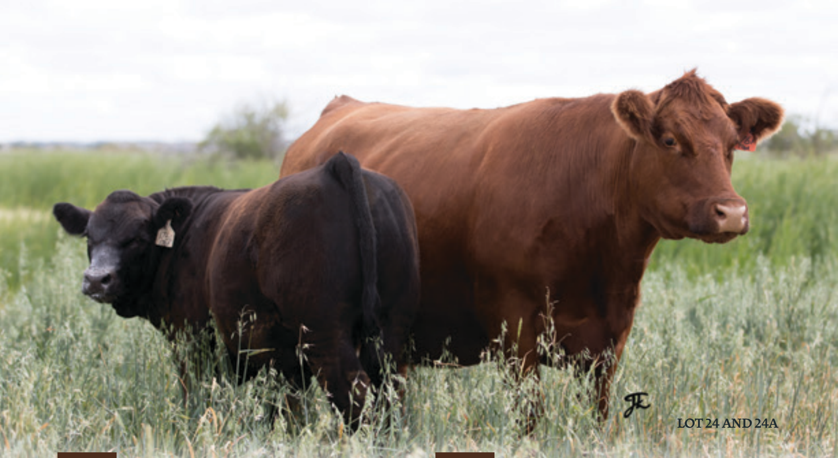
LOT 24 AND 24A