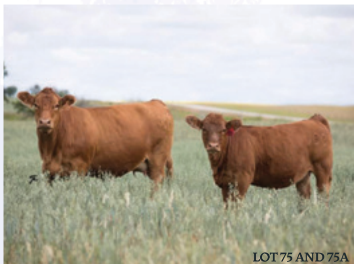
LOT 75 AND 75A