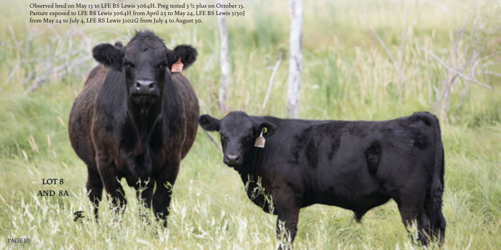
LOT 8 AND 8A

Observed bred on May 13 to LFE BS Lewis 3064H. Preg tested 3 ½ plus on October 13. Pasture exposed to LFE BS Lewis 3064H from April 25 to May 24, LFE BS Lewis 3130J from May 24 to July 4, LFE RS Lewis 3102G from July 4 to August 30.