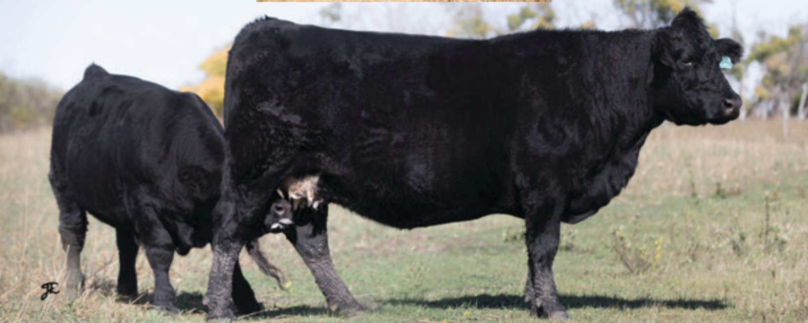
LOT 21 AND 21A