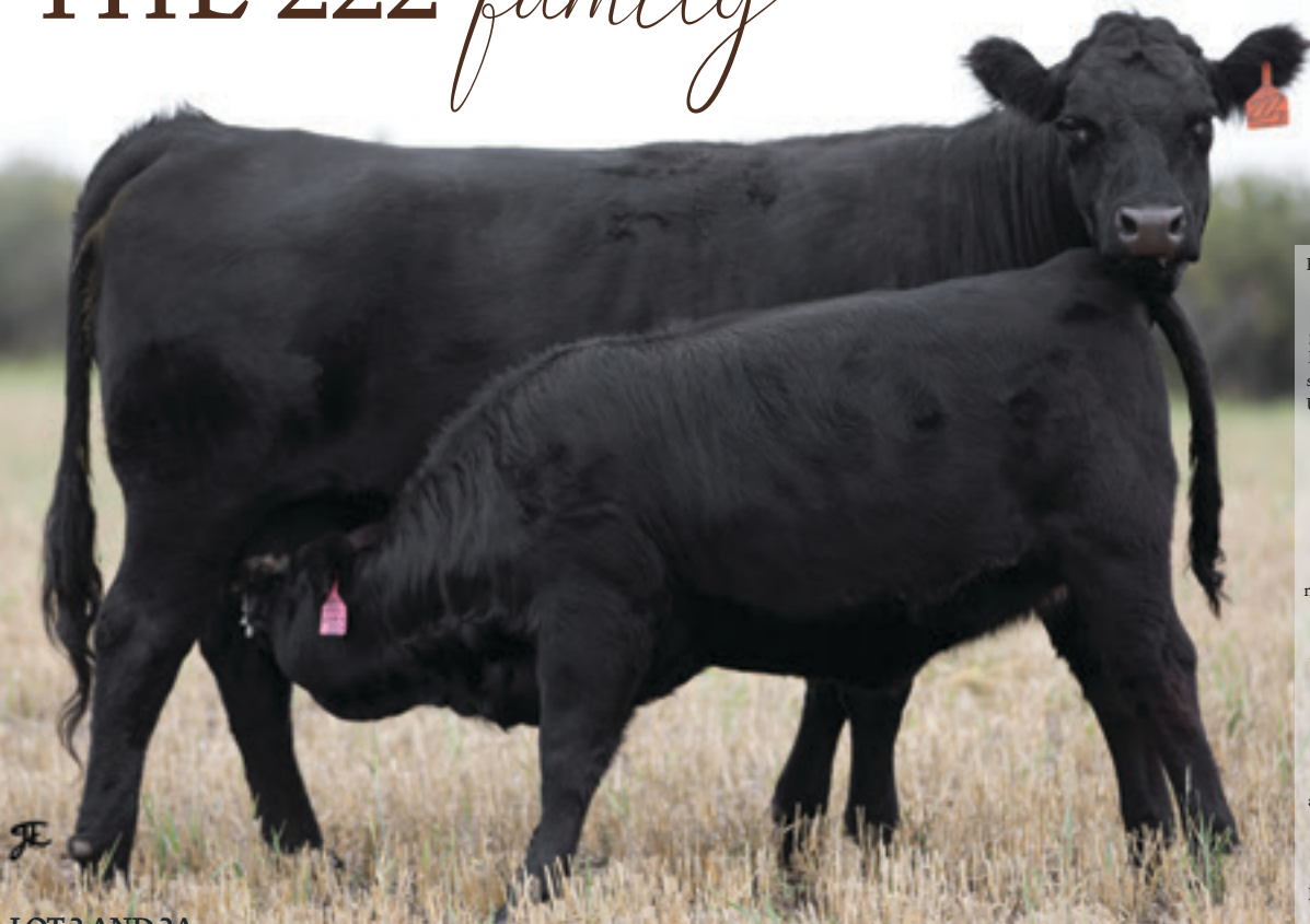
LOT 2 AND 2A

Probably one of the best foundation cows we incorporated into our herd. She is an EXT granddaughter and a sister to KKLP 176A. We were part of a synchronize program with the University AI'ing 400 heifers/year while trying different AI techniques I had 100 EXT daughters at one time. This was one of the reasons we stopped tagging calves at birth in the hills. They were MOTHERS – maternal monsters. 222A and 176A were selected for excellent docility. I always say if it comes from the 222 cow line, you want it! We have incorporated Simm and Angus back and forth in this family and they are all awesome cattle – go any direction you want. We kept and used every offspring from this family except a bull we let Scott and Trina Watson buy and a heifer that Colton Lazurko showed for 2 years as a 4-H heifer.