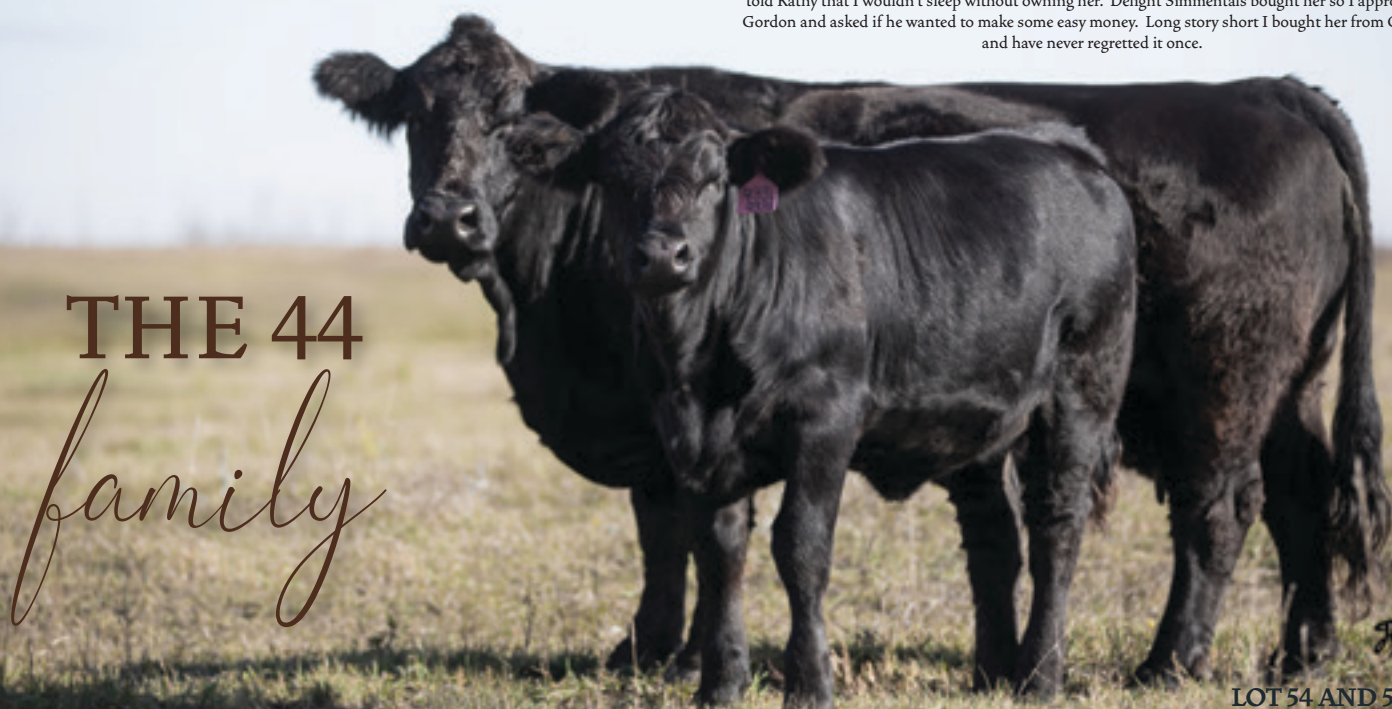
LOT 54 AND 54A