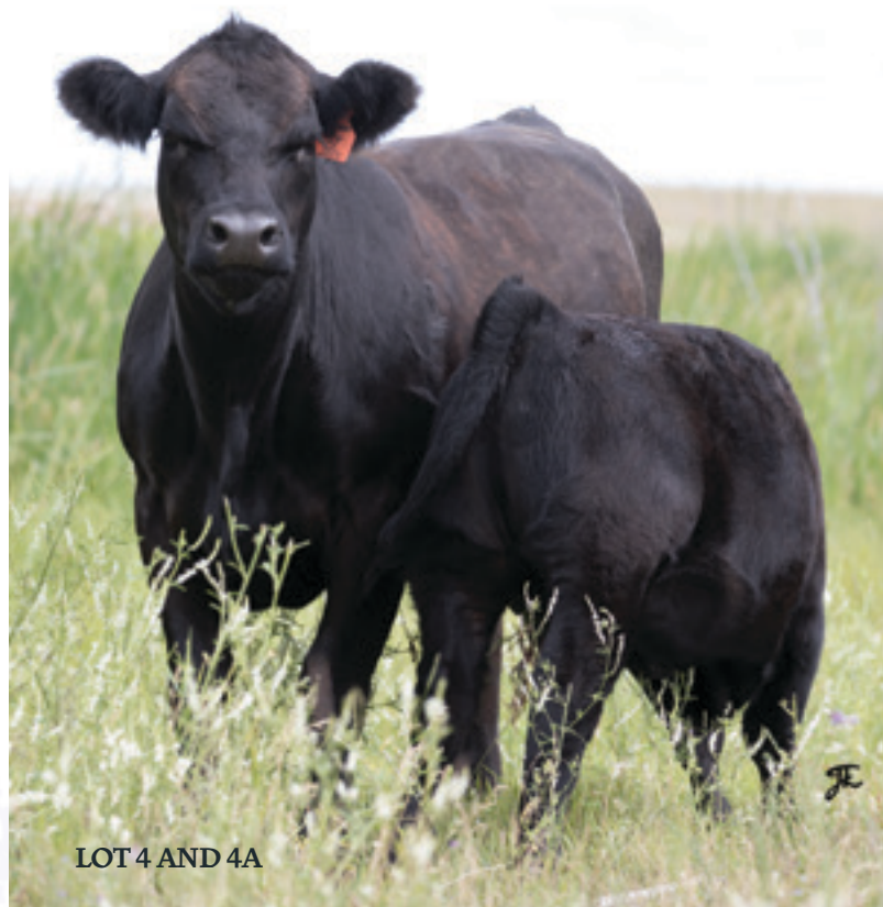
LOT 4 AND 4A

BW: -2.3 WW: 69.6 YW: 109.9 MILK: 19.6 MCE: 6.3