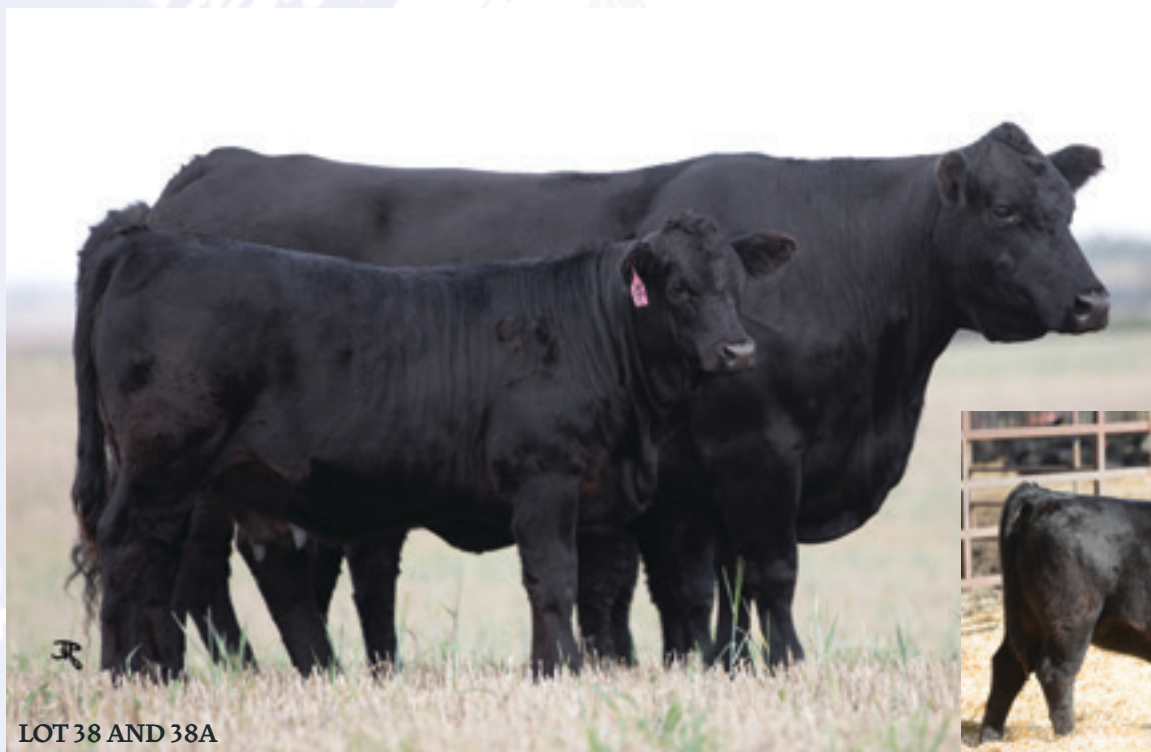
LOT 38 AND 38A