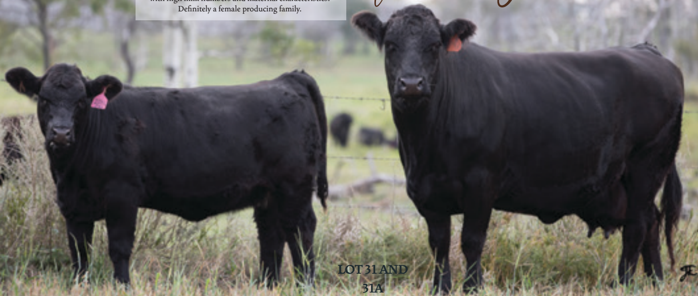
LOT 31 AND 31A

We purchased this Liner daughter from Bonchuk Farms to add some Liner to the herd – a very popular pedigree with high milk numbers and maternal characteristics. Definitely a female producing family.