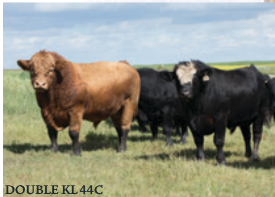
DOUBLE KL 44C

Preg tested 4 plus months on October 13. Pasture exposed to LFE BS Lewis 3064H from April 25 to May 24, LFE BS Lewis 3130J from May 24 to July 4, LFE RS Lewis 3102G from July 4 to August 30.