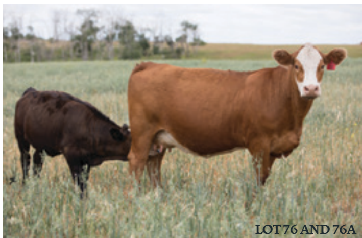
LOT 76 AND 76A