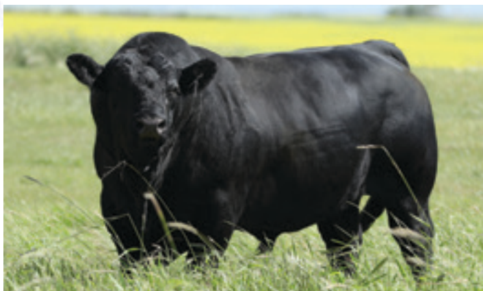
DOUBLE K L DREAM ON 158Z | SON OF 158X