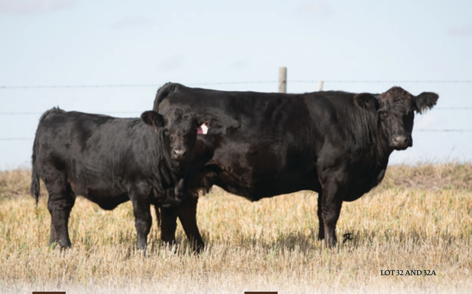
LOT 32 AND 32A