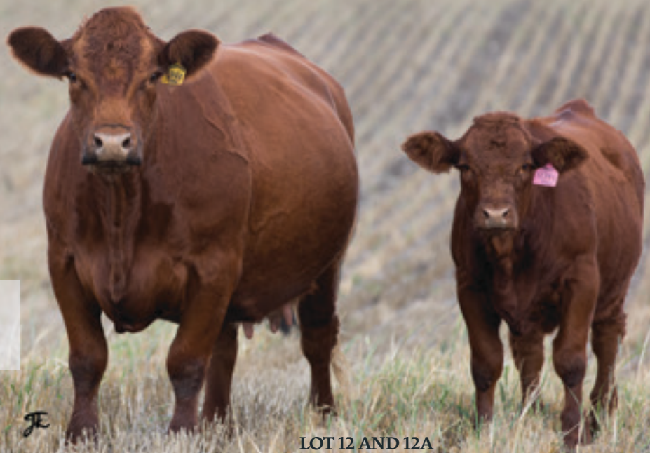
LOT 12 AND 12A

134A was one of the first females we purchased from Bonchuk Farms. A power cow sired by Sledge. We used her Sheriff son for years and he left some great females. We don't use a lot of red bulls but he was too good not to and he left some black daughters that are some of my favorites. Her offspring have a lot of strength.