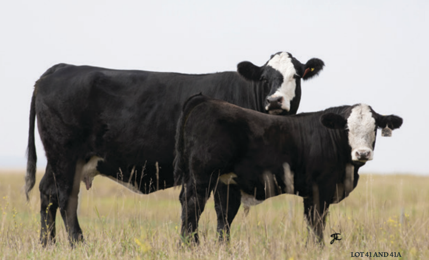
LOT 41 AND 41A