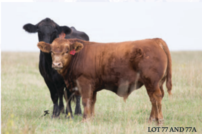
LOT 77 AND 77A

A really special baldy female with a little twist to her pedigree. Would make an awesome junior project that could be very competitive.