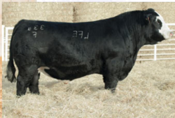
LFE GAME FACE 338F