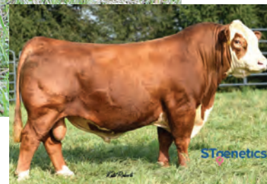
/S Mandate 66589ET - Service Sire

A snazzy Bolder daughter, moderately framed, correctly structured and an easy-going female. She ranks in the top 10% of the breed for calving ease and birthweight.