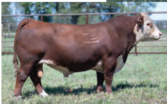
RST Final Print 0016 - Service Sire to Lots 24 and 22

Here is a young, bred heifer that is bred up early to Final Print. She is huge middled, stout made, with lots of bone. She is a standout when you walk in the pen. Very docile with a great temperament, the kind of female you love spending time with.