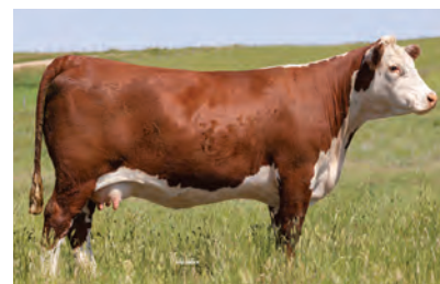
MAR Z303 Daisy Duke ET 5H - Dam