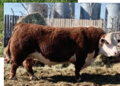
Square-D Longhaul 780E - Sire of Lot 31 and 32

Bred to JC 26B Kodiak 1K from April 12 to August 26 Preg checked to an early service