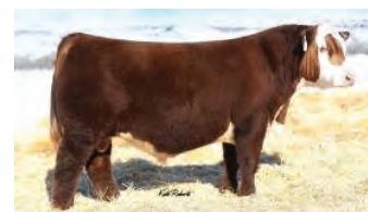
Churchill Desperado 029H - Sire