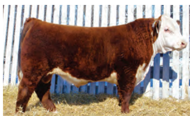
GRH 11E Ball Park 18J - Sire