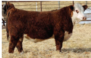
NJW 119E 87G Endorsement 216J - Service Sire