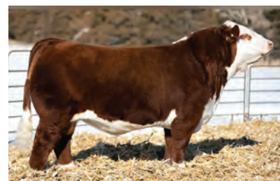
UPS Entice 9365 ET - Sire