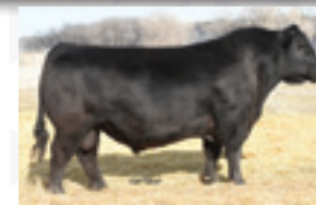
S A V CATALYST