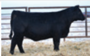
PICTURED AS A CALF