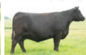
21F - PUREBRED RECIP