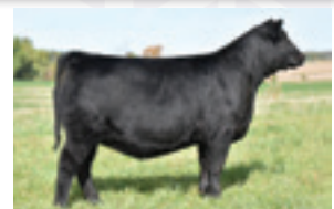
FULL SISTER TO DAM