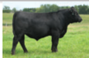
2023 BULL CALF