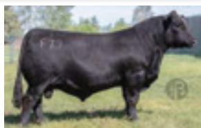
SIRE OF PREGNANCY