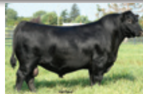
LOT 14 SERVICE SIRE