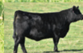
MAT SISTER & HIGH SELLER