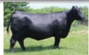
DAM OF SIRE