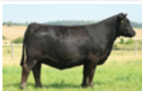
MAT SISTER TO PREGNANCY