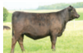
MAT SISTER TO PREGNANCY