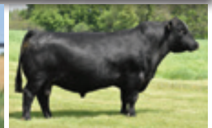
MATERNAL BROTHER TO DAM