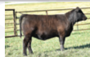
MATERNAL SISTER PAGE 9