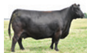
GRANDAM OF LOT 32 DAM OF LOT 33