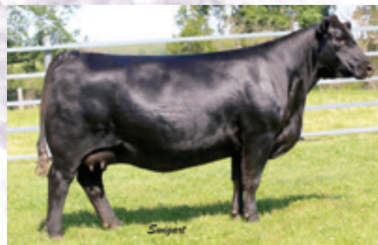
WERNER LADY 3003