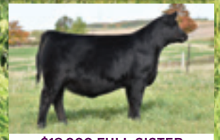
$19,000 FULL SISTER