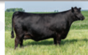
MATERNAL SISTER TO DAM