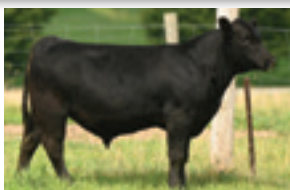
2023 BULL CALF