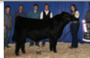
MATERNAL BROTHER TO DAM