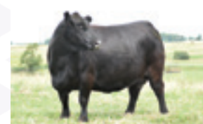
GRANDAM OF LOT 32 DAM OF LOT 33