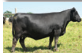
MATERNAL SISTER TO DAM