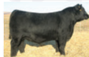
S A V QUARTERBACK