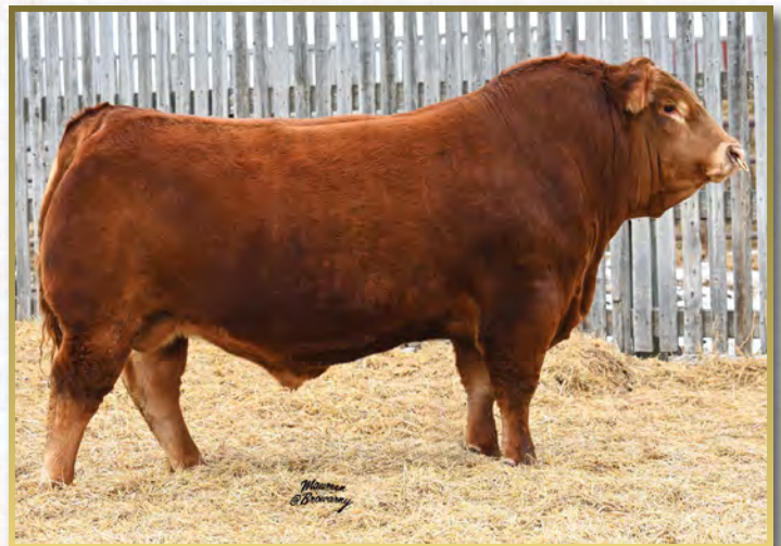
FULL BROTHER JYF JED 315J