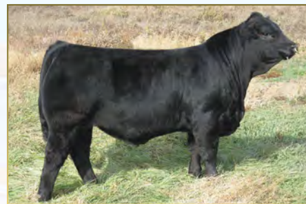
SIRE RPY GIBSON SHADE 27J ET