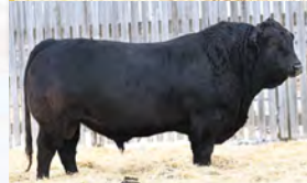
SIRE SYES JAPHETH 191J