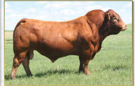
SIRE ROMN MADE TO ORDER