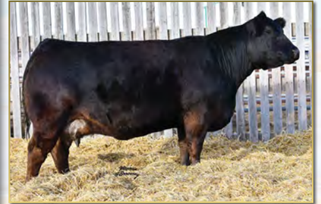
DAM JYF ESTER 23E