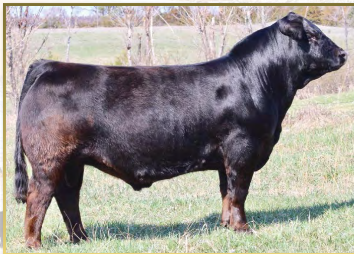
LFCL DENVER 857D