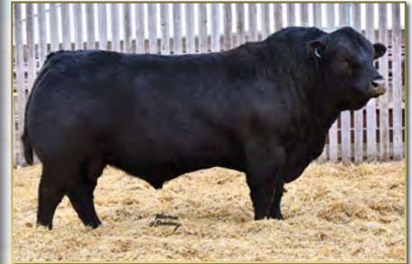
SIRE PLNS POLLED EXECUTIONER 19E