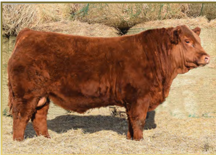
SIRE ANCHOR GOLD RUSH 48G