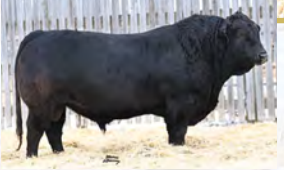
SIRE SYES JAPHETH 191J