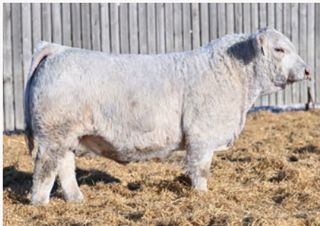
PATERNAL BROTHER KAY-R Frontier 815L $40,000 High-Selling Tapadero Son