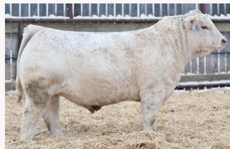
MATERNAL BROTHER KAY-R Virgil 59K