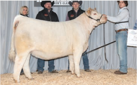
DAM KAYR ANNABELLE 100J 3/4 Sister to Lot 4

KAY-R Free Bird 4M has always been a big, stout, burly herd bull from a young age. 4M carries extra length of body that correlates to a longer hip, and smooth shoulder and neck design. His base width and extra shot of muscle makes him one of the biggest backed and stoutest hipped bulls in the entire offering. The Annabelle cow family backing Free Bird has simply been one of our best for decades now. The young standout Commissioner mother that put an impressive bull calf in the sale as a two-year-old, and a Burlington daughter that will without a doubt leave a major impact here. Lot 5 mother is a Commissioner Annabelle as well, and should leave no doubt about the consistency and extra high quality abilities Free Bird has to offer. Top 20% FAT, Top 25% WWT, Top 30% YWT, Top 35% MCW, MWWT and REA, Top 40% CE.