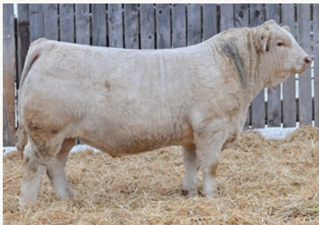
SIRE KAYR Quartermaster 24K