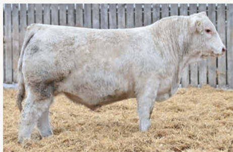
PATERNAL BROTHER KAY-R Rocco 810L $16,000 High-Selling Paternal Brother