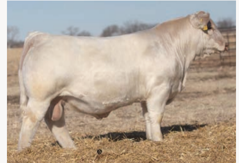
GRANDSIRE CCC Mescalito 9038 P