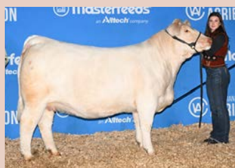
DAM KAYR Covergirl 265K Reserve Charolais Junior Female

KAY-R Drover 265M is as unique of a calving ease bull as you're going to find anywhere. Sired by the time-tested Revelation that proved himself as a great calving ease option, with quality maternal traits. Drover is backed by our Covergirl cow family, with his dam being a Milestone granddaughter. If you're looking for a heifer bull to improve the maternal traits in your cow herd, such as milk and teat placement without sacrificing any growth or mass, 265M fits the bill. He is extremely long bodied with the right shape and shoulder angle to be extremely easy calving. Drover is extremely soft and soggy in his centre body and carries more than enough muscle and volume in his hip and lower quarter. His mother was successfully shown as a calf and yearling heifer, and collected banners both years. 265M's outcross yet proven pedigree and extremely high-quality phenotypic build will make him an impact herd sire. Top 20% for BW and CE, Top 25% MK, Top 40% MWWT, Top 45% MARB.