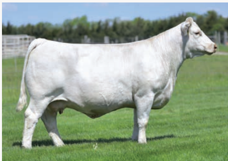
DAM KAYR Lainey 502C