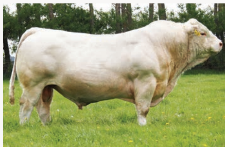
SIRE Silverstream Padra P7

KAY-R Unforgiven 125M has had an undeniable herd bull look from a very young age. He is exactly what a performance driven herd sire needs to look like. The Padra's have been extremely popular here for the added size, length, mass and extra hair. The first daughters have been coming into production here this year, and have really impressed us with the teat quality and mothering ability. Unforgiven's mother has been a donor cow for us here and has sold a handful of bulls into other purebred operations in her 15 years of production. 125M in our opinion is her best one to date. He has a big wide back with a stout hip that carries down into a large lower quarter. He is long, yet deep, and carries plenty of shape through his rib and body. He has a masculine yet eye appealing presence through his neck and head that adds to his overall eye appeal and look. Unforgiven has everything you need in a herd bull. Top 3% FAT, Top 30% REA, Top 35% MCE.