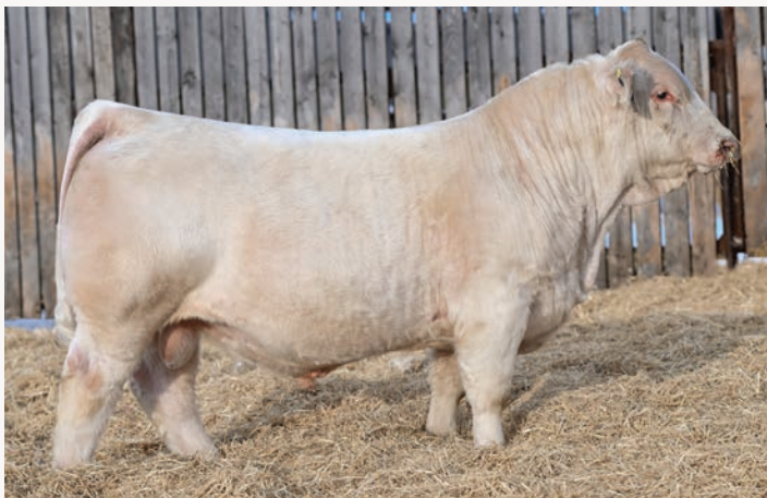
SIRE KAYR Burlington 502J

CE 15.6 BW -4.2 WW 64 YW 112 MM 24 MTL 56 | BWT 82