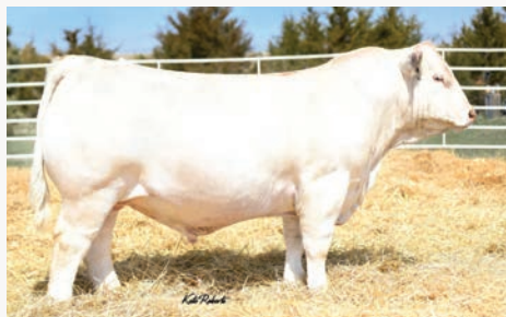
SIRE RBM Keystone H41

KAY-R High Life 825M is a true standout, and a bull we feel will leave an impact for years to come. Not every day do you find bulls with this much added mass and depth that still have enough extension and length. High Life has a ton of muscle all the way down his back and loin into a big square hip. He has a tremendous amount of eye appeal through his front third with a beautiful head shape. 825M is a middle of February calf that never took a day off, and has caught up to his pen mates. His mom is one of our favourite Commissioner daughters, and we have a lot of them. She has already raised a high seller that was extremely popular. If you're looking for a true phenotypic standout from a proven dam with a fresh desirable pedigree, then it's time to live the High Life. Top 3% MARB, Top 20% WW, CE and MCE, Top 30% MWWT, Top 40 YW, Top 45% SC and CW.