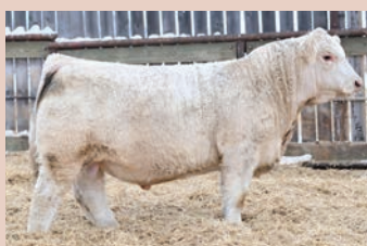
FULL BROTHER TO DAM KAY-R Cinch 727J

KAY-R Counting Up 234M is the first son to sell off RCR Counting Up, and if this is any indication of what the future holds for this young sire, we could not be happier. Nearly every calf born on our 45 first calvers will be of Counting Up and the ones on the ground so far come easier than any calving ease bull we have used. They get up and go, and don't look back. 234M has a presence and look that draws you to him, and when you learn he is a sure-fire calving ease bull, that is the icing on the cake. He has an abundance of mass and volume in his centre body. His extra length of body and smooth transition into his shoulder gives us added confidence in his ability to not only be an elite calving ease bull, but will not sacrifice any growth or performance. A full brother to the dam of 234M was a past high seller and the maternal sires in his pedigree with Free Lunch, Resource, Countdown and Tapadero are all the proof you need. Top 2% CE, Top 3% MCE, Top 5% BW, Top 15% SC and MARB, Top 25% REA, Top 30% YW, Top 35% MK and MWWT, Top 40% WW.