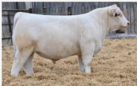
HALF SIB. KAY-R Tremor 7015L $20,000 High-Selling Paternal Brother