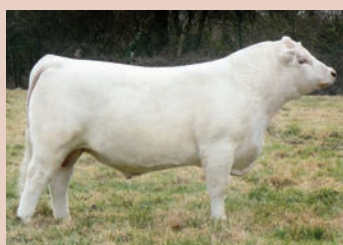
SIRE D R Revelation 467