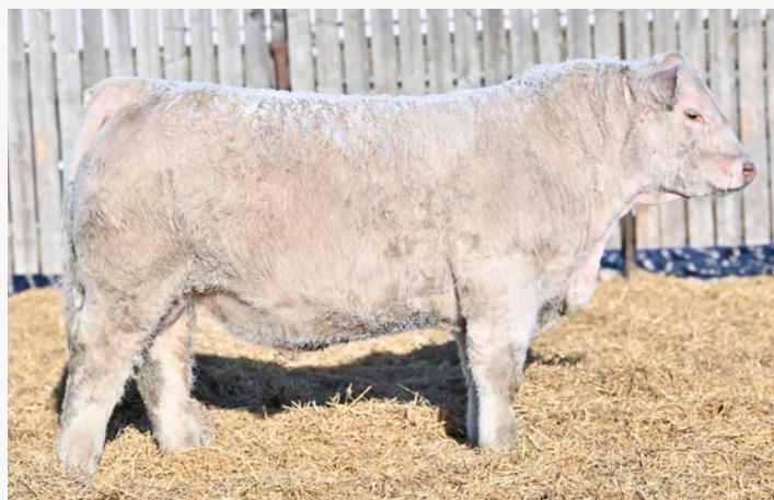
MATERNAL BROTHER KAYR Harrison 168L

CE 6.7 BW 0.7 WW 60 YW 105 MM 25 MTL 55 | BWT 95