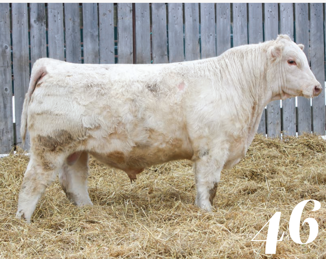
SIRE KAYR Fruition 26K

you get just that. Top 3% CE, Top 5% BW, Top 20% MCE, Top 35% MK.