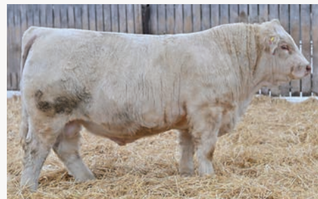
MAT. BROTHER KAYR RIGGINS 825K