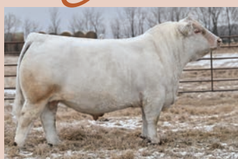
SIRE RCR Counting Up 1332 P