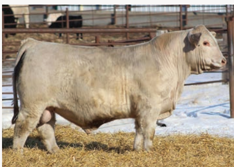
SIRE RBM H About Time K453