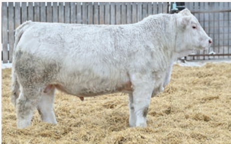
MATERNAL BROTHER KAYR Weston 507L