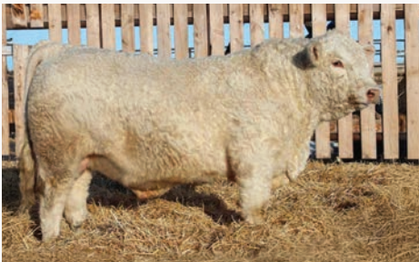
SIRE Sparrows Pascal 239K

KAY-R Boone 507M exemplifies exactly what a beef bull needs to look like with a bunch of extras that make him an extremely high-quality individual. Boone has a tremendous amount of length in the centre part of his body and through his hip. When you study him from behind, bold and soggy are two words that come to mind. His depth of body is truly massive and he carries that shape through his hip and lower quarter. 507M's dam couldn't be a more consistent producer, over the last 10 years every heifer calf has been retained in the herd, and every bull calf has not only made the sale but been a standout. If you are looking for a bull to improve your bull pen and leave you daughters that will make an impact, this is your bull. Top 4% FAT, Top 5% MK, Top 25% SC and MWWT, Top 30% for CE and REA, Top 35% for BW, Top 45% YWT.