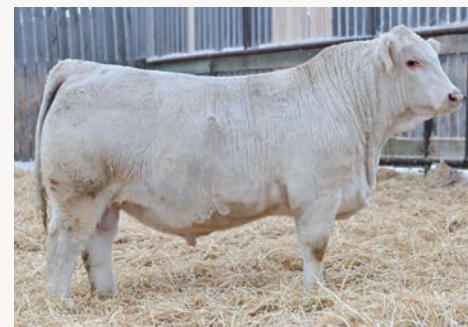
PATERNAL BROTHER KAY-R Luxor 1225K $30,000 High-Selling Tapadero Son