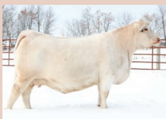
SIRE LT Badge 1538 PLD MAT SIB. TO DAM KAY-R Embellish 202K With Calf KAY-R Embellish 457M