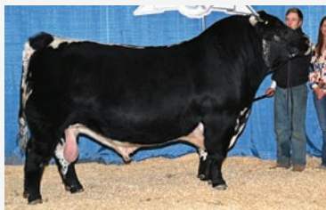
SIRE INC Talladega 11J