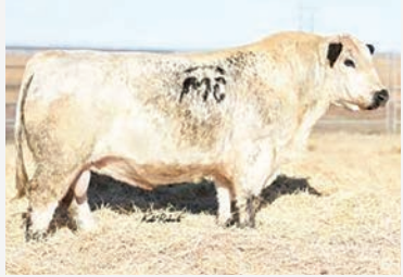
McMurry Speckle Park 300X 64L 524C Semen in packages B, C, & E