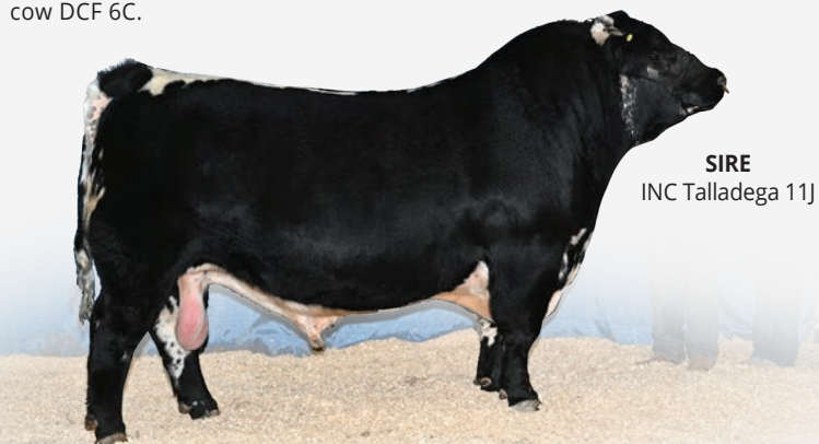
SIRE INC Talladega 11J