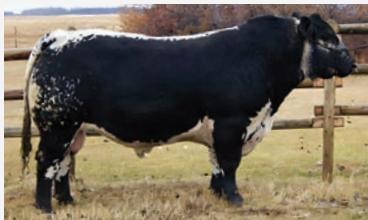
GRANDSIRE River Hill Traffic Jam 26T