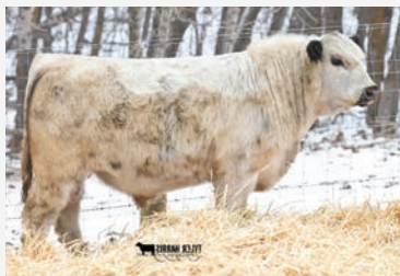
SIRE INC Breaking News 63F

INC Draft Pick 120L has his faults...he can't use chop sticks worth a damn, he doesn't know all the words to "Stairway to Heaven", nor can he play ping pong... if these things don't matter to you, but you do want one of the very best 2 year old bulls to come out of the 2025 Leading Edge sale, then 120L is your boy. He has a top like a tennis court and fantastic wheels under him. A very good bull with many years in front of him.