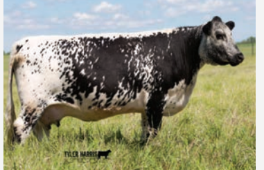
GRANDDAM Pura Vida Franchesca 2T DAM Pura Vida Conchita 67C