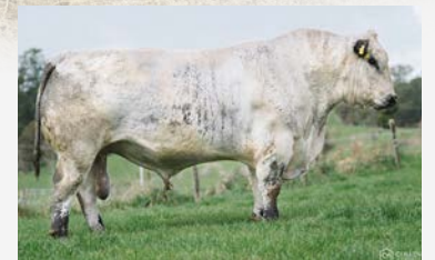
MAT. GRANDSIRE OF KEYNOTE 19K Premier 101Y Logic L11