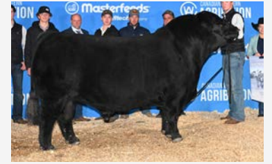
SIRE Greenwood Coal Train 84J

205D WT: 648 lbs APRIL 8/24 WT: 962 lbs MARB: 3.9 REA: 10.82 %LMY: 66.31 BF (mm) : 1.20 As far as we know INC Silent Running 98L has never been in trouble with the law, although he did try to run away from home when he was little. We found him down the road, a couple of miles from home, crying for his mom. 98L is a big bull with a soft demeanour. He offers ample scrotal and plenty of length. Silent Running is ready to work and will last a long time in your herd. As solid as they come.