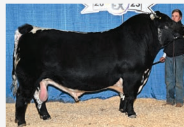
SIRE INC Talladega 11J

With a commanding presence, beautiful extension & perfect structure, INC National Post 11M is a tremendous yearling. Handsome enough to be on the cover of GQ magazine, 11M seemingly glides when he walks. With a big performance momma behind him, this Talladega son has been a standout from Day 1. National Post is the type of calf on which legends are built.