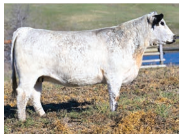
DAM INC All Aboard 190J