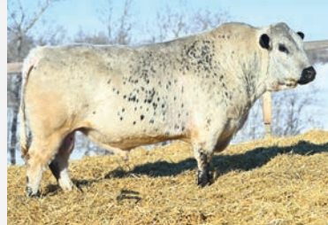
INC Goliath 747G Sire of embryos in Packages A & B