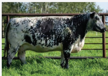
DAM Codiak Nancy GNK 48A

INC Big Deal 25M is .... well... a damn big deal. Big hip, big top, and long as an old man's story, Big Deal is ready to go to work. Tough to find one better. Another outstanding Talladega son.