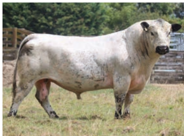
SIRE Maungahina Maximus

This is the last Rush Hour semen to be sold for the remainder of 2025.