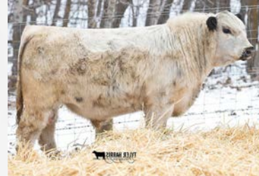
INC Breaking News 63F Semen in packages A & D