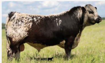
SERVICE SIRE River Hill 5C Freedom 805F