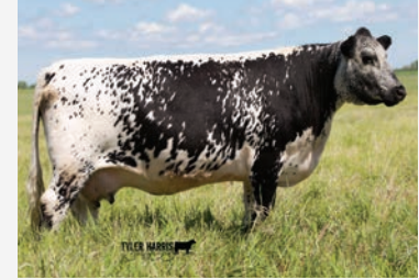
Pura Vida Conchita 67C Embryos in package E