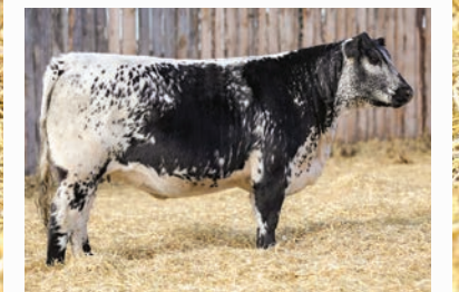
DAM KFC Josie 56J