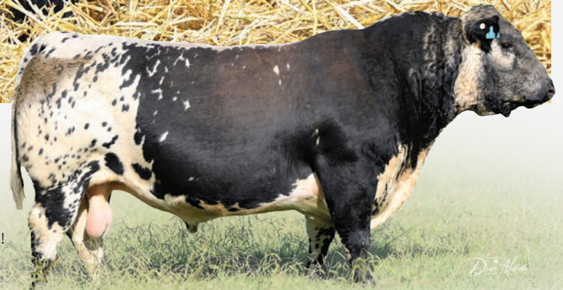
SIRE Matakana Rush Hour

BW: 86 lbs 205D WT: 503 lbs We've really liked what we've seen so far with our Rush Hour calves. He'll be used heavily again at Highmark. Great opportunity here!