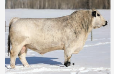
MAT. GRANDSIRE OF JADEN 32J Wrangler Mr Perfect 8D