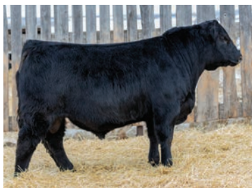
SIRE RH 916G Kodak Black 226K

Gran Torino is special - no he can't juggle flaming knives or recite the multiplication table - but INC 18M is a cut above nonetheless. Smooth from nose to tail, Gran Torino shares his sire's style while his momma places easily in the top 5% of the INC herd. Lots of depth and made right, 18M will not disappoint. A very, very good calf.