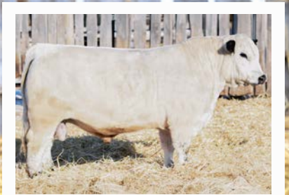
SIRE River Hill L11 Horatio 005H