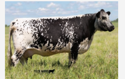
SIRE Black Diamond Marcho Man DAM Pura Vida Conchita 67C