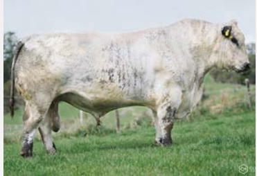
Premier 101Y Logic L11 Sire of embryos in Packages A, C, & D

Without a doubt, these are some of the most diverse & intriguing offerings ever made by INC. These groupings are chock-full of some of the very best frozen genetics in the breed. Buyers can get a bit of everything here - buy one or take 'em all. A fantastic opportunity for new breeders and established herds alike. It's not often you see a line up such as these, bundled together in a bow tied Easter basket!