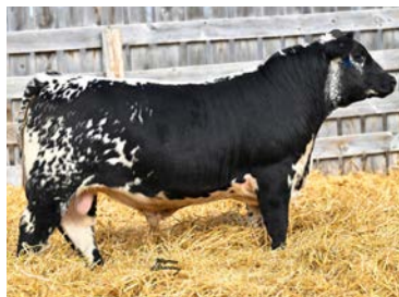
Son Highmark Montezuma 21M