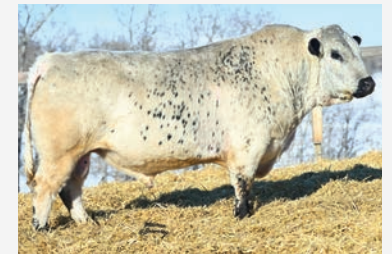
SIRE INC Goliath 747G

BW: 69 lbs 205D WT: 545 lbs I'm pretty sure it's illegal to be this pretty....INC Peggy Sue 33M will be one of the finest mommas in the breed. Gorgeous extension with a big middle and plenty of hip, 33M has generations of proven females before her, on both sides. A truly magnificent young lady.