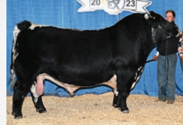
INC Talladega 11J Semen in packages A, B, & C