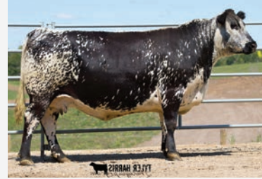
Star Bank Witches Brew 16W Embryos in packages B, D, & E