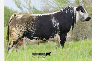
CAJA Zeppelin 1B Semen in packages B & C