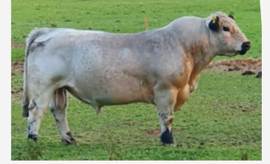
SIRE Parkvale Mark

205D WT: 661 lbs APRIL 8/24 WT: 938 lbs MARB: 4.7 REA: 10.98 %LMY: 66.34 BF (mm) : 1.30 INC United Front 85L will be a home run hit for the new owner. For the purebred producer he offers some diverse genetics while the commercial cattleman can count on big, growthy calves come sale day. A big bull with an easy stride, United Front is smooth-shouldered and is easy to work. A standout from the beginning.