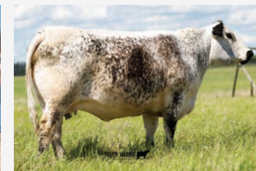
DAM Pura Vida Alejandra 39A