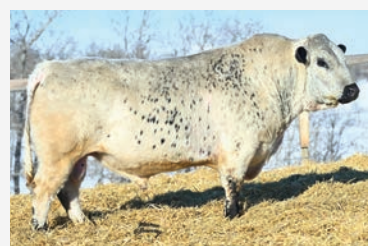
SIRE INC Goliath 747G