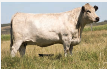
DAM Upto Specs Willa 17W

After this one, there ain't anymore. This is the last of the All Star pairing of Talladega & Willa 17W. To claim that INC Siberia 227L is merely a tremendous bull, it would be like saying the Eiffel Tower is kinda tall. Power. Performance. Perfection. Siberia is show-stopper good. Thick & long & deep. You can feel his presence when you see him. If you want extra pounds on your calves next fall, look no further.