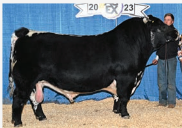
SIRE INC Talladega 11J