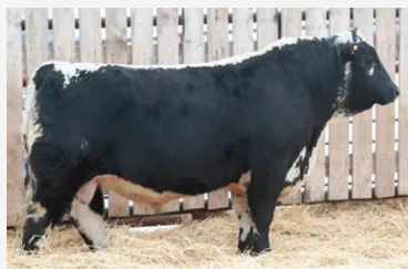
GRANDSIRE Codiak End to End GNK 802E

Here we go to another level with INC Incentive 181L. Not so very long ago we could only dream of owning a bull as good as Incentive, now we can offer him up to the world. He's the epitome of power & performance. Big feet, extra rib and so much depth. Simply a mass of black & white, ready to roam your pasture. 181L's calves will be killer good.