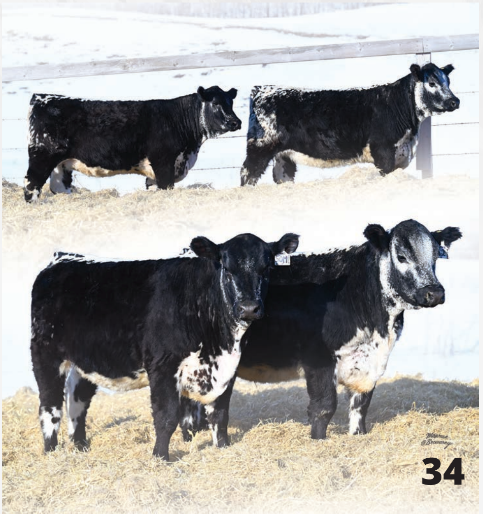
34 PEN OF 2 COMMERCIAL HEIFERS ANGUS / SIMMENTAL INFLUENCED