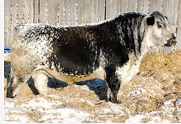
P.A.R. Moo Fassa 03M Sire of embryos in Packages D & E