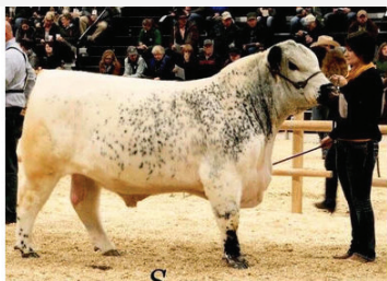
GRANDSIRE Outback Joey 25D

They don't get any better than this - INC Minefield 64L has the extra rib everyone wants, a hip the size of a Volkswagen and he moves as smooth as a stripper on the pole. 64L is so handsome, all the other bulls are jealous and the heifers bat their eyelashes at him whenever he walks by. You won't go wrong with this black Casanova.