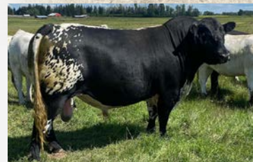
SIRE OF KEYNOTE 19K Colgan's Guardian 43G