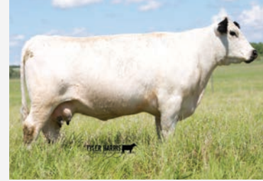
Pura Vida Callista 64C Embryos in package D