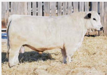
SIRE River Hill L11 Horatio 005H

Masterpiece represents what we're striving for in our females. His dam, Fancy Feet, walks on good feet, has the perfect udder, and breeds back first cycle consistently. Don't be concerned with the weights as Masterpiece was raised alongside his twin sister.