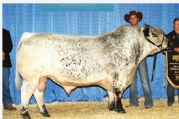
GRANDSIRE River Hill 60W Line Drive 54Z