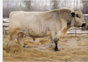
SIRE OF JADEN 32J CN Zpotz Zazu 2Z