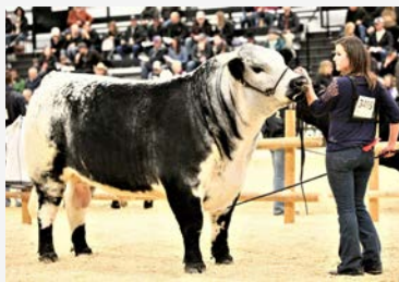
SIRE Underhill All Out 1D

Looking for something a little different? Check out INC Triple Play 26M's lines. Deep, thick and smooth moving, Triple Play has a great foot and plenty of muscle. Built for performance and longevity.