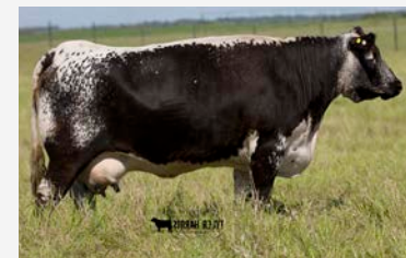
GRANDDAM Pura Vida Williamina 18W

INC Promotion 28M is so athletic it's a wonder he wasn't picked for Team Canada to play in the Four Nations Cup. It would have been awesome to see him on a line with Connor McDavid or to watch him kick Brady Tkachuk right in the head, knocking him simple. With a great set of wheels under him and muscles ripping under his beautiful hide, Promotion is the first round pick to play on your team.