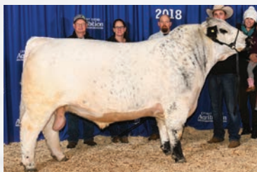
GRANDSIRE Wrangler Mr Perfect 8D

Mae looks to be heading right where we thought she would. Horatio now had daughters in many herds and they don't disappoint. And her dam is turning into a herd fav. Great upside here!!