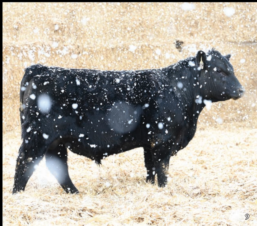
1 - GF Floressa 531H, Maternal Sister 2 - JL Floressa 5531, Dam