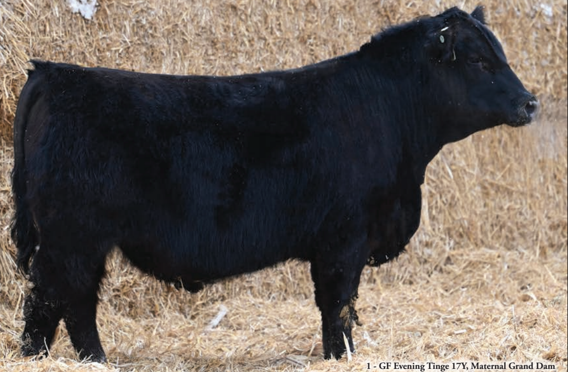
1 - GF Evening Tinge 17Y, Maternal Grand Dam