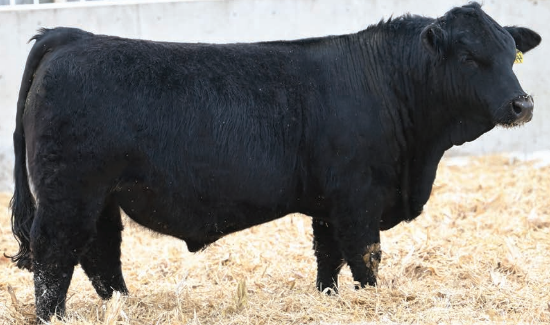
1 - R Plus Mandate 1044J, Sire 2 - Wepler's Jaelyn, Dam