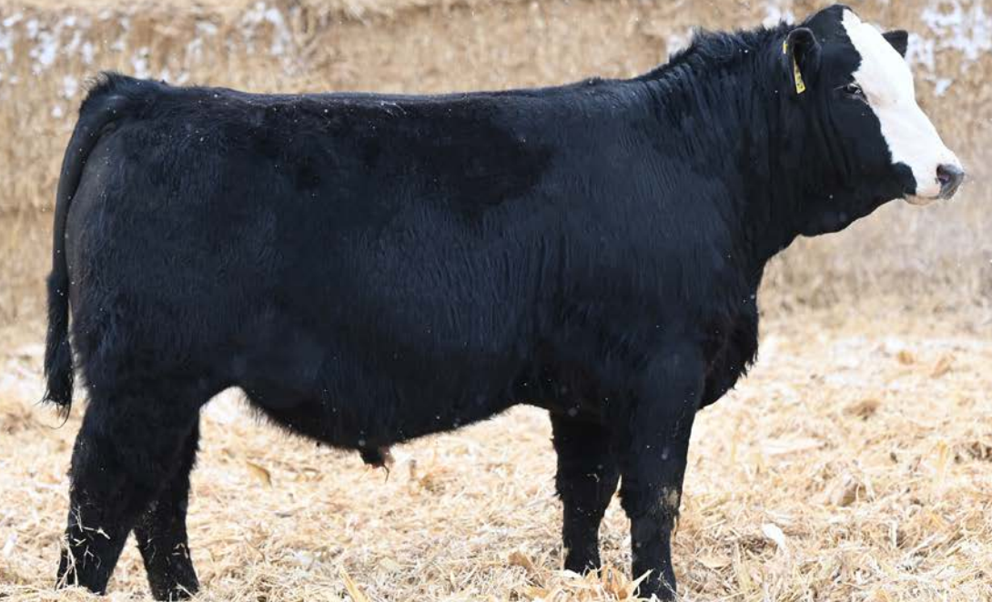
1 - SRH Hannibal 5H, Sire 2 - FVFR BLK Ms Pride 44D, Dam