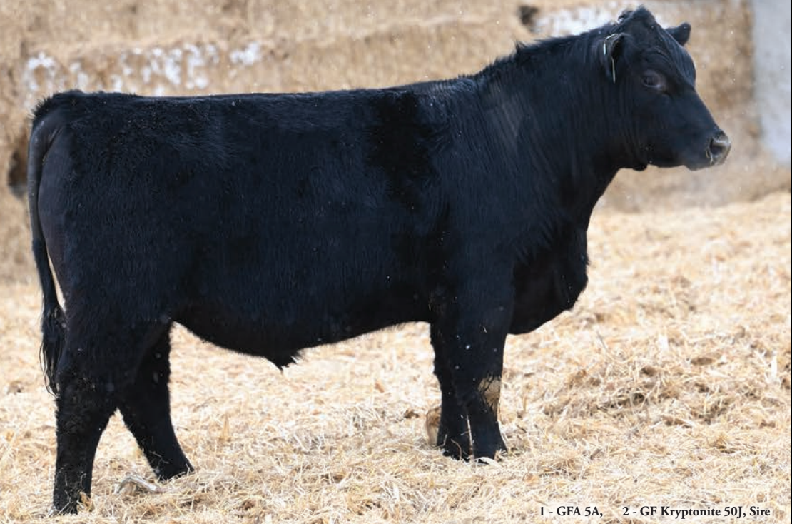
1 - GFA 5A, 2 - GF Kryptonite 50J, Sire