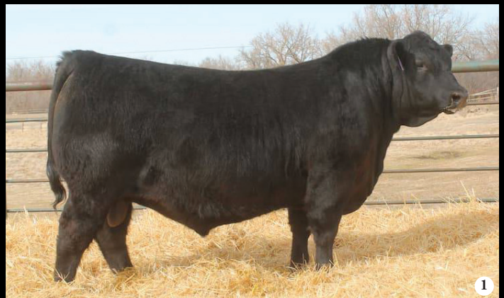
1 - Ellingson Big River 0052, Sire

This heifer, sired by Ellingson Big River, is a standout in terms of both structural integrity and overall quality. She is deep ribbed, offering ample capacity and a well-balanced body. Her soft-made appearance indicates smooth structure, while her wide-based stance provides added power and dimension. Her modest birthweight provides added flexibility in future matings. Along with the influence of Ellingson Big River, known for siring offspring with exceptional depth, capacity, and muscle, this heifer is set to be a valuable addition to any herd, promising both longevity and productivity.