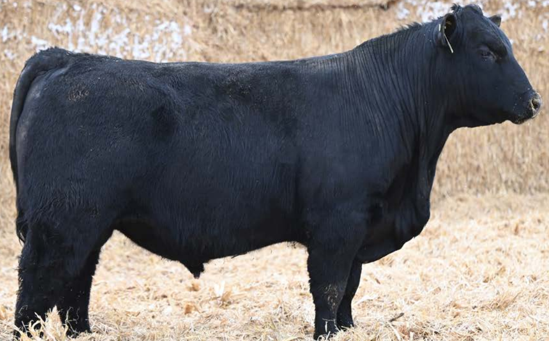
1 - SAV Net Worth 4200, Sire 2 - JL Lady 3059, Dam