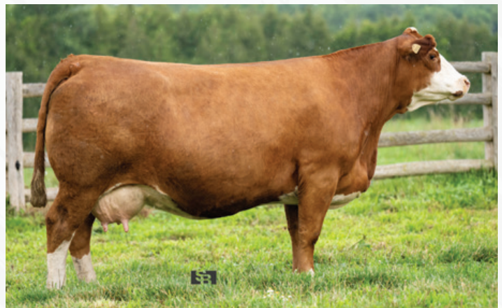
FGAF Marsha 110F Side Profile