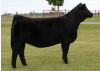
RPCC Blk Glitter 216G Dam