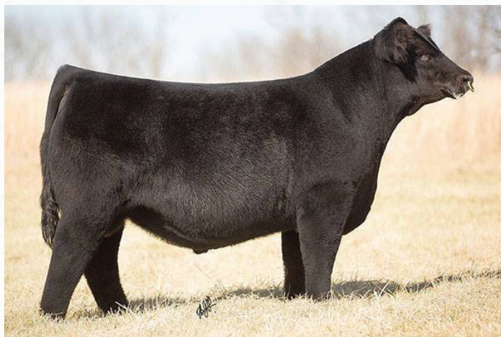
LLSF Pays To Believe ZU194 Sire

CNS DREAM ON L186 MLF BL JESSIE K336 GWS EBONY'S TRADEMARK 6N JBS ROCKIN ROBIN R194 TNT 90 PROOF Z401 WFL SWEET LICIOUS 1044X KWA FLYF RED MOUNTAIN 16Z HARVIE MS PEPSI 260Z