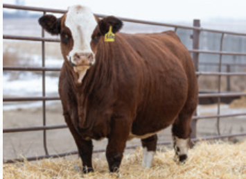
Double Bar D Feather 60K Front View

DOUBLE BAR D CHESAPEAKE DOUBLE BAR D KLAUDIA 80T RV NICKELBACK 6U DOUBLE BAR BARBL 403U IPU ROMANO 90X WXR MS PASO 26P DOUBLE BAR D EVEREST 4R MRLN BARBL