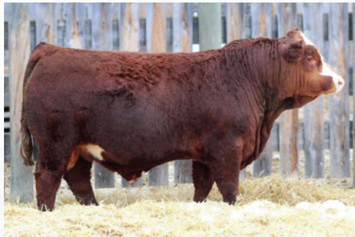
CMS Logic 010H Sire