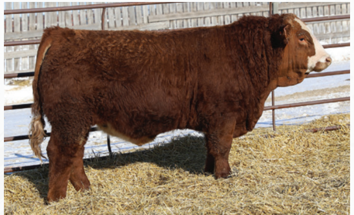
KF SH FC Liberal Exterminator 11J Service Sire