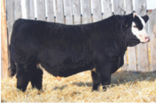
WJS Trailblazer 108H Sire