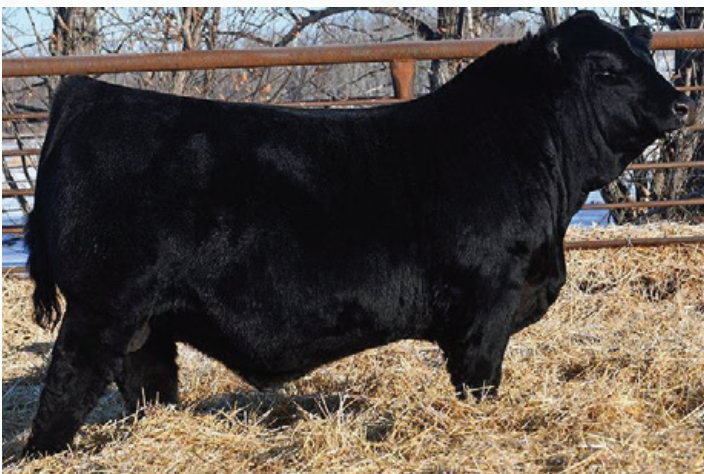
RF Shakedown 074H Service Sire