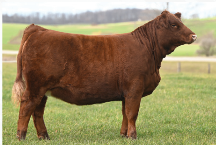
Alton Pepsi 2145L Maternal Sister by Potent