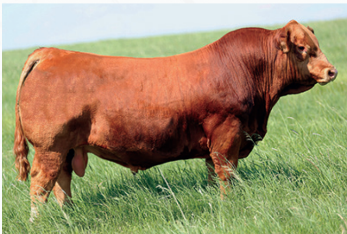
SVS Betts 808F Sire

SVS CAPTAIN MORGAN 11Z RF SCREAM 215Z R PLUS RELOAD 2006Z WFL RED SAGE 1003Y CDI AUTHORITY 77X KWA MS ROCK 14X LFE RED CASINO 3036X TRIPLE C SMARTY PANTS R