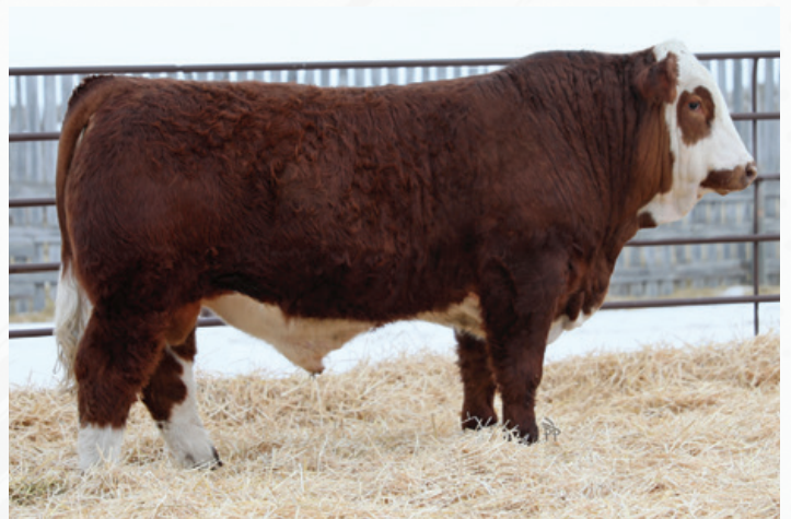
Double Bar D Hombre 59G Sire