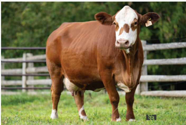
Dora Lee's Elsie FF50F Dam

DORA LEE'S PHANTOM 309 A DORA LEE'S ELSIE FF50F DORA LEE'S ELLA FF50Y