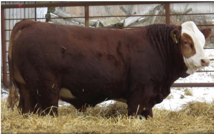
Elm Tree Holtby 63H Sire

Bred to KF SH FC Liberal Exterminator 11J on March 20, 2024. Consigned by Car-Laur Simmentals.