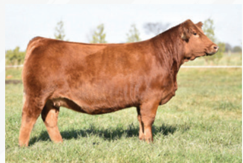
Trendy Daughter By WS Epic