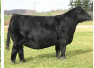
GF Emerald 301E Dam