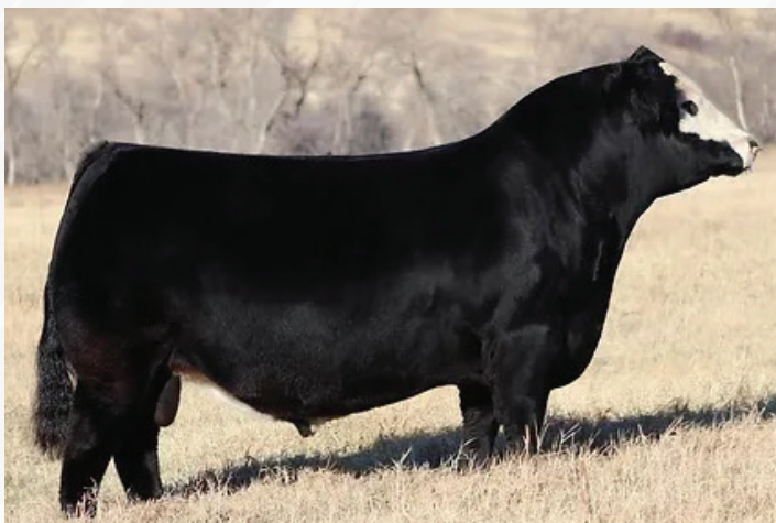
True North G71 Sire