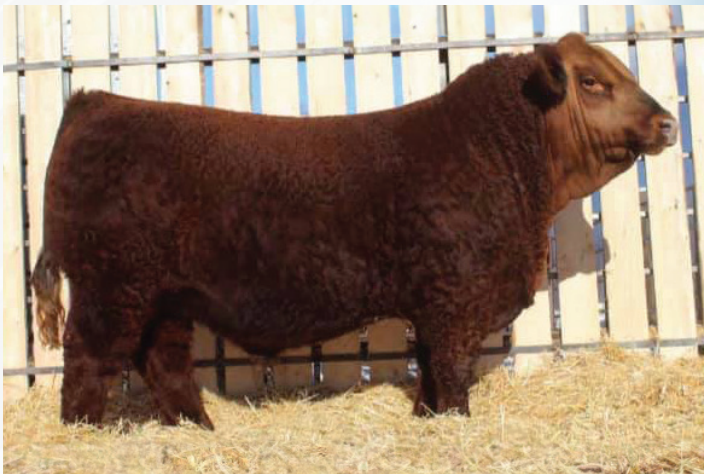
Perks Potent 309H Sire