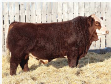
Black Gold Elevation 20E Sire of Embryos