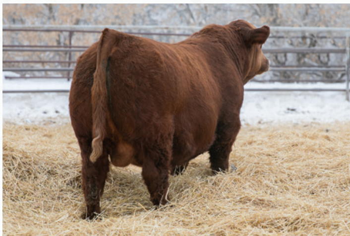
R PLUS ESTEVAN 2162K Rear View