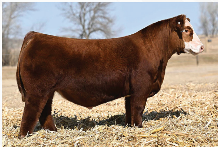
Bet On Red Service Sire