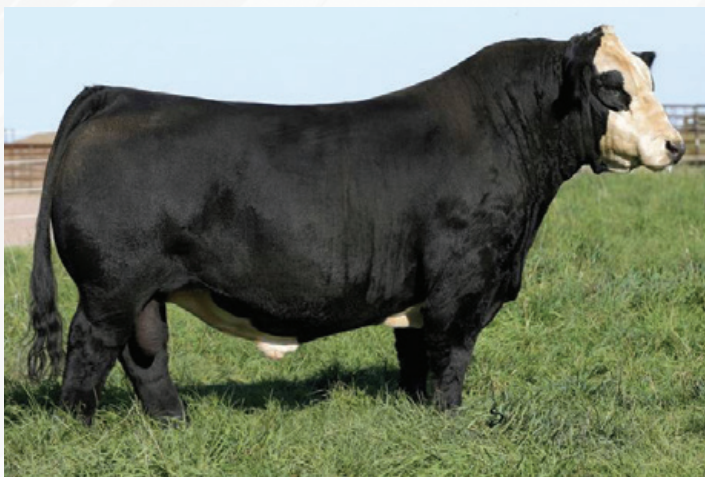
W/C Bankroll 811D Sire