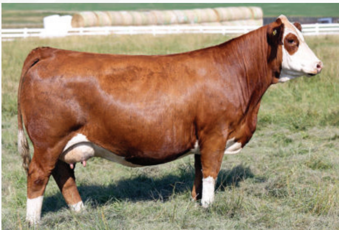
Alliance Ms Dakota Dream Dam