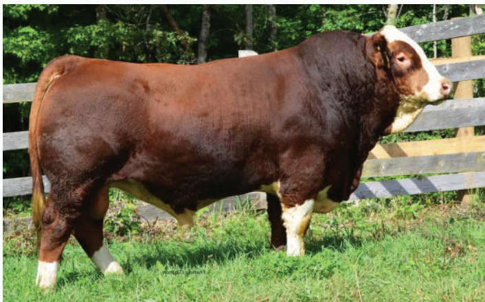
Anchor D Raptor 392C Sire