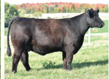
GF Emerald 301H Dam