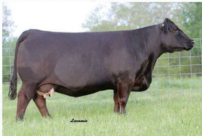
STF Onyx 451W Dam