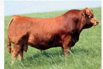
SVS Betts 808F Sire

AI bred to S A V Bismarck 5682 on April 20, 2024. Consigned by Silvertip Land & Cattle.