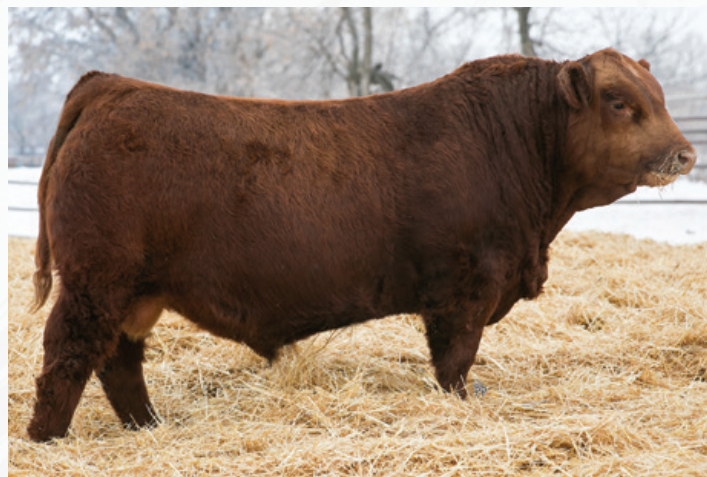
R Plus Estevan 2162K Sire