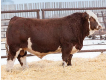
Double Bar D Chandler 153D Sire of Embryos