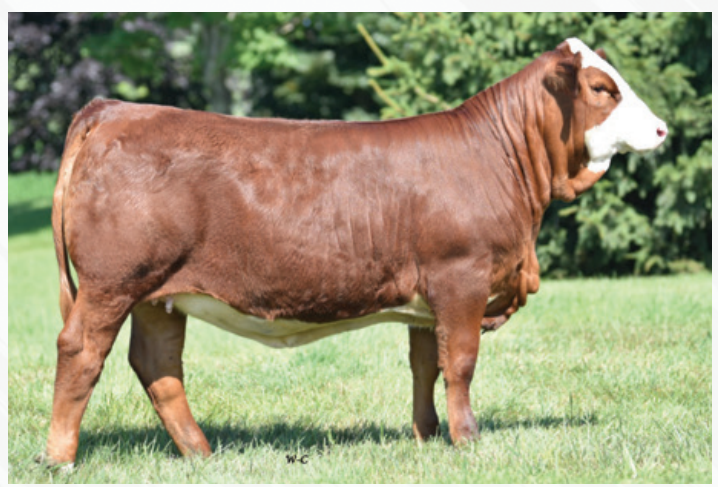
Granddaughter of Elsie FF50F Daughter of 975K (pictured to the right)