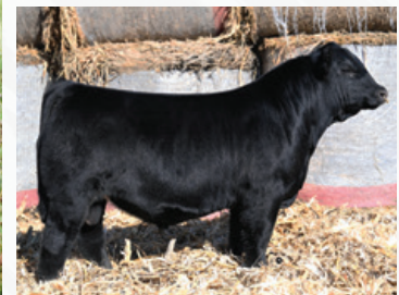
SFI Mile High Remedy L31 Service Sire

W/C RELENTLESS 32C JSUL SOMETHING ABOUT MARY 8421 JBSF PROUD MARY