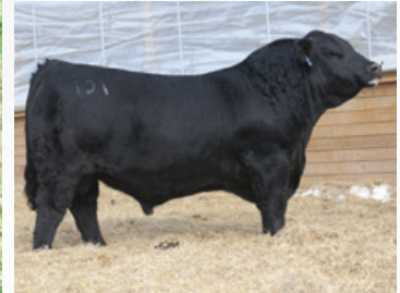
Clarke Better Believe It 14H Sire

LLSF PAYS TO BELIEVE ZU194 CLARKE BETTER BELIEVE IT 14H OATTES CREAM SODA 32B