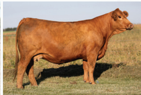
Miss R Plus 2260K Daughter at JP Cattle Co.