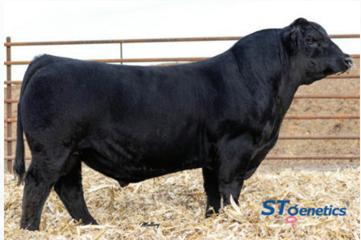
OMF Epic E27 Service Sire