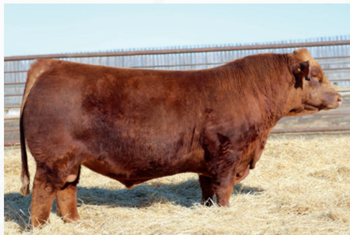
KWA Law Maker 59C Sire of Dam