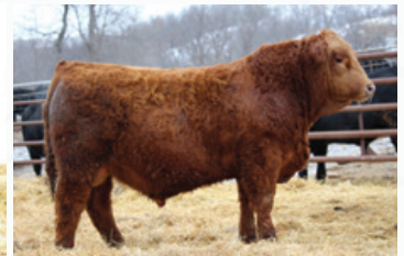
R Plus Venom 4006B Outcross Tula Son