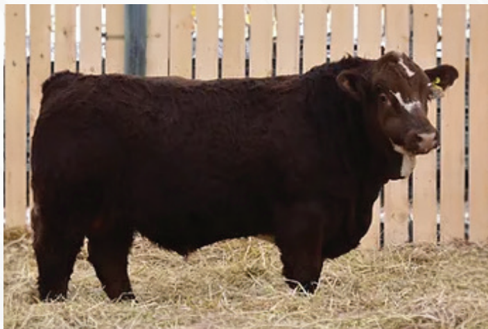
Crossroad Pilot Service Sire