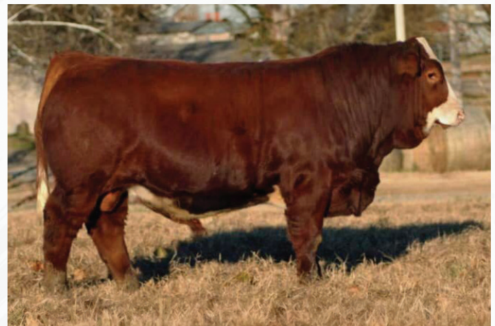
Rugged R Bordeaux 0029H Sire