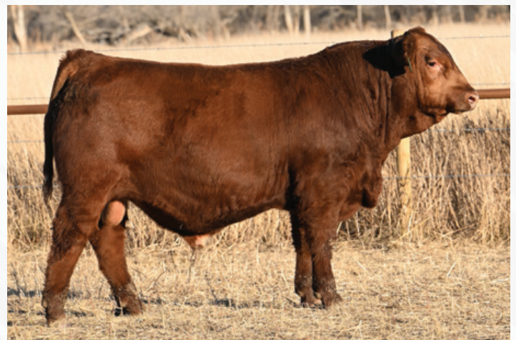
R PLUS ESTEVAN 2162K Pictured in Fall 2022