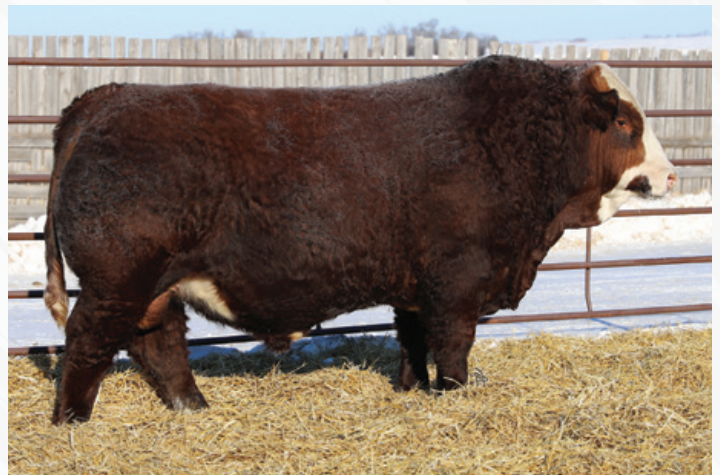
Double Bar D Millsap 271H Son of Prostock Kim 261Y