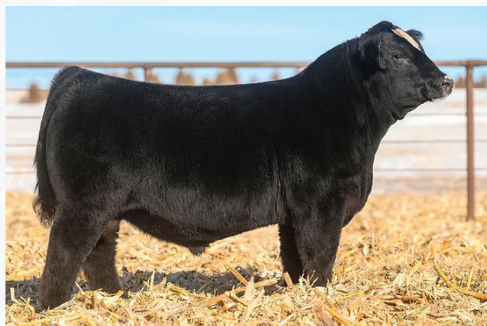
KCC1 Countertime 872H Sire

WELSHS DEW IT RIGHT067T ES A110 MR TR HAMMER 308A ET TKCC VICTORIA 57A TRIPLE C SINGLETARY S3H CCR MS 4045 TIME 7322T MRK PRIORITY 3C IPU TEMPTRESS CLAIR 105C