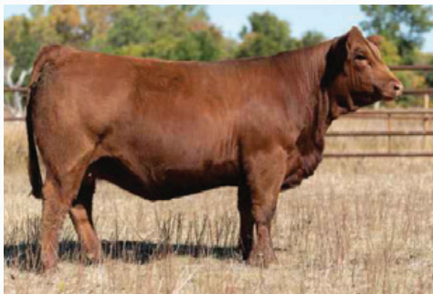
Miss R Plus 1083J $130,000 3007A Daughter