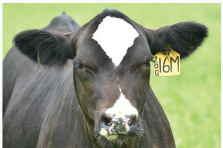
Kade's Miss Enchantress 16M