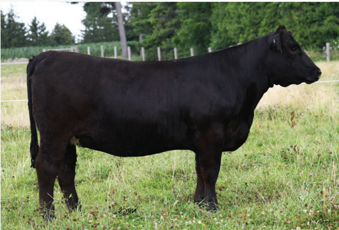
45 CLARKE FRANCIS 47L PERCENTAGE FEMALE | POLLED | BPRS1433170 | CFFI 47L | JAN 15, 2023