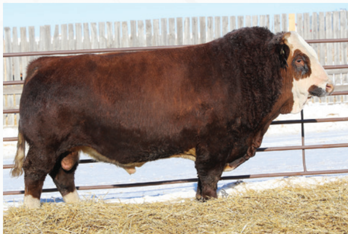
Anchor D Motown 865E Sire

ANCHOR D OUTLOOK ALLIANCE DAKOTAS OUTLOOK ALLIANCE SPECIAL'S DAKOTA