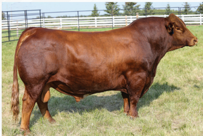
SVS Rancher 42H Sire