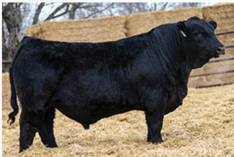
R Plus Yuma $150,000 Son of 3007A

Guarantee one pregnancy if implanted by a certified technician. Consigned by Ellingson Simmentals.