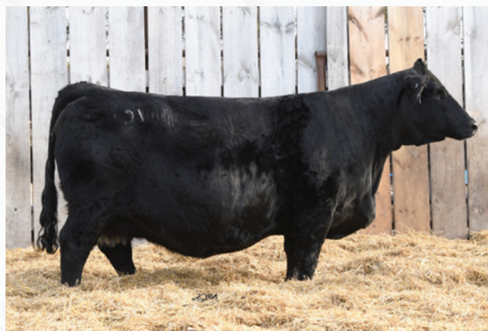
Dunravens Endless Whiskey Dam

Due to calve February 8, 2024. Recip is a black Sim Angus cow. Consigned by Clarke Family Farms Inc.