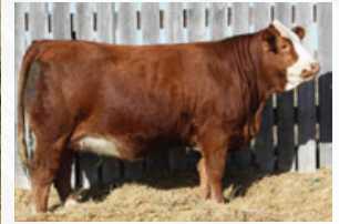
Wendy 65H Dam