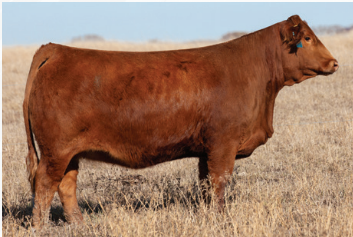
Double Bar D Smarty Pants 430E Dam

STF CRIMSON TIDE DZ87 CMS LOGIC 010H CMS LUBA 808F SVS BETTS 808F RED BLAIR'S SMARTY PANTS 851K DOUBLE BAR D SMARTY PANTS 430E CDI RIMROCK 325Z STF MISS ZW87 CMS RAPID FIRE 635D CMS JEWEL 961W BGS/BM CAPTAIN SCREAM 63D WFL RED SAGE 506C KWA LAW MAKER 59C MRL MISS SMARTY PANTS III