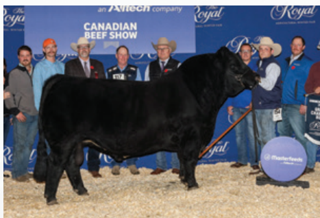
Trendy Son By NCB Cobra