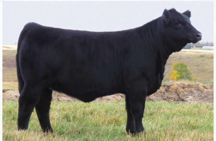
CMS Enchantress 717E Dam