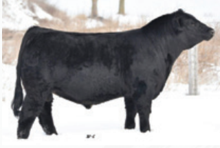
DKMB Kosmos 1K Maternal Brother