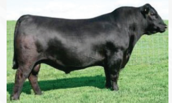
S A V Bismarck 5682 Service Sire

AI bred to S A V Bismarck 5682 on April 18, 2024. Consigned by Silvertip Land & Cattle.