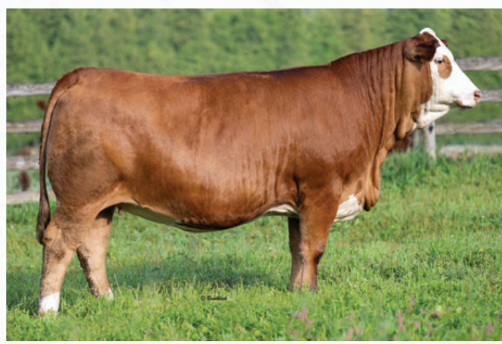
Car-Laur Polled Kelsie 975K $30,000 Daughter at Clelor Farms

DOUBLE BAR D MAESTRO 100S PRL LOPEZ 147L SALERIKA EKSELLENT SIMLEE MARYNA SH ROMULUS F53R KLONDIKE KIM GNM 402B EMIL SANMAR POL TEARDROP 12M