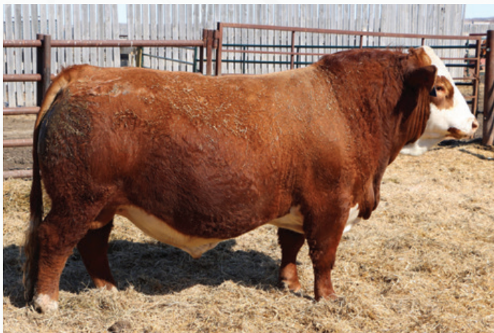
Anchor D Garren's Krush 524K Sire of Embryos

TTU CANYON PROSTOCK KIM 261Y LCF KIM 343U