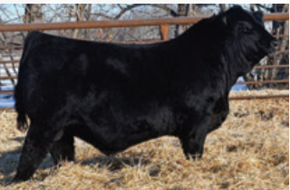
RF Shakedown 074H Sire

NCB COBRA 47Y NGDB LOUISE 411 B SVS CAPTAIN MORGAN 11Z AJE/JF ANT JOYS ELEGANCE REMINGTON LOCK N LOAD 54U TJSC KNOCKOUT 121Y JF MILESTONE 999W IC CREAM SODA R56