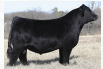
WHF/JS/CCS Double Up G365 Sire