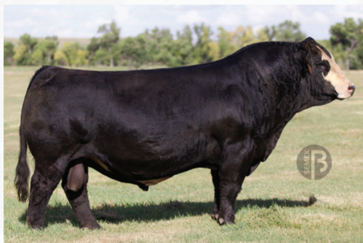
CKCC LD Dimension 8965 Sire

NORTH STAR VORTEX KADE'S BLACK KNIGHT 1J KADE'S BLACK KNIGHT43E