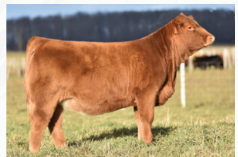
Trendy Daughter By Betts