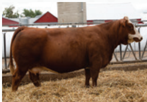
Donovandale Courtney Dam