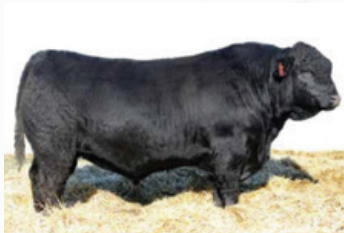
CMS Sochi 307A Full Sib Eggs to Estevan

Guarantee one progeny per package if implanted by a certified technician.