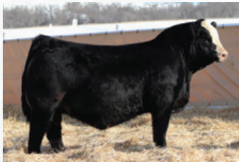
Wheatland Dimensional 1147J $200,000 National Champion