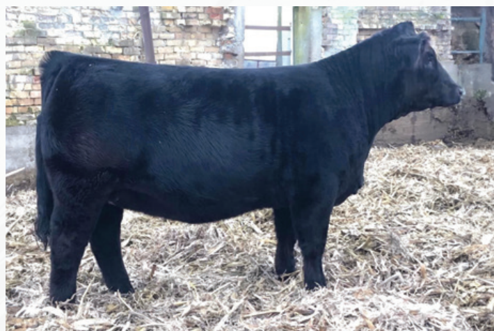
Kade's Black Knight 1J Dam