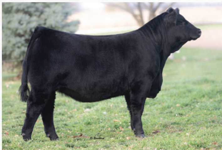
FarL Miss Keepsake Full Sister

AI bred to R Plus Estevan 2162K on April 12. Preg checked safe Consigned by Far-L Farms.