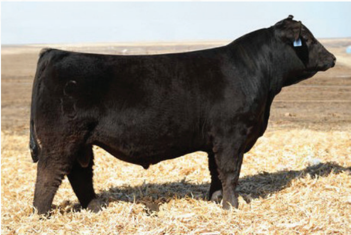
CCR Cowboy Cut 6048Z Sire

HOOKS SHEAR FORCE 38K LUCAS JOSIE 19K HTP SVF IN DEW TIME CCR MS PRETTY 4045P MR CCF VISION LRX MS BLACK 91A MRL EL TIGRE 52Z ULTRA TEMPTRESS CLAIR 12R