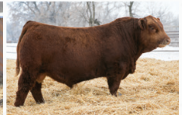
R Plus Estevan Son of 0017H