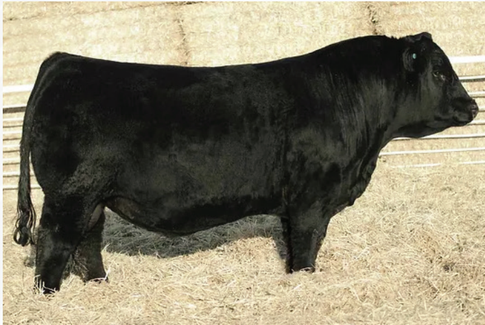
SVS Dynasty 915G Sire

RF CAPACITY 742E SVS DYNASTY 915G WFL RED SAGE 506C JARVIS SHEAR FORCE JARVIS GINNY JARVIS TOM IVY WFL WESTCOTT 24C RF FAMOUS 409B R PLUS RELOAD 2006Z WFL RED SAGE 1003Y HOOKS SHEAR FORCE 38K JARVIS TOM FRESHLADY II IRCC TOMAHAWK 706T JARVIS RUSTY IVY