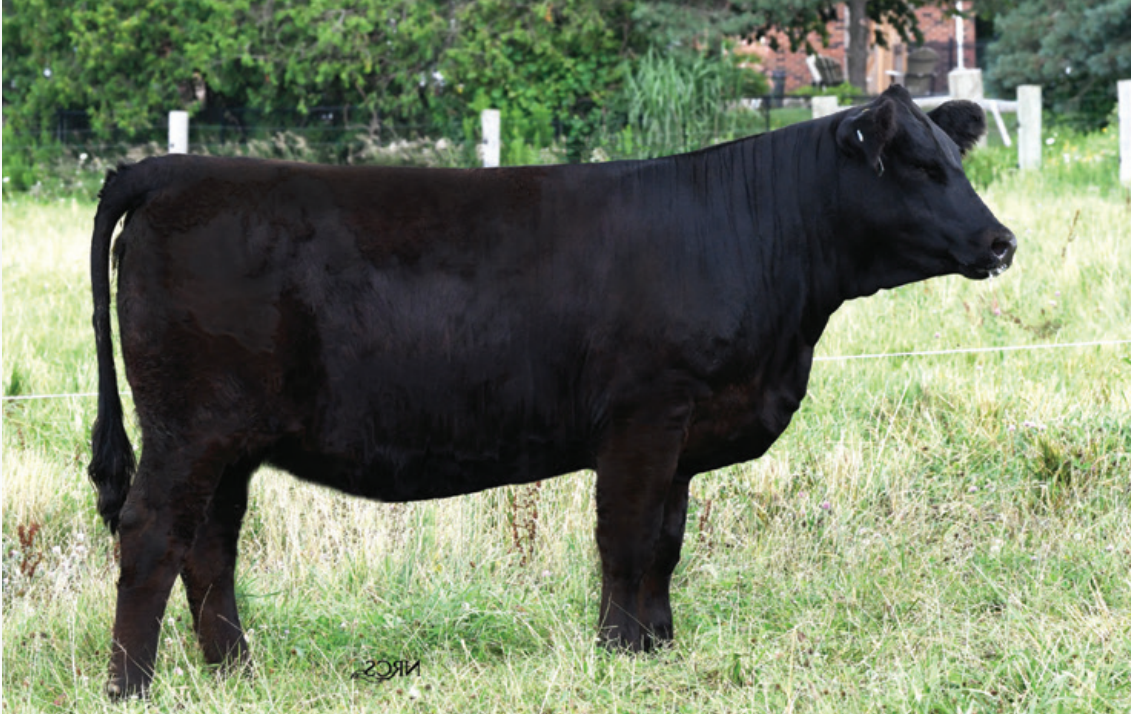
44 CLARKE ROBIN 104L FEMALE | POLLED | BPG1433214 | CFFI 104L | FEB 04, 2023