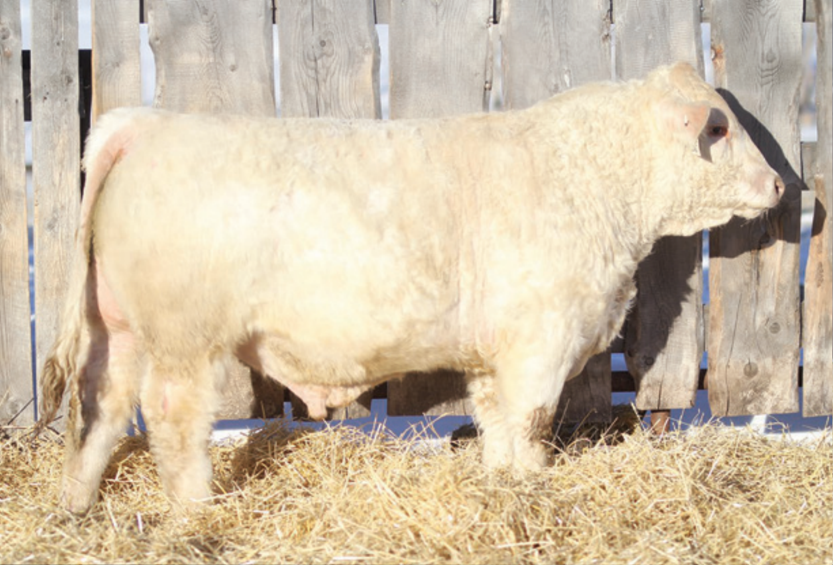
Dam of Lot 10 & 11, Miss Prairie Cove 806F