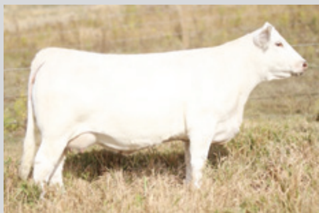
SLC Sugar Girl 22H dam of SLC PCC Shake the Frost 209K