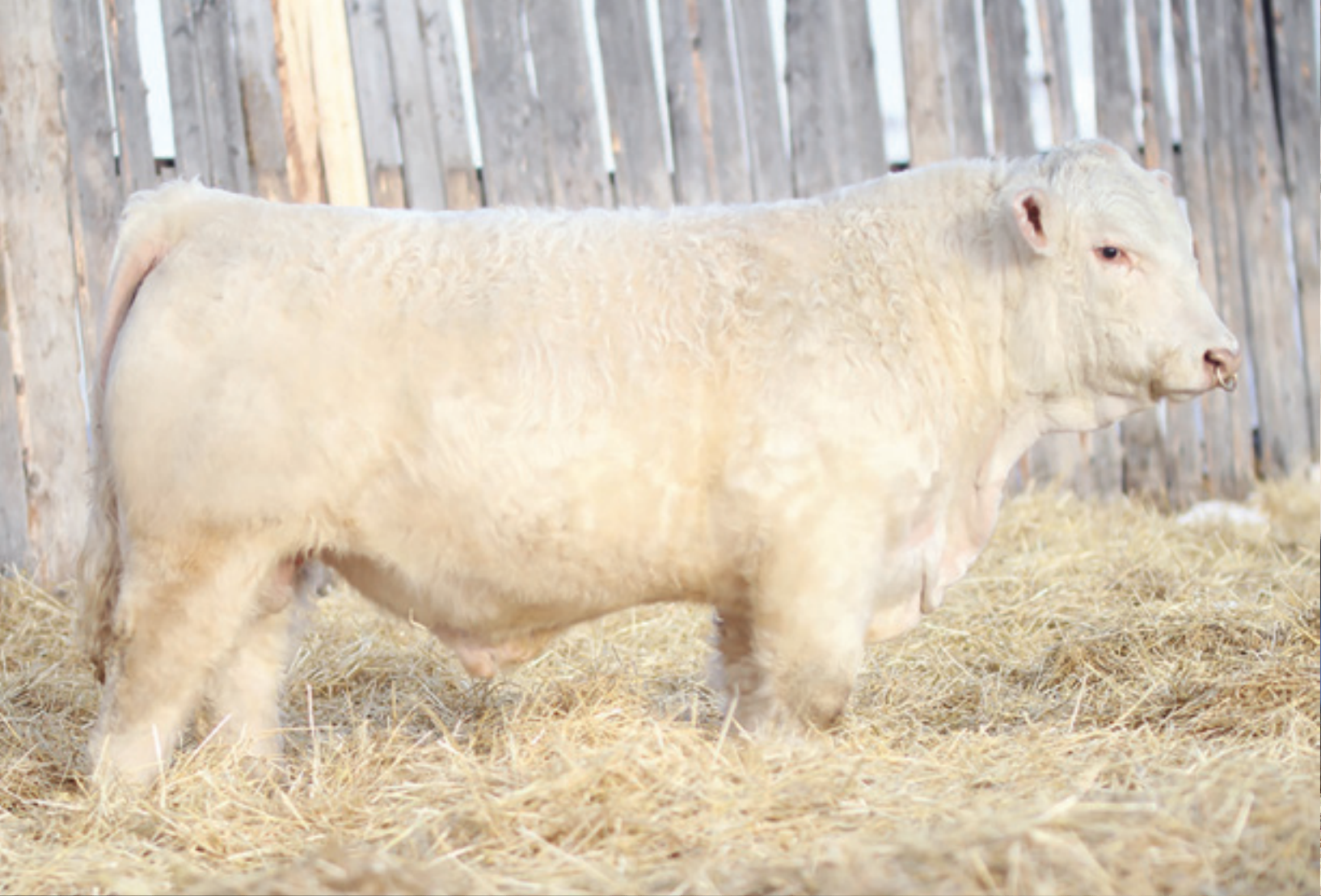
TR MS Berkly 4711 ET, Dam of lots 12-14