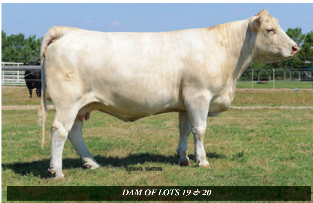
DAM OF LOTS 19 & 20