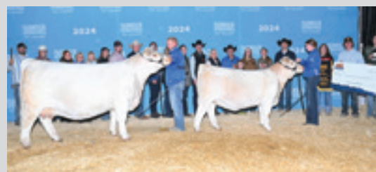
Miss Prairie Cove 204K and Miss Prairie Cove 417M