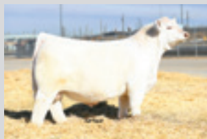
PCC Force of Nature 122J