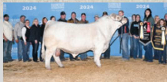
Champion Bull, Farmfair 2024