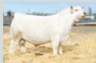
PCC Bourbon 118J