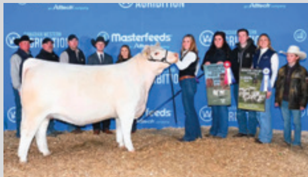
Lily grand daughter