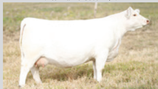
Miss Prairie Cove 204K, Sister