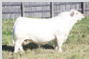
PCC Husk 218K