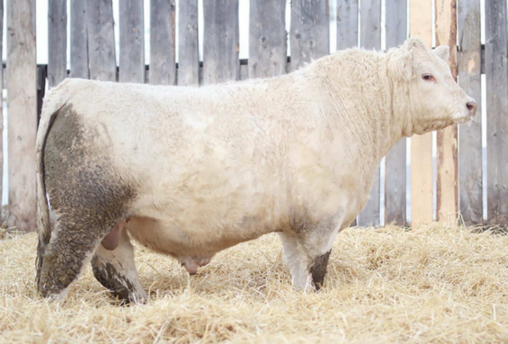
Miss Prairie Cove 808F, Dam of Lot 37

MC896493 / PCC 384L / MAR-25-2023 / POLLED