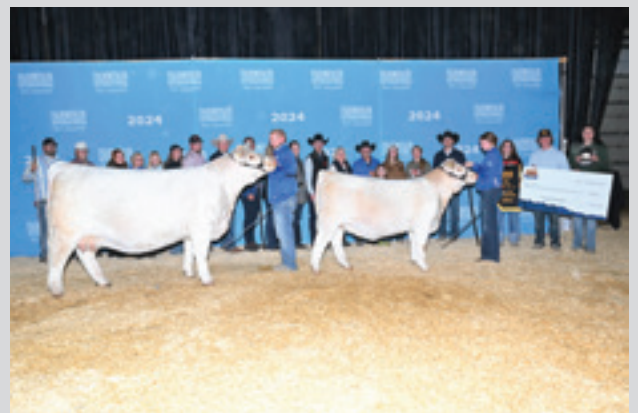
Miss Prairie Cove 417M sired by Bold Move