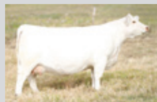
Miss Prairie Cove 204K