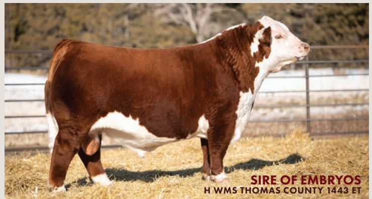
SIRE OF EMBRYOS H WMS THOMAS COUNTY 1443 ET

GUARANTEE OF 1 PREGNANCY IF EMBRYOS ARE IMPLANTED BY A CERTIFIED TECH