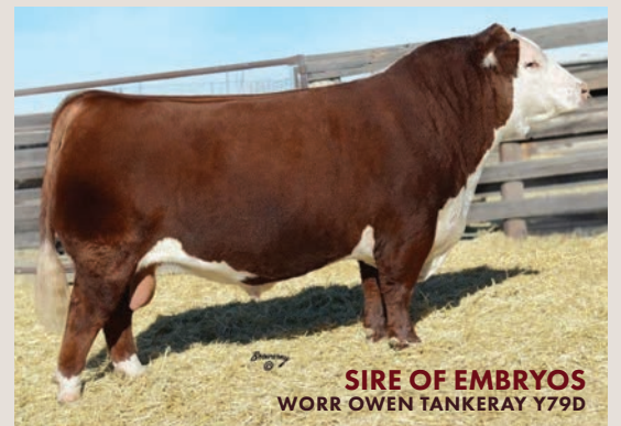
SIRE OF EMBRYOS WORR OWEN TANKERAY Y79D