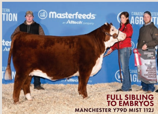
FULL SIBLING TO EMBRYOS MANCHESTER Y79D MIST 112J

GUARANTEE OF 1 PREGNANCY IF EMBRYOS ARE IMPLANTED BY A CERTIFIED TECH