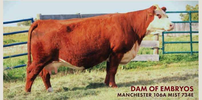
DAM OF EMBRYOS MANCHESTER 106A MIST 734E

PE EPDS CE: -6.4 // BW: 4.6 // WW: 61.1 // YW: 98.6 // MILK: 28.0