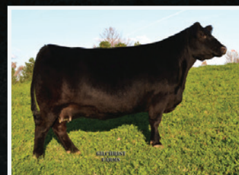
GF ULTIMATE NET WORTH 1U GREAT GRANDAM

We absolutely love going to the royal and having the opportunity to see breeders from across the nation all with similar passion to ourselves. When we make decisions to load the trailer for Toronto though we don't make those lightly and we go to win. This stylish heifer is being loaded on the trailer and will be offered in her entirety. Her pedigree is one that has stood the test of time in our program and been responsible for numerous high sellers and banners over the years. Here is a show prospect that has brood cow written on her and built into her DNA.