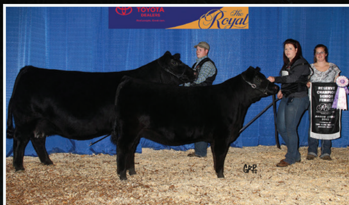
GF BLACKBIRD 801A AT SIDE OF GREAT GRANDAM TO 203M

203M is the kind of girl you bring home for Christmas. She is correct in her make-up and has a head turning eye appeal that will make your brothers jealous. She is backed maternally so you know she won't fall apart during production. Lastly, she has an up to date pedigree that is different enough, you will have lots of mating options. CONSIGNED BY WALKERBRAE FARMS.