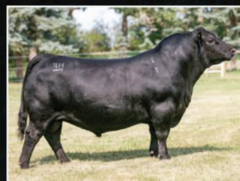
HF HI-COUNTRY 7L