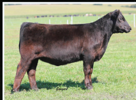
HENNING GEORGINA 9022 MATERNAL SISTER TO DAM

Georgina 179L is a bred heifer sure to catch your attention on sale day. She is making a lot of friends on the show circuit this summer. Georgina is a very stylish up front heifer, long spined with great width of top and deep ribbed in her overall makeup. Georgina has been a 4-H club project this past summer and thus far is doing very well placing 2nd in class to the Grand Champion Female at Barrie Fair, Champion 4-H heifer and Reserve Grand Female in the open show at Sunderland Fair. Sired by the popular Hill Valley Reckoning and on her dam side the legendary Champion Hill 8020. Georgina will put down a well balanced udder and become a very productive cow in her own right.