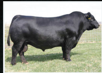
S A V NET WORTH 4200 SIRE OF EMBRYOS