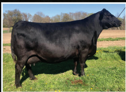
EARLEY MISS NEW DEAL 58Y GRANDAM OF 2K