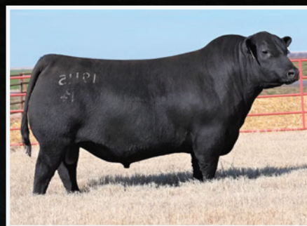
DUFF REAL DEAL 19115 SERVICE SIRE