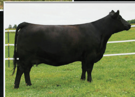
RIGHT: OSU EMPRESS 3100 GRANDAM