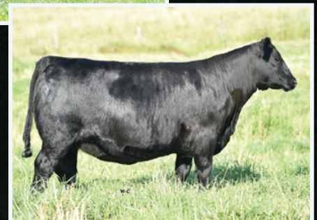
RIGHT: DDGN SUSY 308L MATERNAL SISTER