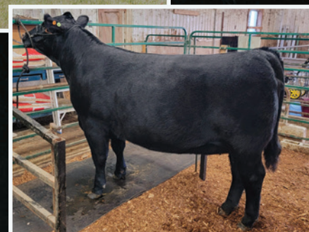
RIGHT: RMF BLACKCAP 1K DAM