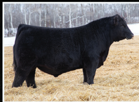
HAROLDSON'S AH ALPINE 271L $118,000 ERICA SON

SIRE BOYD BEDROCK DAM BAR-E-L ERICA 74A PE CE: 3.5 BW: 1.9 WW: 80 YW: 137 MILK: 27