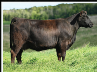
GF BLACKBIRD 801K DAM