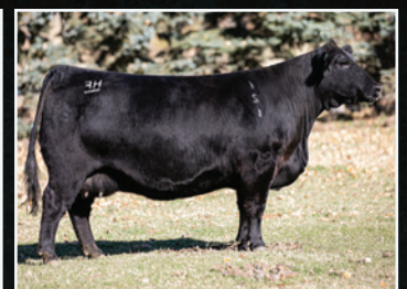
DAM OF HI-COUNTRY