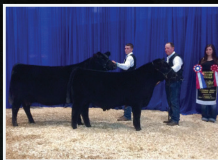
EARLEY MISS NEW DEAL 58Y WITH MATERNAL BROTHER TO DAM OF 2K AT SIDE