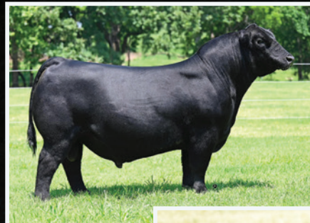
LEFT: CONLEY A 1 SIRE