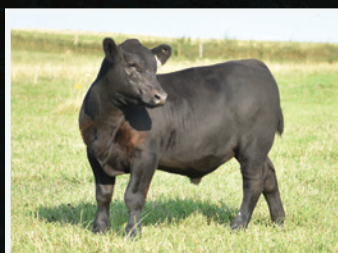
GF INVESTMENT 801H MATERNAL BROTHER TO DAM