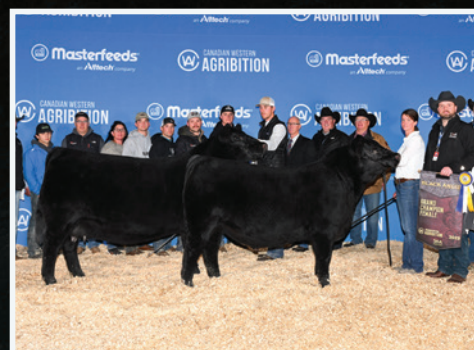
BLAIRSWEST ERICA 11J CWA CHAMPION ANGUS FEMALE AND $150,000 1/2 INTEREST HIGH SELLER