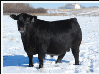
PEAK DOT GATSBY SON OF 117E, $70 000 1/2 INTEREST FEBRUARY FREEZE HIGH SELLER TO HARPREY FARMS AND EVERBLACK

SIRE S A V NET WORTH 4200 DAM PEAK DOT ROSILLA 117E PE CE: 2.0 BW: 3.6 WW: 55 YW: 98 MILK: 28