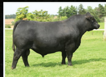
WHISKEY LANE JUKEBOX 2J SIRE