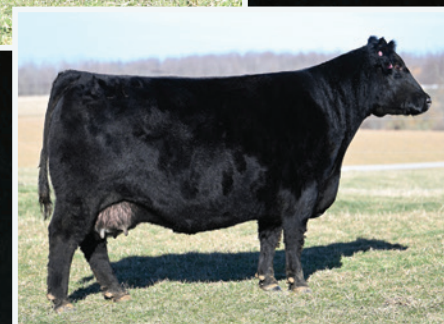
RIGHT: JL FLORESSA 5531 DAM