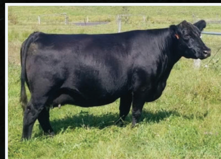
S&R PROVEN QUEEN J329 DAM

Your going to hear me talk about S&R Proven Queen J329 a lot. She's a cow we are quite proud to have in our battery, and it doesn't matter what she's bred to she just makes flat good ones, with 7329M being one of this years stand outs. If you like her picture you will love her in real life, she's big bodied, deep bellied, good footed, long necked and ready to run hard in the show ring. If you're unfamiliar with J329 and the success she has had south of the border, a quick google search will tell you this is a family you will want to tap into. Her phenotypic versatility, maternal strength, and elite breeding combo will have 7329M in your keeper pen and top of your flush list. This female will have you talking about the Proven Queen cow family for years to come as her story is just getting started.