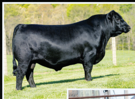
LEFT: WHITSTONE 19 MILLION SIRE

CONSIGNED BY TY RY FARMS AND LYNDEN MANOR FARM.