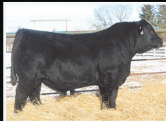
TOP LEFT: PEAK DOT ERICA 358D DAM TOP RIGHT: S A V MAGNUM 1335 SIRE BOTTOM LEFT: PEAK DOT PROFOUND 96H MATERNAL BROTHER