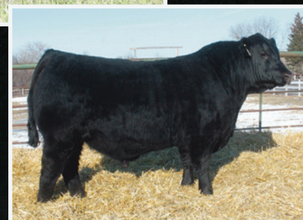
RIGHT: PEAK DOT FRANCHISE 389F MATERNAL BROTHER TO DAM OF EMBRYOS