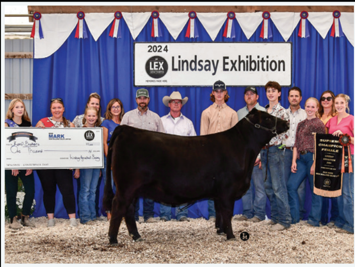
TOP: CLC EVERELDA ENTENSE 356G DAM OF LOT 4A BOTTOM: EVERELDA 456L SUPREME CHAMPION FEMALE AT LINDSAY