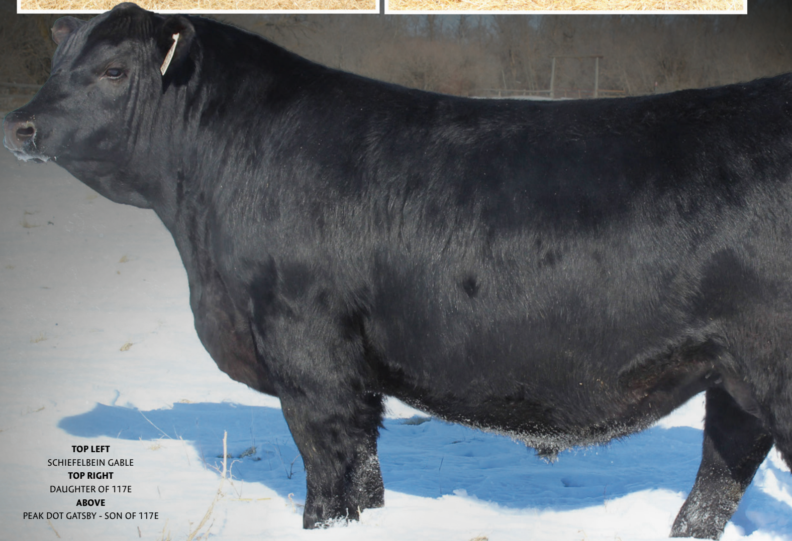
TOP LEFT SCHIEFELBEIN GABLE TOP RIGHT DAUGHTER OF 117E ABOVE PEAK DOT GATSBY - SON OF 117E