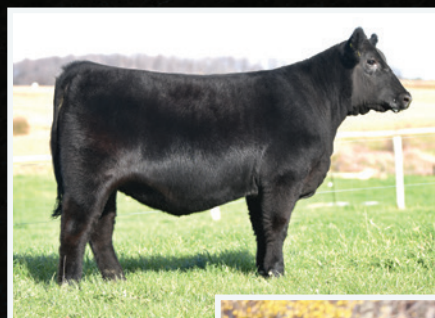
LEFT: VLS LADY 496J MATERNAL SISTER