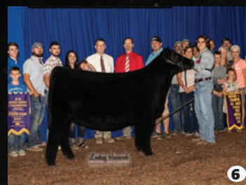
1: CAMPBELLCO 1A PICTURED AS 2023 CHAMPION SENIOR HEIFER CALF 2: BNWZ QUEEN 7477 DAM OF CAMPBELLCO 1A 3: J&J QUEEN 414 GRANDAM OF CAMPBELLCO 1A 4: REIB PHYLLIS 336 SHOWDOWN 2024 CHAMPION OPEN FEMALE 5: REIB PHYLLIS 336 2023 ROYAL CHAMPION JUNIOR HEIFER CALF 6: UDE PHYLLIS 0223 DAM OF PHYLLIS 336