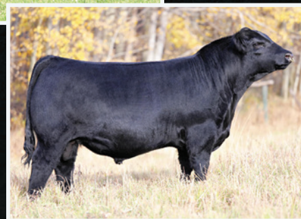
RIGHT: DMM GT LAST CALL 200J SIRE