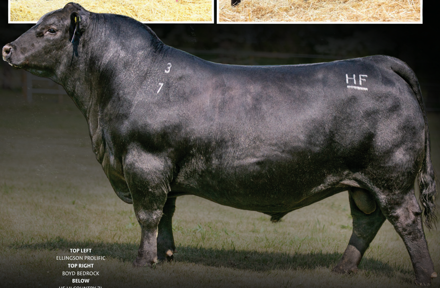
TOP LEFT ELLINGSON PROLIFIC TOP RIGHT BOYD BEDROCK BELOW HF HI COUNTRY 7L

What more could be said about the remarkable Erica 74A. Still to this day she walks around likes she's a 3-year-old with an accomplishment list longer than any other producing female noted from Canada. Her popularity continues to grow obviously and here are just a few of the reasons why. Erica 11J (daughter) was Champion Angus Female at CWA '23 and 10 days later sold for $150,000 1/2 interest to ZWT. At that same show she also was responsible for the $118,000 Alpine bull who topped the CWA All Star sale. Amongst others this was just a taste of what Erica 74A has been doing. Recently one IVF cycle was sold for $40,000 US and we are proud to offer these embryos in the Elite Sale. We have searched long a hard on what sires to mate Erica to and we feel the 3 listed bulls are that and more. For the first time ever in Canada you can obtain genetics from the $360,000 Bedrock bull who has all the bells and whistles. Also, the $185,000 Hi Country is available and been said to be the most talked about bull in Canada in some time. And the popular Prolific who is also the sire of Bedrock whose progeny are surfacing as the breeds best. In short use Erica in your program. She's not only a breed changer, but a program enhancer.