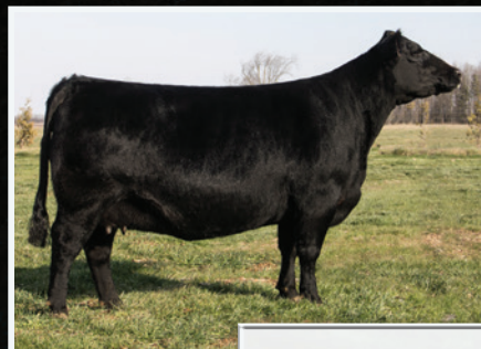
LEFT: PREMIER HASSON EMPRESS 714 DAM

CONSIGNEE BY PREMIER LIVESTOCK AND WINDULAN CATTLE COMPANY.