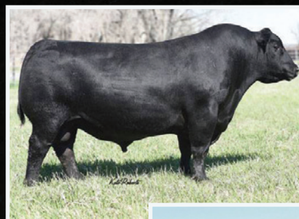
LEFT: ELLINGSON ROUGHRIDER 4202 SIRE OF BAMBI 78G