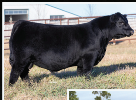
LEFT: HOLLYWOOD 210K SIRE