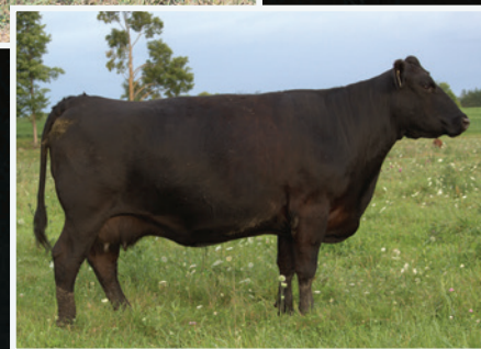
RIGHT: WHISKEY LANE ANNE 22A DAM