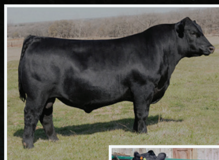
LEFT: GCC GOLD STANDARD X615 SIRE