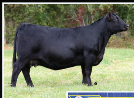
LEFT: XCEL KENZIE 101K DAM

CONSIGNED BY XCEL LIVESTOCK AND UPPER GLEN ANGUS.