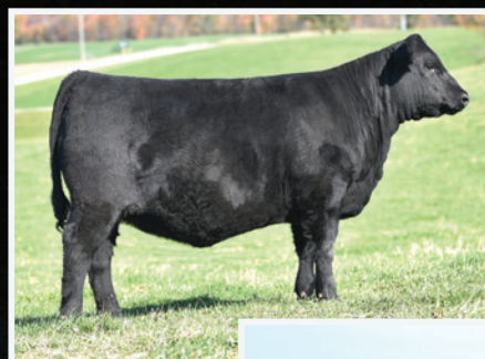
LEFT: GF FLORESSA 531H MATERNAL SISTER AT PARKVIEW FARMS