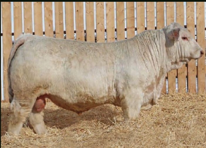
Elder's Houlio 4H