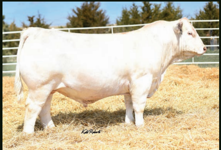
RBM Keystone H41