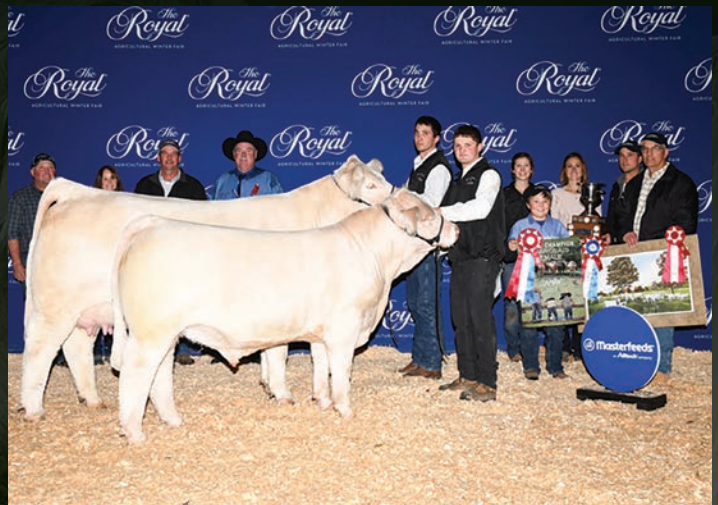
Echo Springs Worthwhile 60C