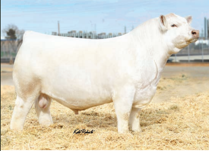
PCC Bourbon 118J

LOT TWO - PAIRINGS WITH BOURBON, KICKSTART, HOULIO, CHAVEZ, & MAYFIELD