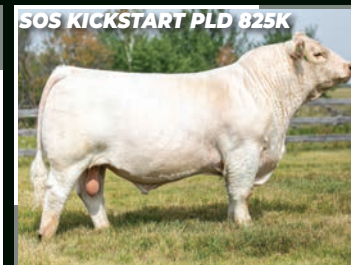
SOS KICKSTART PLD 825K