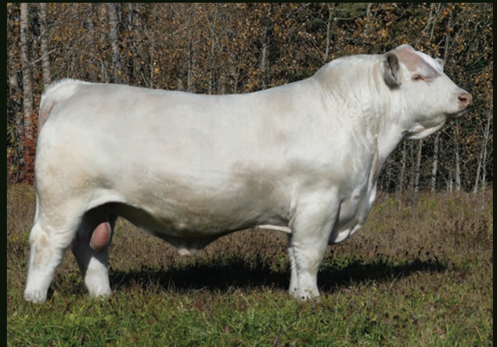
WGD Ruger 8J

As we begin calving Ruger daughters, it's clear they are destined to become collector's items. Ruger moves with the ease of a leopard, supported by a strong, well-structured foot. Those who've seen him consistently praise his impressive length, powerful lower quarter, and exceptional fleshing ability. Don't miss this chance—this will be one of the final opportunities to purchase Ruger semen. Secure a piece of his legacy for your program today! Consigned with Daines O'Neill Livestock.