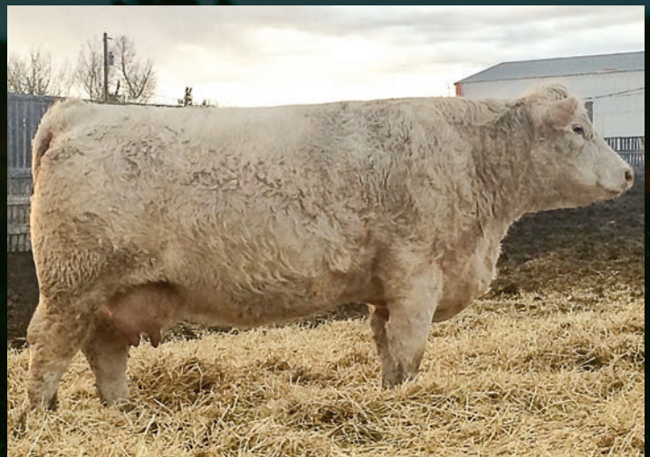
SOS Princess Kate 33Y as a 3-Year-Old