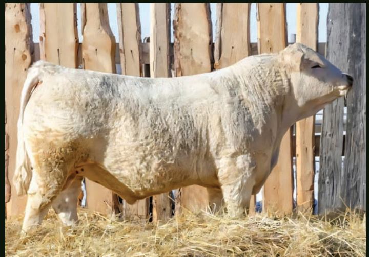
RRMM Yellowstone 2J

Yellowstone made an impression on us early, standing out on the show road as a calf. He consistently stamps his progeny with great hair, a calm disposition, and excellent feet and legs. As a true HEIFER bull, Yellowstone ranks in the top 15% for both birthweight and milk EPDs. If you're looking to breed a pen of heifers, Yellowstone 2J is an ideal choice. Consigned with 7 Quarter Circle Charolais.