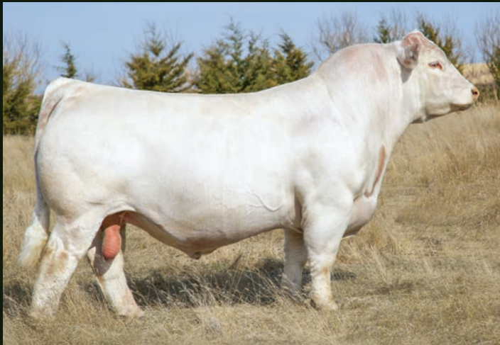
TR CAG Carbon Copy 7630E ET