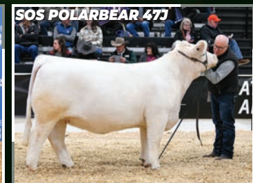
SOS POLARBÉAR 47J