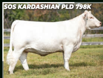
SOS KARDASHIAN PLD 798K