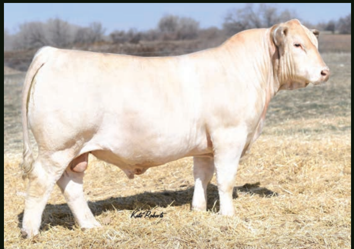
KEYS Powermax 57G

D One Package of Three Embryos Qualified for USA