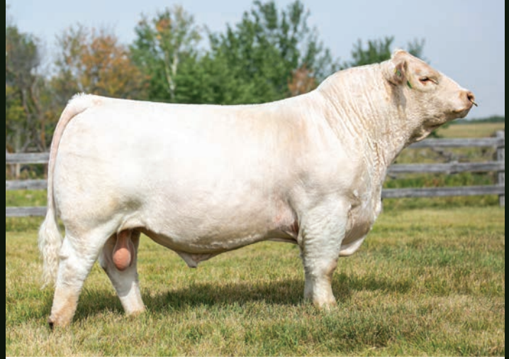
SOS Kickstart PLD 825K