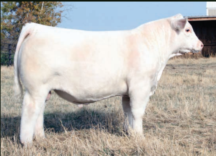
SVY Trust 6H