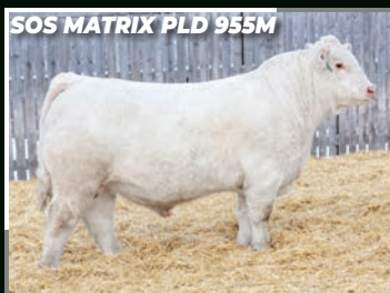
SOS MATRIX PLD 955M