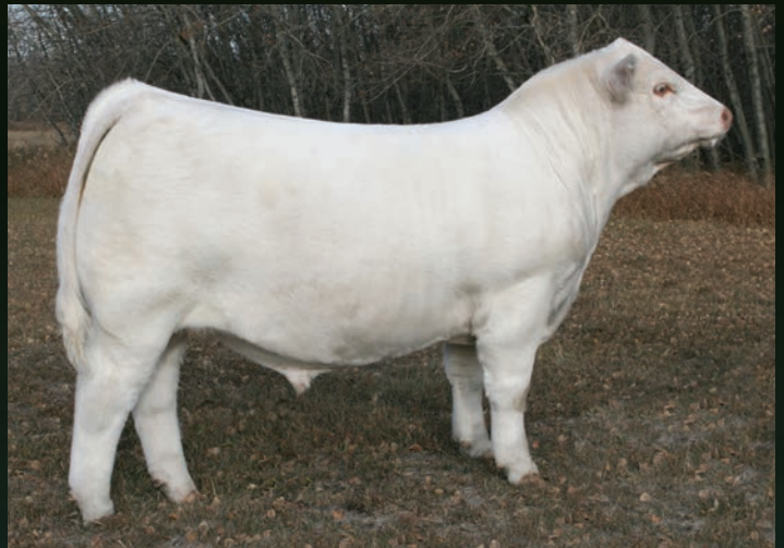
SVY Profound 145J