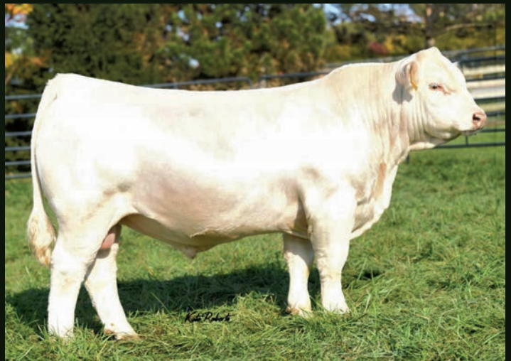
LT Countdown 9712 PLD

E One Package of Three Embryos Qualified for USA