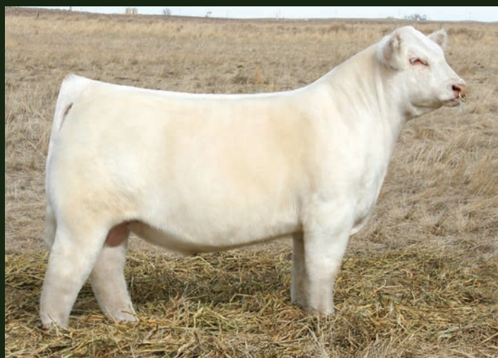
KASS/CJB Famous 6038 ET