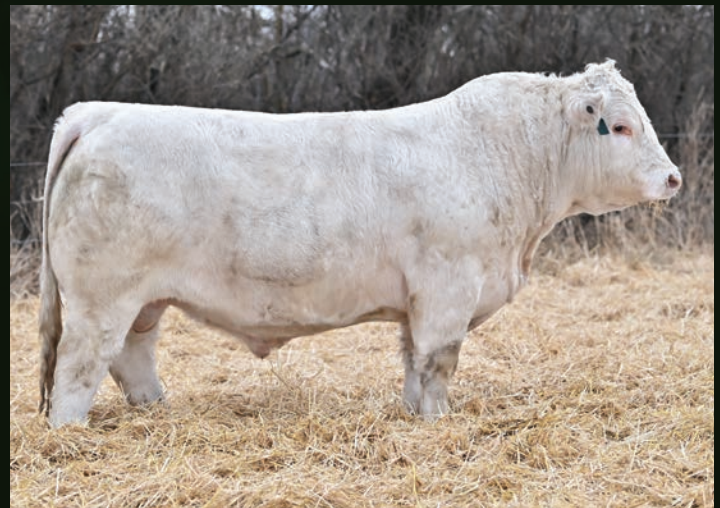
M&L Khan 11K

Attention French breeders—don't miss this opportunity! With limited French semen available for import into Canada, now is the time to enhance your program with MLCC Khan 11K. This Cyrano son was a $50,000 Canadian high seller to Wilkie Charolais, and his first calves hitting the ground are proving to be exceptional. Backed by one of the strongest cow families in Canadian Full French history, Khan offers the muscle and power our performance-driven breed is known for. Purebred Charolais programs looking to add raw muscling and strength to their homo polled cows will find Khan 11K to be a game-changer. Add him to your spring breeding plans today! Consigned with Wilkie Charolais.