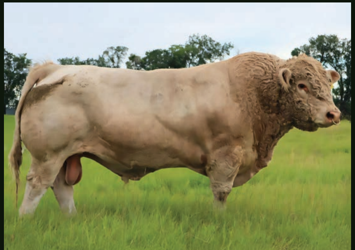
Legacys Game Day 45G

C One Package of Three Embryos D One Package of Three Embryos Qualified for USA