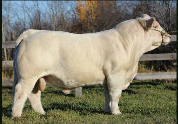
Full Sibling to Bounty