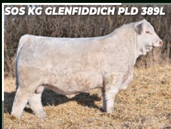
SOS KG GLENFIDDICH PLD 389L