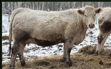
11G PICTURED AS A THREE-YEAR-OLD

“ Our Full French division has been an exciting and rewarding venture, offering incredible opportunities. French cattle are renowned for their superior carcass quality, and 11G exemplifies this, ranking in the top 1% for fat—one of the key reasons these cattle excel in the feedlot. Her pedigree reads like a who’s who of breed greats, including Snoopy, Till, and Montagnard. When you produce a $50,000 herd bull, MLCC Khan 11K selling to Wilkie Charolais, it’s clear you’ve earned a place in the ET program. Don’t miss the chance to capitalize on these exceptional genetics! One pregnancy guaranteed per package. ”