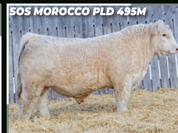
SOS MOROCCO PLD 495M