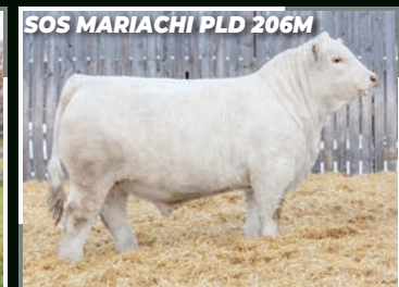
SOS MARIACHI PLD 206M