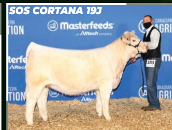
SOS CORTANA 19J