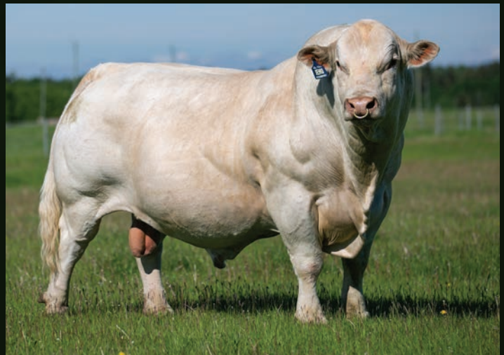
SCX Jehu 233E

2H One Package of Three Embryos Qualified for USA