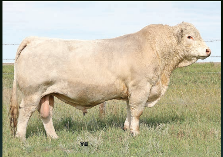
Turnbulls Duty-Free 358D