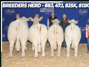
BREEDERS HERD - 88J, 47J, 825K, 813K