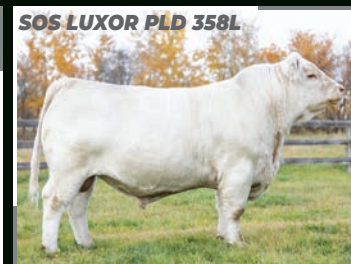
SOS LUXOR PLD 358L