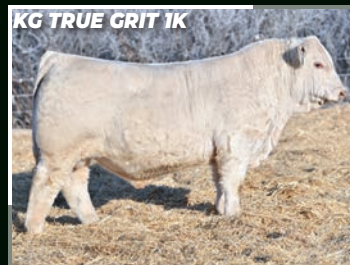
KG TRUE GRIT 1K