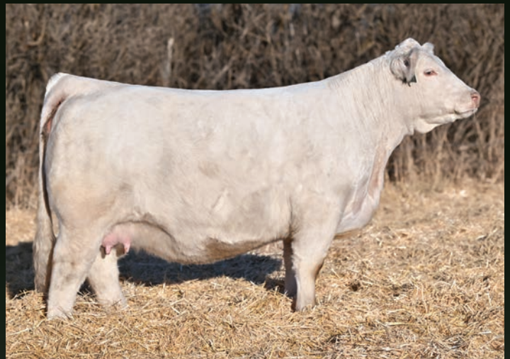
SOS Berlyle PLD 811K

SOS Beryle PLD 811K - Half Sister to Embryos