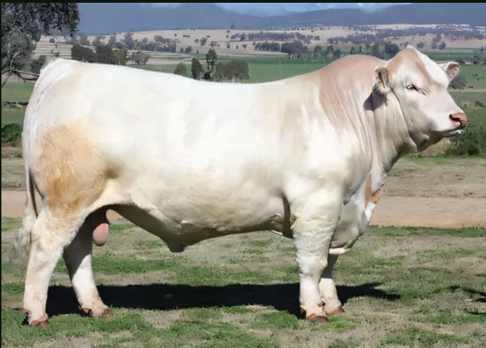
Winchester Lock n Load Q1E