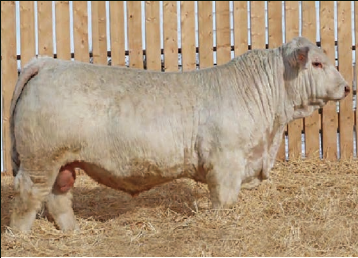
Elder's Houlio 4H