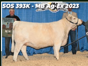
SOS 393K - MB Ag-EX 2023