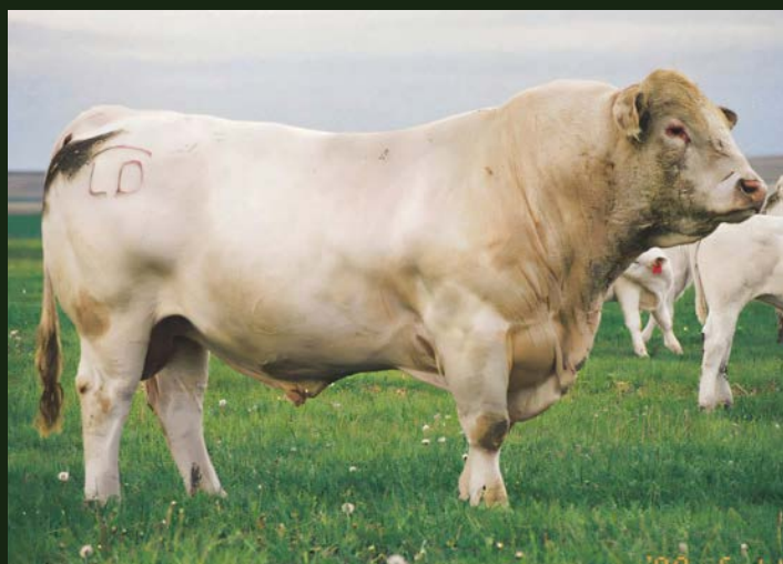
LHD Cigar E46