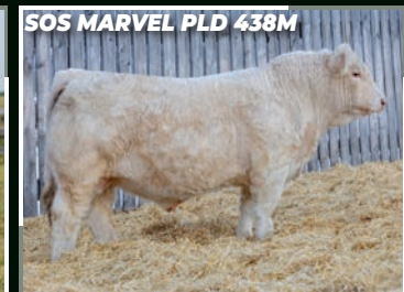
SOS MARVEL PLD 438M