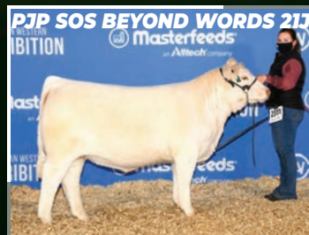
PJP SOS BEYOND WORDS 21J