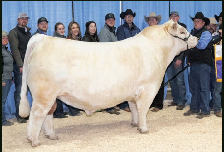
SVY Mayfield 30H