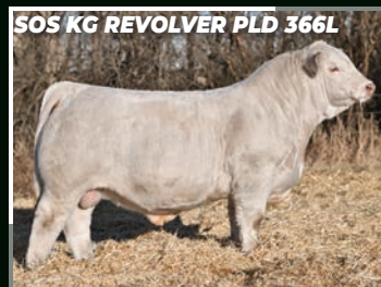
SOS KG REVOLVER PLD 366L