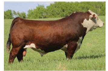
Sire Haroldson's JVJ Royal 24E

Deep soggy, easy going, meat and potatoes kind a bull here. With Rimrock and Royal combined together means you will want a set of females sired by this guy!