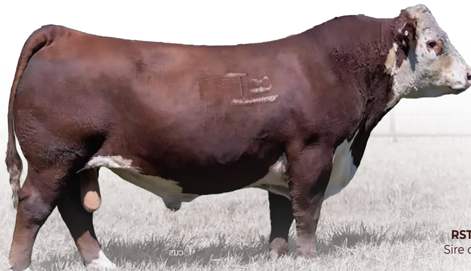
RST Final Print 0016 Sire of lots 38, 39, & 40

This Final Print son has a lot to offer. First off, he started out at 70 lbs. and certainly has the look and build of a calving-ease sire. Love his head and front end and certainly has an abundance of shape and muscle down his top and from behind. This mating really clicked. His mother is a dark moderate framed female that is beautiful uddered and a direct daughter of Marvel 12B. Great spread from birth weight to yearling weight. He's a 1.6 on the teat and udder and is Homo Polled. We would like to retain 100 doses of in-herd semen. Homo Polled. Heifer Approved.