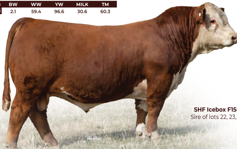
SHF Icebox F158 J030 Sire of lots 22, 23, 24, & 25