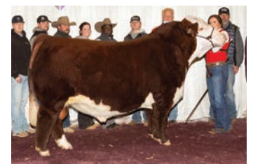
Sire Haroldson's United 33D 36G

This is our only United bull in our offering this year. Like his sire he is big bodied, and stout made. If you like performance cattle with lots of hair put some check marks beside this guy.