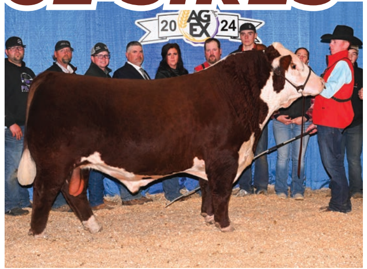
HAROLDSON'S HIGH COUNTRY 12K Sire of lots 43-45