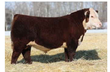
Sire Haroldson's High Country 12K

This bull is very long sided and a complete made individual. He has a lot of shape in his top and has a real good hip on him. His mother has an excellent udder and sure did a great job raising this bull as a first calver.