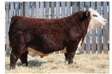
Sire Glenlees DBK 155E All Rise 21K

A big featured All Rise son that will cover some ground. Explosive in his hip design and plenty of body. A nice maternal package as well.