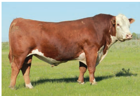
McCoy 53A Patent 124E Sire of lots 15, 16, 17, & 19