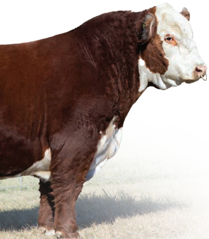
Glenlees 7454 Game On 69H Sire of lots 26, 31, 35, 36, & 37

Red eyed son of Game On. Big hiped, deep sided and powerful.