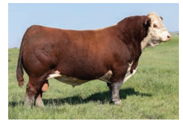
Sire Glenlees BNC 27C Impact 43F

Big, hairy, powerful Impact son. Really like the bone and body this bull has. He will sire some pay weight calves, which is always important. Fully pigmented. Small scur.