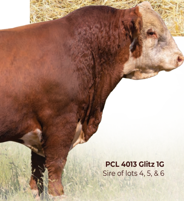
PCL 4013 Glitz 1G Sire of lots 4, 5, & 6