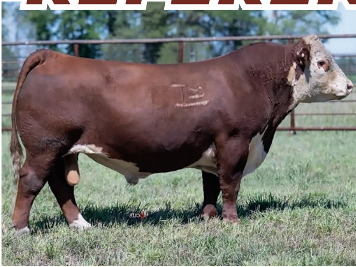
RST FINAL PRINT 0016 Sire of lots 38-42