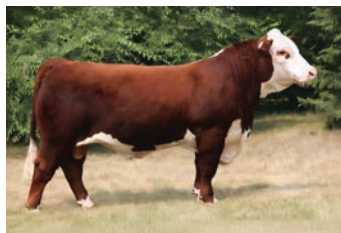
Sire Remitall-W Justice 2H

Justice 3M is an interesting kind of a bull. Colored right, marked well, big and long with a real low birthweight makes him usable in many operations. If you don't like sorting the heifers away from the cows, this guy is for you. Heifer Approved. Scurred.