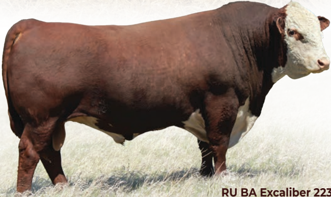
RU BA Excaliber 223F Sire of lots 1, 2, & 3