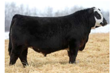
Maternal Brother Haroldson's Pirate 50L

Here is our only Baldie bull this year but he is a good one. He's big bodied, stout and extremely sound made. His mother is a beautiful made, good uddered female who has been a bull making machine.