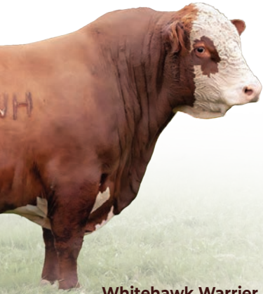
Whitehawk Warrior 845C Sire of lots 11 & 12