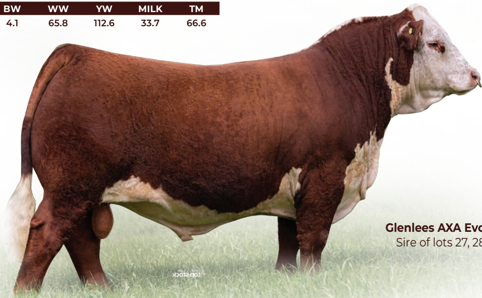
Glenlees AXA Evolve ET 112J Sire of lots 27, 28, 29, & 30