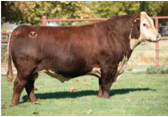
Sire SHF Horizon D287 H022 ET