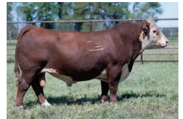
Sire RST Final Print 0016

Heifer bull candidate sired by the popular Final Print bull. This guy was real small at birth but grew quickly. His EPD's also show that he's a curve bender, low birth and high growth. He's out of the River Valley Touch of Gold cow family which will add value too.