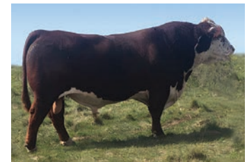
Sire NJW 103Y 174X Diablo 156C

We always keep a spare yearling around that we are willing to use ourselves as an insurance policy. Max 112L was that bull for us last summer. A Diablo out of a real nice Max daughter ensures the females will be productive. Check out his Birthweight and turn him out with the heifers too!!