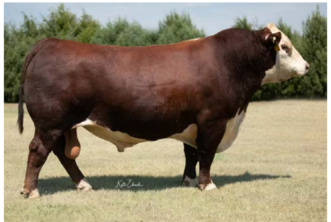
Frontier || Maternal Grandsire