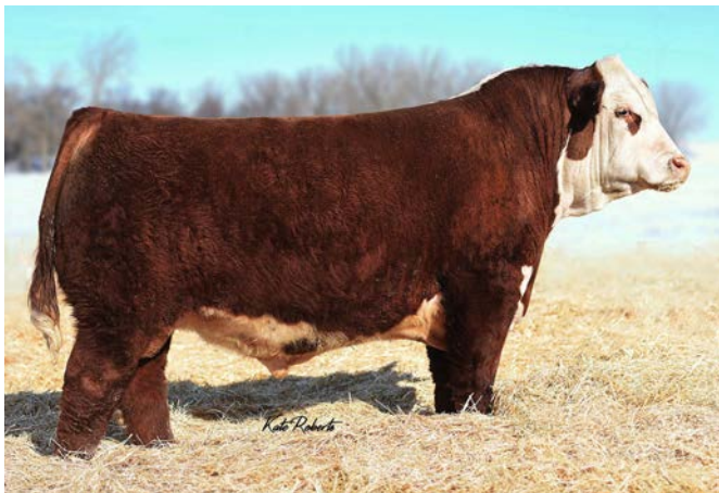
Masterplan || Sire

A real sweet heifer that is sound, big bodied and easy to look at. 2M is in the Top 1% for weaning and yearling weight. Her two-year-old dam is a beautiful uddered, Frontier daughter that is doing a heck of a job on her first calf. Her grandam is the dam of 113M, the productivity of this cow family is second to none.