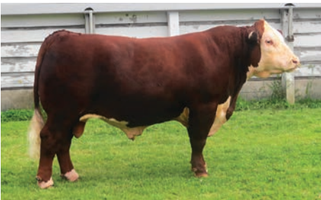
Evolution || Maternal Brother

THIS OUTSTANDING LADY IS BACKED BY generations of SHOWSTOPPERS