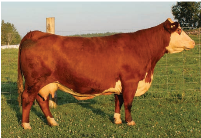
Investor Gal || Dam

Take a close look. Style and performance. Full siblings are in production at MHPH, Bar-J-M and Dorbay. Donor dam, WCC Investor Gal 396A is still getting it done. Flushmate to Lot 6A.