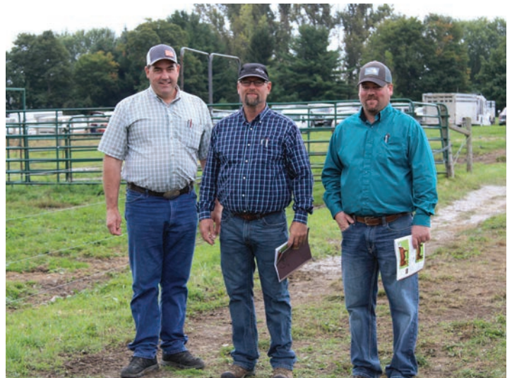
Autumn Alliance XLII || 45