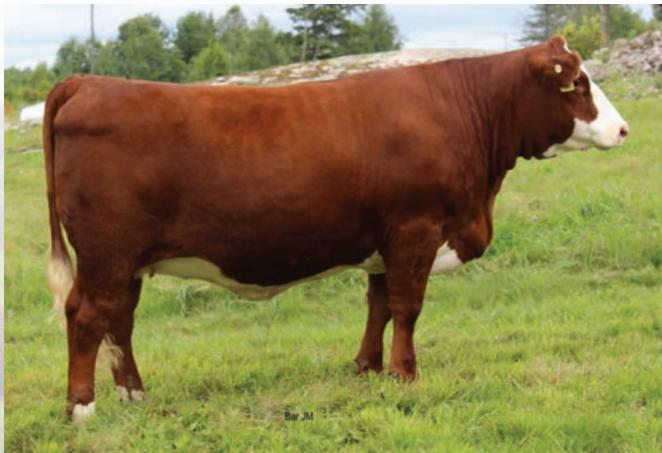
Red Velvet || Dam

2024 show rights reserved. Selling 1/2 Interest in either lot 1A, 1B or 1C. Only offering 2 out of the 3.