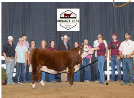
Glenlees 240J Beth 20L || Grand Champion Female