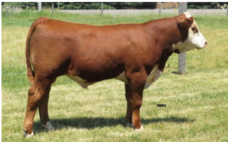
MHPH 106A Frontier 112F

His maternal brother by Action has done a tremendous job for Alton Malone, Kansas. Extra length, from an exceptional cow family. Maternal sister sells as lot 10. Selling 1/2 Interest and 1/2 Possession.