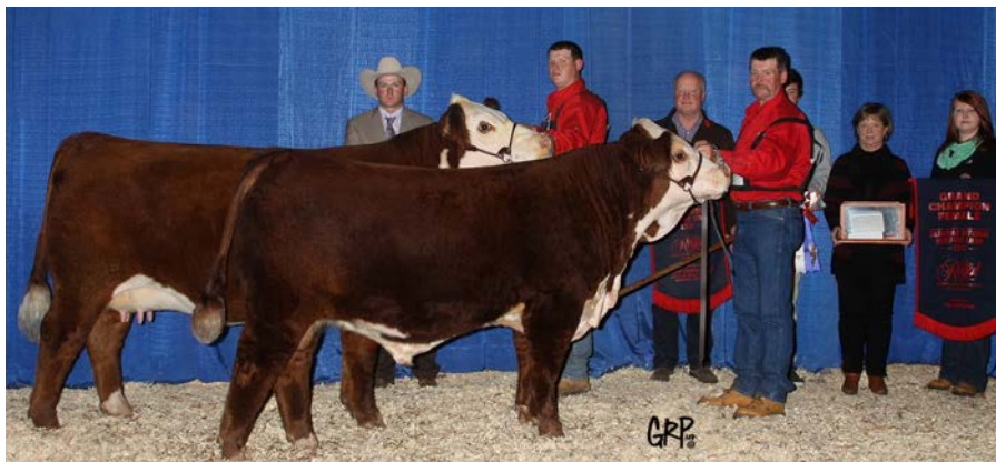
MHPH 301W Dainty 205Y at the Royal 2013 || Dam

Homozygous Polled. 2024 Show Rights reserved. Offering 1/2 Interest and 1/2 Possession, to be mutually agreed upon.