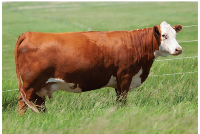
CSC 502 Lady Dew 701 || Dam