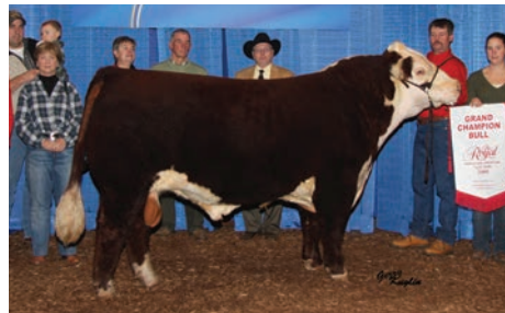
Umpire || Canadian National Champion Bull