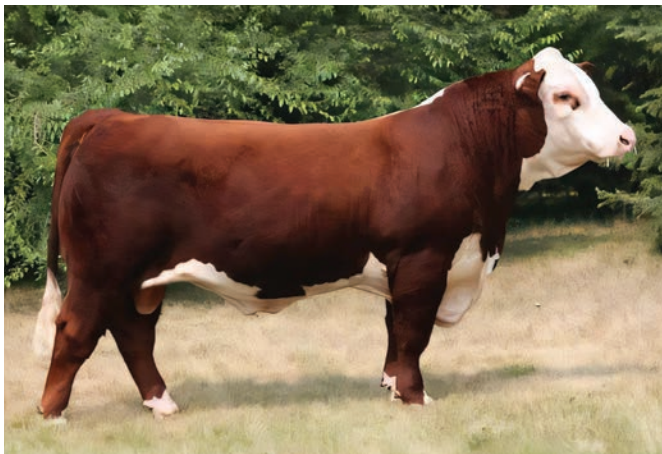
Justice || Sire

Dark red and built right. Check out this maternal gem. Belle, Mira, Nellie, and Yellow Rose packed into one. A future cow in the making.