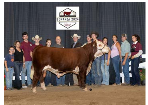
RW MHPH 240J Legacy 102L || Grand Champion Bull