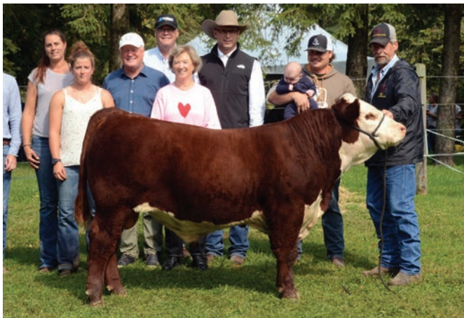
Kodiak || Sire

Our first offering out of Kodiak. Short marked and stout. This heifer has been a barn favorite from the start. Owned with Lynden Manor