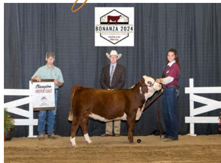
MHPH 240J Betty 115M || Grand Champion Heifer Calf