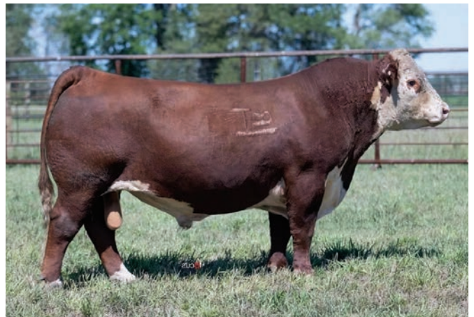
RST Final Print 0016 || Sire