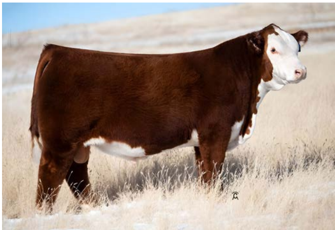
CSC 701 Oshoto 316 || Maternal Brother

A special calf. Genetic power from both sides of her pedigree. She has been admired by all that have seen her. Owned with Abby Hill. 2024 Show Rights reserved. Selling 1/3 Interest, no possession.