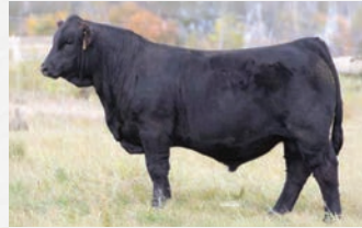
MBJ 23K Full Brother to MBJ 58K