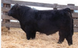
RYM 251L Maternal Sibling