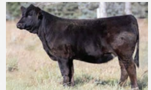
MJB 113K Full Sister to Sire

This bull is coming on really well for a march calf. His dam is a daughter of Lot 56, who's a sister to the dam of Lot 57, Bling 36Z. While I won't go on about Bling as I've talked about her in about ten other footnotes, I will talk about the consistent low birth weights of 9289G. This is a cow that was born at 48 pounds herself, and whose mother had a 74-pound Hannibal bull calf this year. Low birth and great longevity is very expected of this maternal line.