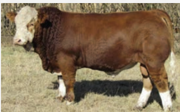
Cherry Creek Elite 8G Sire