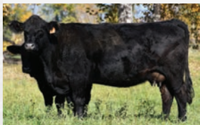
RYM 206H Dam