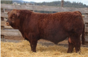
RYM 160L Full Sibling