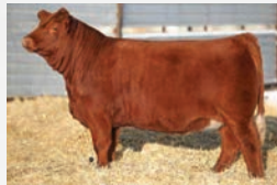
Daughter of Mackfrid sold at FNL