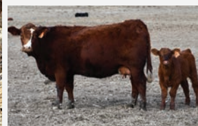
RYM 8J with 211M at side

Moderate birthweights from the dam's side of the pedigree, we absolutely love the mother of this bull. Her dam sent a very good 3/4 brother to DK Land & Cattle of Lampman, SK. 211M is masculine, big hiped, full of meat and solid any which way you view him. There is no questioning the udder quality that will result from this bull. 211M's maternal sister has calved first-cycle and she is a phenotypic copy of their beautiful dam, so much so that we've fondly nicknamed them "Copy & Paste".