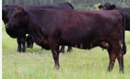
RYM 61J Dam

If you're looking to increase your number of retained females this is your bull. The udder quality is guaranteed good. If he's anything like his genetics predict 234M will sire bright, thrifty calves who grow well and are thick and square made with good hair coats. His dam, Morgan 61J, had an excellent bull calf last year as well.