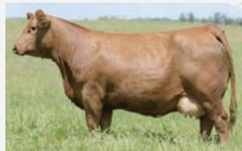
MAF Mackfrid 27F Dam