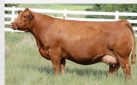
WFL Red Sage 506C

This one will build you females. Females with exceptional udders, that raise you big, solid calves come fall. The beautiful WFL Red Sage 506C and cow-maker Poker Face 2X make up the top side of this pedigree. 149M's dam is yet another "Zeola" - they are our own factory of bull-makers. 149M is thick from every angle, has loads of hair and the money dash of white on his face.