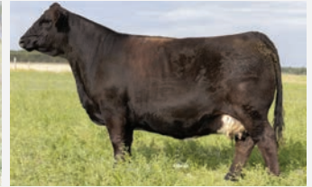
Springcreek Jaycee 122F Dam