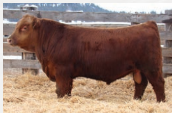
RYM 177K Maternal Sibling