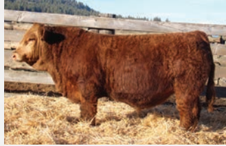
RYM 180L Full Brother