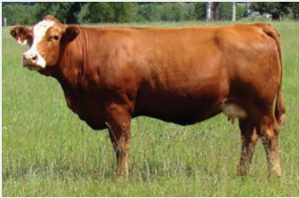
RYM 110G Dam