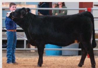
Bling 36Z Dam

Tag: 4136 BW: 90 lbs. ACT WWT: 790 lbs. Feb 10 WT: 1330 lbs.