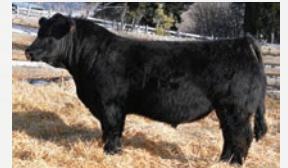
Lot 46 Same Cow Family

We don't know where to begin with the cow families tied to this one. 29M's great granddam is the one and only Bling 36Z, dam of Lot 57. His granddam is also the dam of Lot 63. And sisters include the dams of Lots 46, 41 and 2... hopefully I didn't miss any. Let's not forget about the Poker Face daughter LFE 80A on the sire's side here, she has 7 recorded progeny in the system, adding to the maternal strength of this pedigree. Going back further we see superior donor cow WFL Red Sage 506C as the icing on the cake.