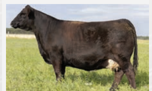
Jaycee 122F Pat. Granddam

When a yearling bull goes out on the range and manages to settle multiple cows it's a testament to his sound structure, travelling ability, and breeding ability – to keep and DNA sire verify 2 bull calves from Bing 58K means he likely settled a fair number more than just those; we're excited to use him on a larger selection of cows in a breeding pasture this year. His dam and full siblings have great merit, selling as the leadoff group in Springcreek's dispersal. Lot 62 is yet another bull who goes back to Sonica 213W, as do lots 9, 18, and 20.