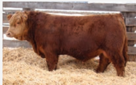
RYM 122K Maternal Brother