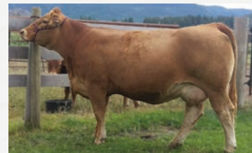
RYM 335C Dam