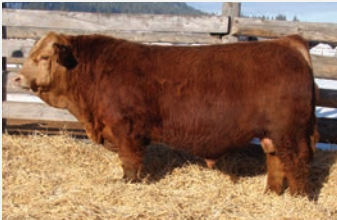
RYM 77J "Back to Reality"