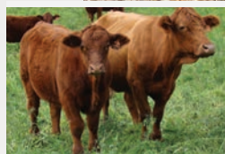
RYM 157G Dam

This bull is in the top 1 and 2% of the breed for calving ease, birthweight and maternal calving ease for a reason. His pedigree combines two of our most fault free calving ease sires – Dillenger 116D and Eastwood 22E. The two herd bulls also happened to sire some outstanding females in terms of production, their daughters consistently out-produce themselves and are the type of cows whose calves are always fat and happy!