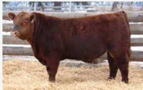
RYM 151J Maternal Sibling