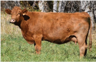
RYM 159G Dam