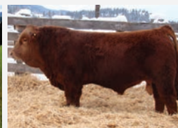
RYM 78K Maternal Brother