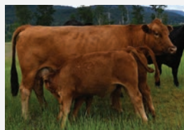
RYM 8311F Mat. Granddam

One can't go wrong with a cow of Crosby 137W lineage. Good calving ease here being in the top 15% for CE and MCE. 270M is above average in 10/13 EPD categories. He profiles well, having great length of body and a straight top. Very correct in his lines, 270M would sire an excellent pen of steers. Daughters would have very high udder quality, as we've appreciated for many generations back through his pedigree.