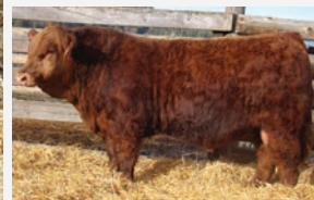
RYM 119L Maternal Sibling

If you can bet on anything, you can bet on Polka 46G, bringing in a tank of a bull calf each fall. 46G and her mother, the dam of Lot 19, come from one of our highest producing cow families tracing back to Boda 196X. 196X herself has had multiple sons sell through the sale and still has 3 direct daughters producing in the herd. Boda 196X daughters and granddaughters have had leadoff bulls in our catalog for years, raising lots 1 and 2 in 2024, lot 4 in 2023, lot 1 in 2022, lot 2 in 2021... they just don't miss. 60M was the second-heaviest bull at weaning, lots of performance here.