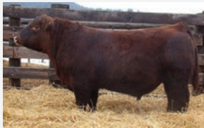
RYM 254L Maternal Sibling