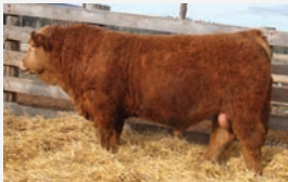
RYM 165L Maternal Brother

Don't let the lesser performance numbers fool you, this bull is a twin, and if you look at all his brothers before him – he comes from powerful genetics and a productive cow who's never missed. This will be 198G's third bull calf through the sale, and they've all been docile, heavy-weaning, soggy made bulls. 178M comes to you in a cherry red, blaze face package with excellent eye appeal and muscle shape.