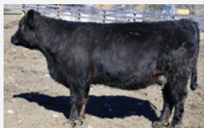
RYM 211K Dam

Surefire heifer bull from both sides of the pedigree. This bull is in the top percentile rank for calving ease, birthweight and maternal calving ease EPDs. His dam is a sweet uddered, fancy little cow who we're sure will go on to raise many good ones, just like her dam did.