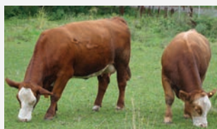
RYM 132U Great Granddam

Another heifer-pen-special with top of the breed EPDs in all three calving ease and birthweight traits. He has many calving ease greats in his pedigree, from Eastwood 22E to Crossroad Convoy 136X. The dam of this bull really is long as a freight train and thick from end to end. If she is anything like