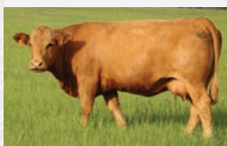
RYM 175F Dam

A moderate framed bull whose dam has brought many sons to this sale. 325M carries very eye appealing shape, muscle pattern and balance overall. Will not add milk, but daughters' udder quality and suspension should be ideal. His dam, her full sister, and their dam all have beautiful udders. A group of steers sired by this bull would be packed full of meat and very consistent.