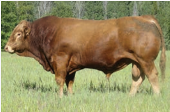
BOBE 102Y Paternal Great Grandsire