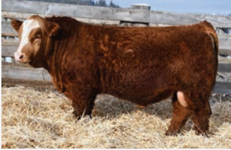
RYM 21M Son of 66K