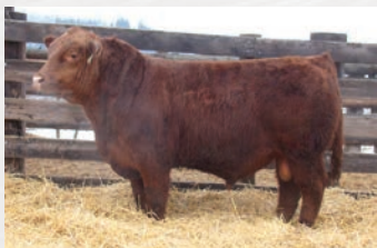
RYM 61L Maternal Sibling