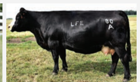
LFE 80A Pat. Granddam