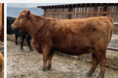
Dam RYM 38H as a 2-Year-Old

solidifies the maternal strength with 8 recorded progeny. 126M is well above average for calving ease, birthweight, weaning weight, yearling weight and maternal calving ease EPDs.