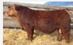
RYM 284L Maternal Sib to Dam

In the top 1% for calving ease, birthweight and maternal calving ease but also the heaviest Parks 6J son at weaning and one of the heaviest weaning heifers' calves overall. This bull exemplifies curve bending growth as a result of crossing calving ease phenoms Parks 6J and Eastwood 22E with powerhouse sire Spectator 160E. This bull's granddam is one of a long line of excellent females stemming from Ann 121W who placed 5 bulls in this sale over her many years in production.