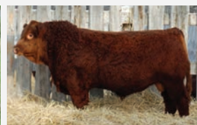
CRF 136X Great Grandsire

her dam and granddam she will be a hard-working, sound-uddered, functional female for a long time to come.