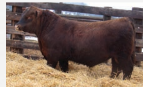
RYM 19L Maternal Sibling

Talk about a little cow that puts in work, this is Ms Drive 81G's fourth bull calf to date, and she knocks it out of the park every time. 81G also has a perfect track record of early gestations, she has never calved later than the 2nd day of first cycle. Lot 66 is a truly impressive beef bull from all angles, he's long spined, big barrelled and packs a ton of meat on his frame, all while maintaining an attractive front third and keen herd bull head.