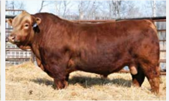
Springcreek Ladies Man 90E Sire