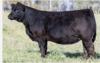
MBJ 26K Full Sister to MBJ 58K

SPRINGCREEK Bing 58K Purebred Male BPTG1381894 MBJ 58K 18/1/2022