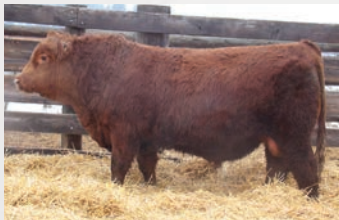
RYM 35L Sibling to Dam