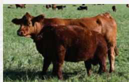
RYM 203J Full Sister

We bred the dam of this bull, 157B, the same way numerous times and we've never been disappointed. Perhaps the best of them all is the full sister, Sahara 203J. She raised an absolute tank of a Galen 48C heifer calf, and the pair was exceptional all fall. Very consistent maternal production here, as well as stellar calving ease numbers.