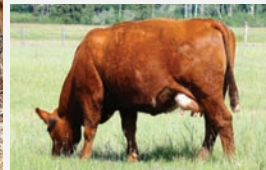
Rebel 33Y Mat. Great Granddam

95M was an easy pick in the spring. This blaze faced, big middled, power bull has always looked the part. He also takes the cake for being the heaviest bull to go in the pen at weaning time. This bull's pedigree contains maternal greats like Rebel 33Y and Sonica 213W; and Handprint 4H is a great cross on this cow family.