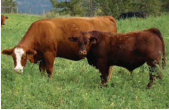
RYM 110G with 160L at side