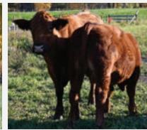
RYM 319J w/ 68M at side