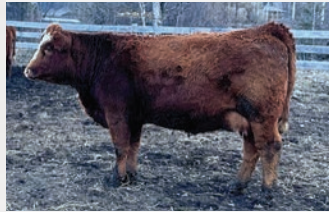
RYM 66K Maternal Sister