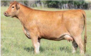
Rhea 21G Paternal Granddam