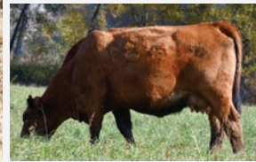
RYM 319J Dam

The only red bull in the sale whose lineage goes back to Bling 36Z. Bling's own calf, as well as her daughters' and granddaughters' bull calves sell as follows: Lot 57, 41, 46, 52 and 63. What makes Lot 2 even more special, is that his dam is a "Horizon" sired by the Dillenger 116D bull. Top-of-the-line maternal calving ease on the bottom side of this pedigree, not to mention the Dillenger daughters' production records, extremely sound feet and legs, and udder quality.