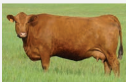
RYM 143F Dam

Lot 9 is full brother to the dam of Lot 18. They are mothered by an extremely easy-keeping, deep sided hybrid cow RYM 143F. Look back in her pedigree and you'll see she comes from some of our favourite Angus bloodlines that we retained for in-herd use over the years. She's also of the same highly functional Sonica 213W cow family as Lot 20.