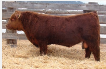
RYM 249J Sibling to Dam