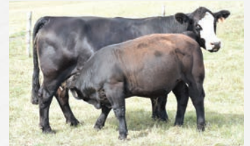
Dam LFE 80A with calf

Another good herd sire purchased from Circle G Simmentals based on the merit of Garth Cutler's very impressive cowherd. Instinct has already been proven to add sound foot structure, bone, and body mass, along with that sought after money-stripe white face. After viewing the dam of Instinct 33J we were sure his daughters would become favourites with beautiful udders – now that we have calved the first set, we can confirm that notion. They are nice tempered females, certainly have great udder quality and I think they're going to be stellar bull producers in the future.