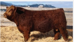
RYM 150K Eastwood x Binky 22D

Destined for the heifer pen. On Trend 3M is out of a cherry red first-calver who unfortunately got split from 3M at some point on the range, hence the weaning weight. This bull goes back to another "Horizon" cow - these females are easily some of the best producing, easiest calving cows we have, and their sire, Dillenger 116D, was incredibly sound and stayed here many years. Going back further in the pedigree we have Binky 222D, a bigtime performance cow who sent a son to Triple T Diamond Simmentals in Manitoba. A full sister to that bull raised her first calf last year and she is a beauty! Tidy, angular fronted and big bodied. 3M is backed by many generations of solid females.