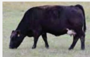
MBJ 62A Dam

Never did we think that this big volume, well-muscled herd bull would turn into our heifer pen specialist. But we have since mated and calved out all our black heifers to him which worked impeccably well. His first set of daughters also calved this year, and the udder quality is extremely strong, they are compact, pear shaped, sweet tempered young brood cows. 44J's EPD profile is second to none; he is sound, very docile, and easy fleshing. We retained a son out of this bull to carry his genetics further in our program.