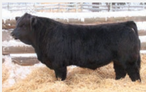
RYM 195K Maternal Brother

158M has been one of the heaviest bulls in the pen at all stages of growth. He boasts tons of length, muscle and eye appeal while maintaining excellent calving ease numbers and a well-balanced EPD profile. His maternal sister is a stellar first-calver who's fault-free in her lines, with a neat little head and tidy udder. This isn't his dams first bull through the sale either, for a little cow she's produced very well for us.