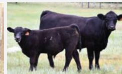
RYM 165K w/ 108M - June 10th