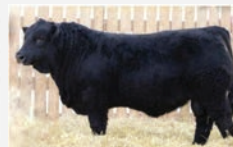
MRL Batman 34H Grand sire

Another Bling 36Z descendant, as we can't seem to get enough of them! We sure are lucky Bling had so many daughters as now that they have come into production, we see so many sending solid bull calves through the sale. Lot 46 is in the top 15 percentile or better for CE, BWT, WWT, YWT, maternal calving ease, maternal weaning weight, all purpose index, and terminal index EPDs. His dam brought him home weighing 805 pounds off the range and his muscle mass, attractive profile and shape complete the package.