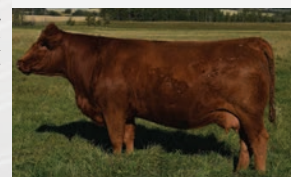
Dream Gal 838F Granddam

Homozygous Polled by pedigree. Lot 30's dam did an excellent job bringing him in off the range at 850 pounds and this is something we've come to expect from the Elite 8G daughters. As for 90M's sire, we kept nearly every calf out of the Kingston 104K bull; they started out moderate at birth, but you'd never know they were heifers' calves come fall. 104K progeny are early maturing and their performance is backed by phenomenal EPDs – just check out Potent 90M's and see for yourself!