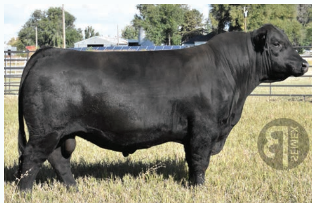
Ellingson Top Shelf 5050 SIRE

Exposed to Crooked Creek Movin On 95K May 13 - June 16, and HA Outside 5307 June 17 - Sept 1, 2024.