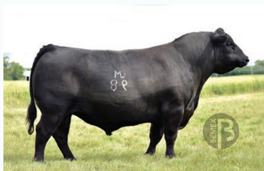
MOGCK Specialist 98 SIRE