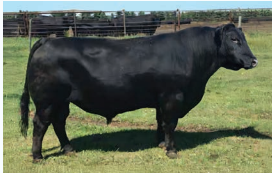
HA Outside 5307