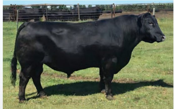
HA Outside 5307 SIRE

Exposed to Crooked Creek Guarantee 25L June 17 - Sept 1, 2024.