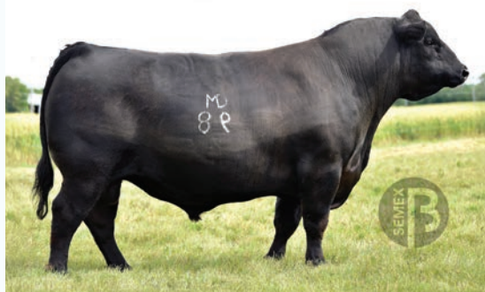
MOGCK Specialist 98 SIRE