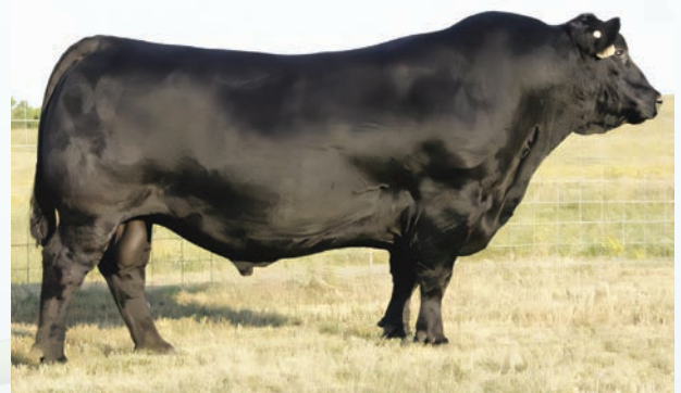
SA V 8180 Traveler 004 PATERNAL GRANDSIRE

AI bred to Crooked Creek Smart One 63B on April 8, 2024. Exposed to Crooked Creek Outside 106G May 6 - Sept 22, 2024.