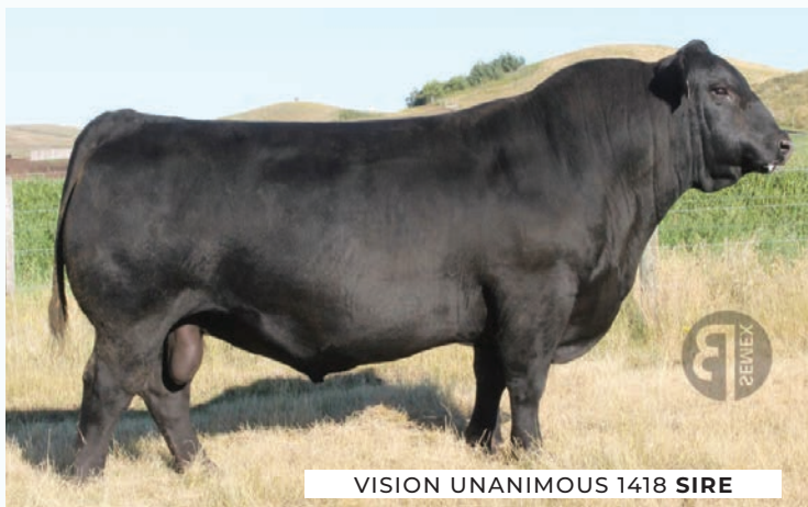
VISION UNANIMOUS 1418 SIRE