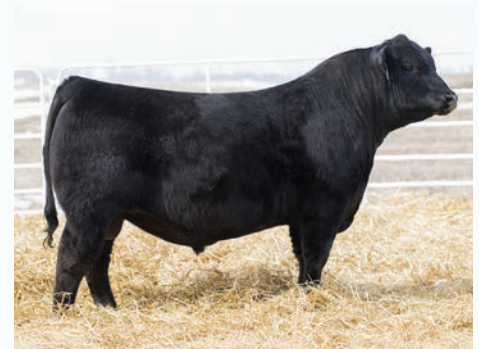
Mogck Entice SIRE OF 80H