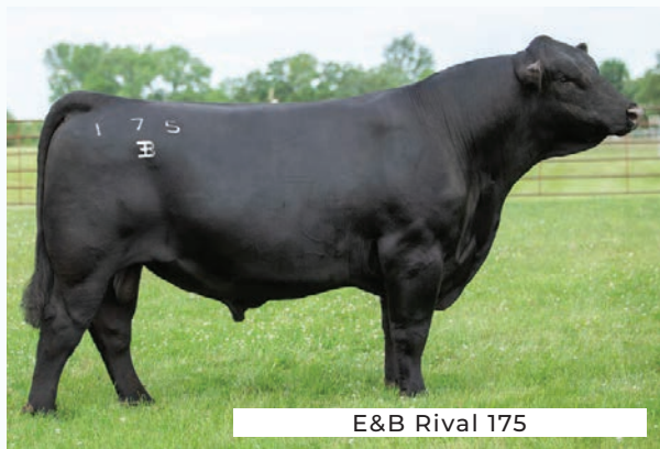
E&B Rival 175

RS WHITESTONE Male 2250656 IMP 0100G 7/12/2019