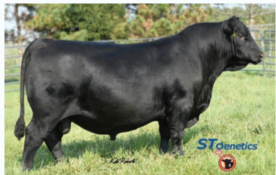
POSS Winchester SERVICE SIRE