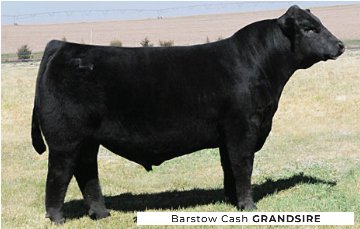
Barstow Cash GRANDSIRE

AI bred to Whitestone on May 2, 2024. Exposed to Crooked Creek Movin On 95K May 13 - June 16, and Crooked Creek Movin 74K from June 18 - Sept 22, 2024.