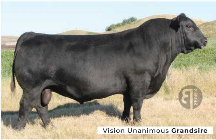
Vision Unanimous Grandsire

Exposed to Crooked Creek Movin On 95K May 13 - June 16, and Crooked Creek Outside 36H Aug 1 - Oct 15, 2024.