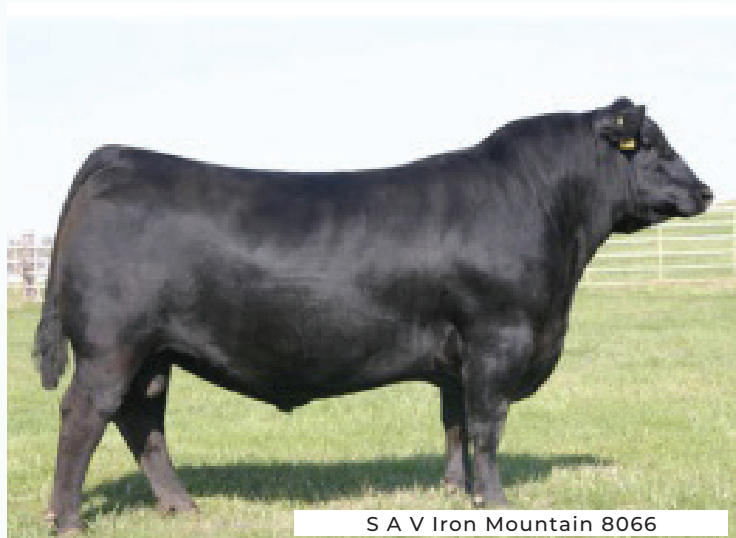
S A V Iron Mountain 8066

Exposed to Crooked Creek Outside 36H June 15 - Oct 15, 2024.