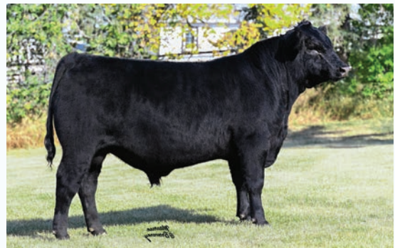
LLB Bullseye 957K AI SIRE