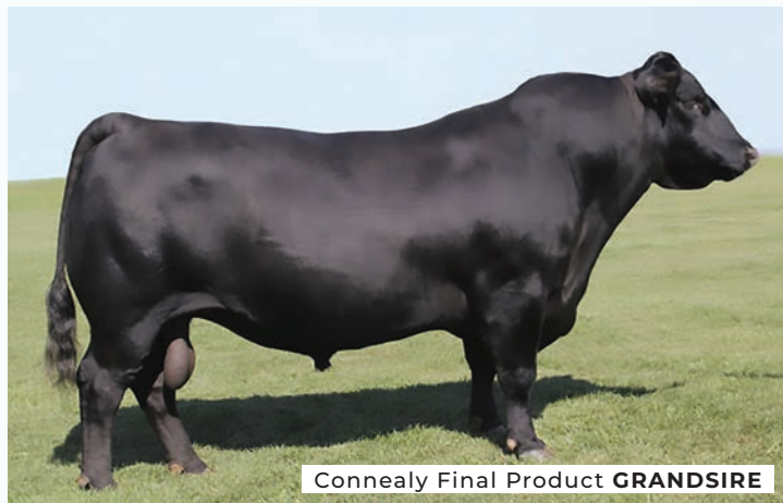
Connealy Final Product GRANDSIRE

Exposed to Crooked Creek Outside 106G May 6 - June 17, and Crooked Creek Outside 36H from June 23 - Oct 15, 2024.