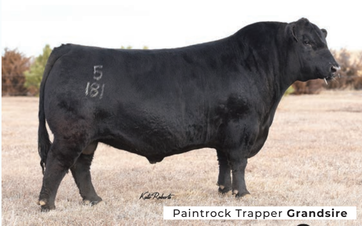
Paintrock Trapper Grandsire

Exposed to Crooked Creek Outside 36H June 23 - Oct 15, 2024.