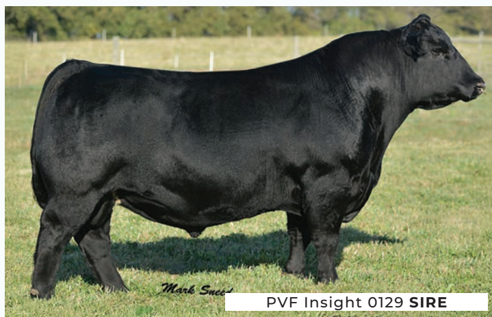
PVF Insight 0129 SIRE

Exposed to Crooked Creek Movin On 95K May 13- June 16, and HA Outside 5307 June 17 - Sept 1, 2024.