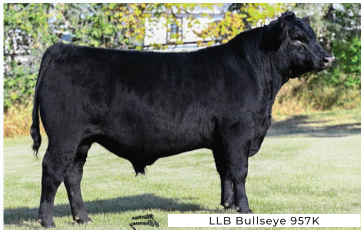
LLB Bullseye 957K