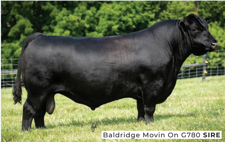
Baldrige Movin On G780 SIRE

AI bred to Sitz Intuition on May 16, 2024. Exposed to Crooked Creek Outside 106G May 6 - June 17, and Crooked Creek Movin 74K June 18 - Sept 22, 2024.