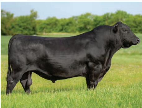
Hoffman Stagecoach 1908

AI bred to LLB Bullseye 957K on April 20, 2024, and POSS Winchester on May 9, 2024. Exposed to Crooked Creek Guarantee 25L June 17 - Sept 1, 2024.