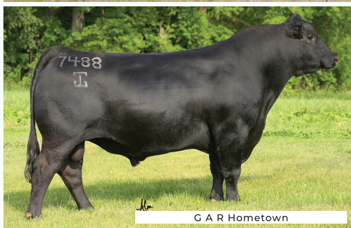
G A R Hometown

AI bred to Hoffman Stagecoach 1908 on April 2, 2024. Exposed to Crooked Creek Outside 106G May 6 - June 17, and Crooked Creek Movin 74K June 18 - Sept 22, 2024.