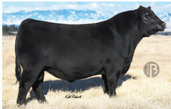
North Camp Silver Star 5103 SIRE OF 52H