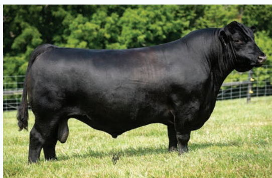
Baldrige Movin On G780 SIRE