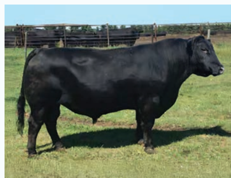
HA Outside 5307 PATERNAL GRANDSIRE