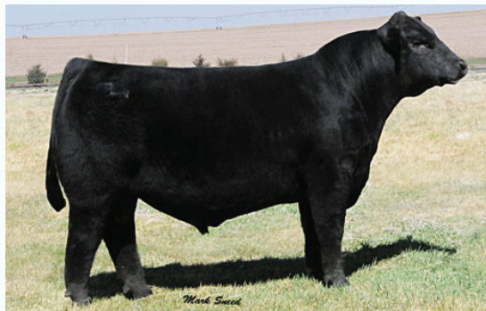
Barstow Cash PATERNAL GRANDSIRE