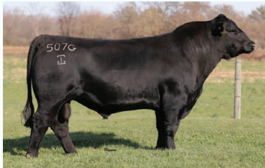
G A R Dual Threat SIRE

Exposed to Crooked Creek Guarantee 25L June 17 - Sept 1, 2024.