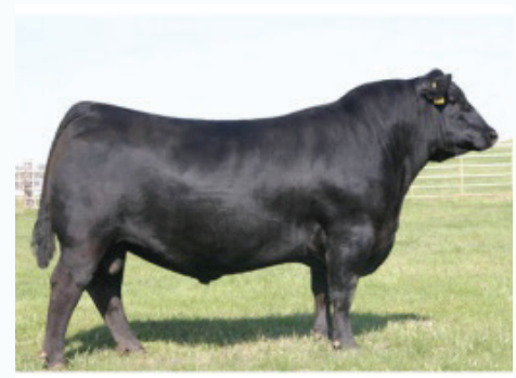
S A V Iron Mountain 8066 GRANDSIRE