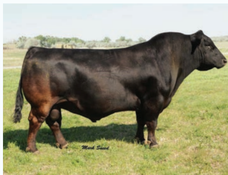
Wisdom MATERNAL GRANDSIRE