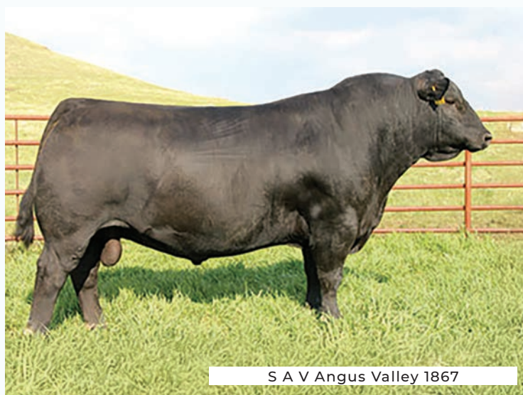
S A V Angus Valley 1867

AI bred to Crooked Creek Smart One 63B on April 26, 2024. Exposed to Crooked Creek Movin On 95K May 13 - June 16, and HA Outside 5307 June 17 - Sept 1, 2024.