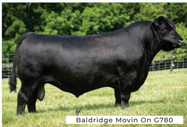
Baldridge Movin On G780

RS BALDRIDGE MOVIN ON G780 Male 2192493 IMP 780G 11/2/2019