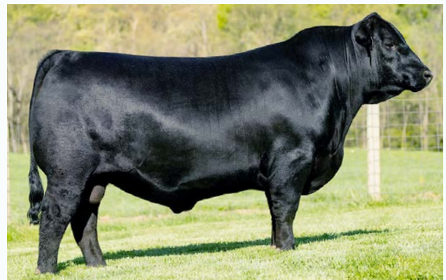
Whitestone SERVICE SIRE