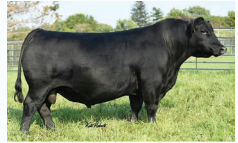
Sitz Intuition SIRE OF 19M