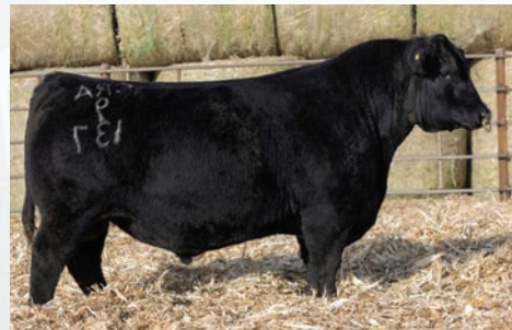
Crawford Guarantee 9137 SIRE