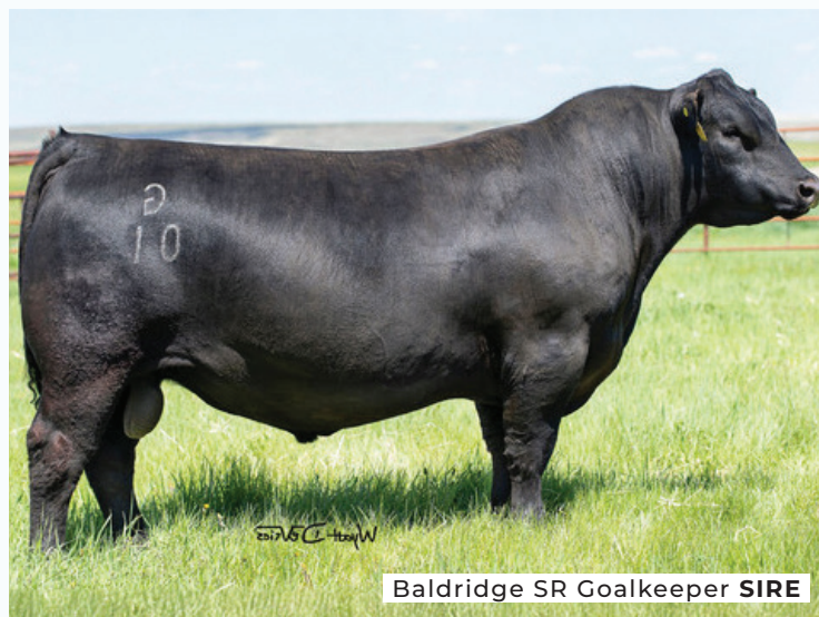
Baldridge SR Goalkeeper SIRE