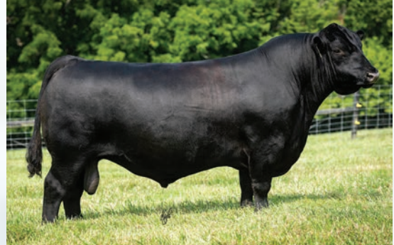
Baldrige Movin On G780 SIRE