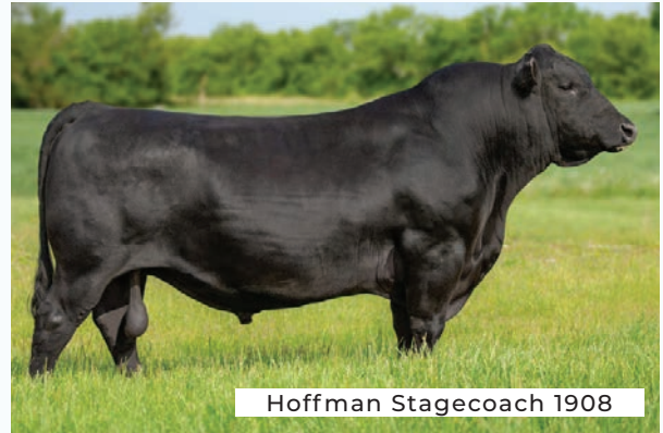
Hoffman Stagecoach 1908