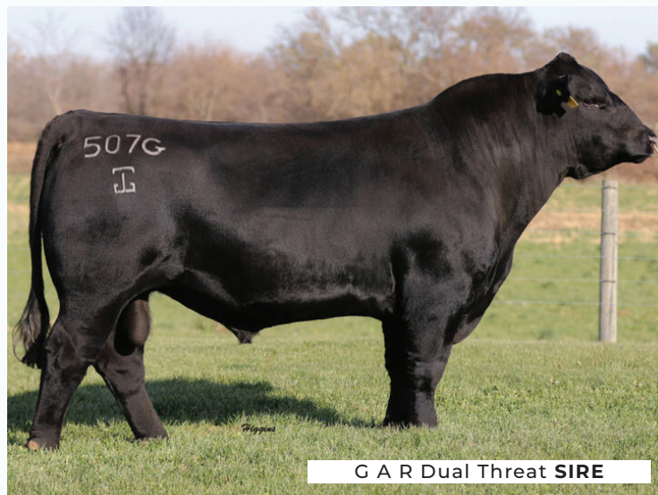
G A R Dual Threat SIRE