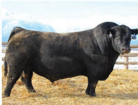
Coleman Charlo GRANDSIRE OF 70H

Bred to Whitestone on May 6, 2024. Exposed to Crooked Creek Movin On 95K May 13 - June 16, and HA Outside 5307 June 17 - Sept 1, 2024.