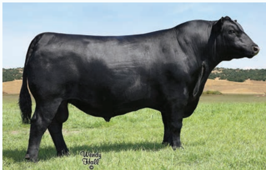
Hoover Know How SIRE