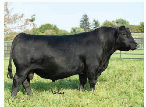
Intuition SERVICE SIRE