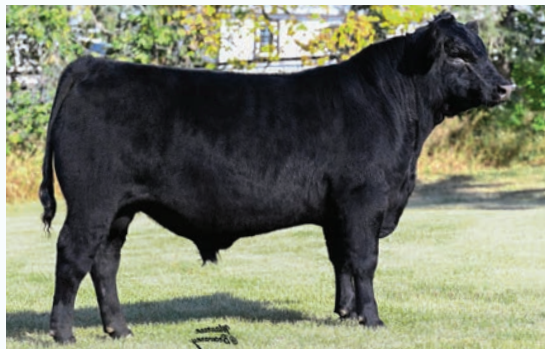
LLB Bullseye 957K SERVICE SIRE