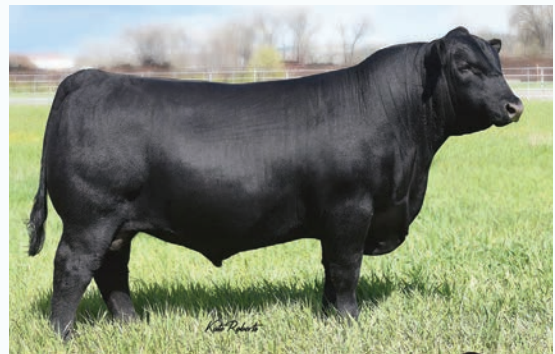
Musgrave 316 Stunner GRANDSIRE OF 125L