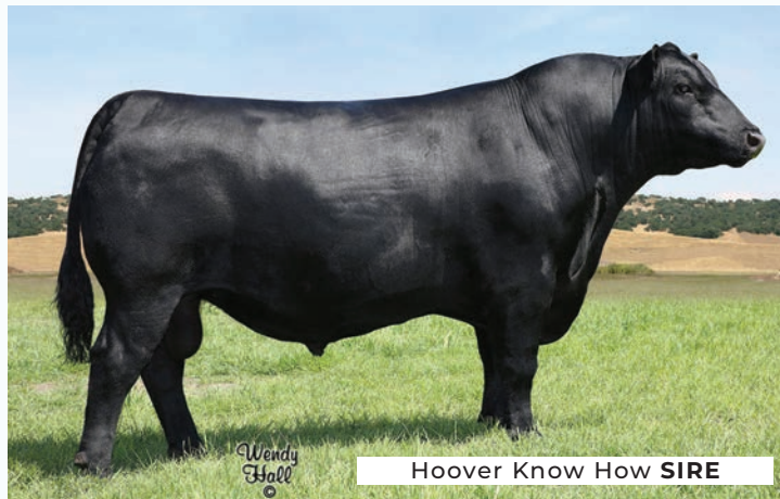
Hoover Know How SIRE

Exposed to Crooked Creek Outside 106G May 6 - June 17, and Crooked Creek Movin 74K June 18 - Sept 22, 2024.