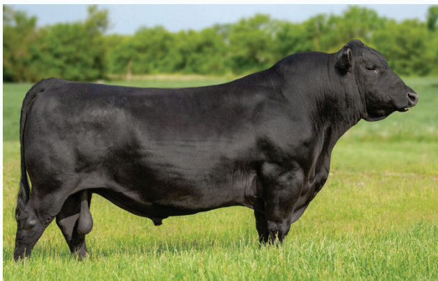
Hoffman Stagecoach 1908 SERVICE SIRE

AI bred to Whitestone on May 3, 2024. Exposed to Crooked Creek Movin On 95K May 13 - June 16, and Crooked Creek Outside 36H from August 1 - Oct 15, 2024.