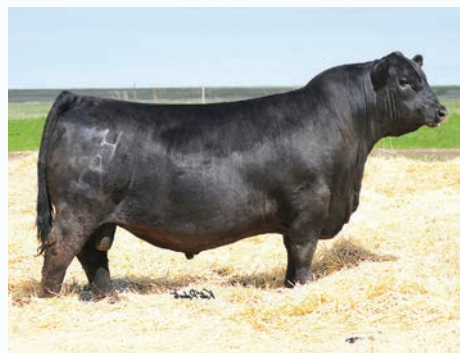
Cowboy Up SIRE