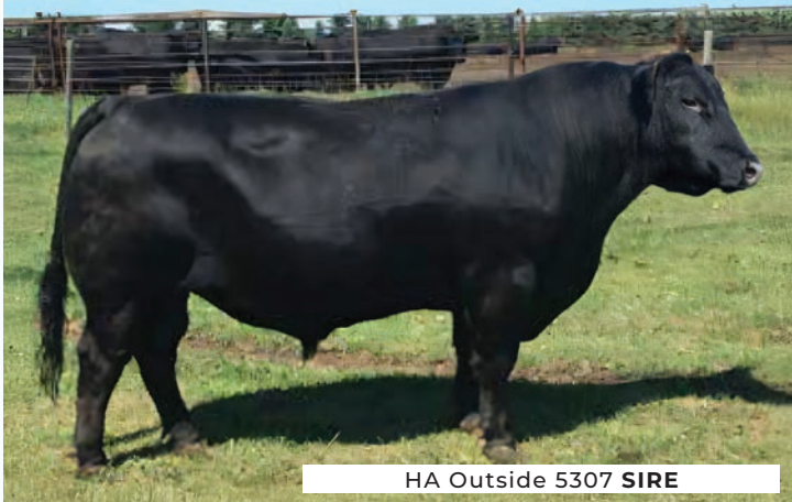
HA Outside 5307 SIRE

AI bred to Grabers Mr Angus 9080 on April 24, 2024. Exposed to Crooked Creek Movin On 95K May 13 - June 16, and Crooked Creek Movin 74K from June 23 - Sept 22, 2024