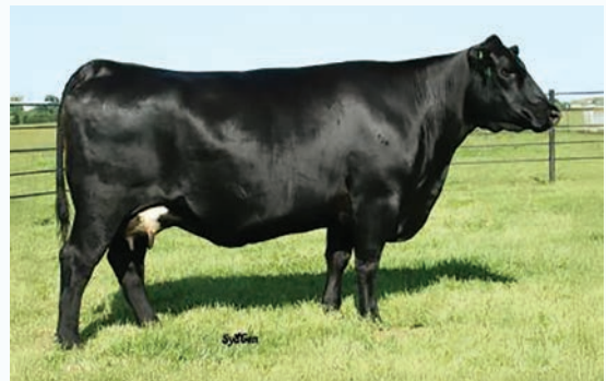
DAM OF GRANDSIRE SYDGEN C C & 7 Sydgen Forever Lady 4087 | $42,500 Half Interest