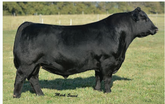
PVF Insight 0129 GRANDSIRE