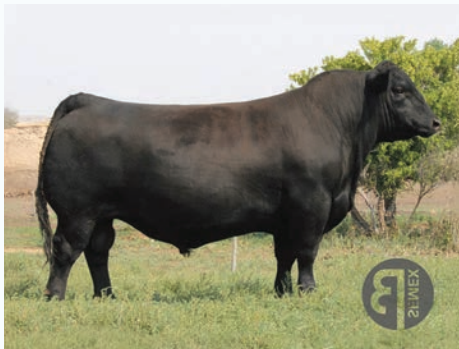
Shiefelbein Attractive 4565 GRANDSIRE

AI bred to LLB Bullseye 957K on April 23, 2024 and May 13, 2024. Exposed to Crooked Creek Guarantee 25L June 17 - Sept 1, 2024.