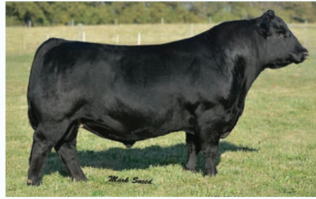
PVF Insight 0129 SIRE OF 14K