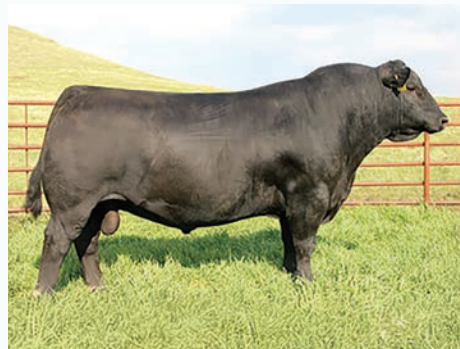
S A V Angus Valley 1867 GRANDSIRE

Exposed to Crooked Creek Guarantee 25L June 17 - Sept 1, 2024.