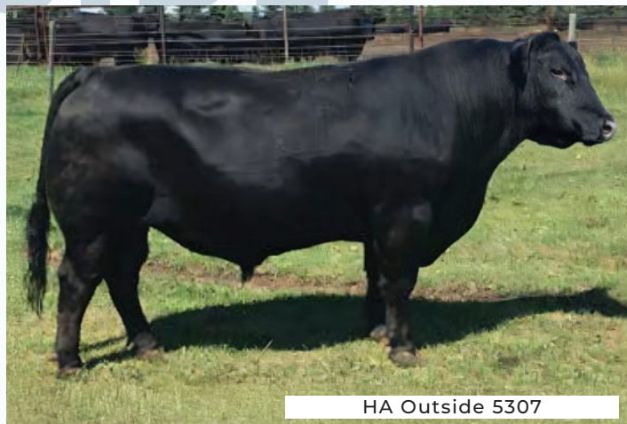
HA Outside 5307