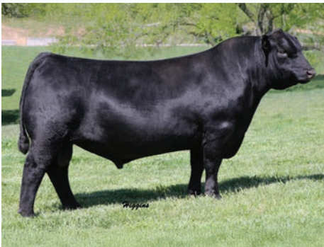
Rainmaster 6849 SIRE OF 70H

AI bred to Baldrige SR Goalkeeper on April 16, 2024. Exposed to Crooked Creek Movin On 95K May 13 - June 16, and HA Outside 5307 June 17 - Sept 1, 2024.