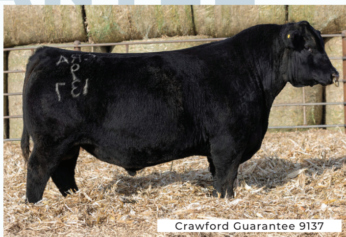
Crawford Guarantee 9137