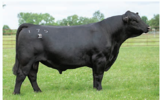
E&B Rival 175 SERVICE SIRE