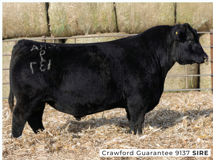
Crawford Guarantee 9137 SIRE