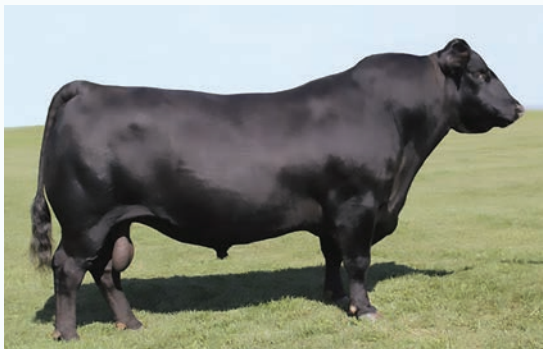
Connealy Final Product PATERNAL GRANDSIRE