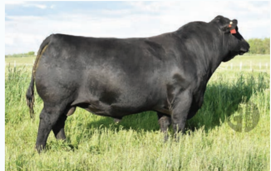
Musgrave Intel SIRE OF 35L