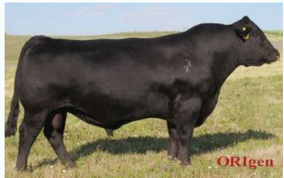
EXAR Upshot 0562B MATERNAL GRANDSIRE