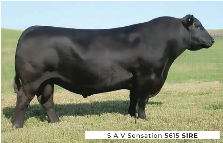
S A V Sensation 5615 SIRE