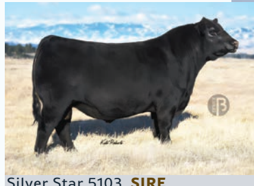
Silver Star 5103 SIRE

14K's dam, 25H, sells as lot 34, and her granddam, 40C, sells as lot 4. Exposed to Crooked Creek Guarantee 25L June 17 - Sept 1, 2024.