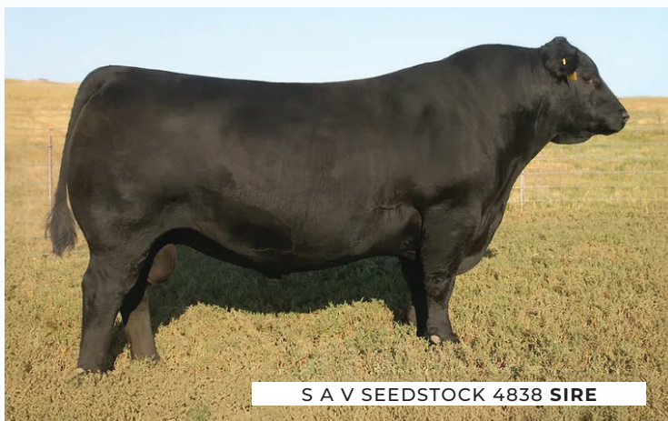
S A V SEEDSTOCK 4838 SIRE

AI bred to Whitestone on April 19, 2024. Exposed to Crooked Creek Outside 106G May 6 - June 17, and Crooked Creek Movin 74K from June 18 - Sept 22, 2024.