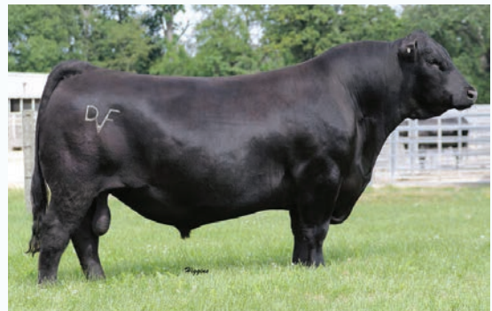
Deer Valley Growth Fund MATERNAL GRANDSIRE