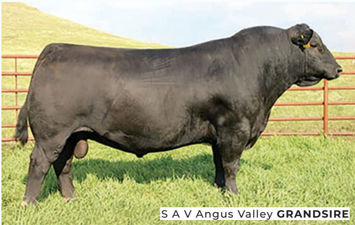
S A V Angus Valley GRANDSIRE

AI bred to Baldrige SR Goalkeeper on April 8, and Yon Saluda (REG# 20336998) on April 11, 2024. Exposed to Crooked Creek Outside 106G May 6 - June 17, and Crooked Creek Movin 74K from June 18 - Sept 22, 2024