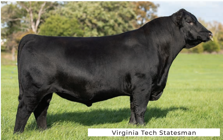
Virginia Tech Statesman

AI bred to Virginia Tech Statesman on April 18, 2024. Exposed to Crooked Creek Outside 106G May 6 - June 17, and Crooked Creek Guarantee 25L June 17 - Sept 1, 2024.