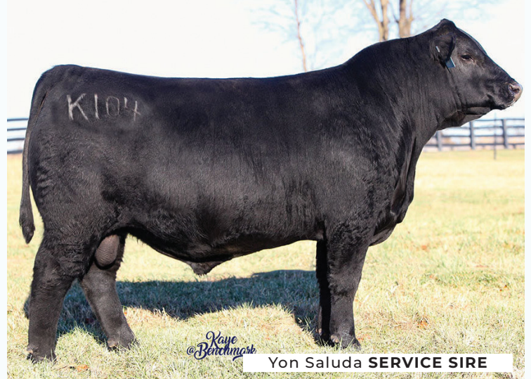
Yon Saluda SERVICE SIRE

AI bred to Yon Saluda on April 5, 2024. Exposed to Crooked Creek Guarantee 25L June 17 - Sept 1, 2024.