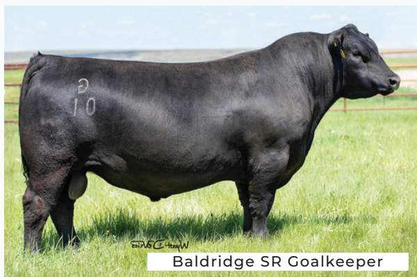
Baldridge SR Goalkeeper

RS BALDRIDGE SR GOALKEEPER Male 2239206 IMP 01G 7/1/2019