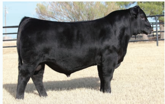
Wilks Regiment 3095 SIRE OF 54L

Exposed to Crooked Creek Guarantee 25L June 17 - Sept 1, 2024.