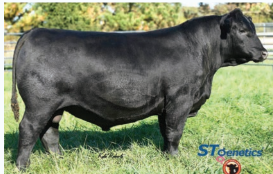
Grabers Mr Angus 9080 SERVICE SIRE

AI bred to Grabers Mr Angus 9080 on April 26, 2024. Exposed to Crooked Creek Movin On 95K May 13 - Sept 14, 2024.