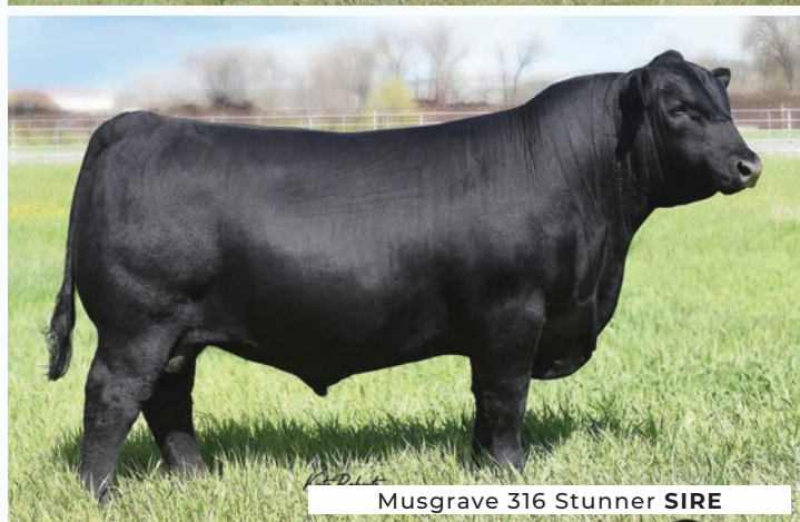
Musgrave 316 Stunner SIRE

Exposed to HA Outside 5307 from April 16 - June 16, and Crooked Creek Outside 36H from August 1 - Oct 15, 2024. Confirmed an early pregnancy on June 10, 2024.