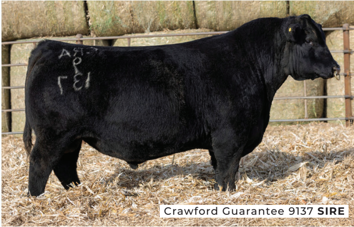
Crawford Guarantee 9137 SIRE