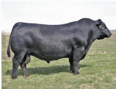
Net Worth PATERNAL GRANDSIRE