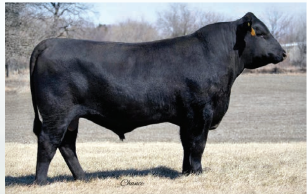
E W A Peyton 642 SIRE

Exposed to Crooked Creek Movin On 95K May 13 - June 16, and HA Outside 5307 from June 17 - Sept 1, 2024.