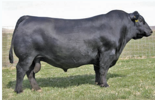
S A V Net Worth 4200 GRANDSIRE

AI bred to POSS Winchester on April 28, 2024. Exposed to Crooked Creek Movin On 95K May 13 - June 16, and HA Outside 5307 from June 17 - Sept 1, 2024.