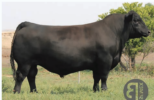
Schiefelbein Attractive 4565 SIRE OF DEWDROP 3'20

Exposed to Crooked Creek Guarantee 25L June 17 - Sept 1, 2024.