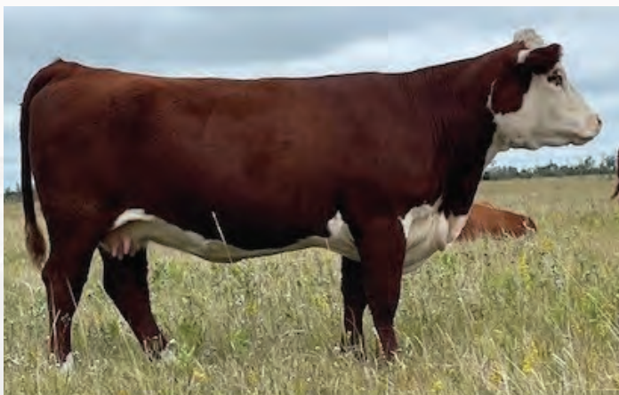
PCL 6153 PHANTOMS MISS 39H - DAM