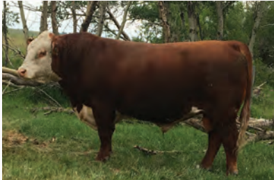
KIRBY-LONEPINE PRINCE ET 10E - SIRE