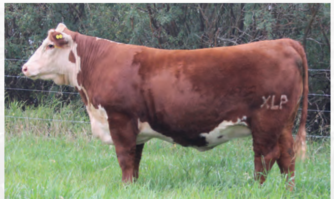
FULL SISTER TO LOT 1