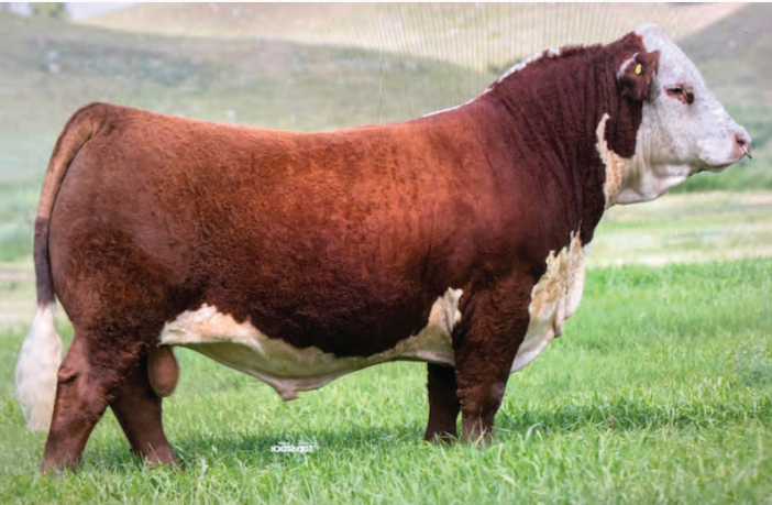
EVOLVE 112J - SIRE CWA RESERVE GRAND BULL