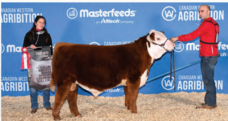
AGRIBITION RESERVE JUNIOR BULL CALF CHAMPION - PATERNAL BROTHER TO LOT 1 & 2