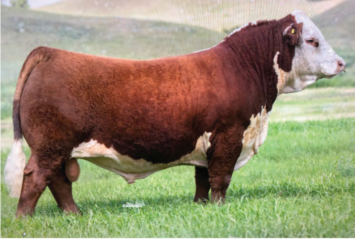
EVOLVE 112J - CWA RESERVE GRAND BULL