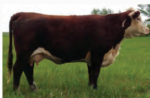
GHC MISS UNIQUE 25Z - DAM LOT 26 GRANDAM LOT 25