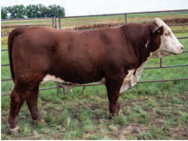
HMS HI-CLIFFE KNOCK OUT ET 93K - SERVICE SIRE IOTS 42 - 49

93k is a low birth weight bull we purchased from Hi-Cliffe at the Premium Genetics bull sale this Spring. With a 71 lb birth weight and a tremendous 1380 lb yearling weight we can see good things coming in his offspring. Can't wait to see his calves.