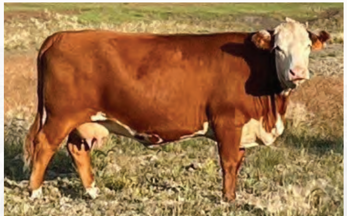
GHC C5 MISS GOVERNESS 3C - DAM