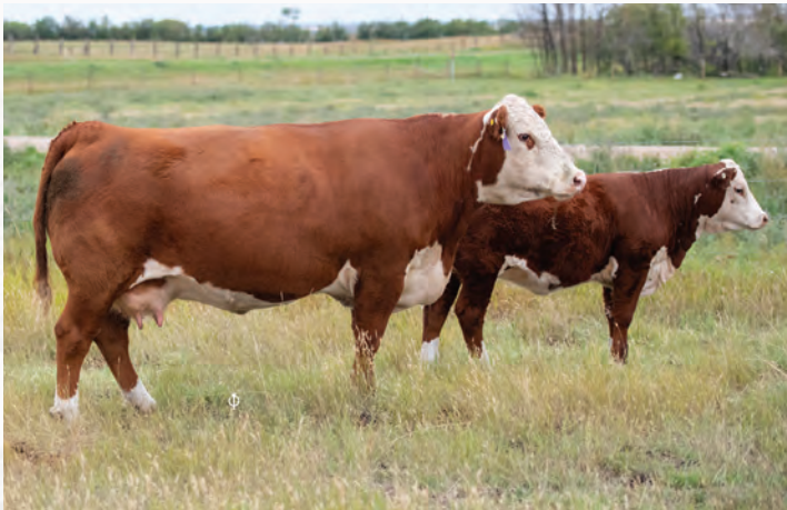
COUNTRY 3F - DAM