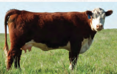
GHC C5 MISS TRADITION 81C- DAM

PREG CHECKED JULY 25 AND VET CONFIRMED 110+ DAYS BRED. SAFE TO AI NJW 119E 87G ENDORSEMENT 216J ON APRIL 4. EXPOSED FROM APRIL 27- JULY 11 TO SHF KEROSENE 589 K084 ET.