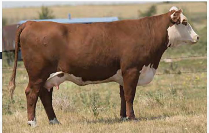
GHC C5 MISS DUCHESS 58C - DAM TO LOTS 33 AND 33A

EPD: BW: 2.2 // WW: 64.2 // YW: 100.2 // MM: 39.9 // TM:72