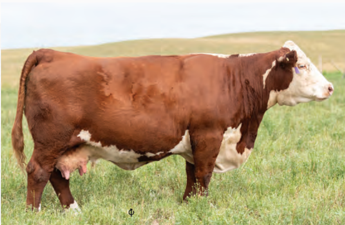
ULTRA 306A - DAM