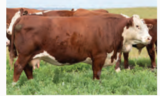
WCC 323Y BEAUTY 4927B - DAM