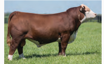
BOYD POWER SURGE 9024 - SIRE

PREG CHECKED JULY 25 AND VET CONFIRMED 55-60 DAYS BRED. EXPOSED TO SHF HORIZON D287 H022 ET FROM APRIL 1-27 THEN EXPOSED FROM APRIL 27-JULY 11 TO SHF KEROSENE 589 K084 ET. OBSERVED BRED MAY 28 TO SHF KEROSENE 589 K084 ET