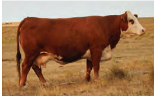
C&L MISS ADVANCE 22S 24B - DAM