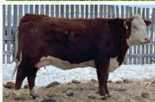
FIRST CALVER OUT OF GAINER 11G