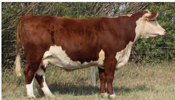
XLP 75Z BELLE 116E - DAM

Halter Broke Birth weight: 89lbs Consigned with Mount-Vern Polled Herefords