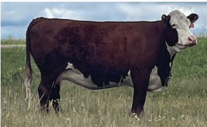
AIRRIESS-ACRES FOXY LADY 3F - DAM