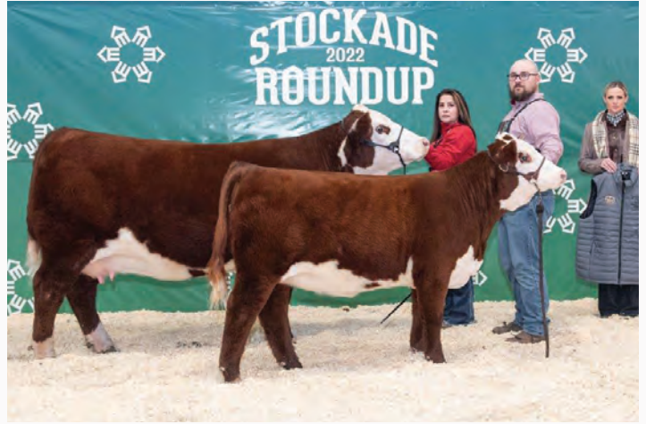
GLAMOUR 32G - DAM OF EMBRYOS