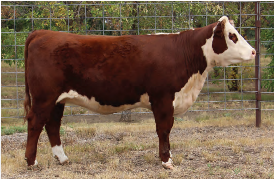
PCL 6153 REAL LADY 17H - DAM LOT 42

An feature lot of our newest herd sire, Jury 25J. He was the high selling lot in the RSK bull sale. He is a fully pigmented son of Firefly 986. She is a fantastic combination of the best genetics this breed has to offer.