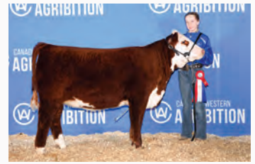
AGRIBITION JUNIOR BEEF SUPREME HEIFER CALF CHAMPION MATERNAL SISTER PURCHASED BY RIVER VALLEY POLLED HEREFORDS

Halter Broke Birth weight: 76lbs Consigned with Mount-Vern Polled Herefords and Kirby Polled Herefords