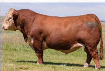
NJW 79Z 199B BOURBON 126H - SERVICE SIRE