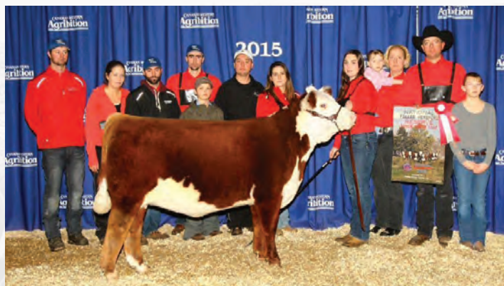
XLP 5J MEMBER OF THE REESE FAMILY

BRED TO KIRBY-LONEPINE MERLIN 28K ON MAY 13TH EXPOSED TO KIRBY-LONEPINE MERLIN 28K FROM MAY 9TH- AUGUST 13TH