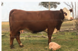
AIRRIESS-ACRES DREAM GIRL 25E - DAM