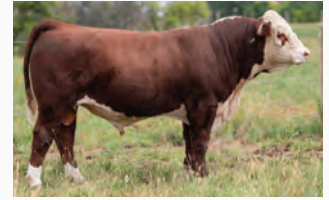
KEYNOTE 11K - SERVICE SIRE

BRED TO PCL 183F KEYNOTE 11K ON MAY 10TH.