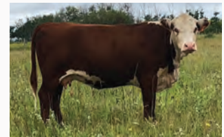
GHC EL MISS SYBIL 161D - DAM

PREG CHECKED JULY 25, AND VET CONFIRMED 90 DAYS BRED, OBSERVED BRED ON APRIL 22 TO SHF KEROSENE 589 K084 ET EXPOSED FROM APRIL 13- JULY 11 TO SHF KEROSENE 589 K084 ET