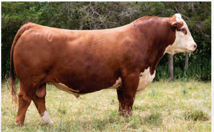
NJW 11B 6589 AUTHORITY 57G ET Sire