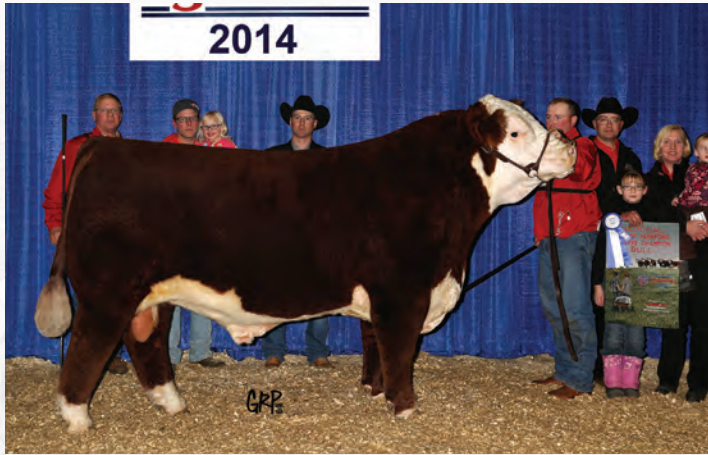
ACTION 75Z - BROTHER TO XLP SPLENDOR ET 75D