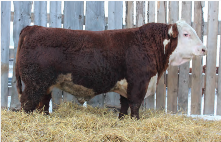
XLP POLLED SCRIPT 355B - SIRE

BRED TO KIRBY-LONEPINE MERLIN 28K ON MAY 6TH EXPOSED TO KIRBY-LONEPINE MERLIN 28K FROM MAY 9TH- AUGUST 13TH