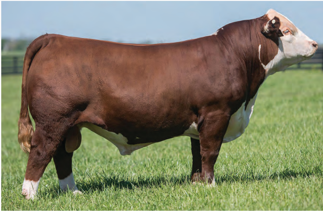
BOYD POWER SURGE 9024 - SIRE LOT 41