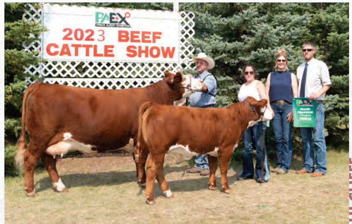
JUNIPER 3J - FULL SISTER