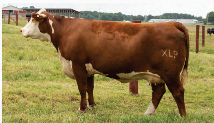
XLP 190B BELLE 116H - MATERNAL SISTER