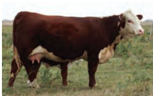
GHC MISS HOLLY 125C - GRANDAM