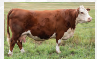
SHPH 66W MAGIE 134Z - DAM