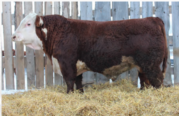
XLP POLLED SCRIPT 355B - SIRE

BRED TO KIRBY-LONEPINE MERLIN 28K ON MAY 11TH EXPOSED TO KIRBY-LONEPINE MERLIN 28K FROM MAY 9TH- AUGUST 13TH