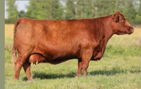
RED MAR MAC LADY TROOPER 114Z Femininity, Fertility and Performance all in one our Donor Female working at Mar Mac Farms