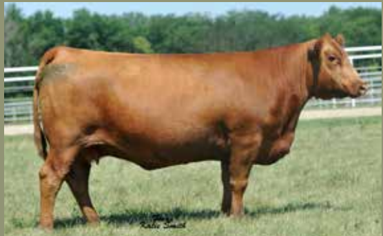
anth days with provide the

Our cattle have made a mark in many programs and we are so proud of what they have accomplished, here is a sample of cattle that work!