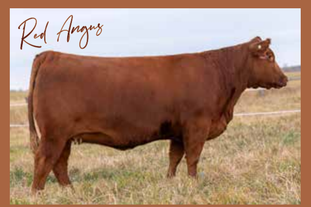
Red Mar Mac Reba 23L High Selling Red Angus Bred Heifer at Manitoba Magic 2024 to JAS Red Angus