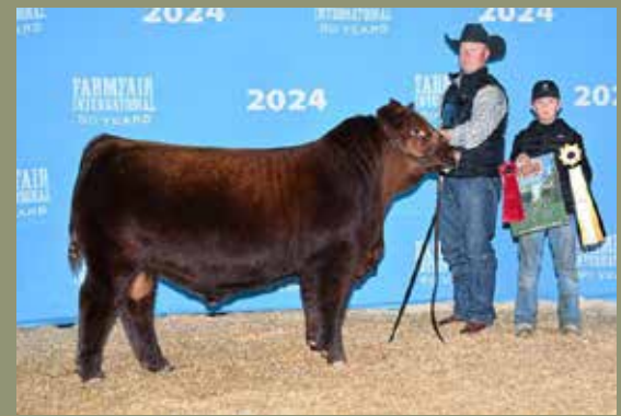
RED MAR MAC MS YOUNG 1K'S CALF A Lincoln daughter that her first calf, Red Wilbar Stronghold was Bull Calf Champion at Agribition and Farm Fair owned by Wilbar Cattle Co.