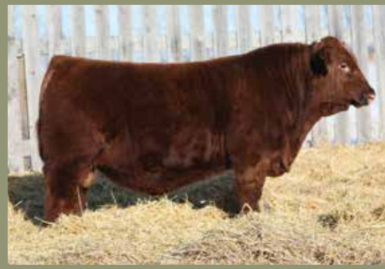
RED MAR MAC POWERPLAY 168H Producing a strong set of females at Allison Farms