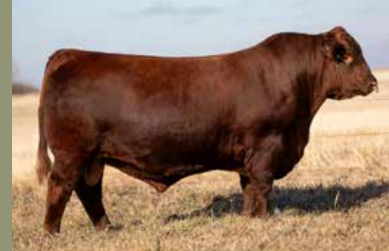
RED MAR MAC DM LANDMARK 10K Champion Bull at Ag Ex 2024, a powerful Lincoln son working at Double F Cattle Co.