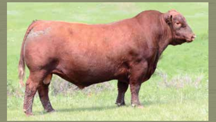
RED MAR MAC LINCOLN 106H - 2141405 - KOF 106H

RED MOOSE CREEK RIPZONE - 1943154 - CDI 89D