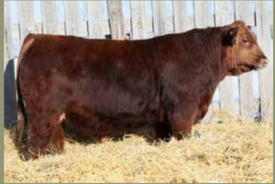
RED MAR MAC TROOPER 39G A Lady Trooper son leaving amazing set of daughters and sons for Lauron Red Angus