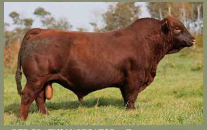
RED BLAIR'S NAVIGATOR 37E - 2016094 - BBC 37E