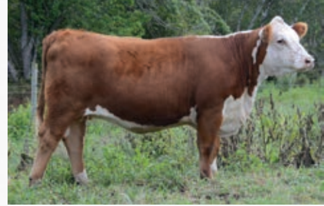
OLTN 6H | DAUGHTER OF 13A