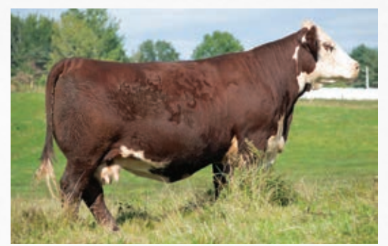
CARTER'S 167U ANDREA 312A | DAM OF 1L

One of the first H The Profit heifers to sell in the Maritimes! This heifer has the size and capacity to grow into what we think will be an outstanding female with numbers to back her up. Her dam has produced some very good females we are using on the farm. Her maternal sister has been shown all summer and been very competitive. If you are looking for a heifer to take around next summer and one who will add size and correctness to her calves, this is the choice for you!!