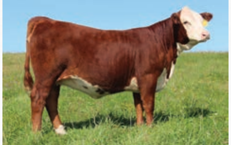
OLTN 3F | DAUGHTER OF 13A