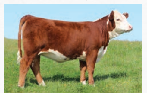
OLTN 1F | DAUGHTER OF 13A

Here are 2 batches of 3 embroys out of the popular Haroldson's JVJ Royal 24E and OLTN 212X Amazing Grace 13A. Royal speaks for himself and Grace has progeny across Canada. Embryos are stored on farm.